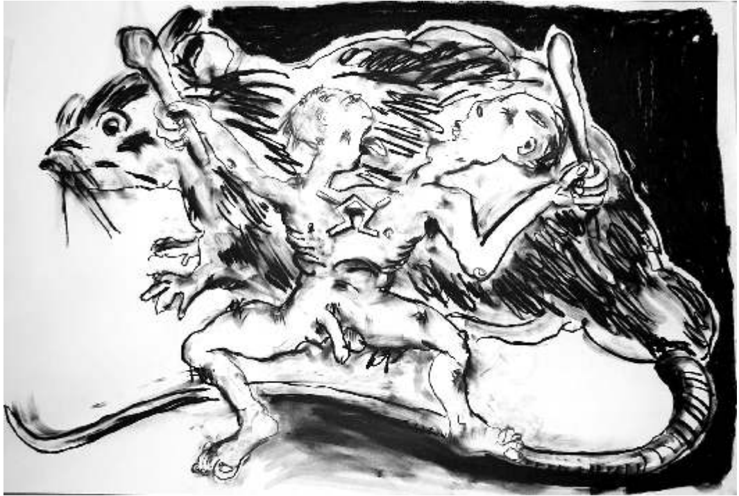
“Abel, Son of War” 40”x60” charcoal on paper 2005