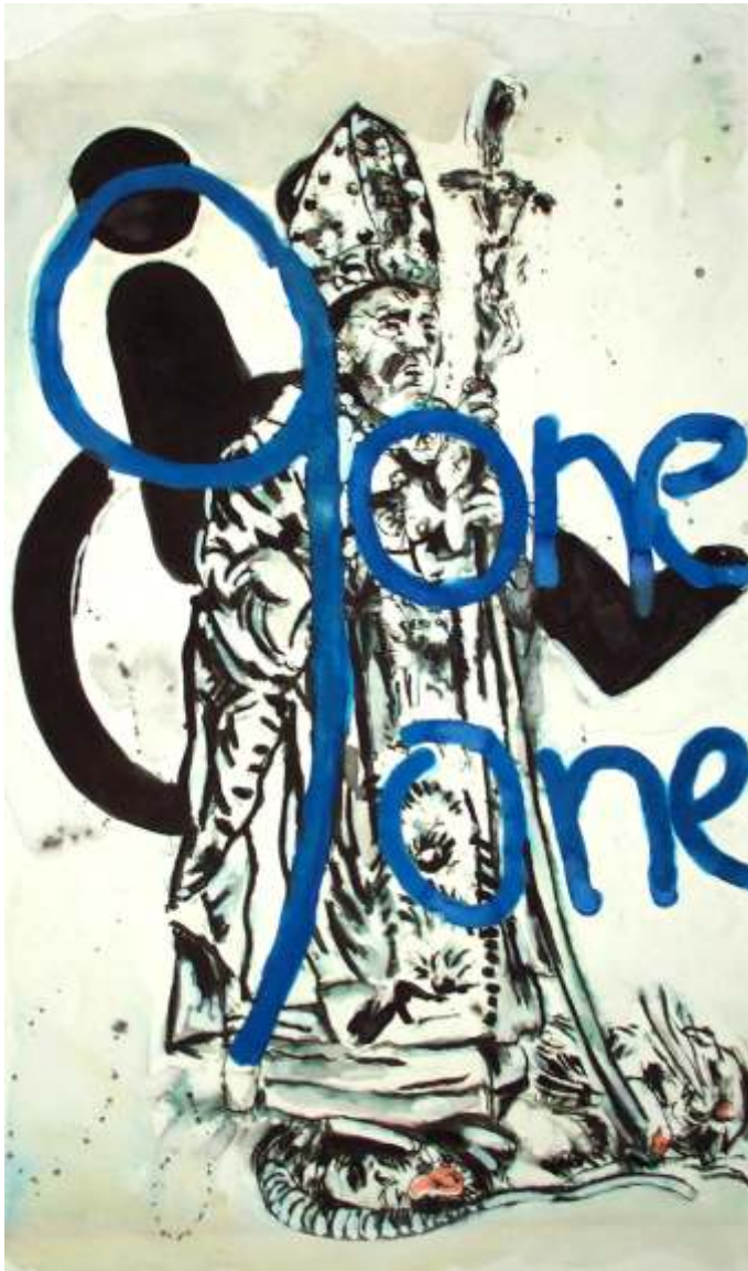
“9 One One” 22” x 13” acrylic on paper 2006