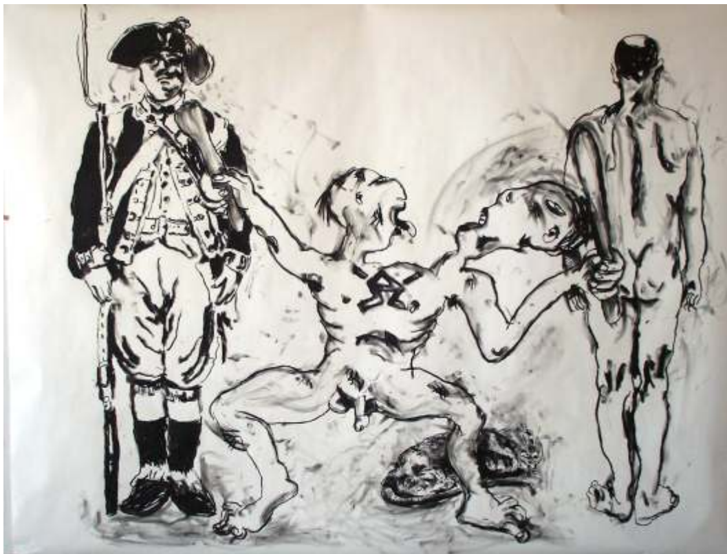
"Abel of War" 80"x107" charcoal on paper/canvas 2005