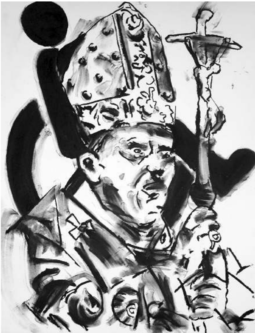
"Icon #5 30"x 22" charcoal on paper 2006