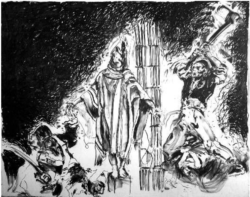
“Abu Ghraib, The New World Order” 108” x 144” charcoal on canvas 2006