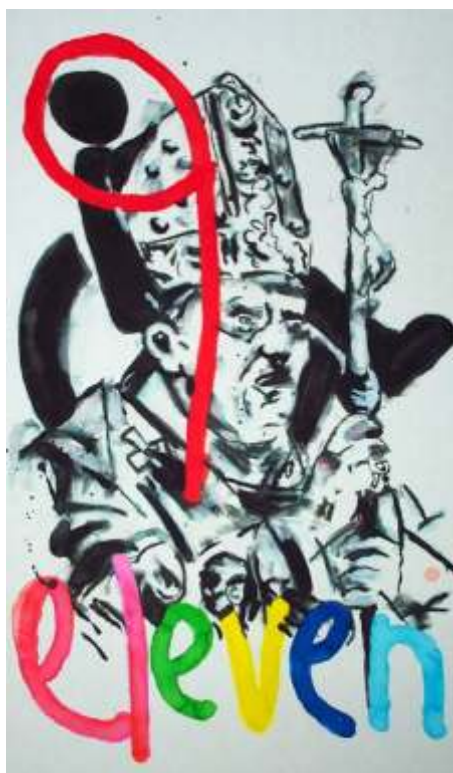
“9 Eleven” acrylic on paper 22” x 13” 2006