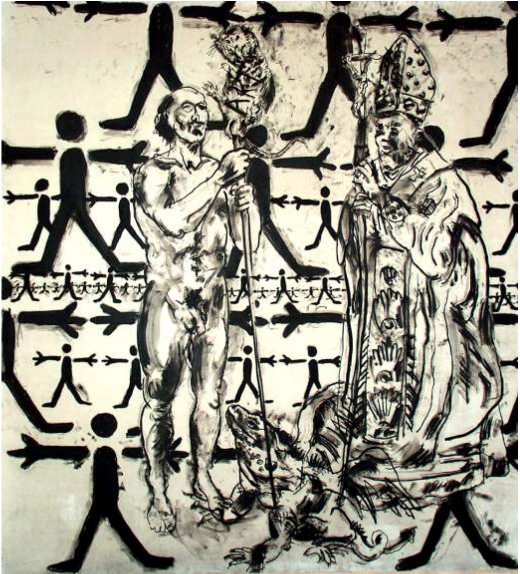
"Dragon Slayer" 107" x 98" charcoal on paper/canvas 2006