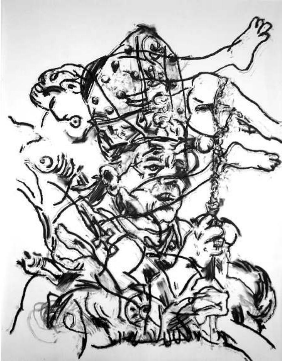
“Pope Overlay” 107” x 72” charcoal on paper/canvas 2006