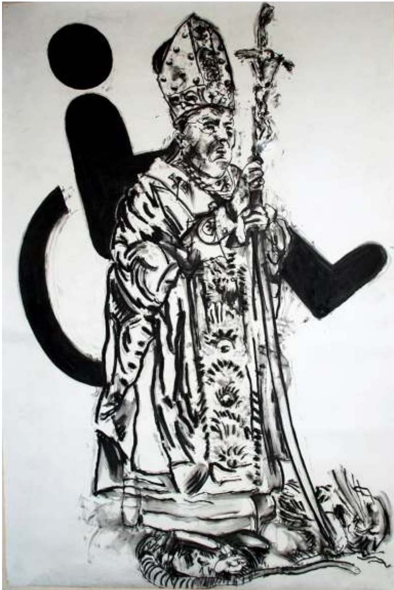
“Ratzlayer” 107” x 62” charcoal on paper/canvas 2006