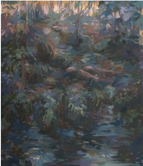
Wilderness Tips #2 - 2012