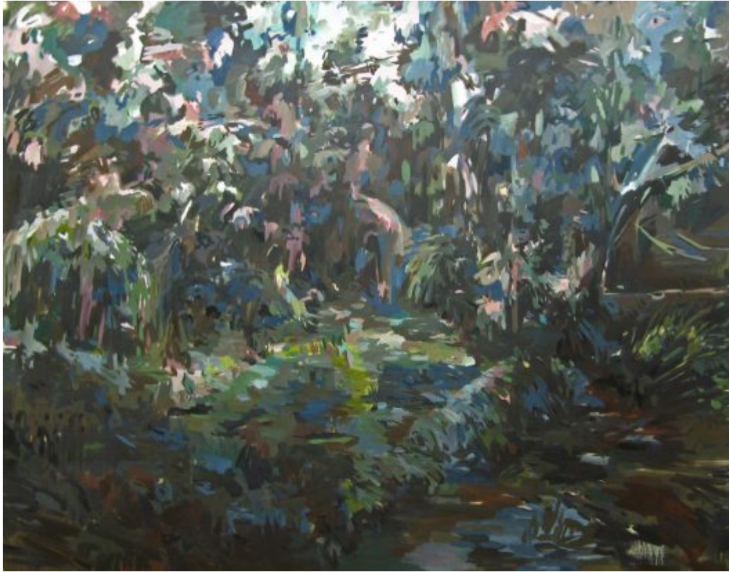
Total Stranger - 2012, Acrylic and oil on canvas, 44 x 54 inches