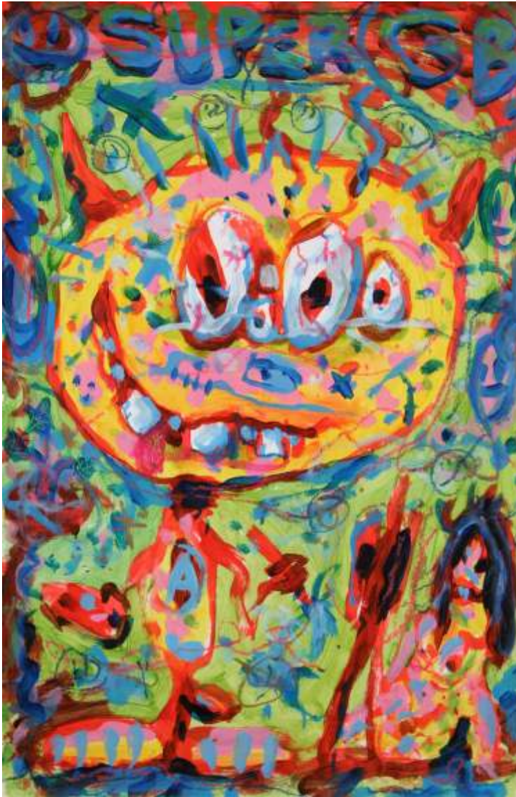
Super G.B. acrylic on paper 40 x 26 in 2000