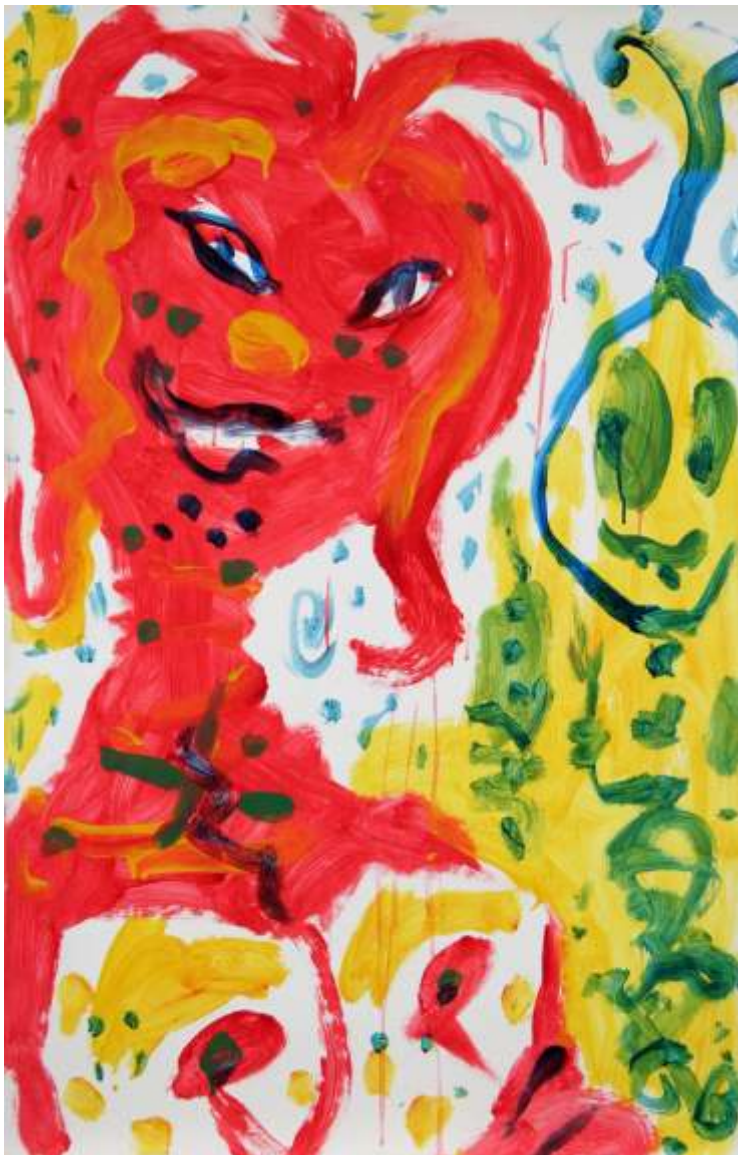
Rouge acrylic on paper 40 x 26 in 2005