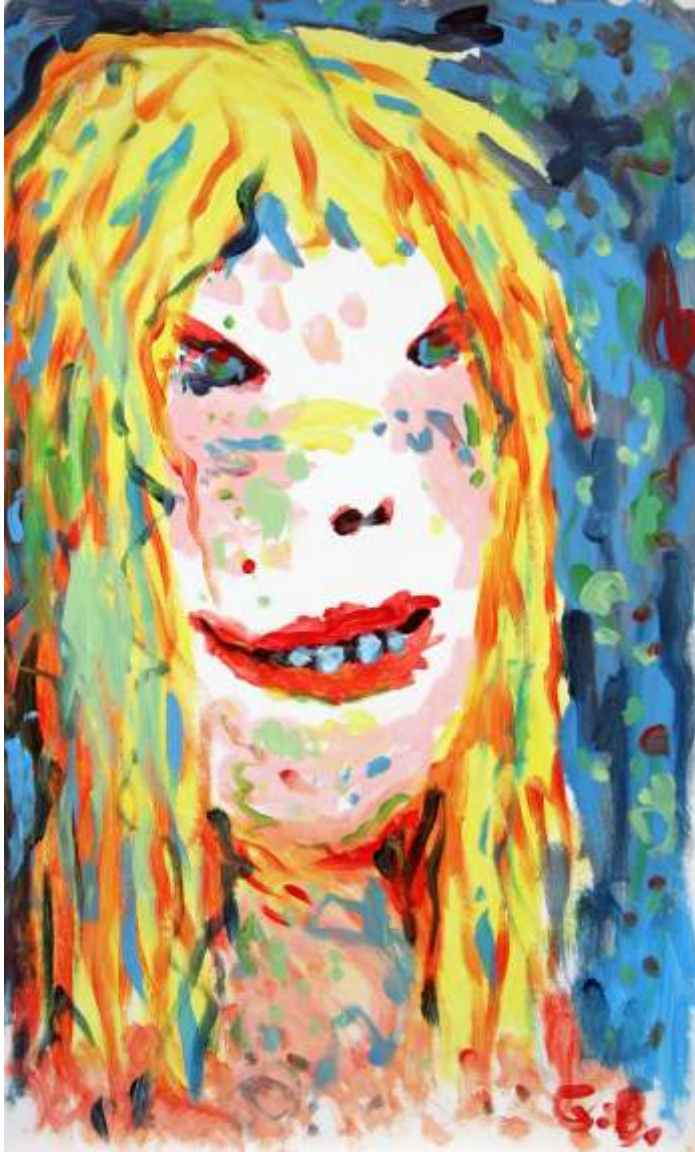
Model acrylic on paper 40 x 26 in 2002