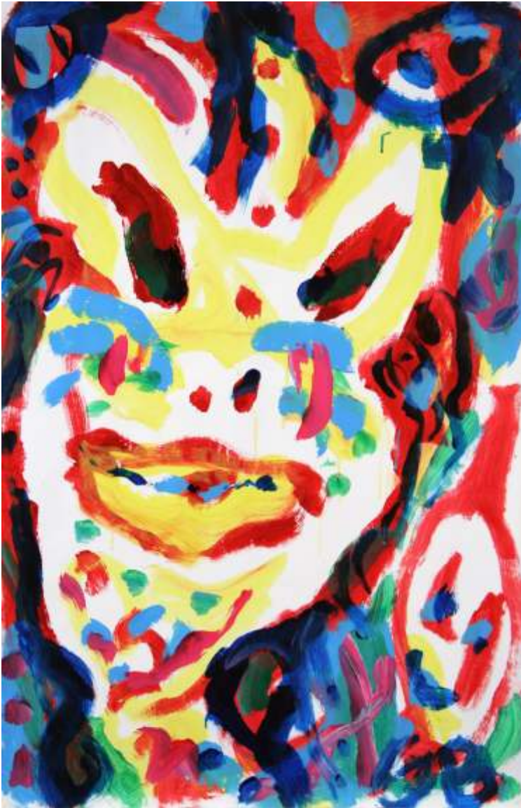
Painter and Model II acrylic on paper 40 x 26 in 2003