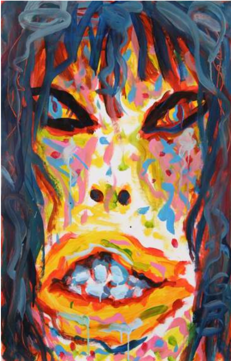
Regard acrylic on paper 40 x 26 in 2001