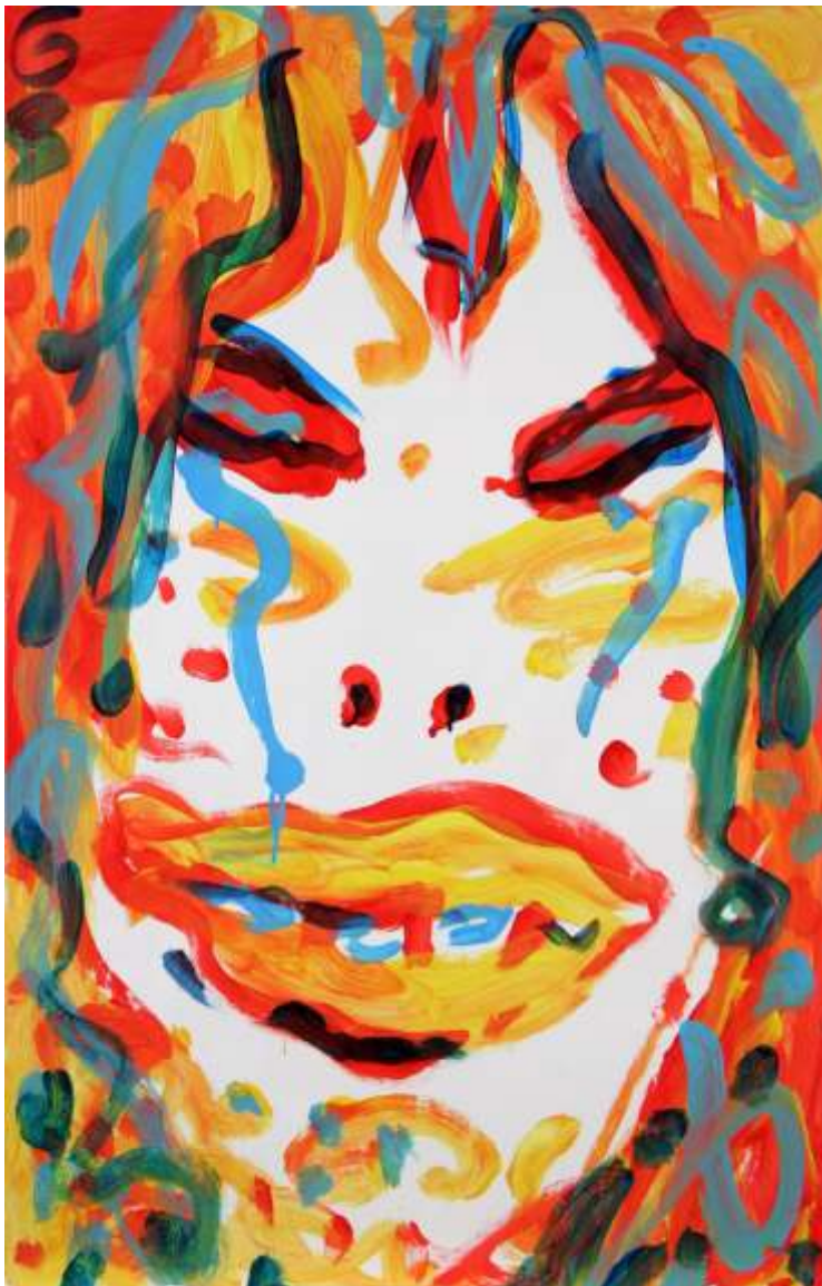
Model II acrylic on paper 40 x 26 in 2001