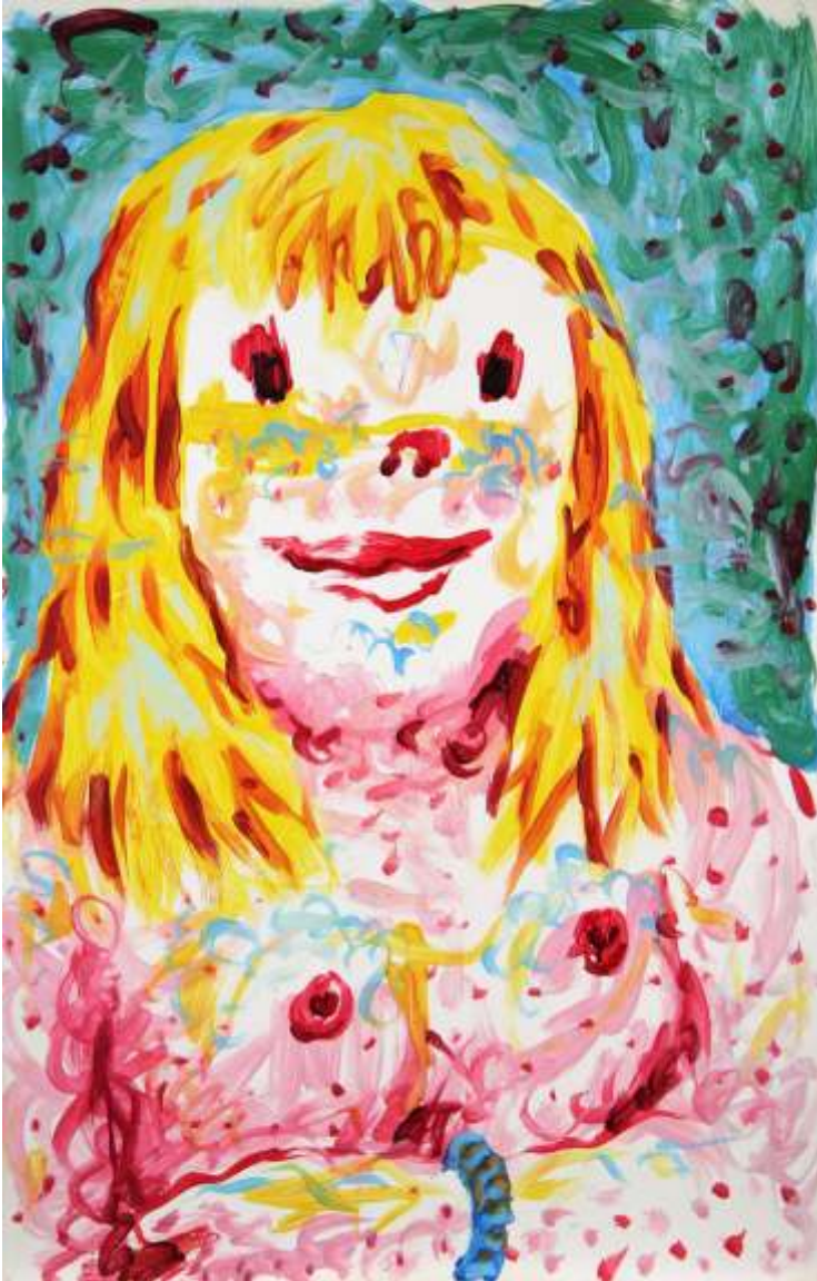
Blonde. acrylic on paper 40 x 26 in 2002