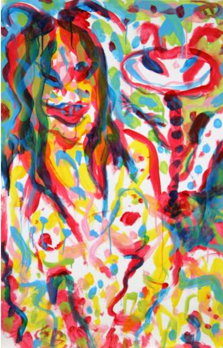
Painter and Model acrylic on paper 40 x 26 in 2003