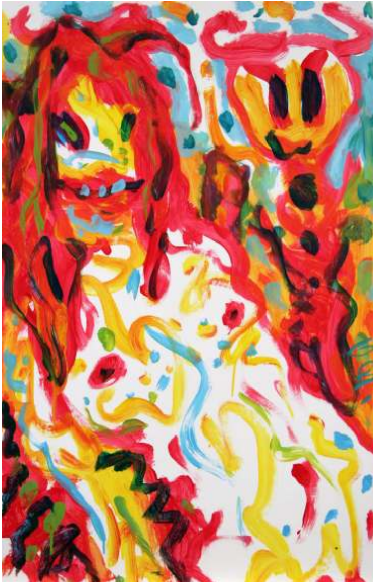
Painter and Model III. acrylic on paper 40 x 26 in 2003