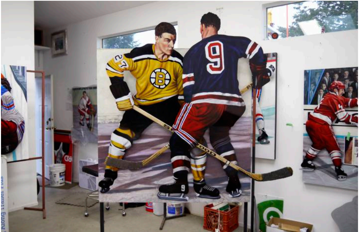
Wackem Sackem in process, Penticton, BC - 2014