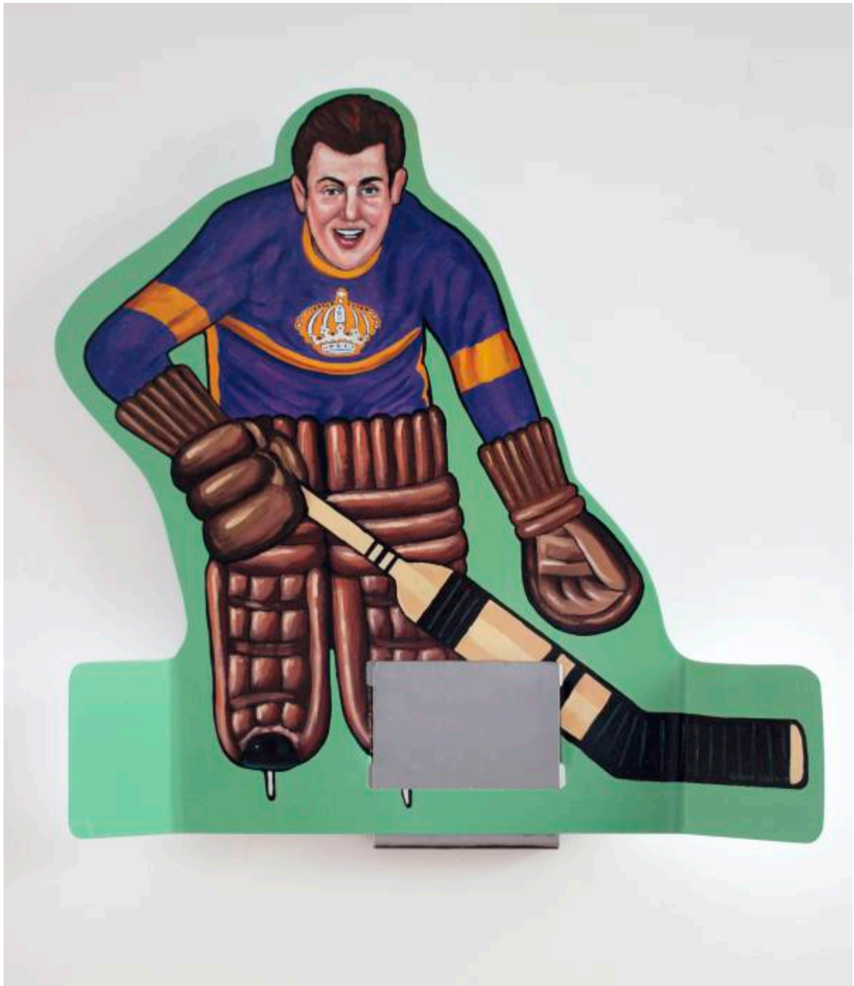
ROGIE - Enamel and metal, 22x21.5x4 inches - 2014