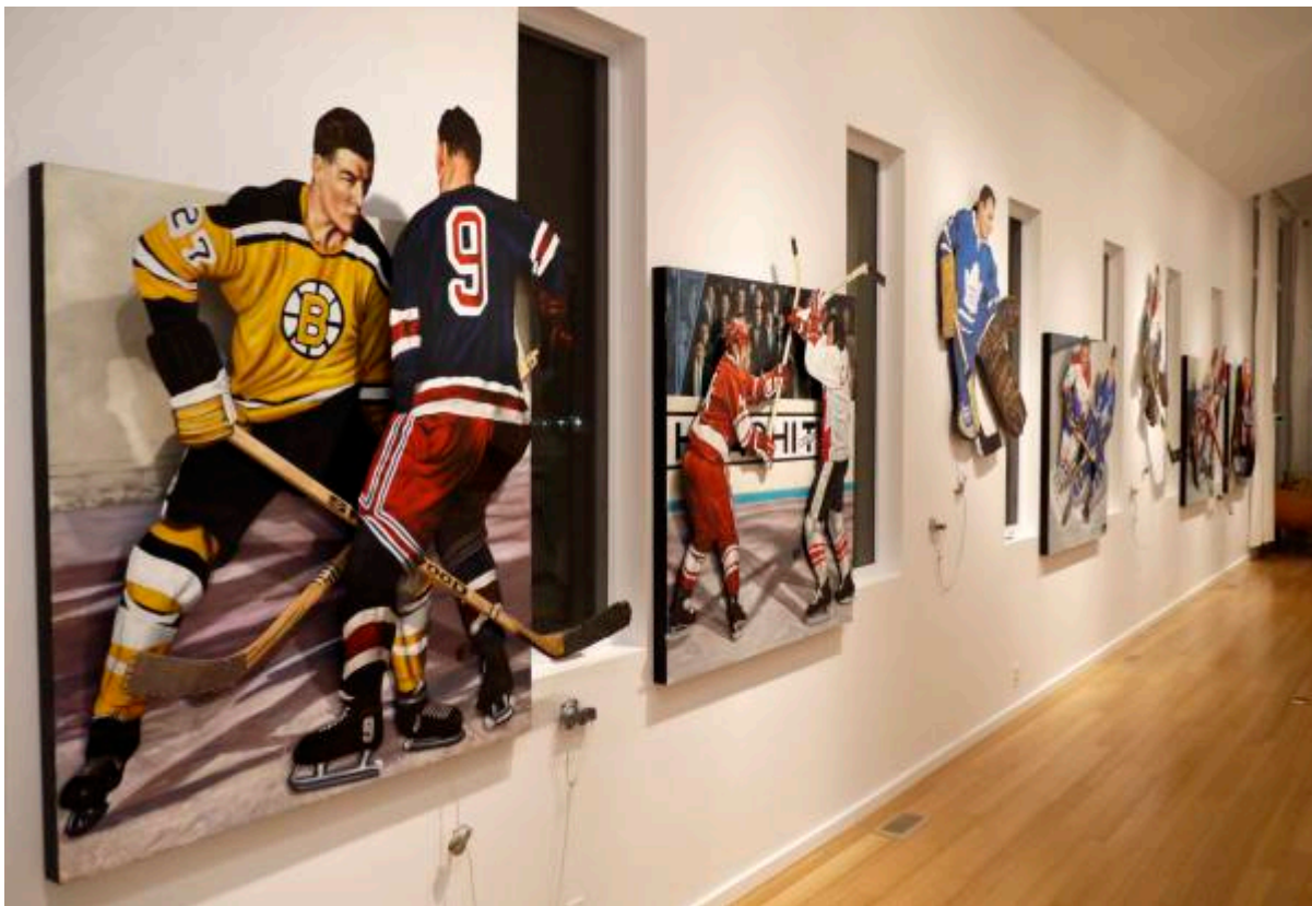
Wackem Sackem exhibition at Headbones Gallery, Vernon, BC - 2014