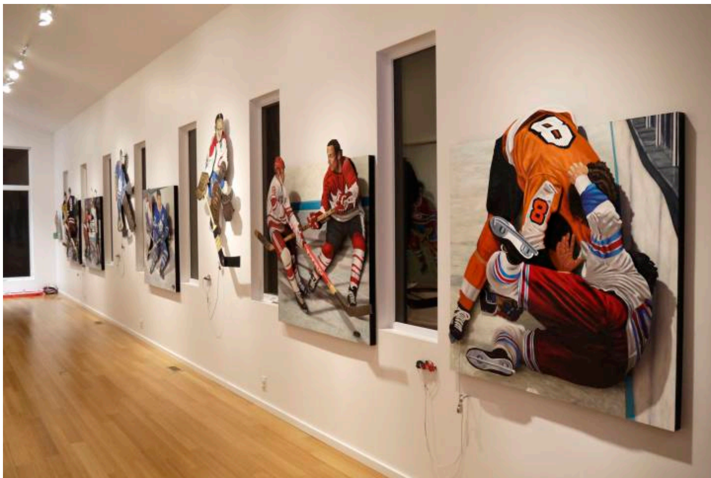
Wackem Sackem exhibition at Headbones Gallery, Vernon, BC - 2014