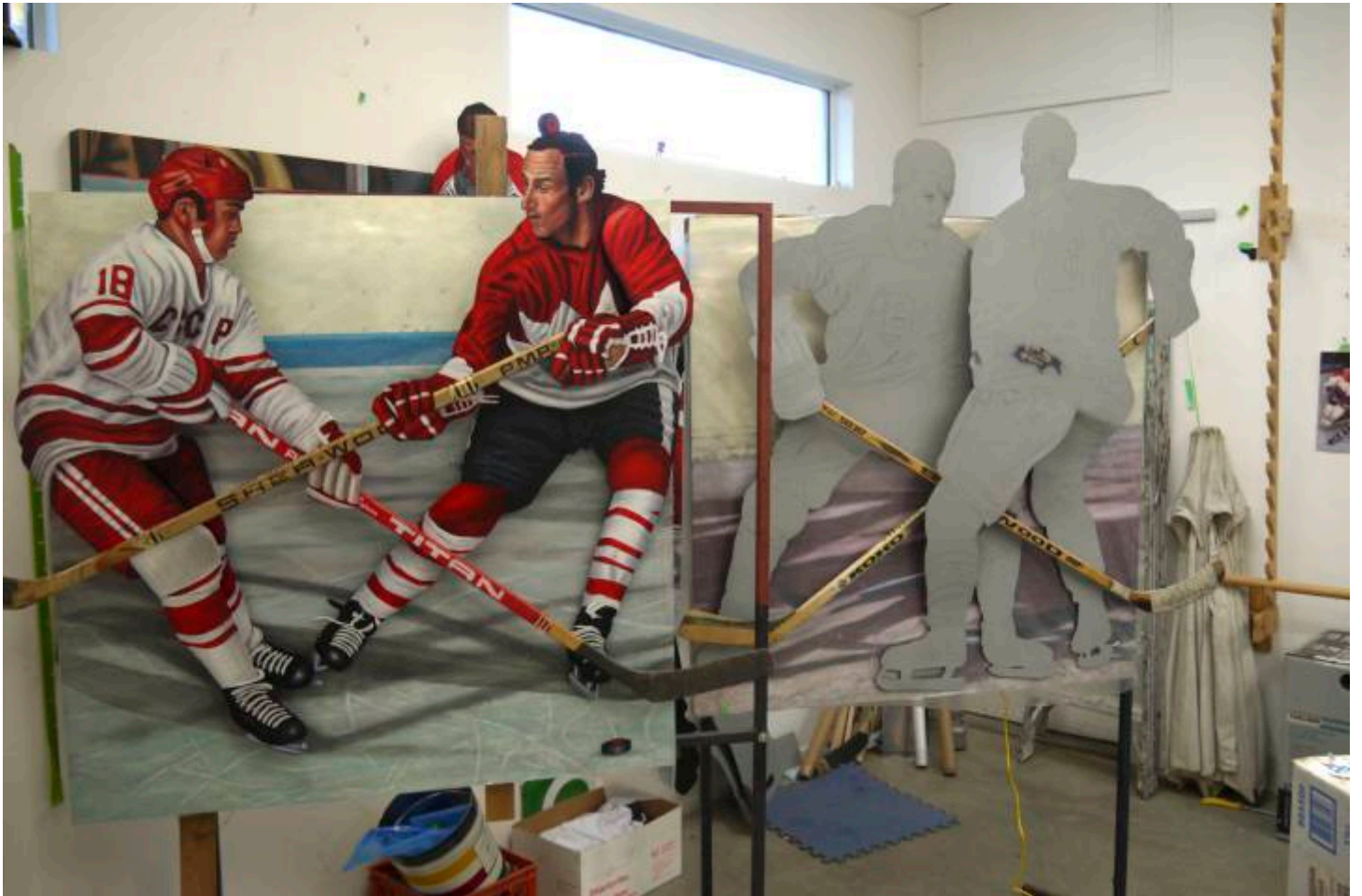
Wackem Sackem in process, Penticton, BC - 2014