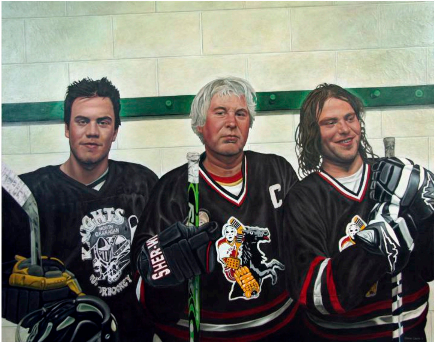
KNIGHTS - Oil and acrylic on canvas, 52x66 inches - 2011