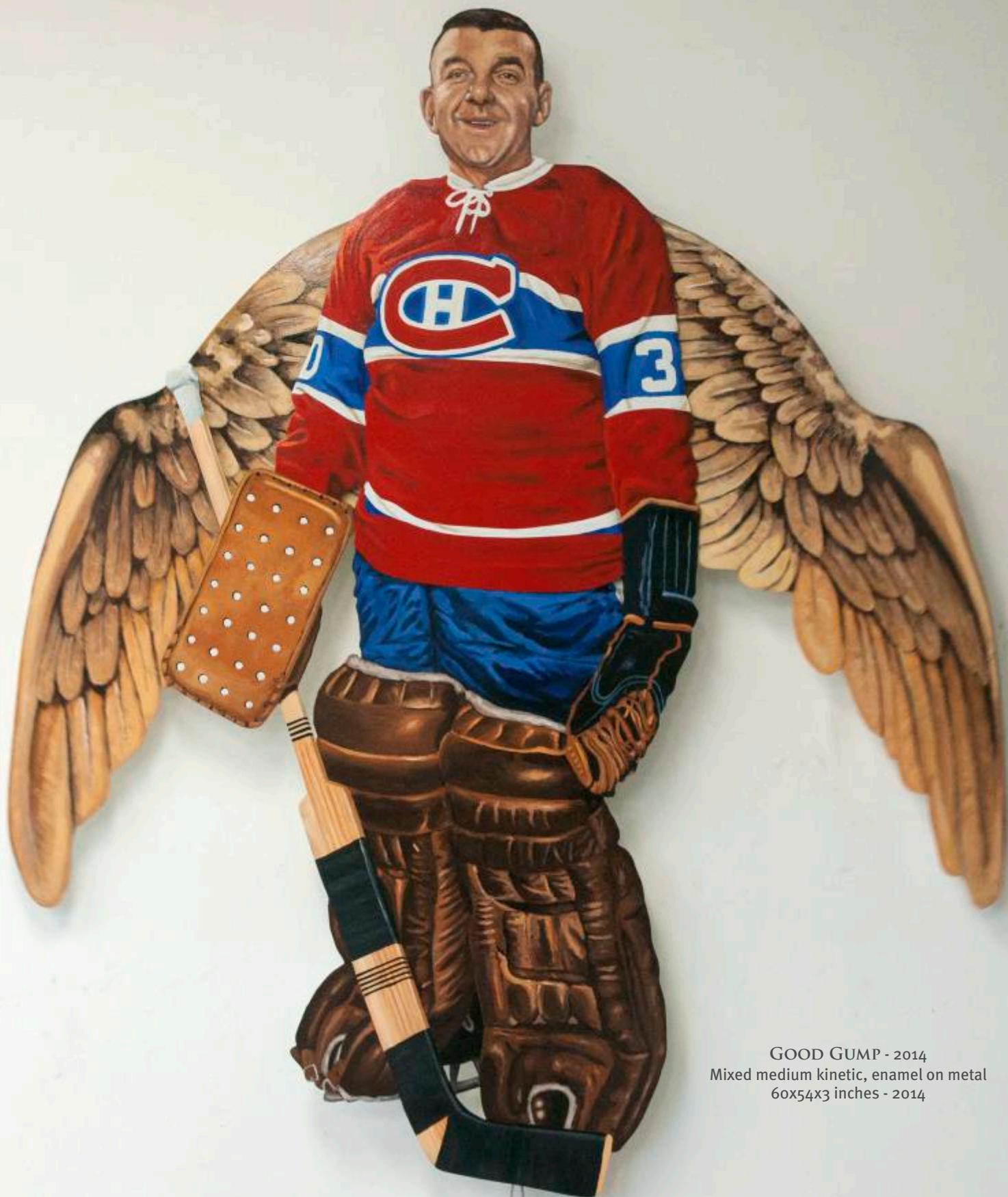
GOOD GUMP - 2014 Mixed medium kinetic, enamel on metal 60x54x3 inches - 2014