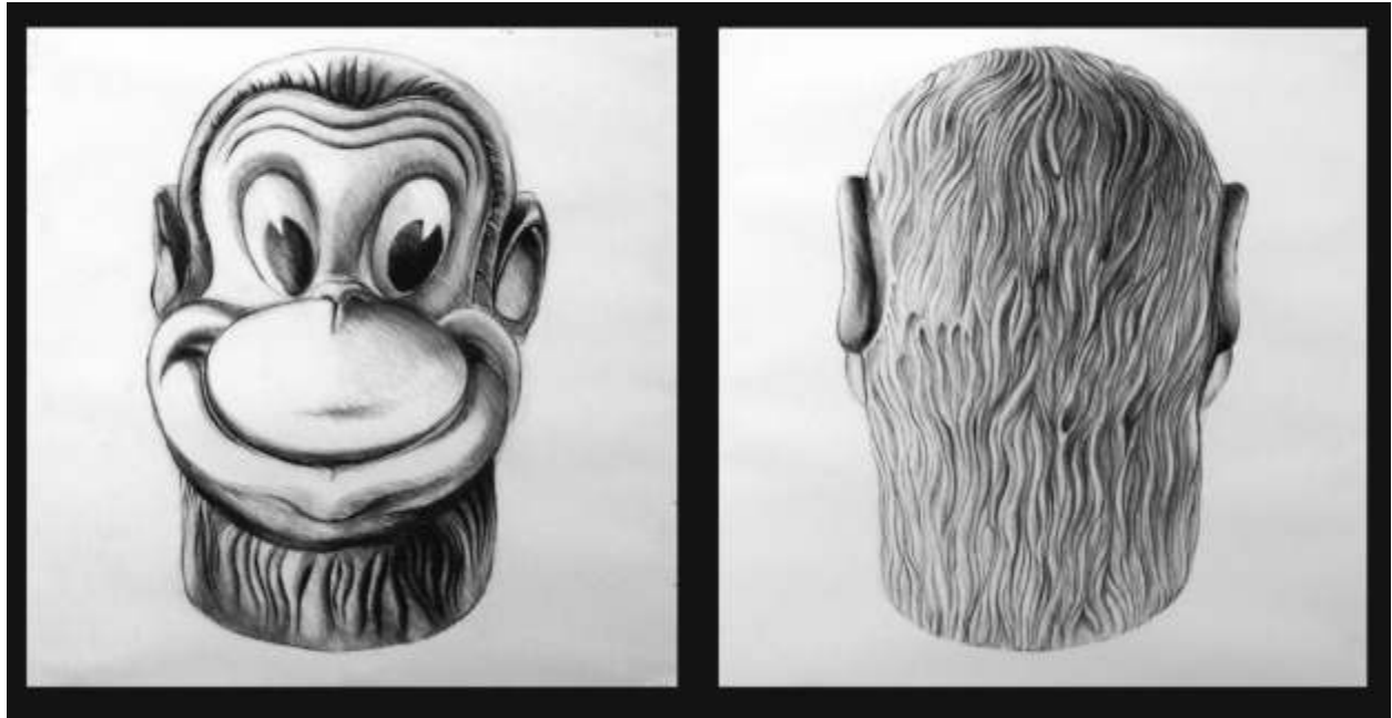
Adrift, detail 1 diptych, charcoal pencil on paper, each 24 x 24 inches 2006