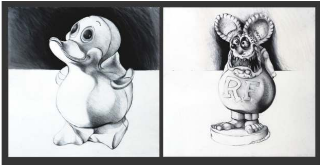
The Absurd and Grotesque - study diptych, charcoal pencil & pastel on paper, each 24 x 24 inches 2006