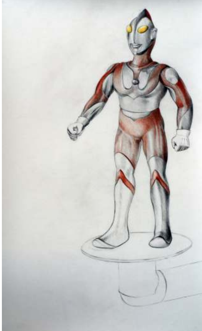
The Great Ultraman - study charcoal and sanguine on paper, each 24 x 24 inches 2007