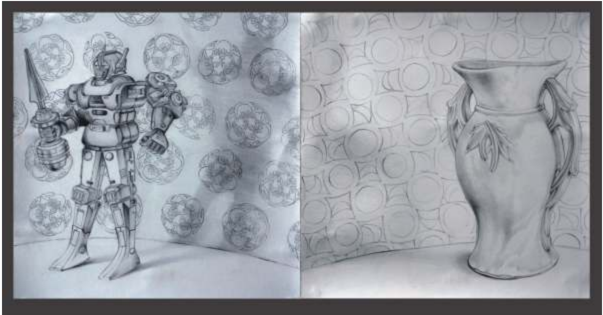
A Duality of Subject Matter - study diptych, graphite on paper, each 16 x 16 inches 2007