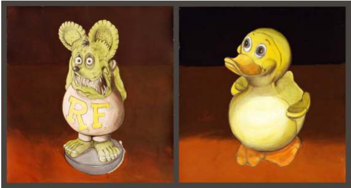
The Absurd and Grotesque - study #2 diptych, charcoal, graphite & gouache on paper, each 14.5 x 13.75 inches 2006