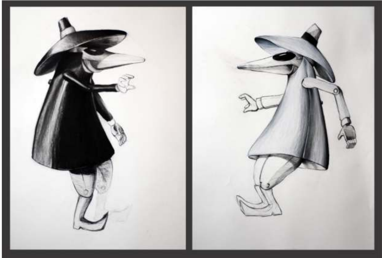
Spy vs. Spy - study charcoal pencil & pastel on paper, each 45 x 36 inches 2005