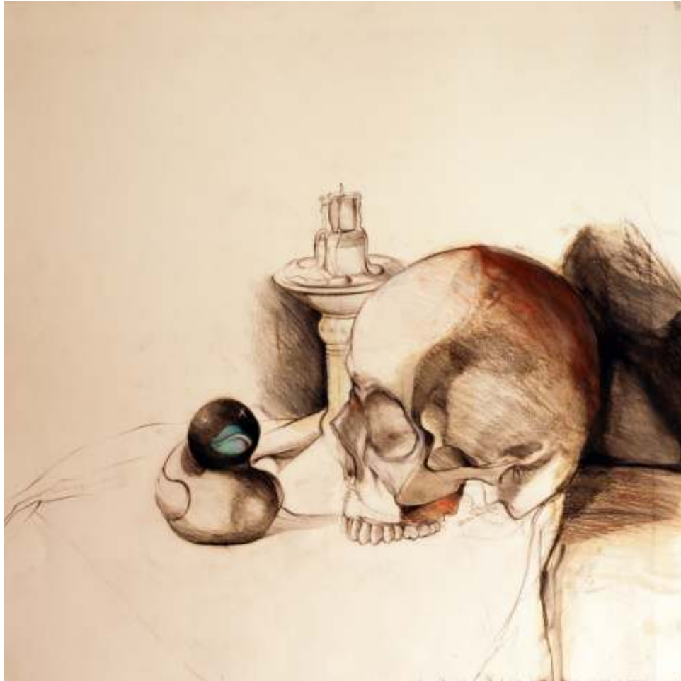
Vanitas - study graphite, pastel, color pencil & gouache on paper, each 24 x 24 inches 2004