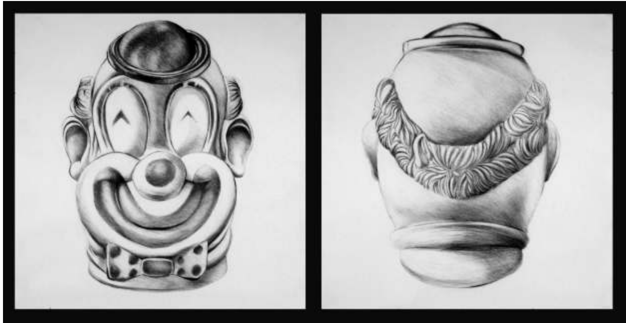
Adrift, detail 2 diptych, charcoal pencil on paper, each 24 x 24 inches 2006