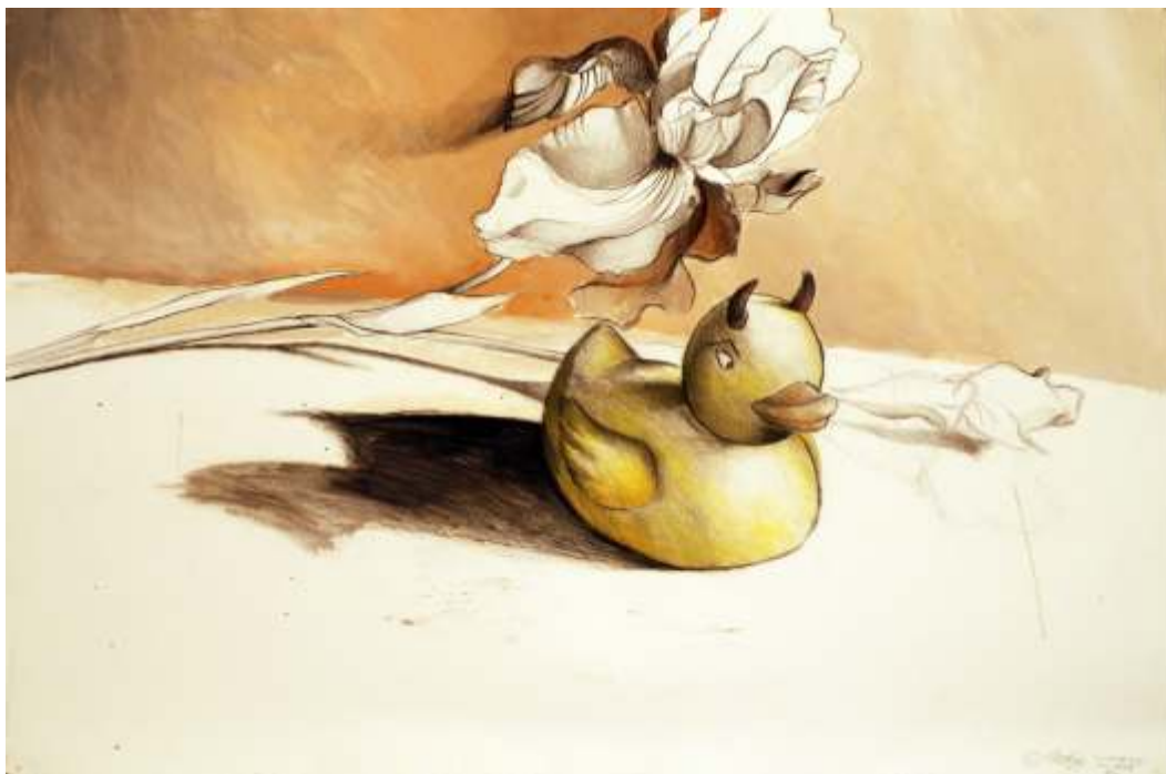
Rosemary's Baby - study graphite, pastel & gouache on paper, each 24 x 36 inches 2004