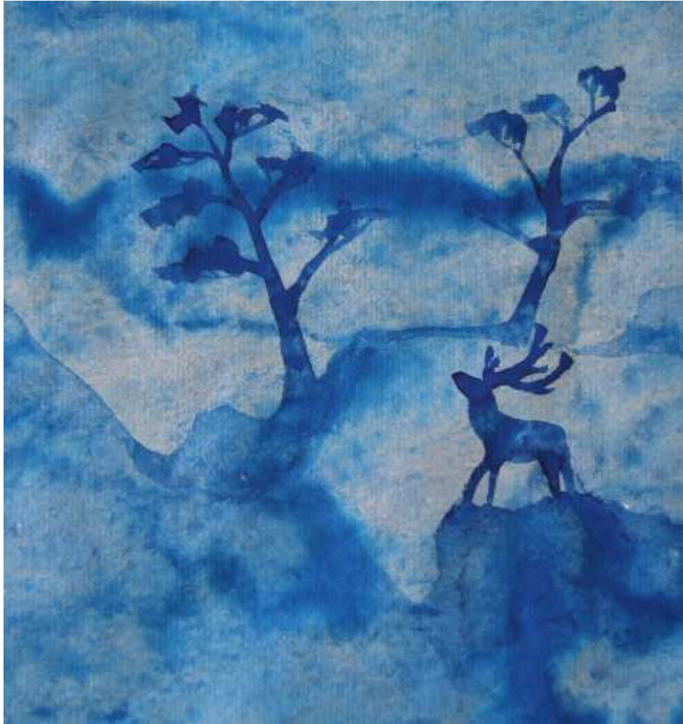
BLUE HORSE DREAMING - 2014 Chinese Ink on treated xuan paper, 25.6" x 33", 65cm x 84cm (with detail)