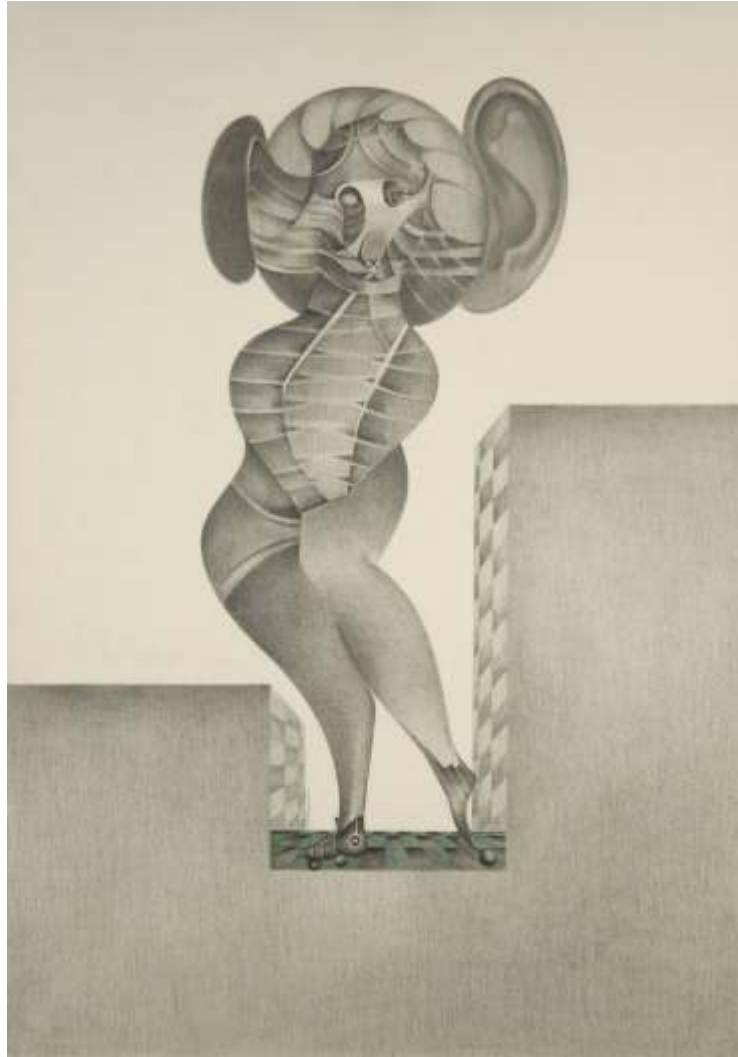
Lady Cat pencil on paper, 100 x 70 cm.