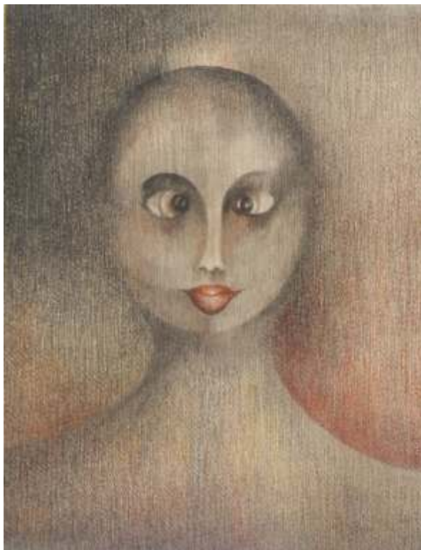
Face 1 coloured pencil on paper, 36 x 25 cm.