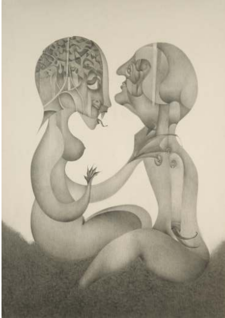
Preying Mantis pencil on paper, 100 x 70 cm.