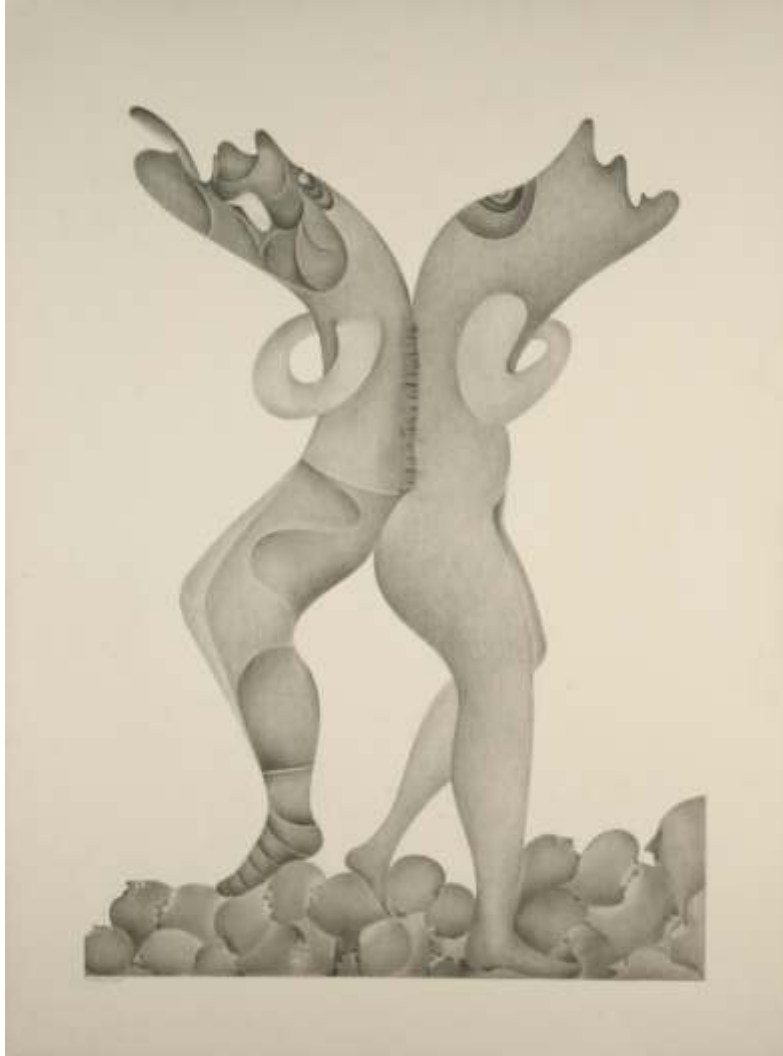
Frenzy pencil on paper, 100 x 70 cm.