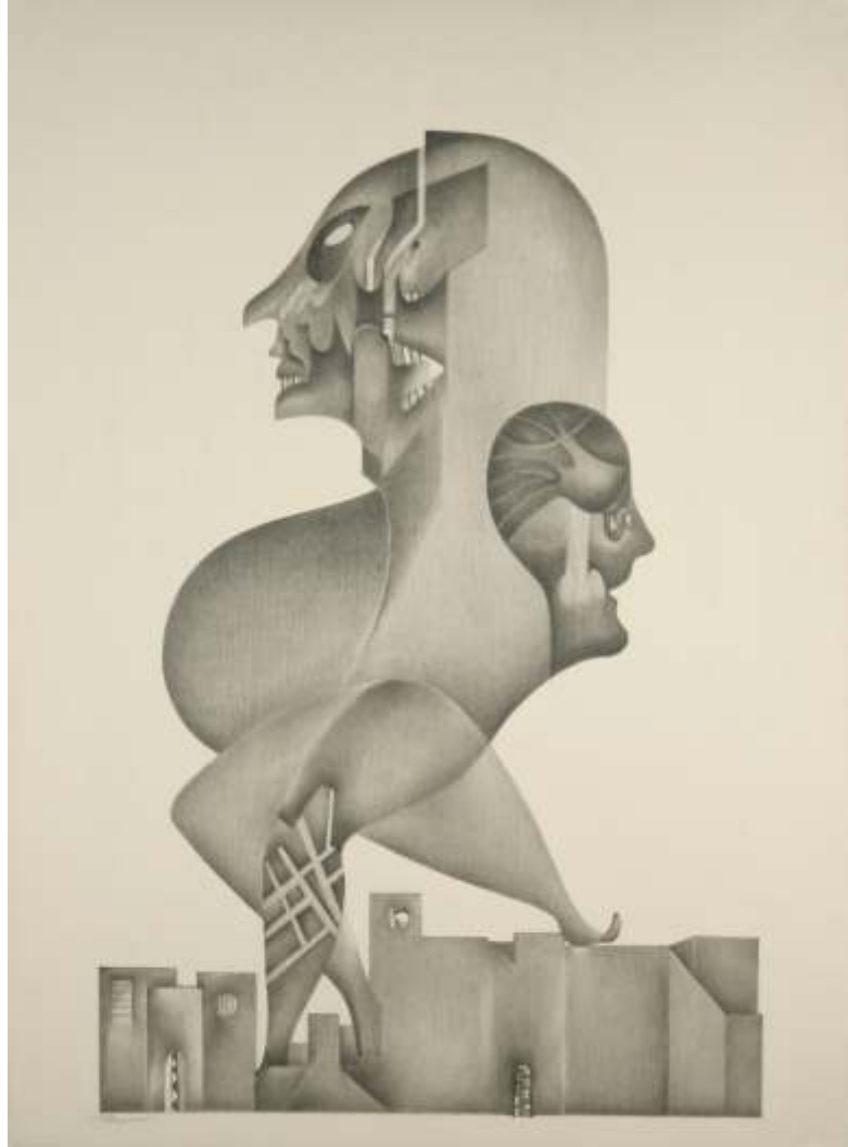
State of Mind pencil on paper, 100 x 70 cm.