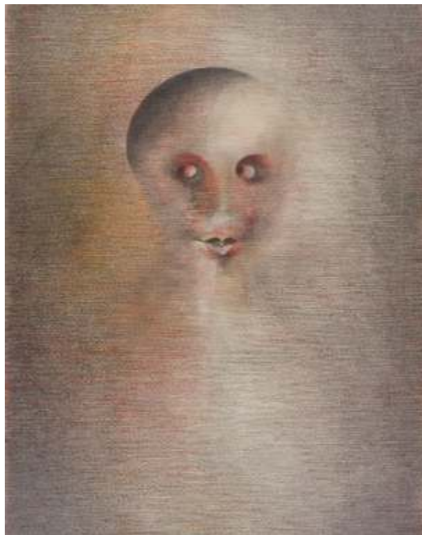
Face 2 coloured pencil on paper, 36 x 25 cm.