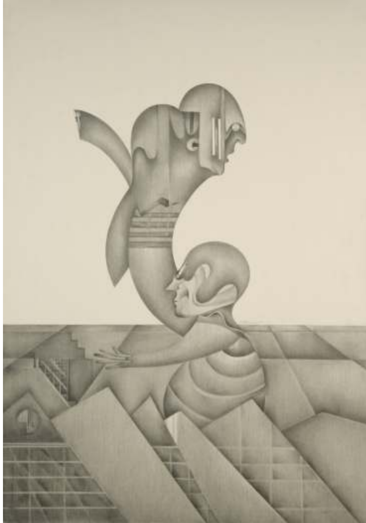
Departure pencil on paper, 100 x 70 cm.