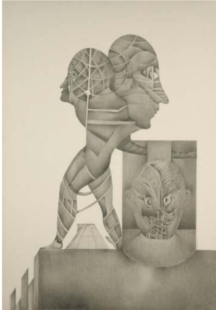
Mask 1 pencil on paper, 100 x 70 cm.