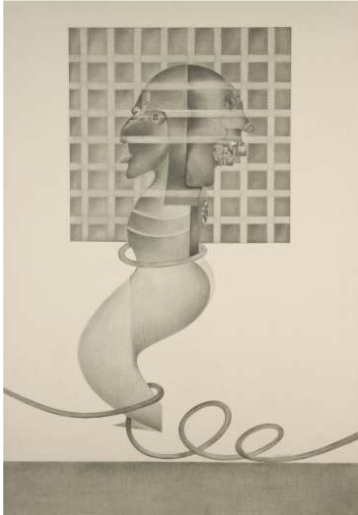
Brainstorm pencil on paper, 100 x 70 cm.