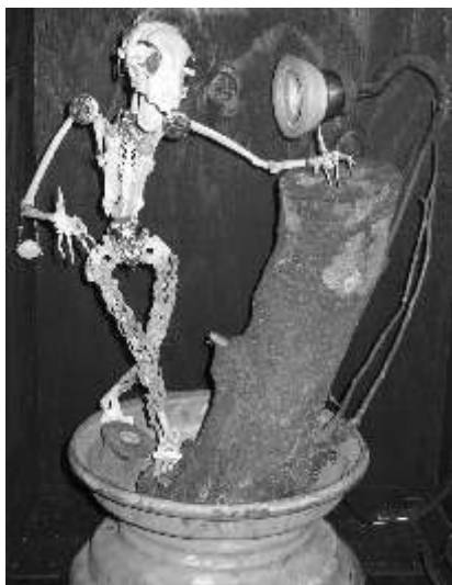
The Courtesan mixed media, found objects, bones 10 x 12 x 17 in 2006