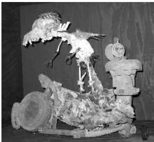
Pre-Historic Hairdoo mixed media, found objects, bones 22 x 10 x 20 in 2006