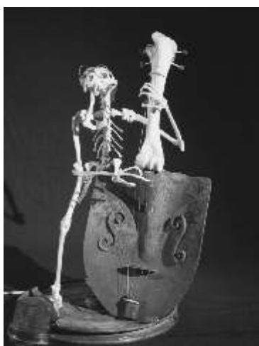
D-Minor mixed media, found objects, bones 18 x 15 x 15 in 2004