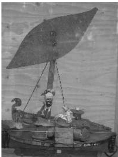
Odyssey and Siren mixed media, found objects, bones 16 x 17 x 22 in 2006