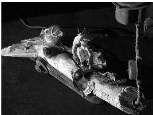
Warrior's Prey mixed media, found objects, bones 6 x 19 x 15 in 2006