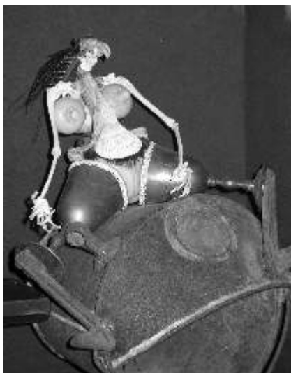
Whore of Babylon mixed media, found objects, bones 16 x 14 x 21 in 2006