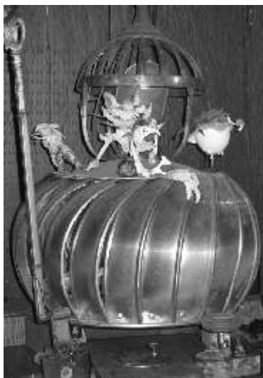
Freak Carousel mixed media, found objects, bones 17 x 18 x 28 in 2006