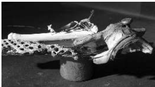
Fifi's Canoe Trip mixed media, found objects, bones 12 x 5 x 5 in 2006