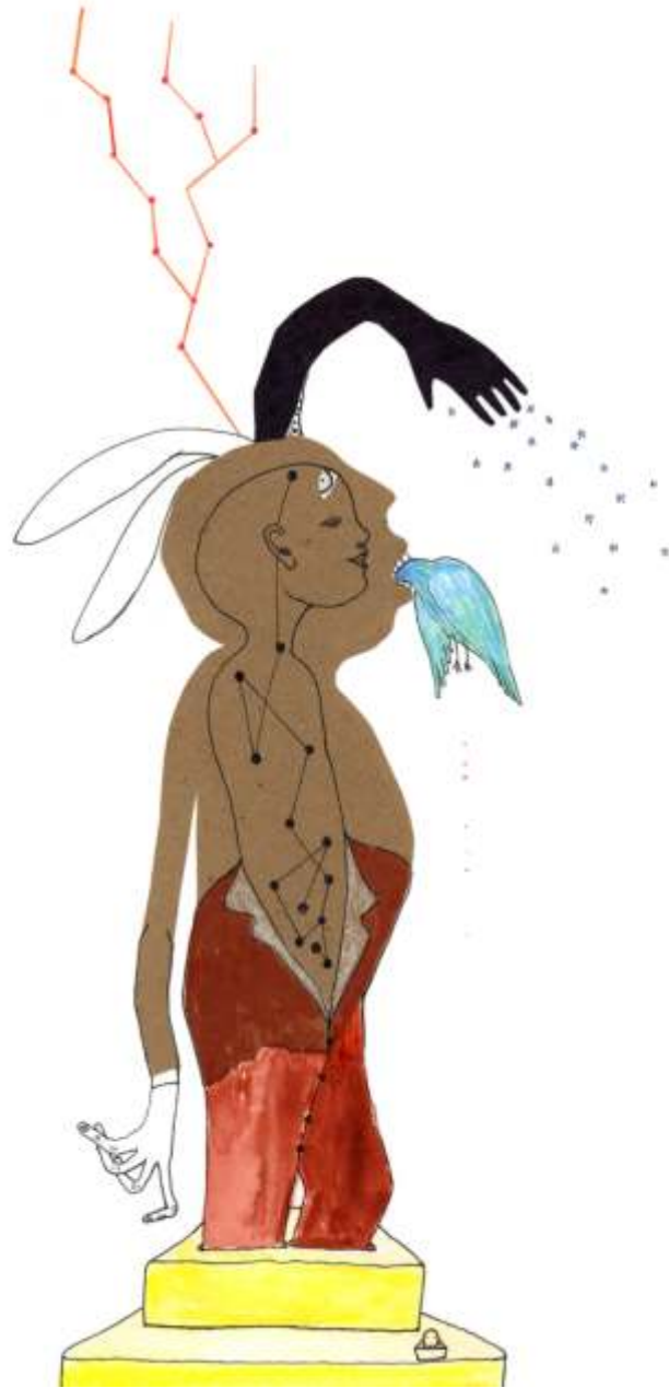
Desired Intruders - 2007 mixed media on paper (11x15 inches)