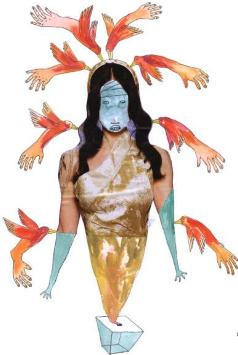
The Idol's Disguise - 2007 mixed media on paper (11x15 inches)