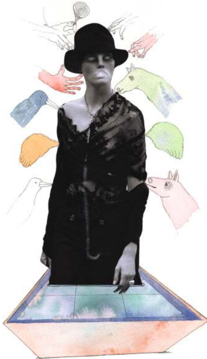
Narcissus' Pets - 2007 mixed media on paper (11x15 inches)