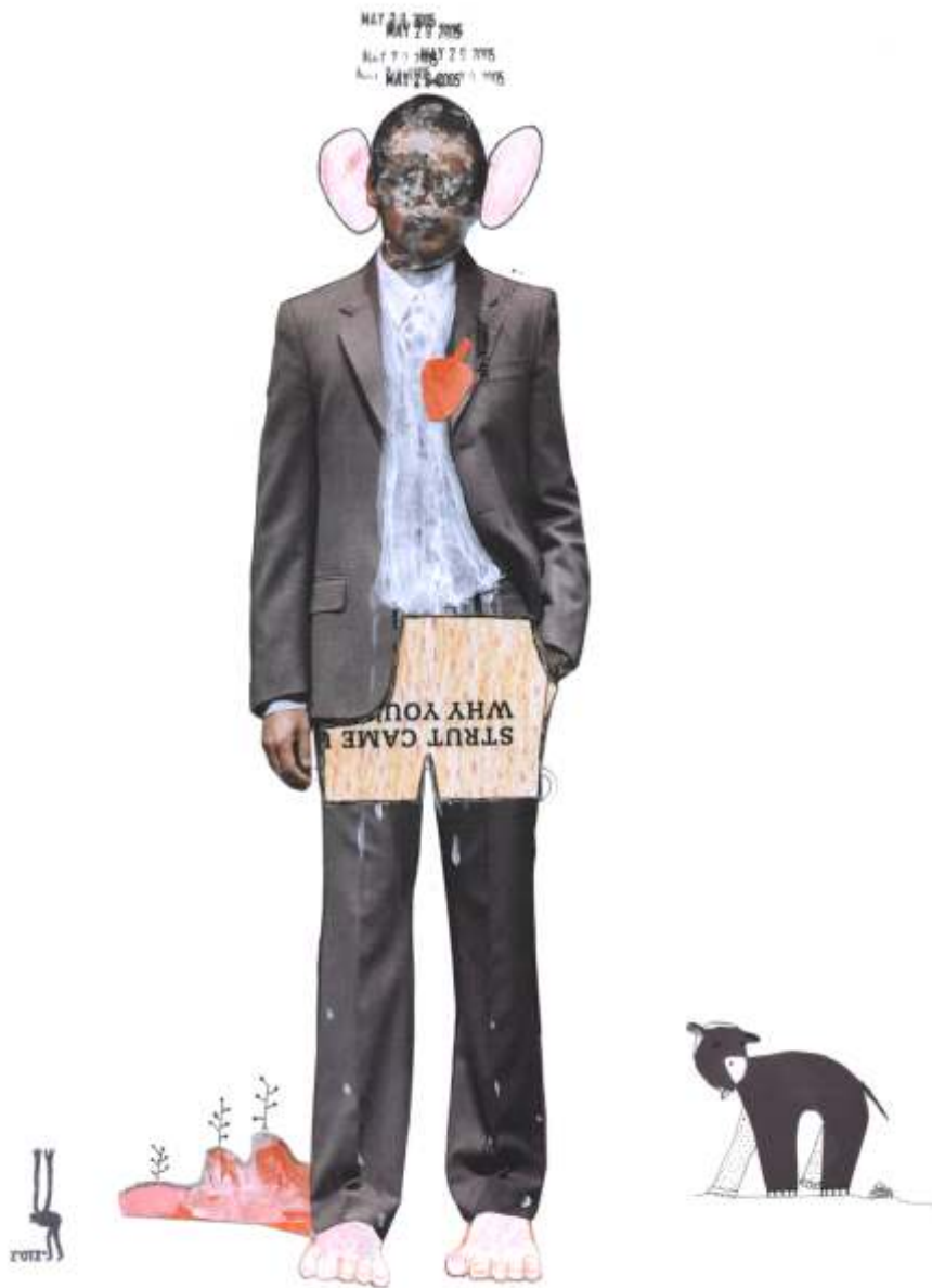
Bureaucrat's Migraine - 2007 mixed media on paper (11x15 inches)