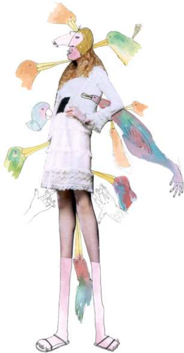
The Versace Parade - 2007 mixed media on paper (11x15 inches)