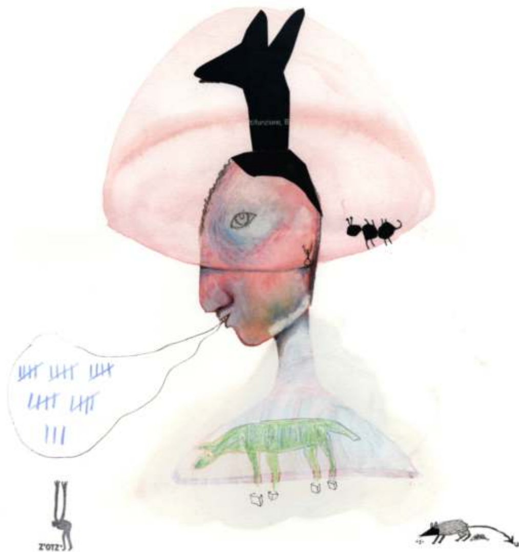
Counting The Days - 2006 mixed media on paper (10x13 inches)