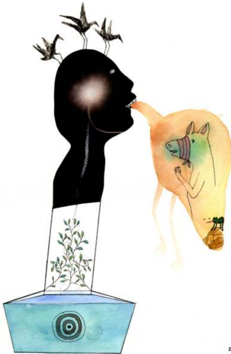
Tales of a Man who Found Eternity - 2007 mixed media on paper (11x15 inches)