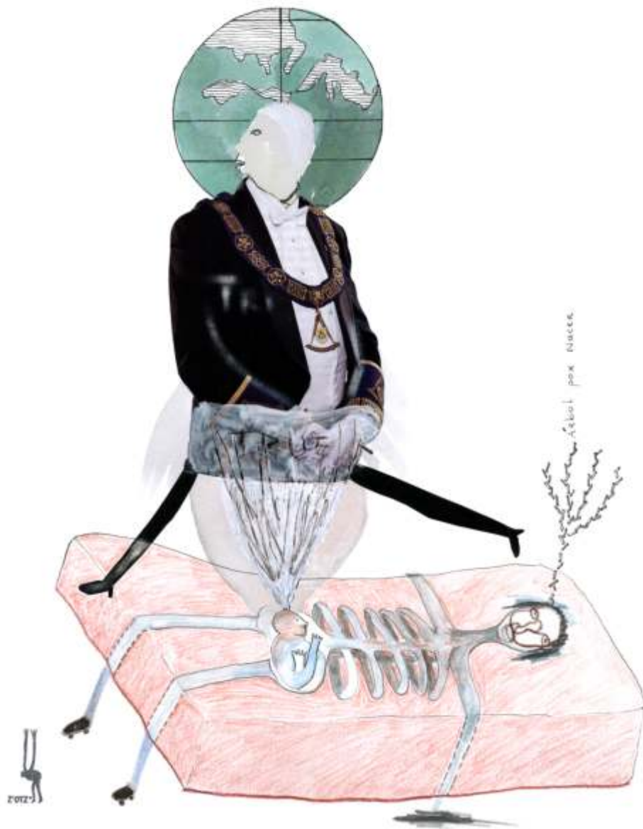
Unborn Tree - 2006 mixed media on paper (11x15 inches)