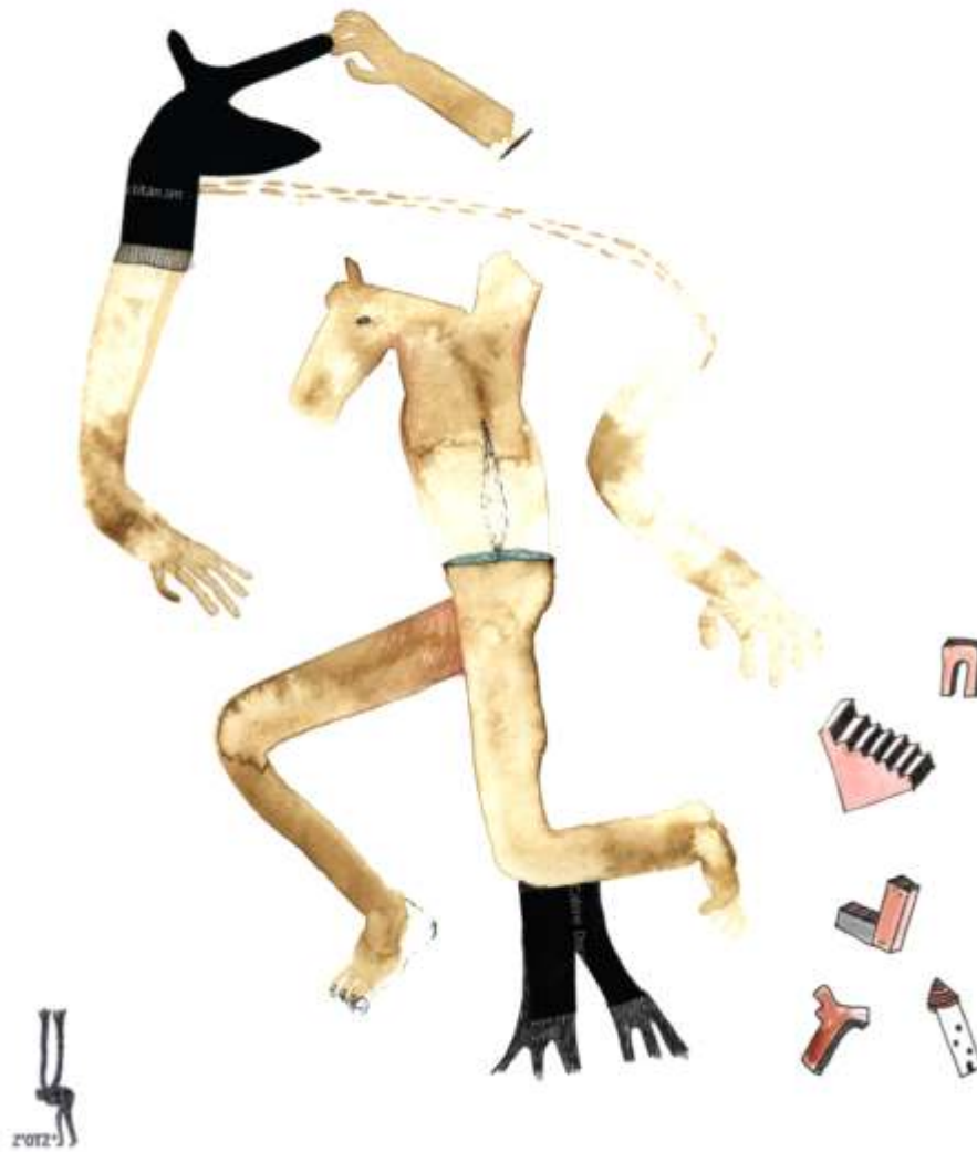
The Architect's Dream - 2006 mixed media on paper (10x13 inches)