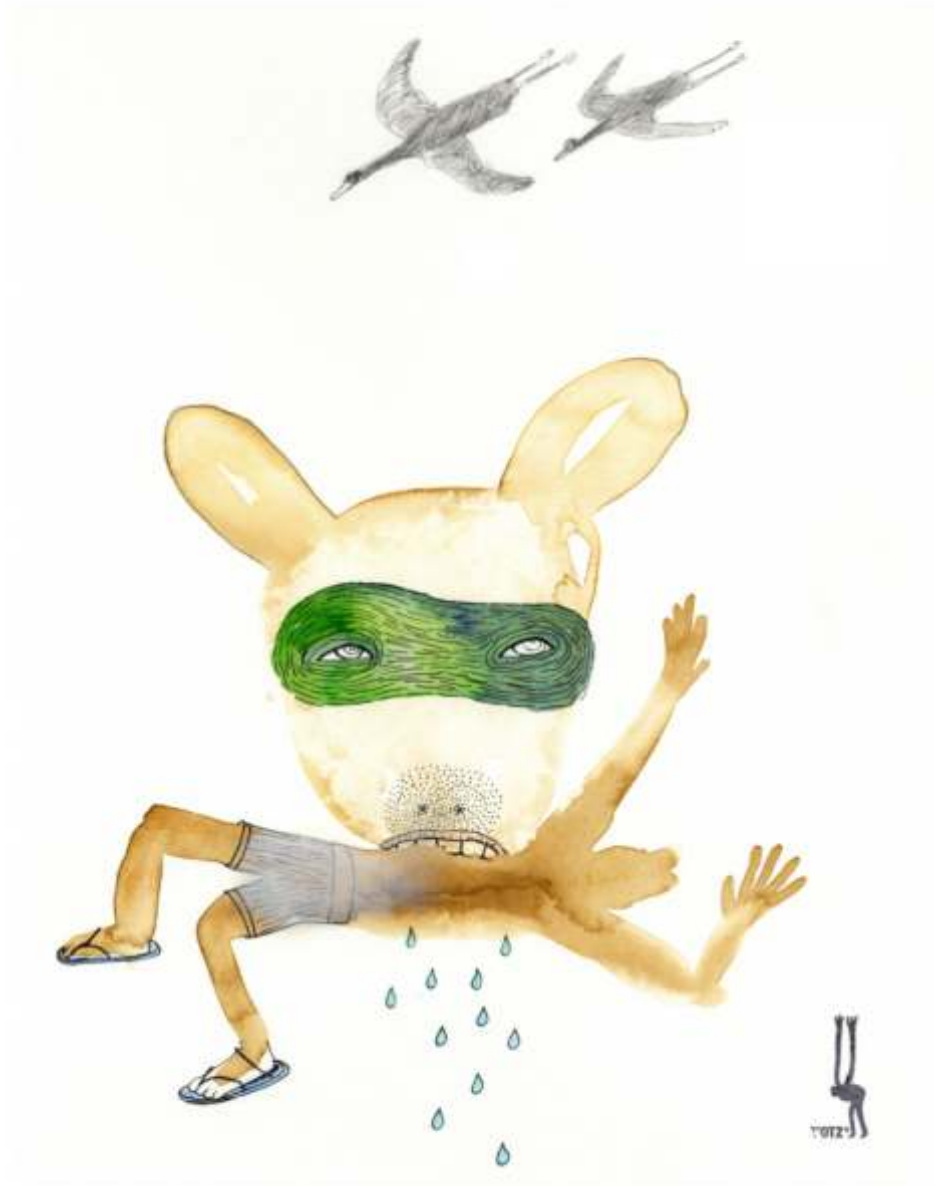
Masked Savage - 2006 mixed media on paper (11x13 inches)