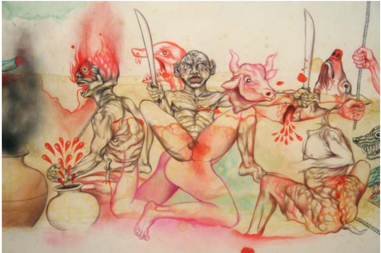
Quetzalcoatl's Children - (detail)