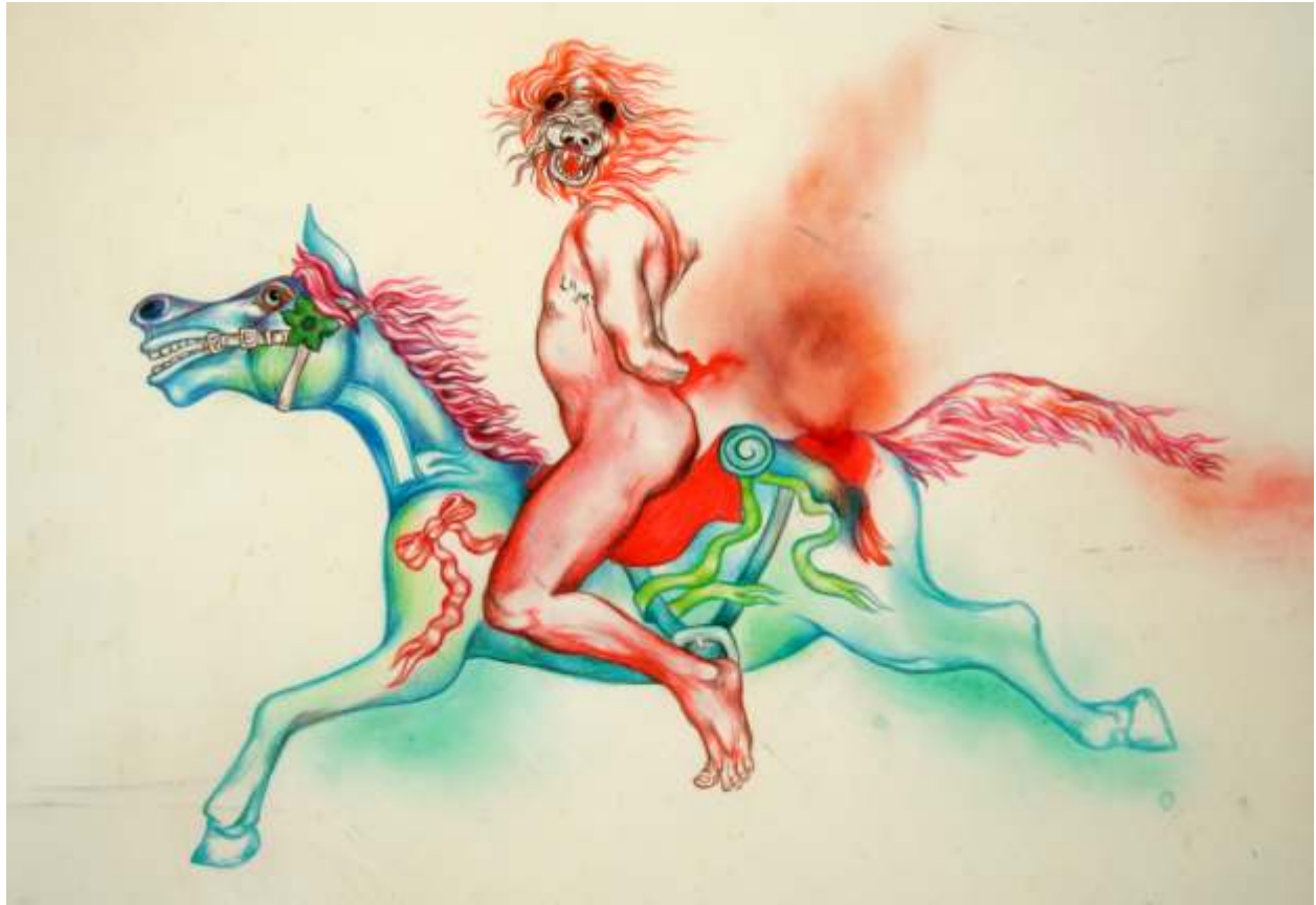
Quetzalcoatl's Children - (detail)