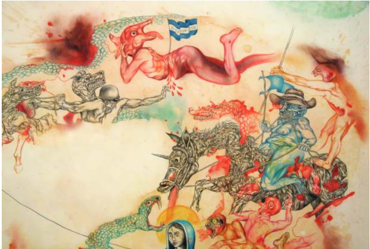
Quetzalcoatl's Children - (detail)