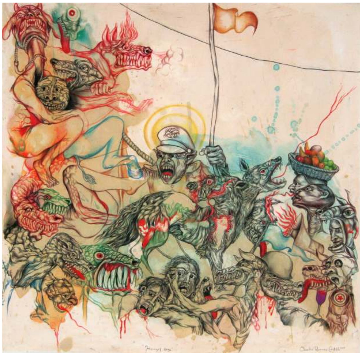
Hungry Dogs - 2007 mixed media on Mylar (16x16.5 inches)