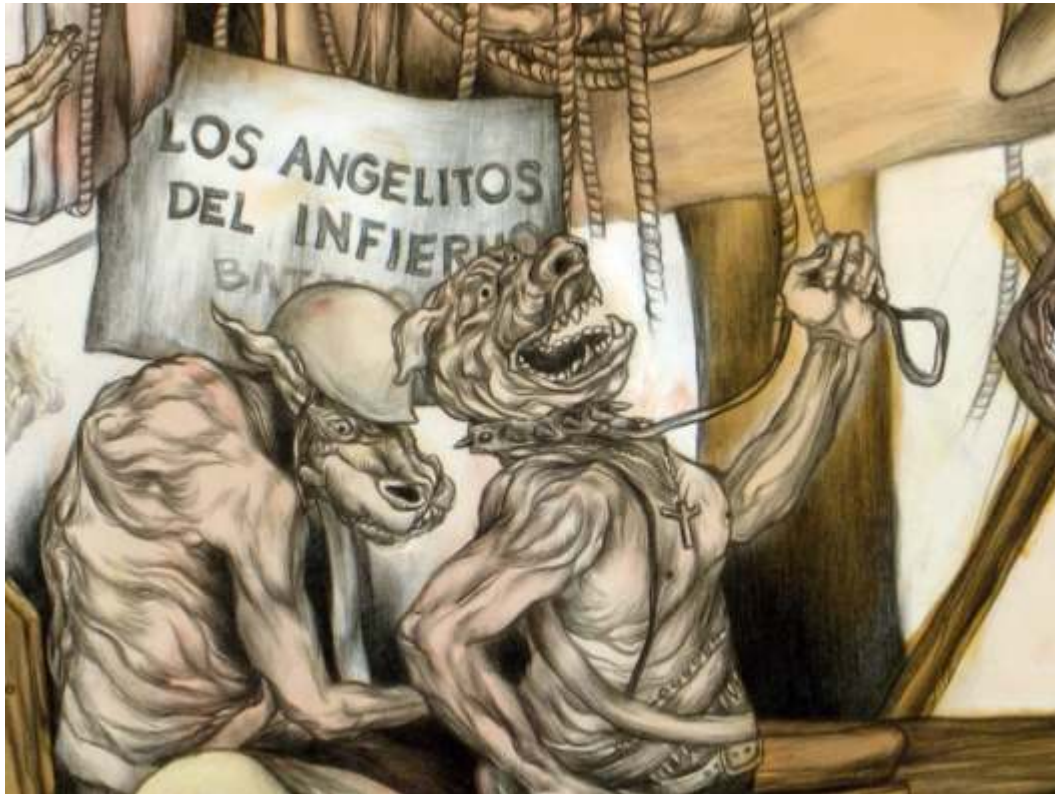
detail from Nationalissimo