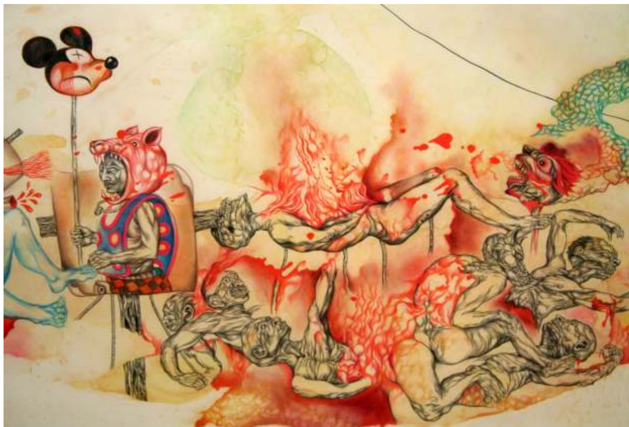
Quetzalcoatl's Children - (detail)