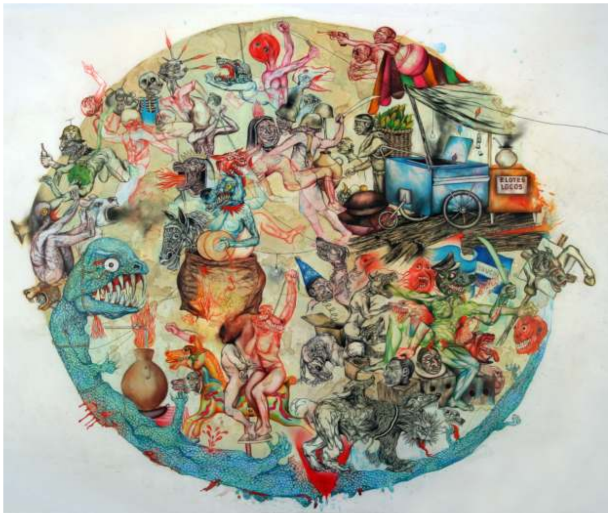
Ferias II - 2007 mixed media on Mylar