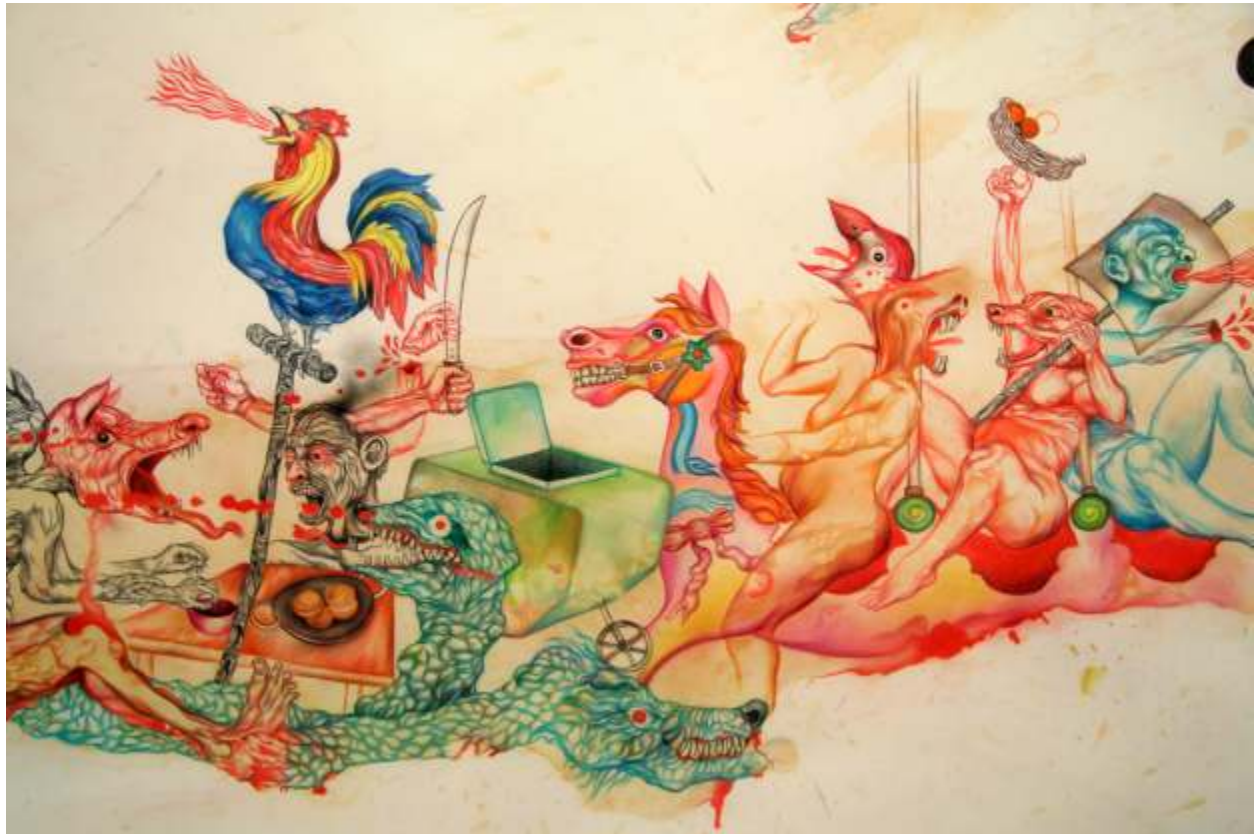
Quetzalcoatl's Children - (detail)