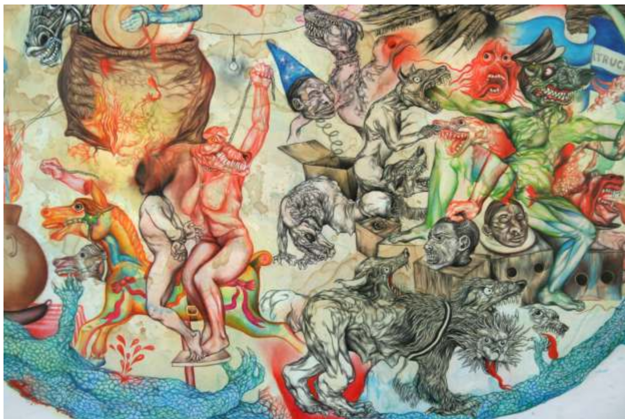
detail of Ferias II