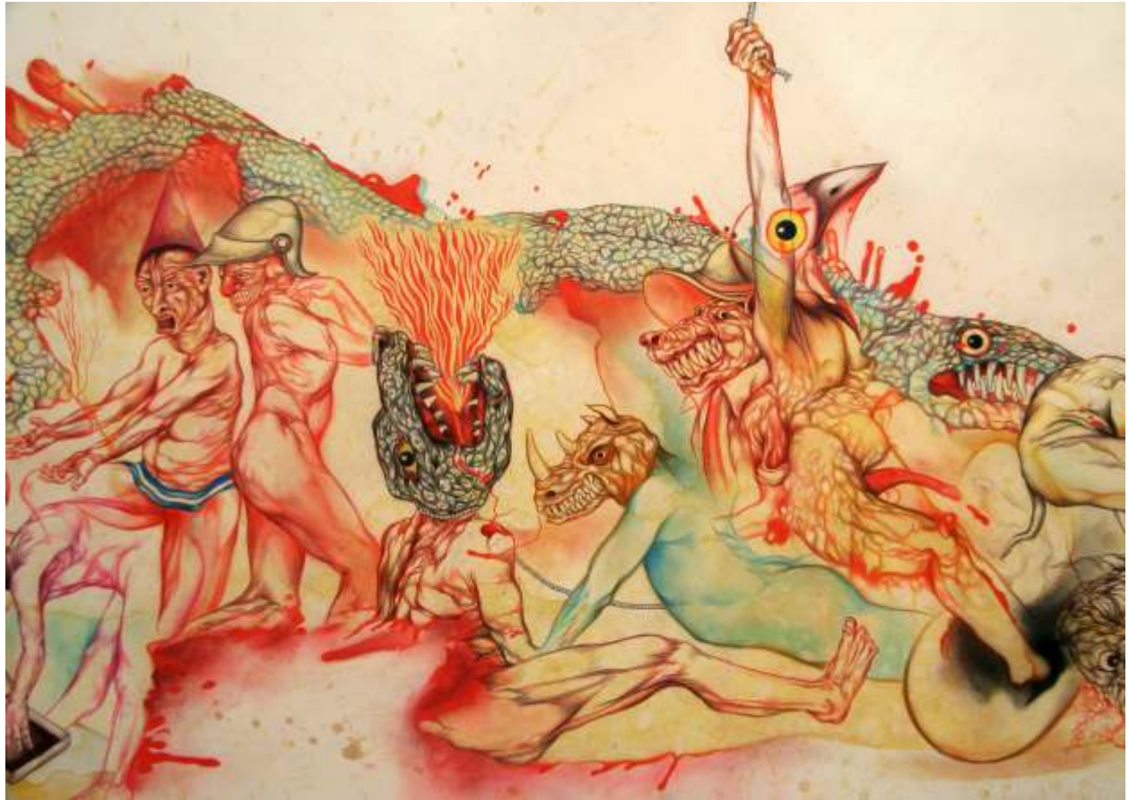
Quetzalcoatl's Children - (detail)