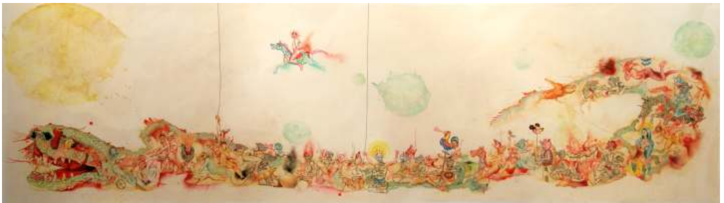
Quetzalcoatl's Children - 2007 mixed media on Mylar (42x143 inches)