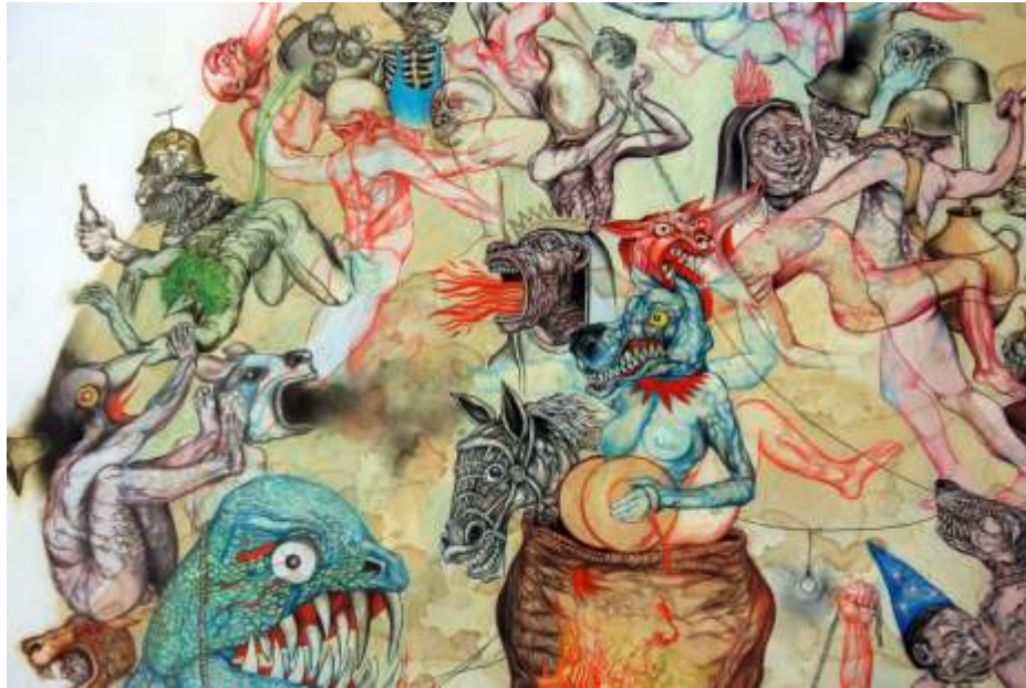
detail of Ferías II