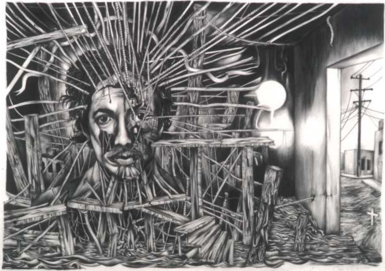
Shipwreck in Jacuapa - 2005 mixed media on Mylar (25x34 inches)