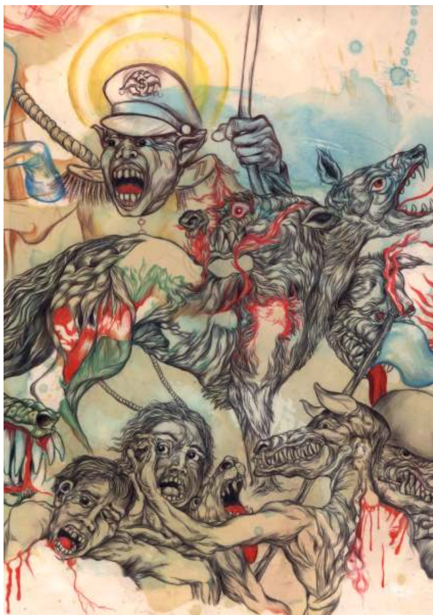
detail of Hungry Dogs