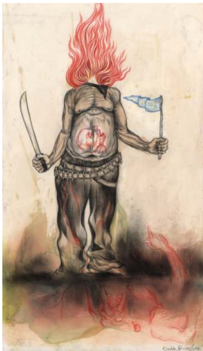
La M.S. - 2007 mixed media on Mylar (17x9.5 inches)