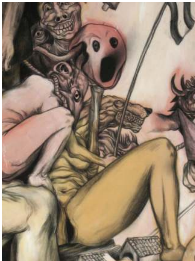
detail of Paramilitary's Ball