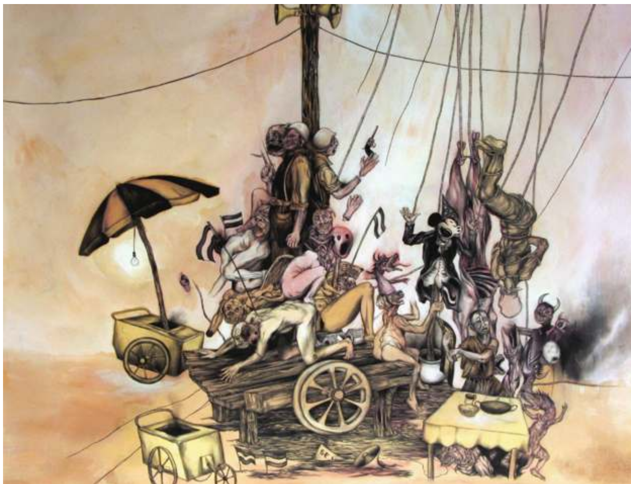
Paramilitary's Ball - 2006 from the Carnivalissimo Series mixed media on Mylar (36x48 inches)