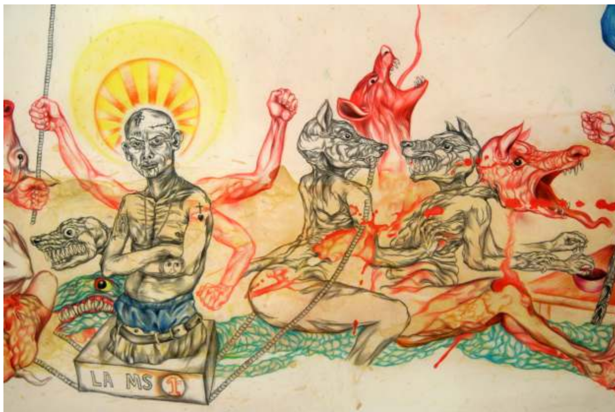
Quetzalcoatl's Children - (detail)