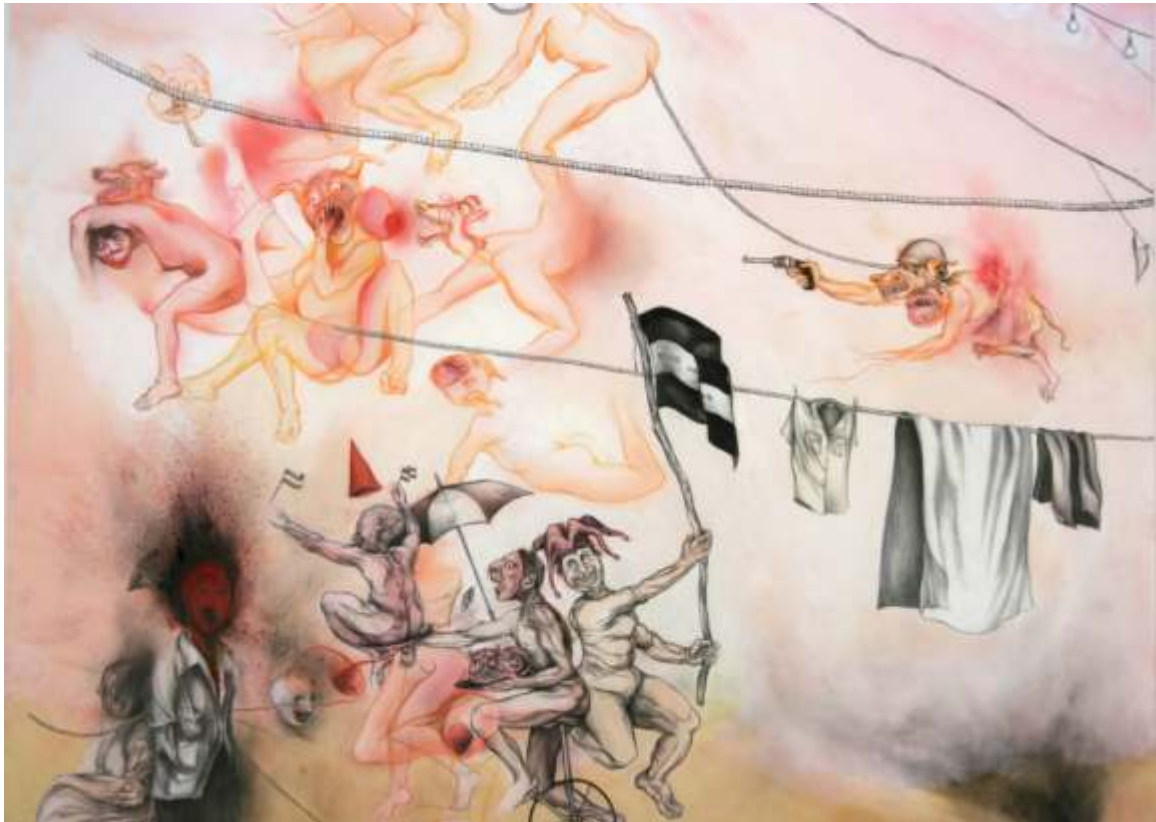
detail of Hungry Ghosts