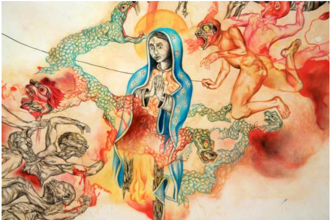
Quetzalcoatl's Children - (detail)