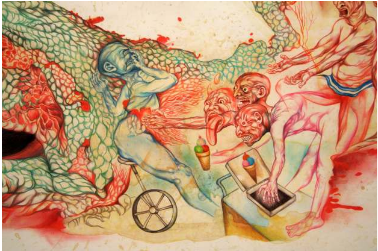
Quetzalcoatl's Children - (detail)