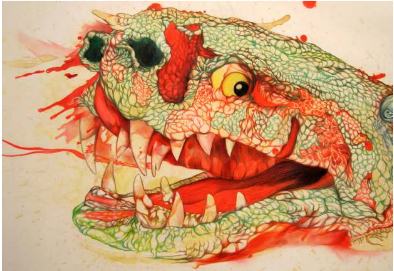
Quetzalcoatl's Children - (detail)