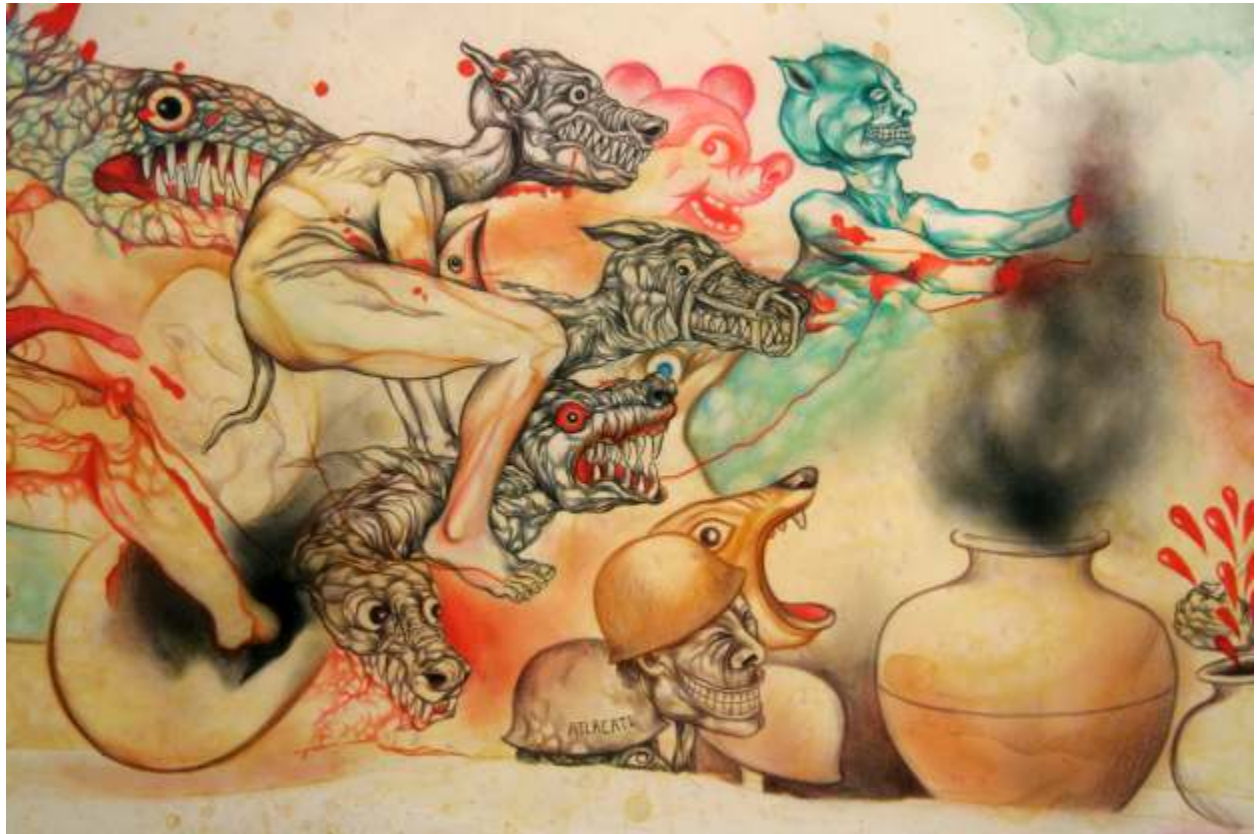
Quetzalcoatl's Children - (detail)