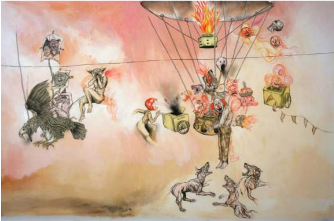
detail of Hungry Ghosts