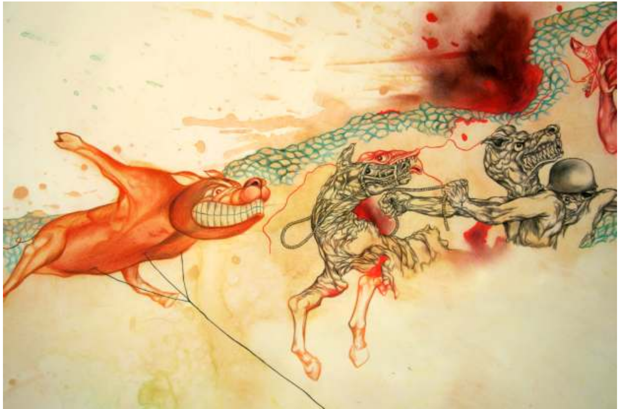
Quetzalcoatl's Children - (detail)