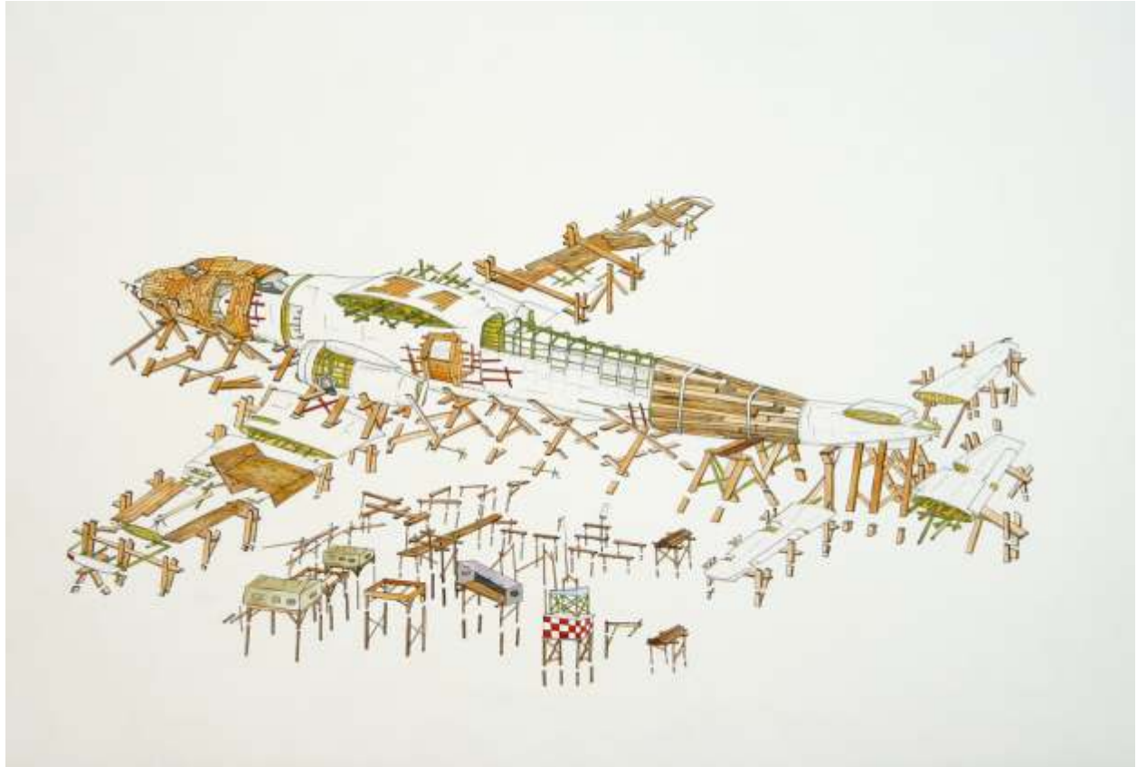
EP3- 2007 ink, gouache & acrylic on paper (15x22 inches)