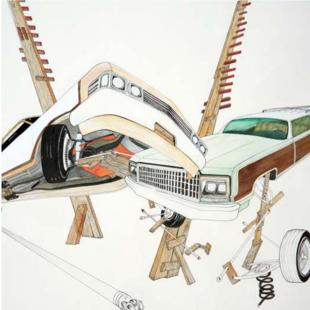
Construction III - 2006 ink, gouache & acrylic on paper (44x30 inches)