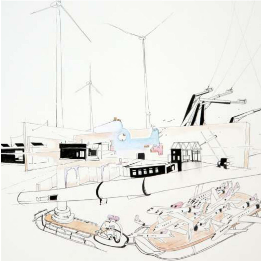
Construction VI- 2006 ink, gouache & acrylic on paper (44x30 inches)