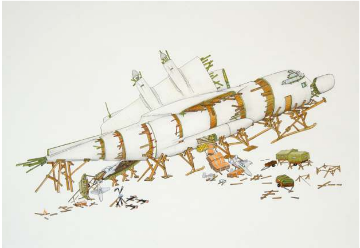
Hawk- 2007 ink, gouache & acrylic on paper (15x22 inches)