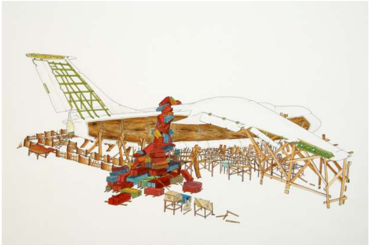
Ep3 -II - 2007 ink, gouache & acrylic on paper (15x22 inches)