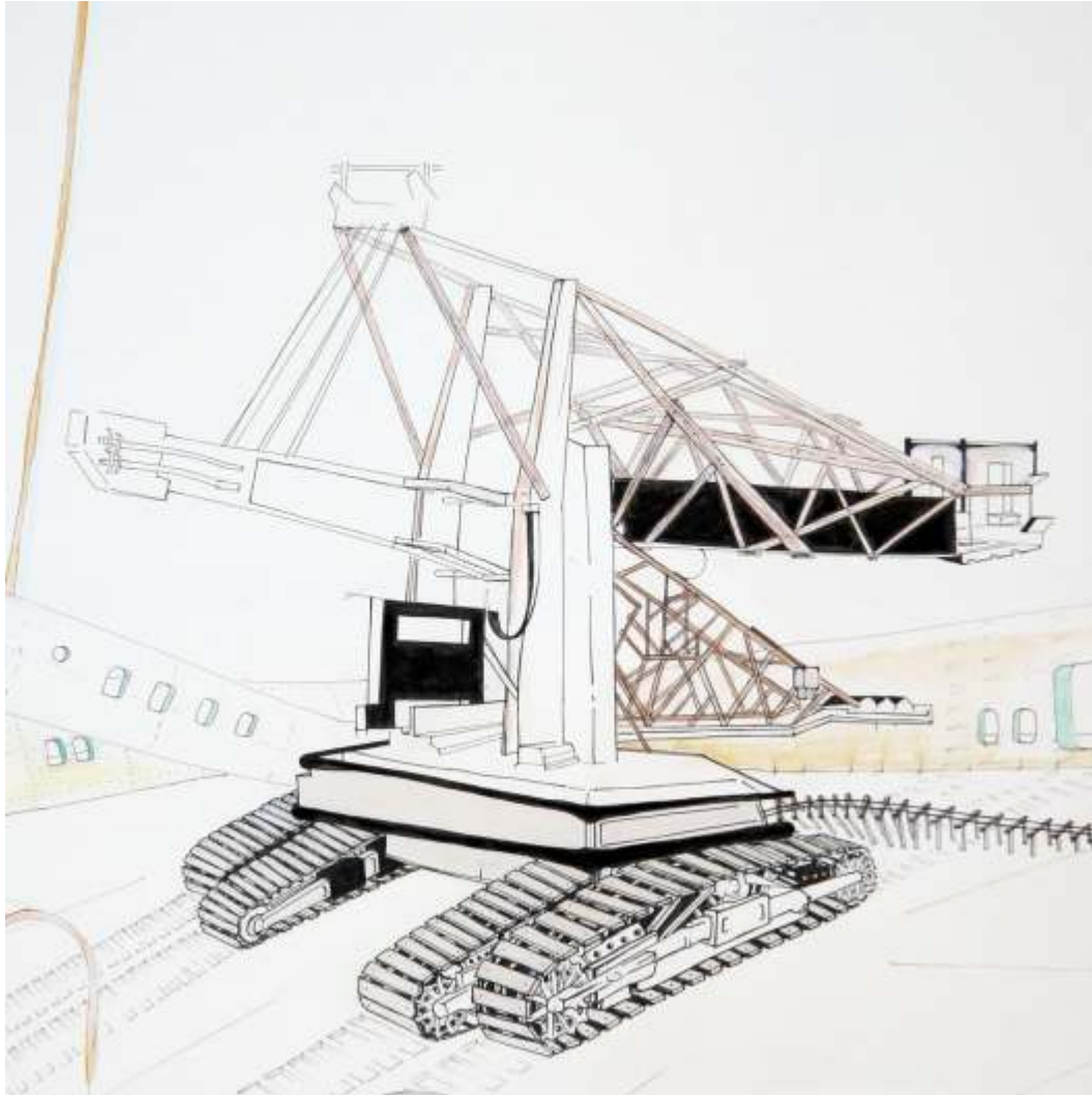
Construction II - 2006 ink, gouache & acrylic on paper (44x30 inches)