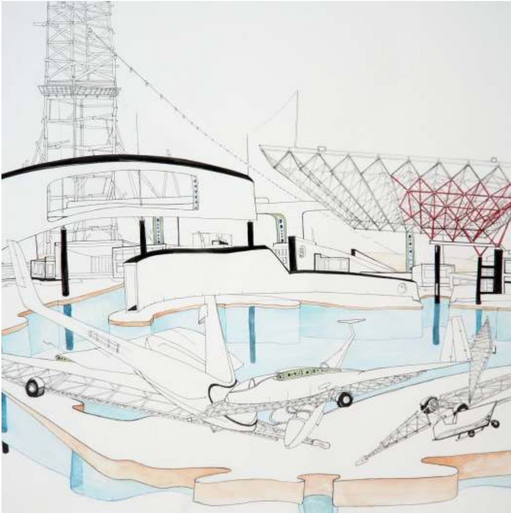
Construction I - 2006 ink, gouache & acrylic on paper (44x30 inches)