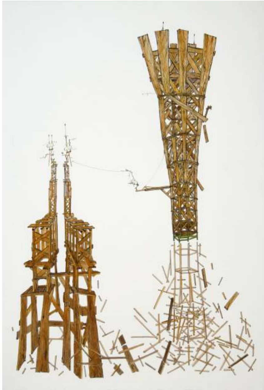
Tower- 2006 ink, gouache & acrylic on paper (22x15 inches)