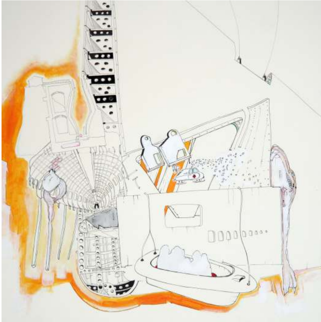
Construction IV - 2006 ink, gouache & acrylic on paper (44x30 inches)