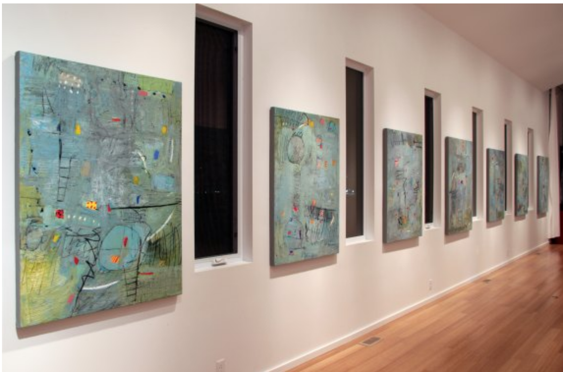
Headbones Gallery 2012

polluted the lake where he had been drawing, the lake which, in turn, fuelled his paintings when he turned to abstraction. He says that he would attack the canvases with physicality much like the energy of pollution overtaking the colourful snippets of life. Dmytruk wonders if the paintings aren't a show of guilt.