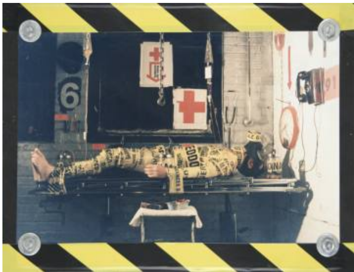
Watching The Destruction of Time - photograph & mixed media, 16x20 inches, 1998