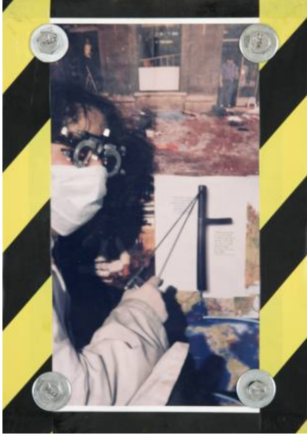
Global Advisor IV - photograph & mixed media, 16x20 inches, 1997