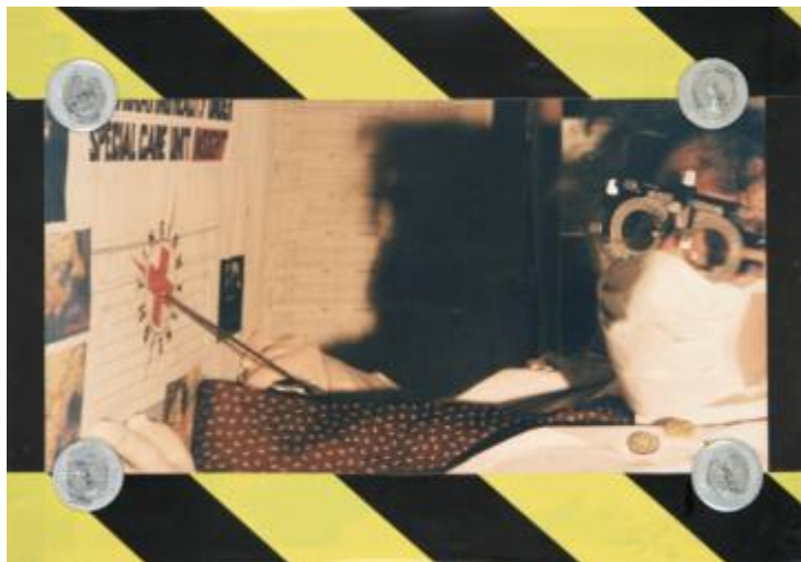
Global Advisor III - photograph & mixed media, 16x20 inches, 1997