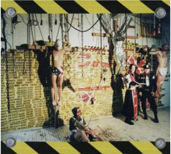
Left Over Forest - photograph & mixed media, 20x25 inches, 1998