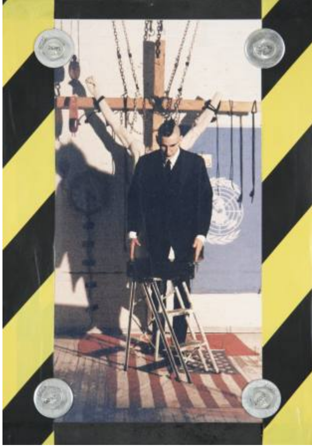
True Love - photograph & mixed media, 11x14 inches, 1997