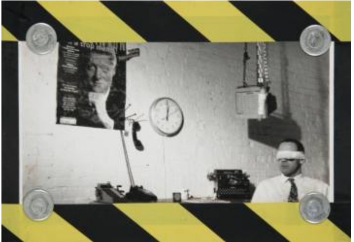
Groping For Desire - photograph & mixed media, 11x14 inches, 1997