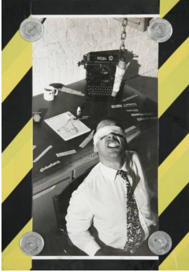
Groping For Desire II - photograph & mixed media, 16x20 inches, 1997