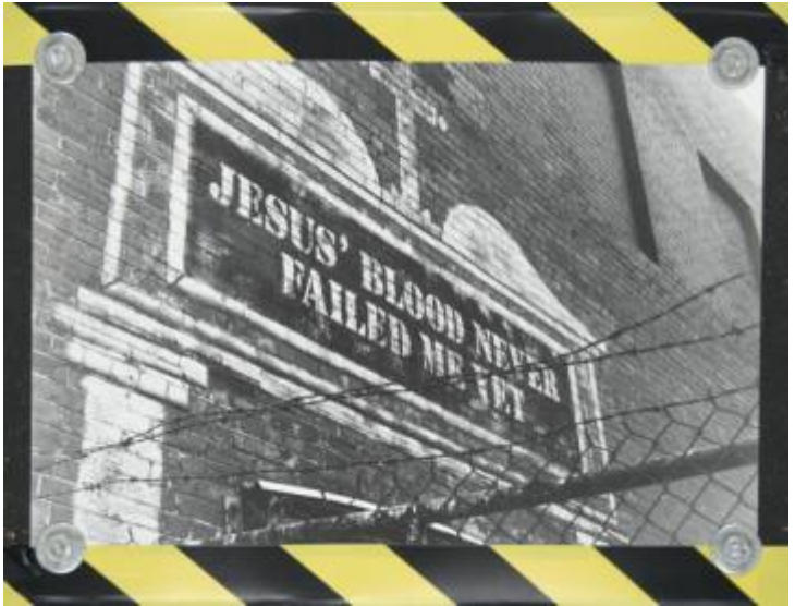
Self Titled - photograph & mixed media, 16x20 inches, 1994