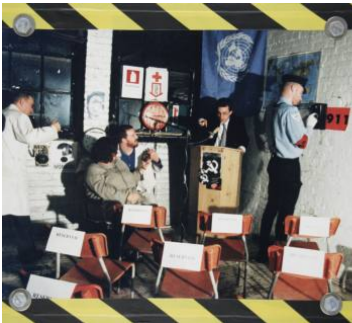
Free Speech For The Absent - photograph & mixed media, 20x25 inches, 1999