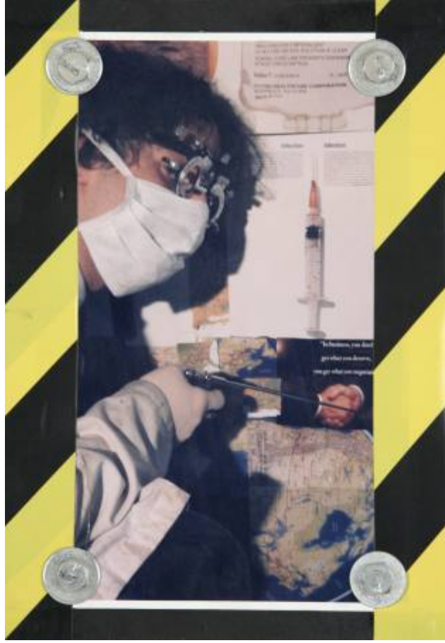
Global Advisor I - photograph & mixed media, 16x20 inches, 1997