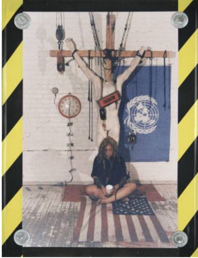
Begging For A Blessing - photograph & mixed media, 16x20 inches, 1997