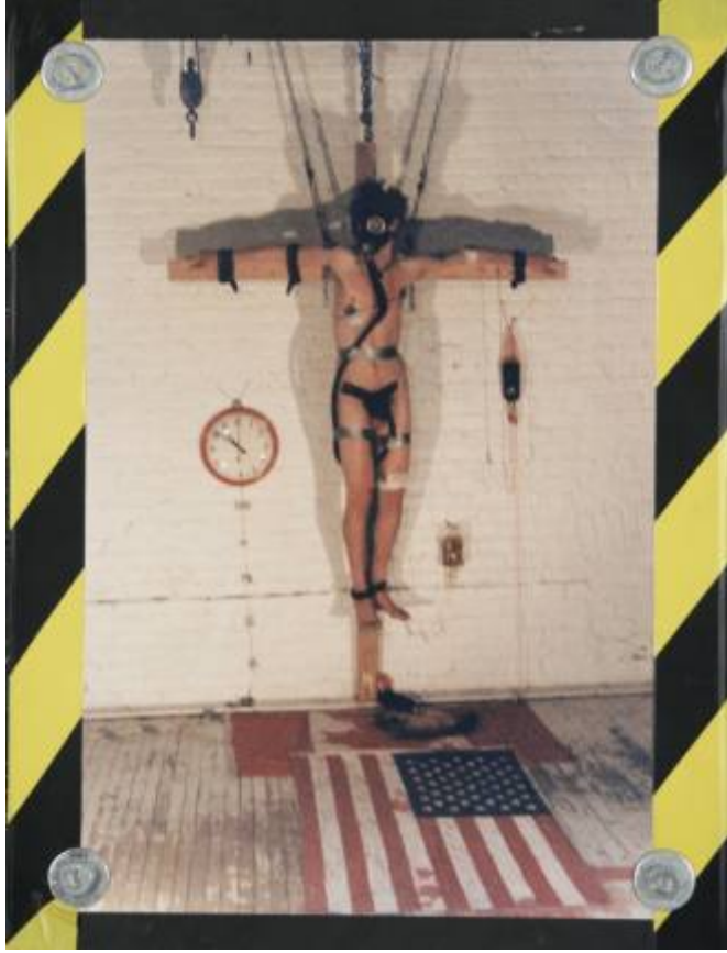
A Blessing & Sacrifice - photograph & mixed media, 16x20 inches, 1994