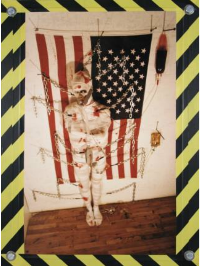
Patriotic Gift - photograph & mixed media, 30x40 inches, 1997