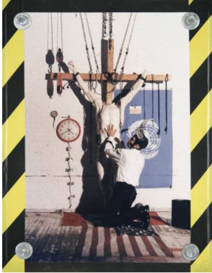
True Love For Democracy - photograph & mixed media, 16x20 inches, 1997