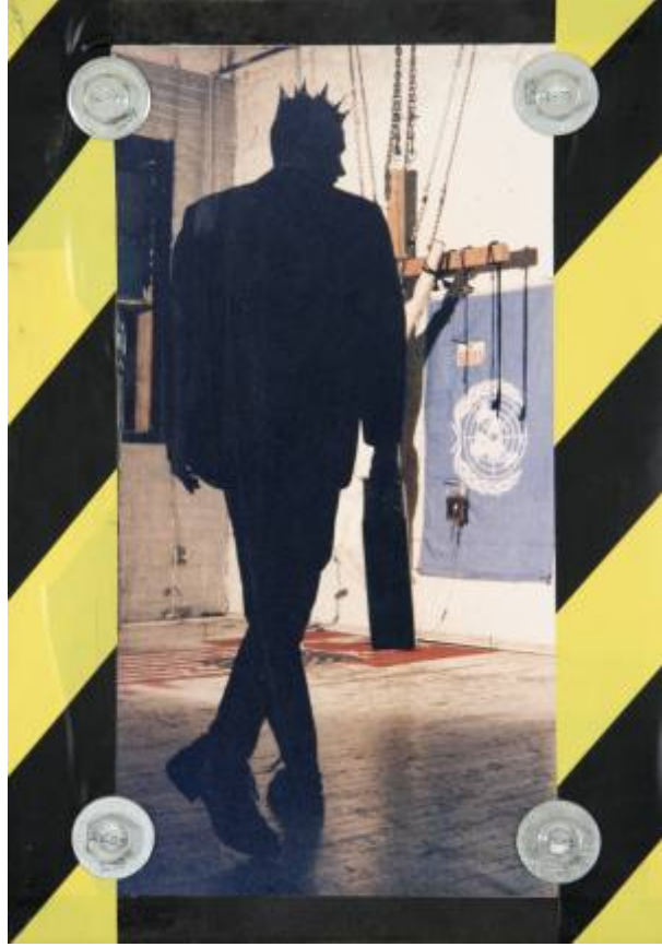
True Love II - photograph & mixed media, 11x14 inches, 1997