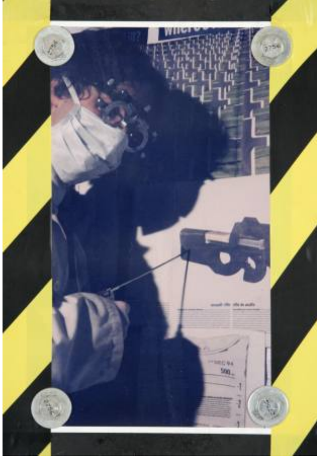
Global Advisor II - photograph & mixed media, 16x20 inches, 1997