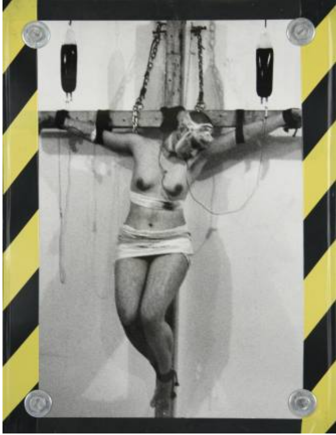
Keeping The Spirit Alive - photograph & mixed media, 16x20 inches, 1994