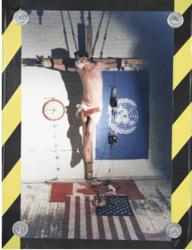
Keeping The Ritual Alive - photograph & mixed media, 16x20 inches, 1998