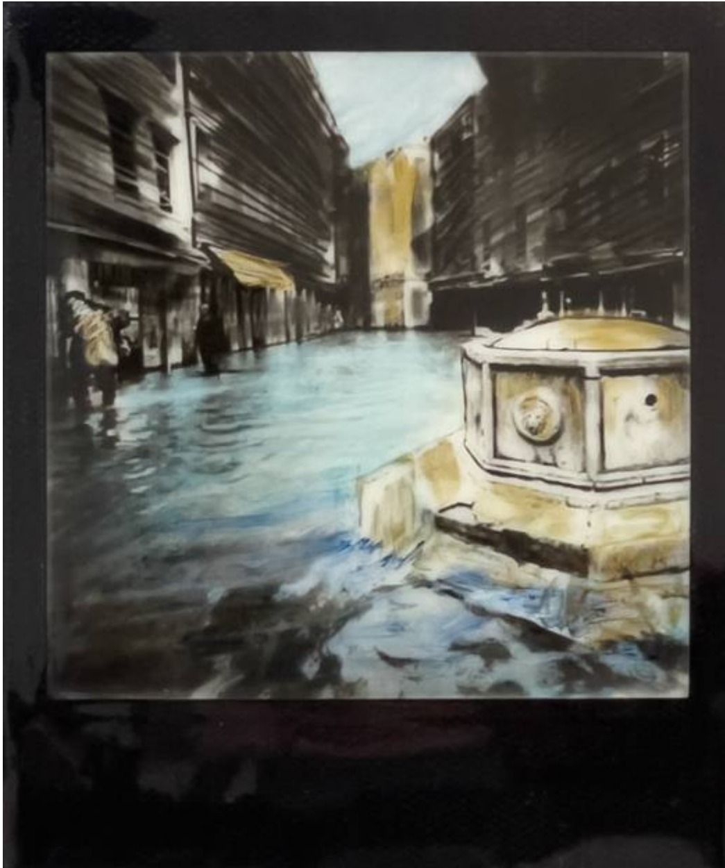
Old Well in Campo