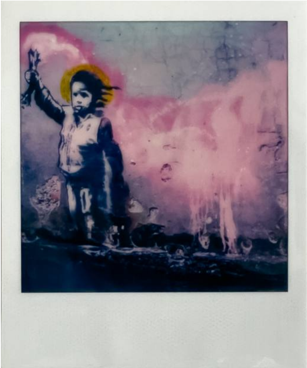
Banksy in Venice