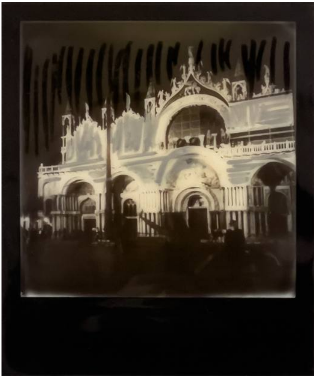
St. Mark's Basilica