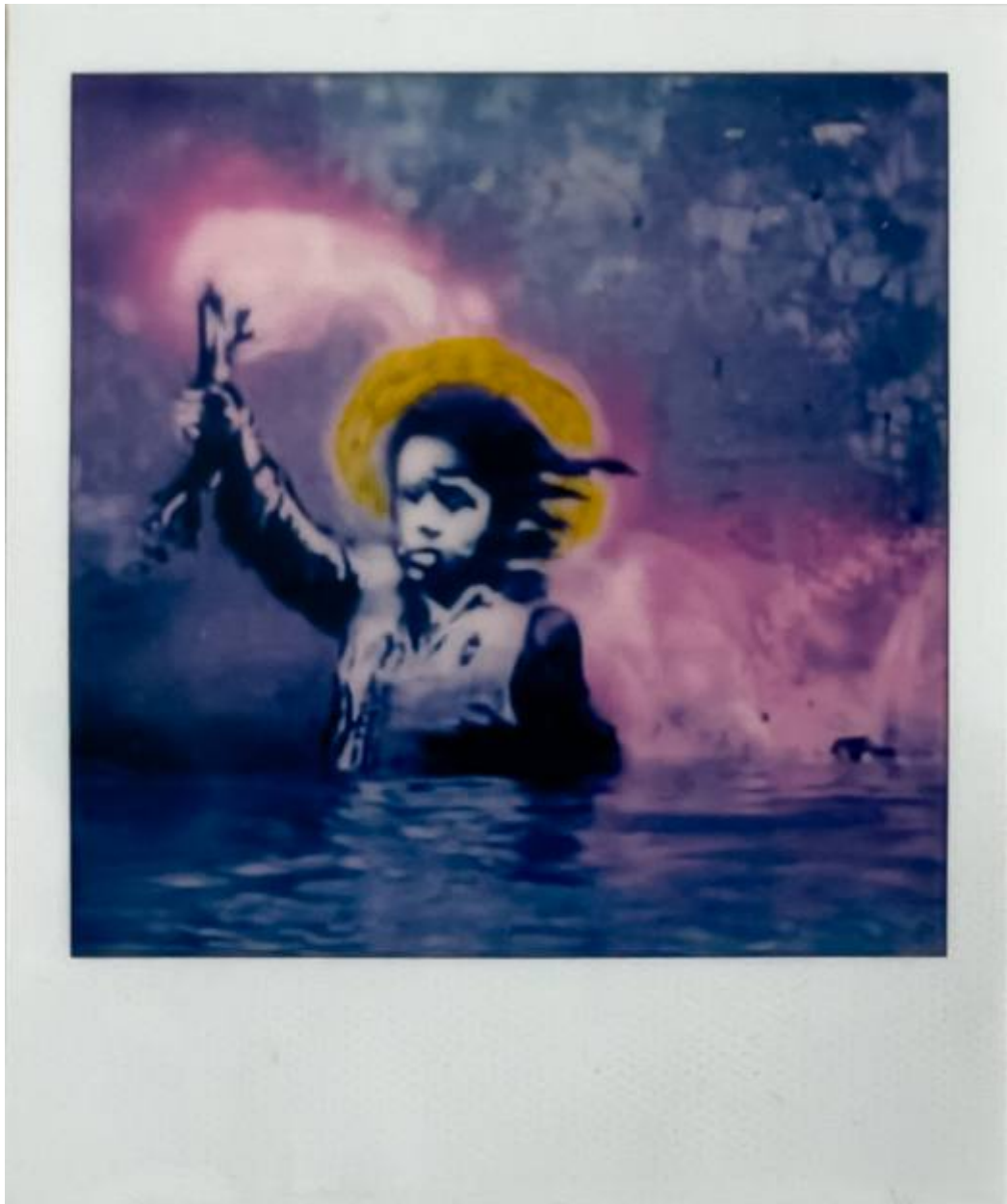
Banksy Acqua Alta / A Cry for Help