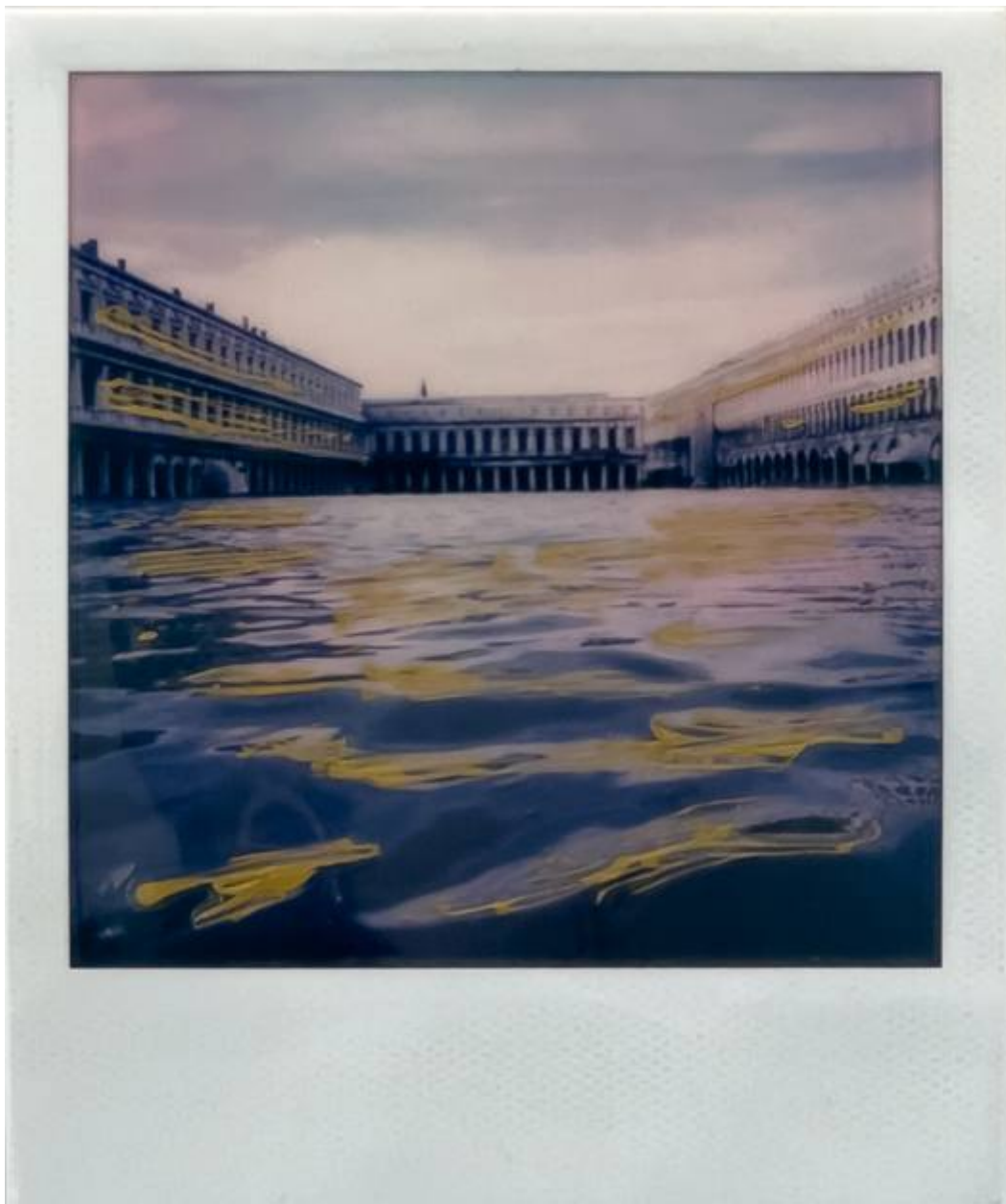
Acqua Alta / St. Mark's Square