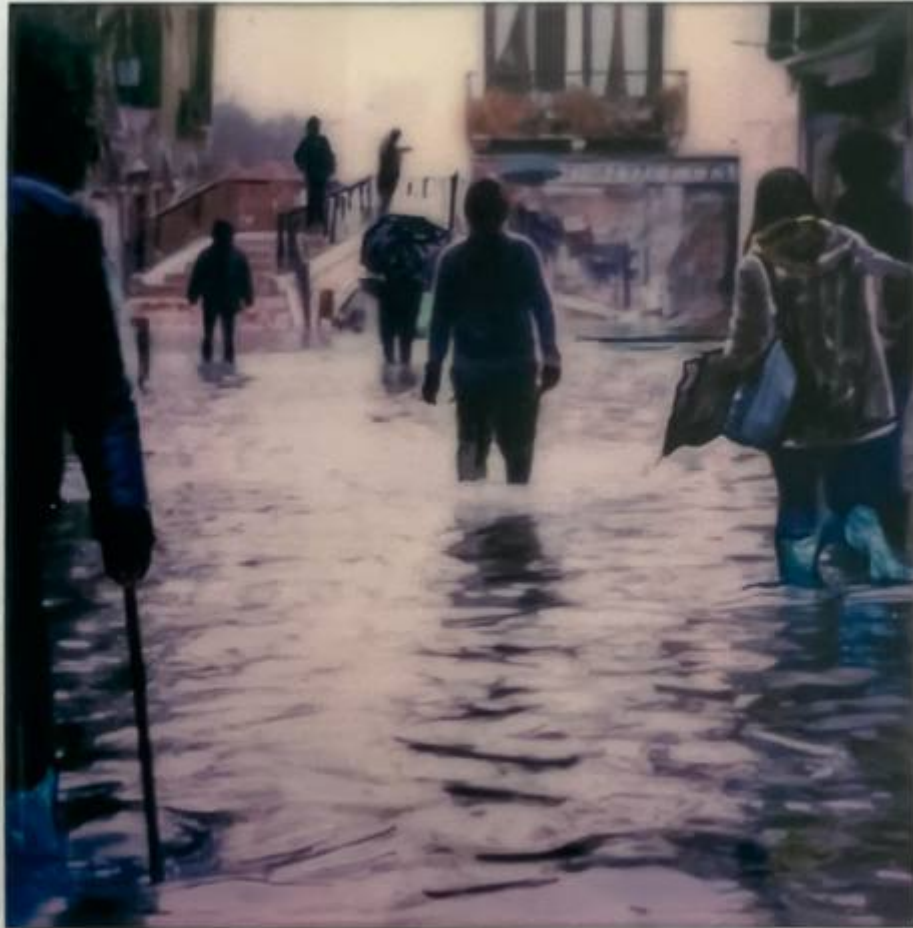
Acqua Alta in Campo