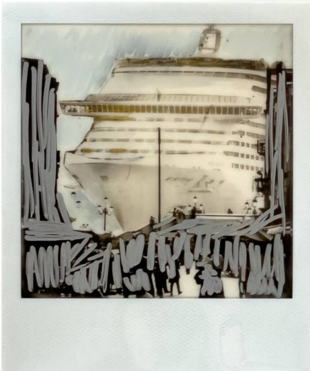
at Via Garibaldi