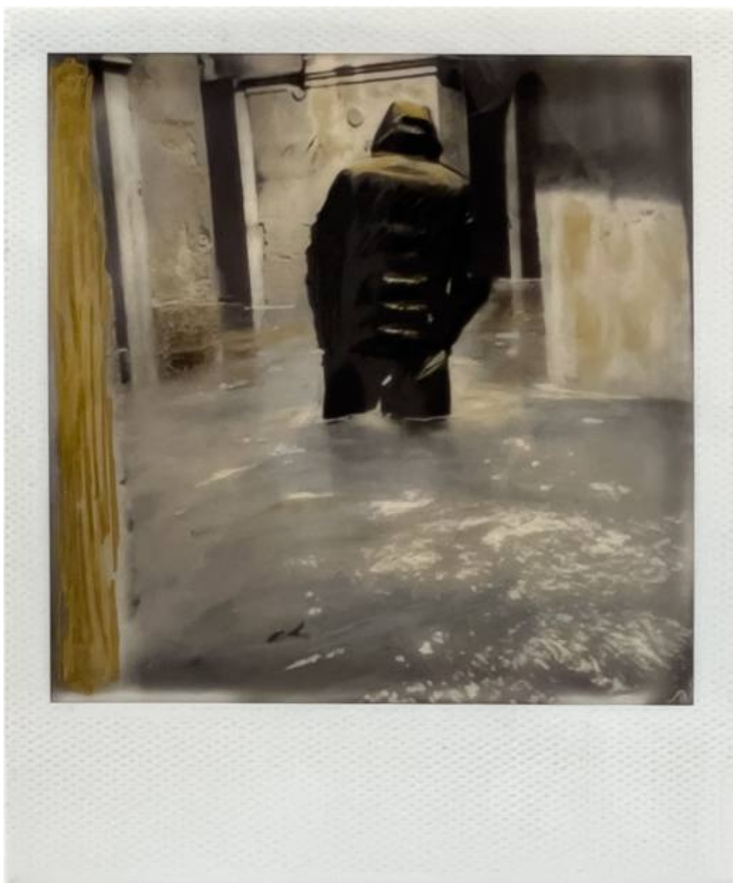
Man Walking / Acqua Alta