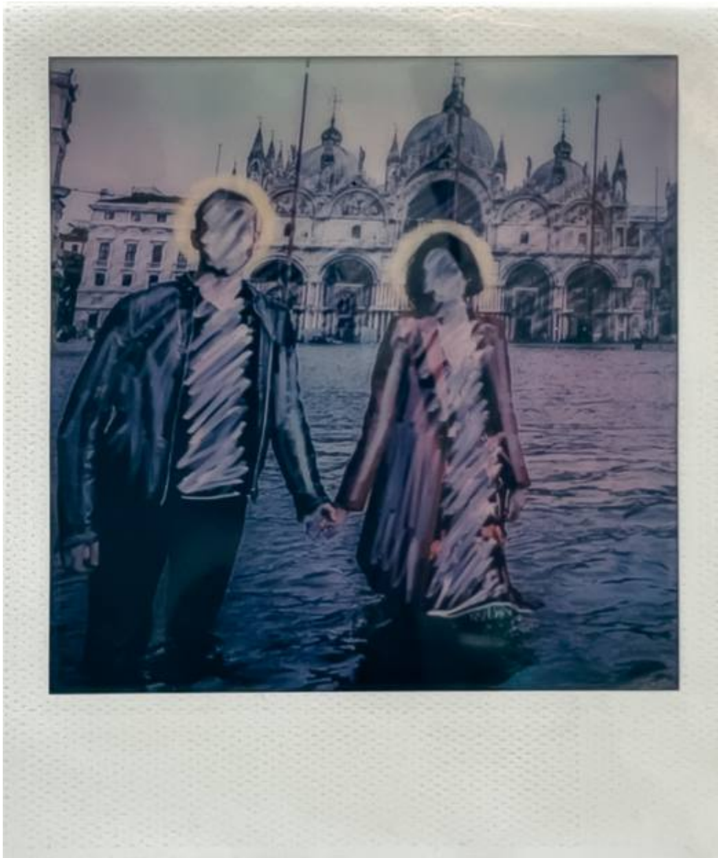
Tourists / Acqua Alta