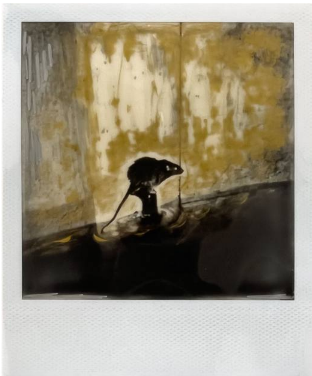
Ratto / Acqua Alta