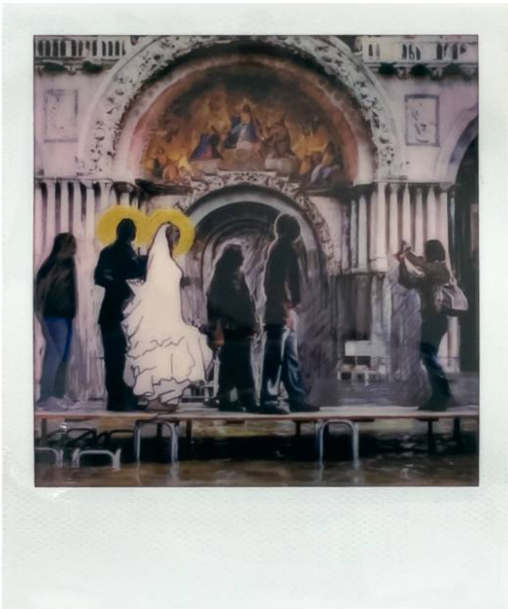
The Wedding / Acqua Alta