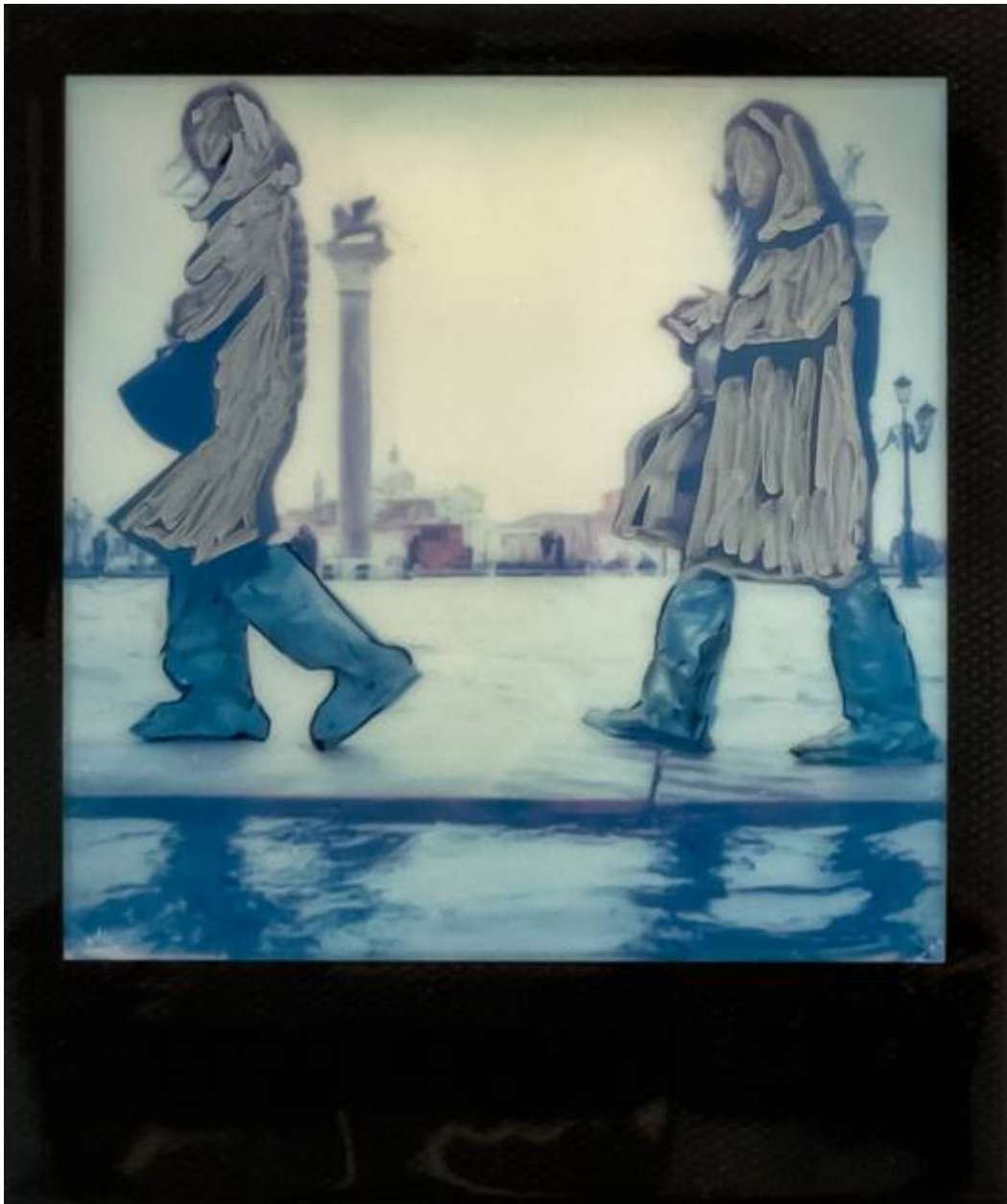
Girls on Benches