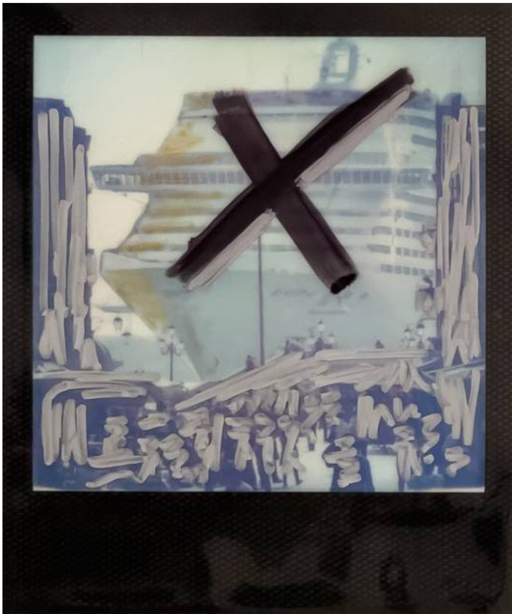
X / Ship Protest