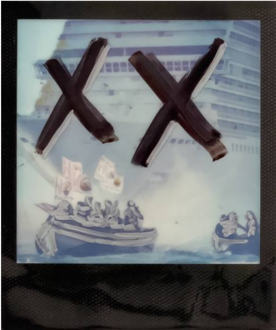
XX / Ship Protest