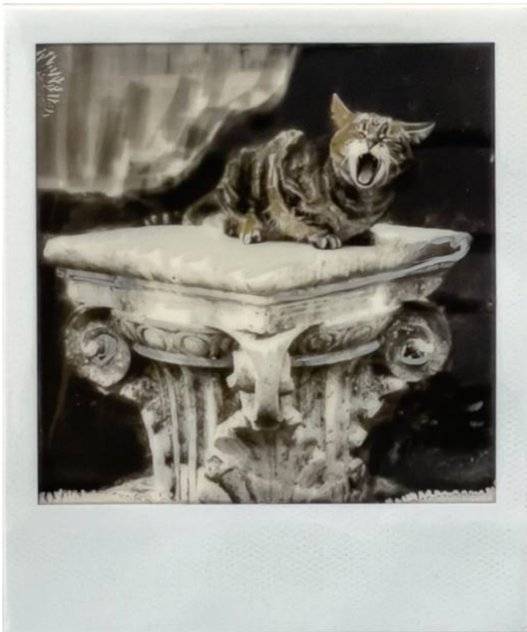
Feral Cat on a Pedastel