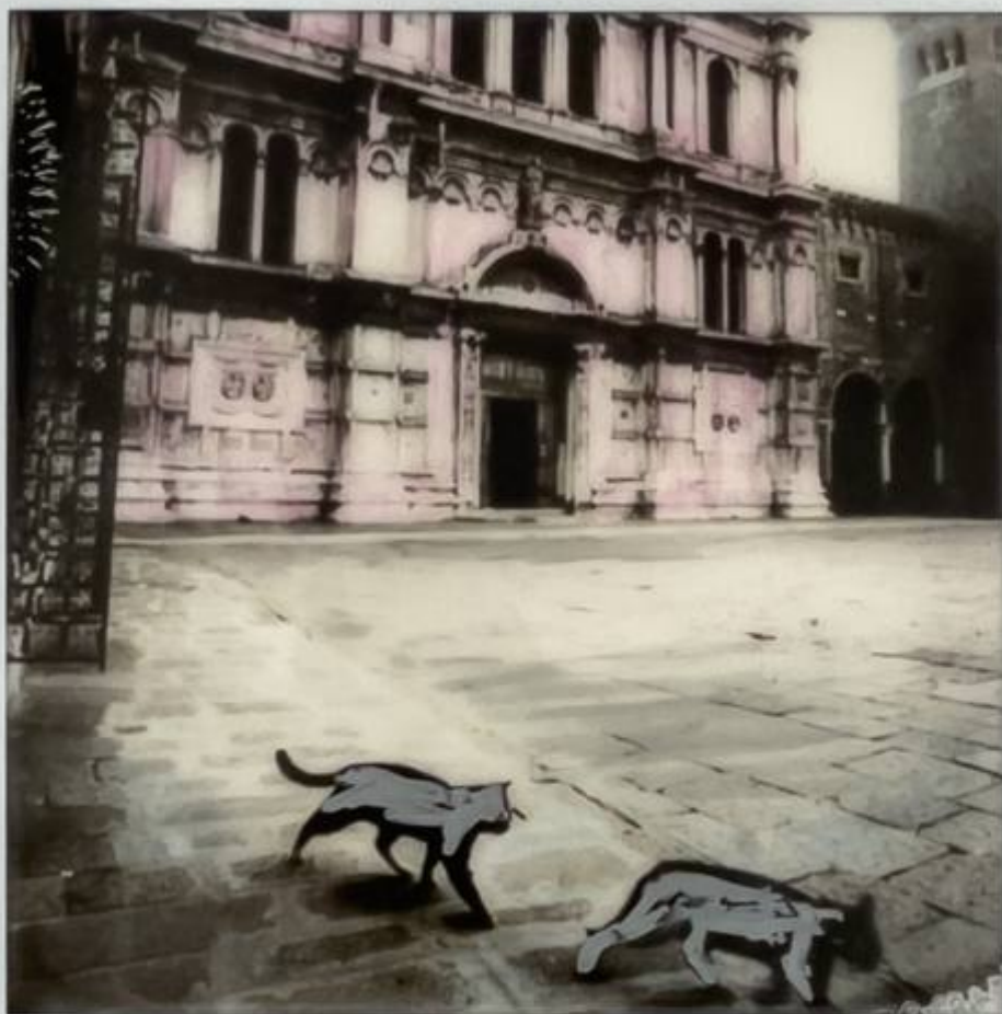
Gatte in Campo