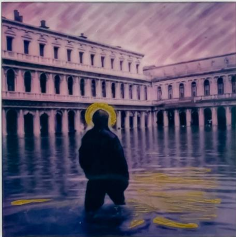
Lone Figure / Acqua Alta