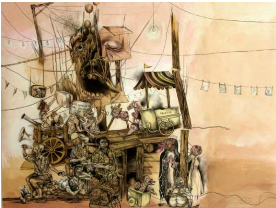
Nationalissimo, from the Carnivalissimo series Mylar drawing 36x48 inches 2006