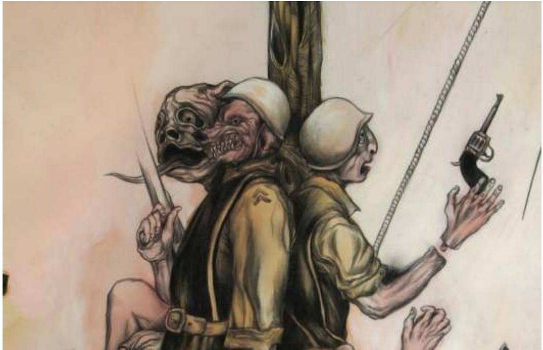
Paramilitary's Ball (detail)