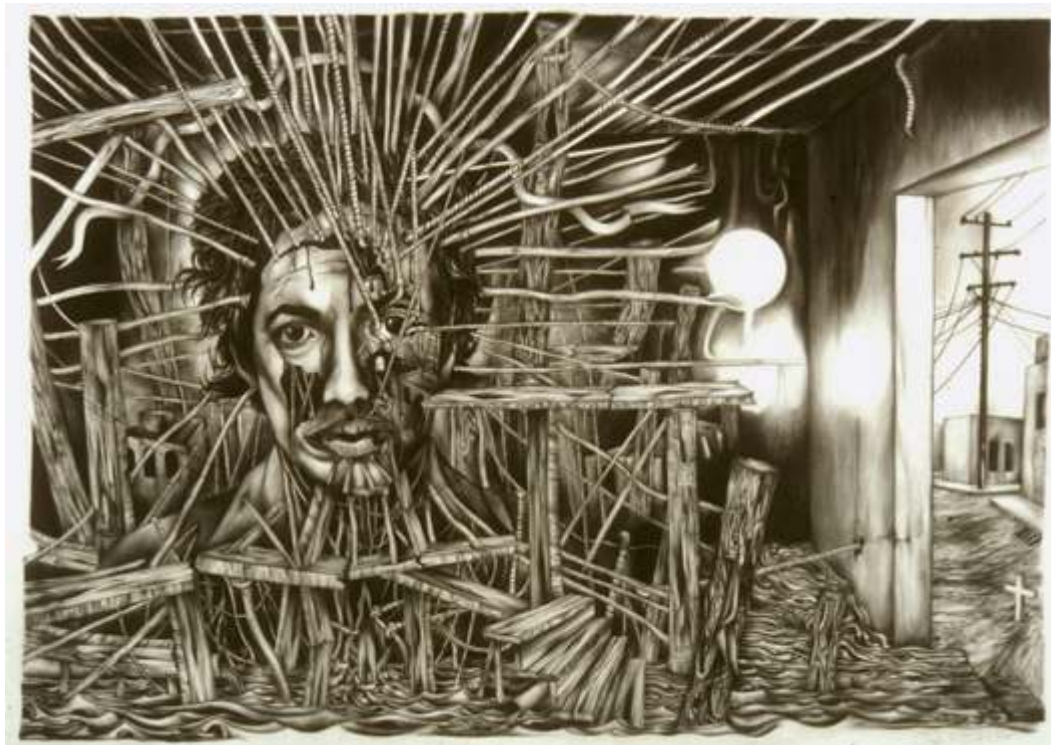
Shipwreck In Jacuapa Mylar drawing 25x34 inches 2005