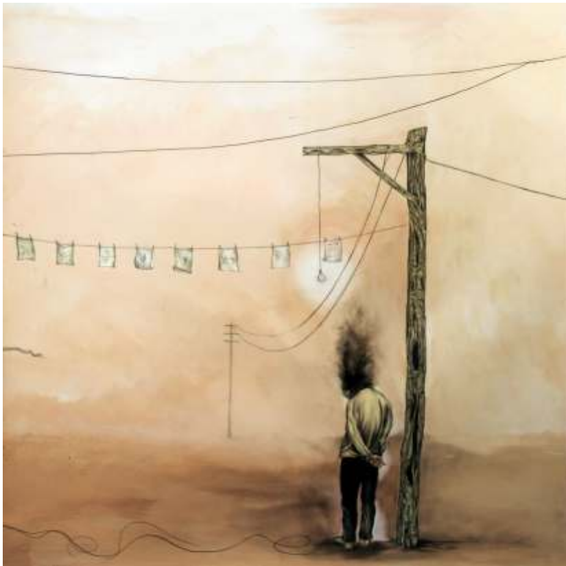
From the Carnivalissimo series Mylar drawing 36x48 inches 2006