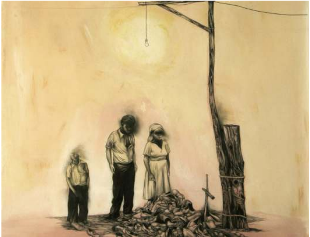
Discovery Of Shoes Mylar drawing 32x39 inches 2006