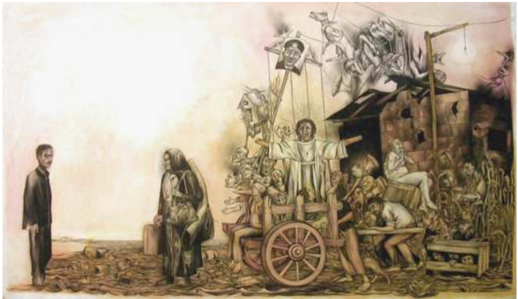
El Mozote Exodus Mylar drawing 36x48 inches 2005