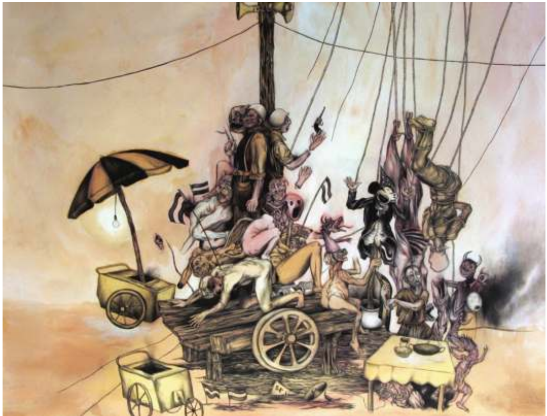
Paramilitary's Ball, from the Carnivalissimo series Mylar drawing 36x48 inches 2006