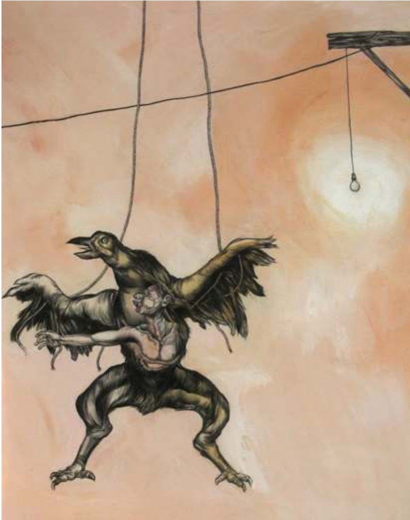
Galivan, from the Carnivalissimo series Mylar drawing 36x48 inches 2006