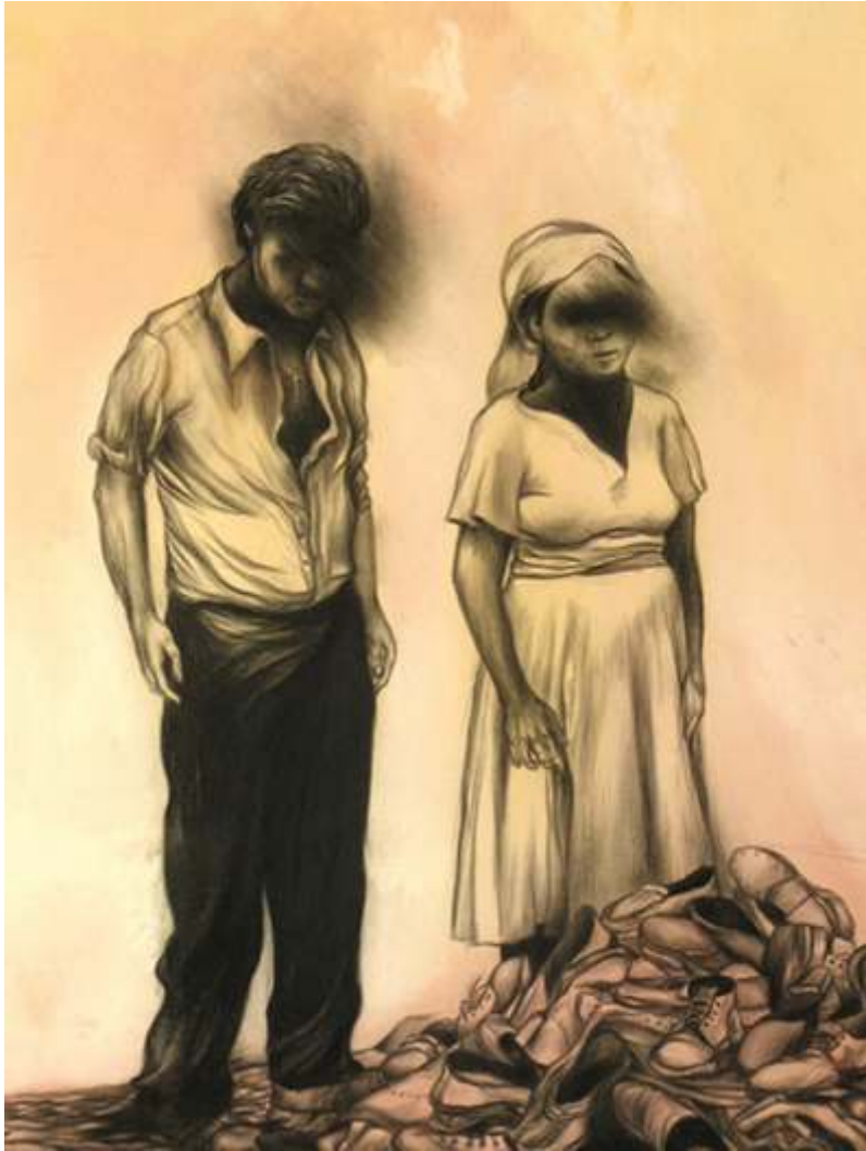
Discovery Of Shoes (detail)