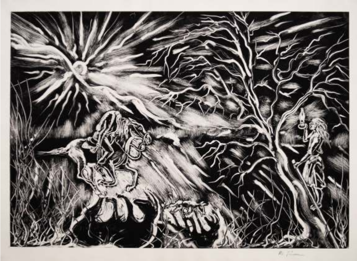
Reunion monotype, 31 x 43 inches 2004