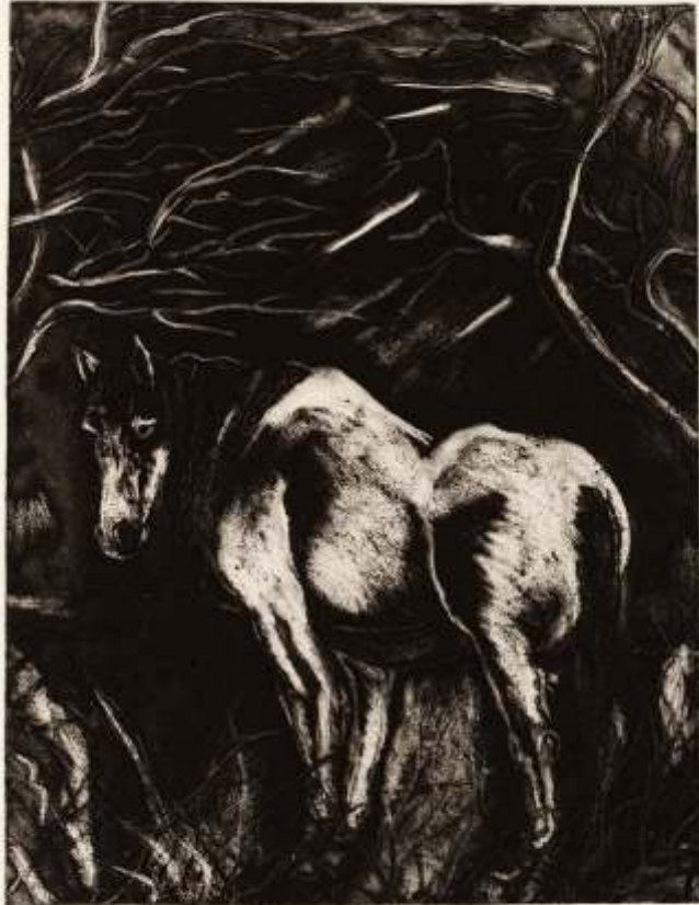
The Chalk Horse etching, 30 x 22 inches 2005