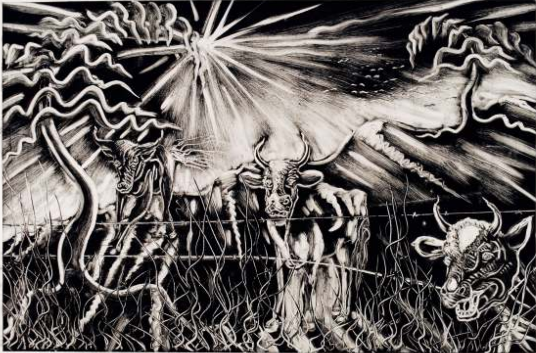
Mad Cows monotype, 48 x 34 inches 2004