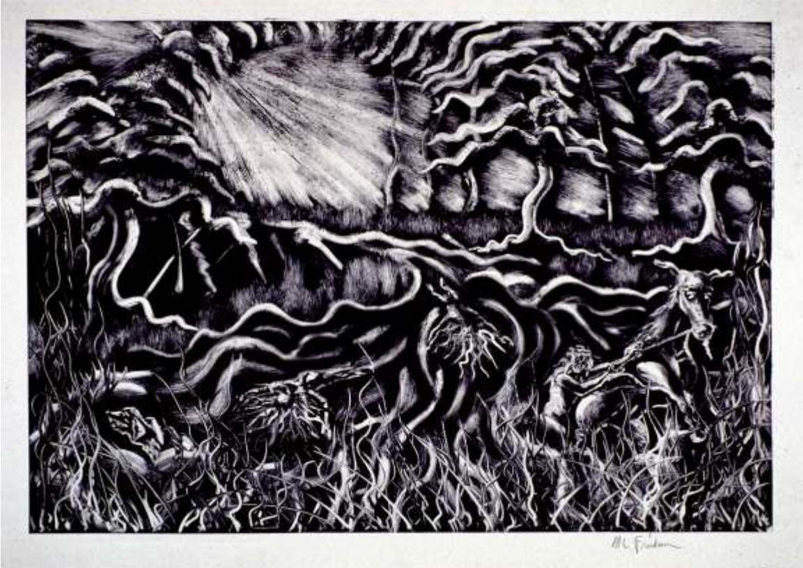
Sturm und Drang monotype, 31 x 43 inches 2003