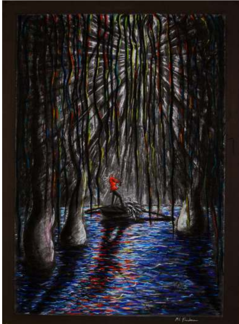
Swamp pastel and oil on paper, 43 x 31 inches 2005