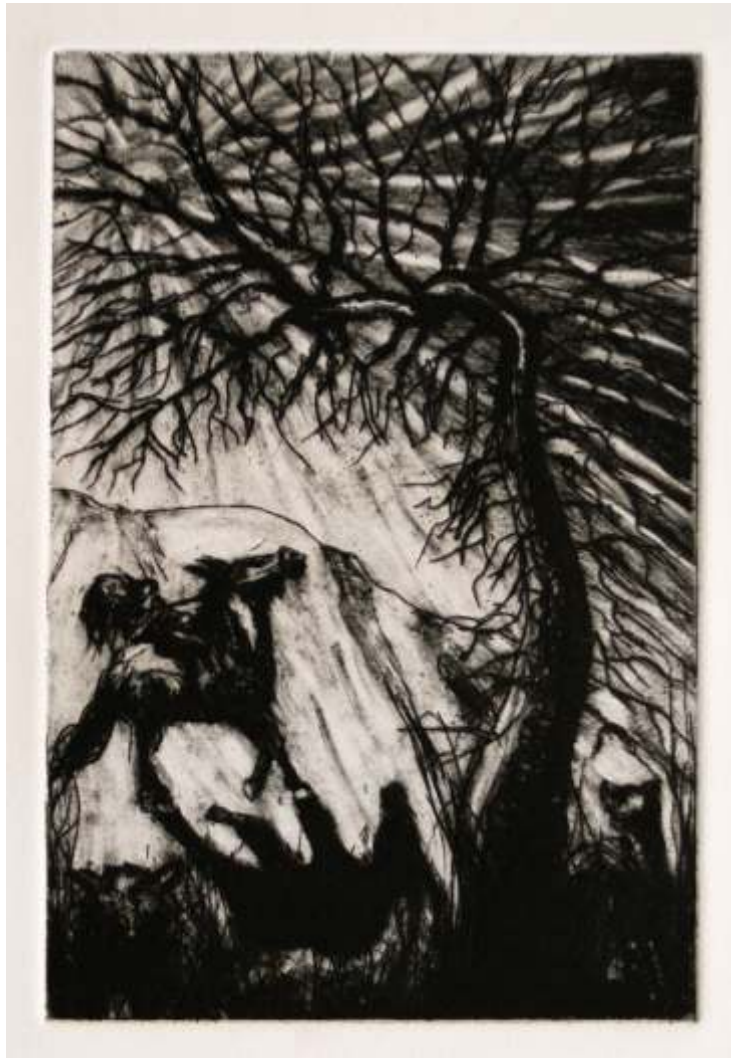
St. George etching and monprint, 22 x 15 inches 2006