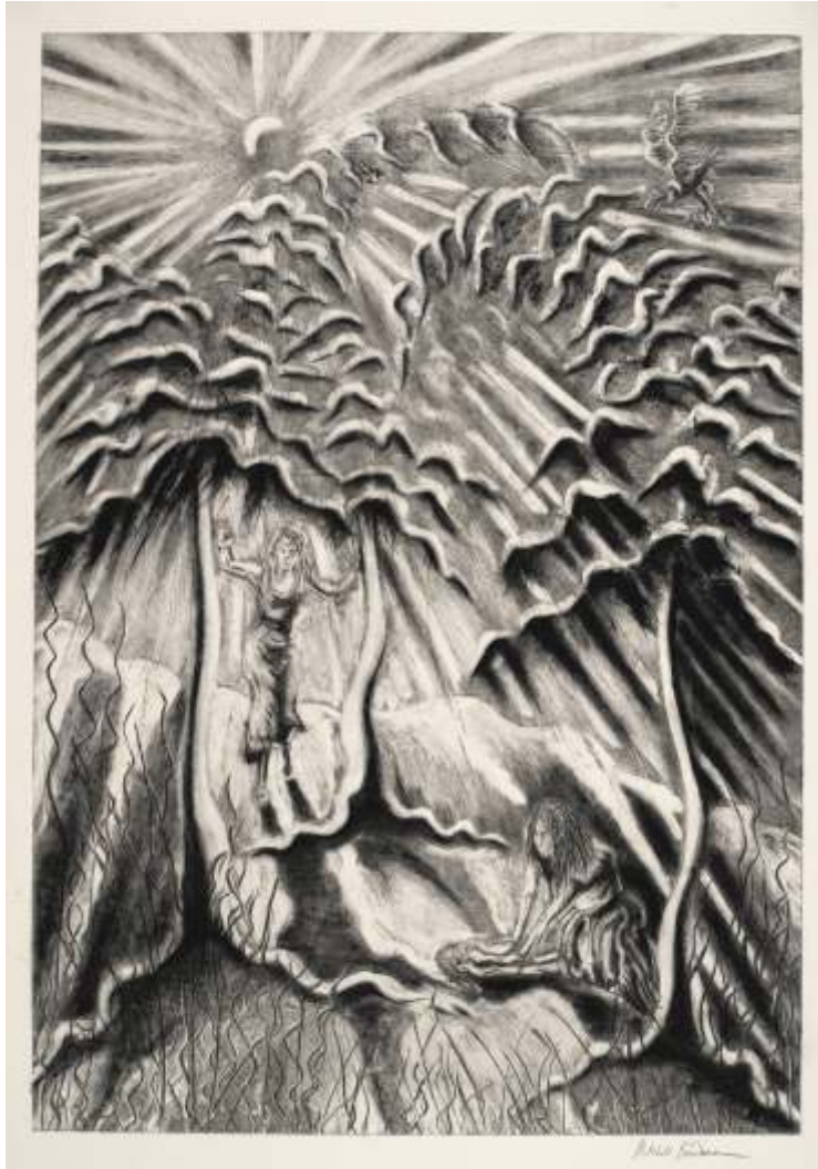
Noon Witch graphite and oil on paper, 42 x 31 inches 2006