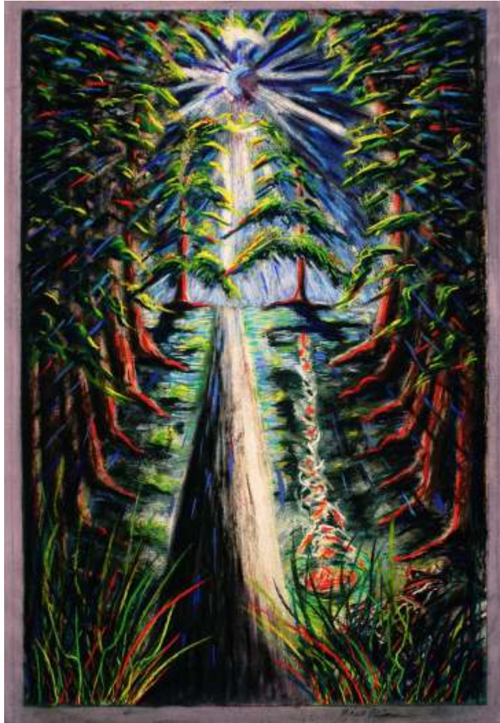
The Road pastel and oil on paper, 43 x 31 inches 2005