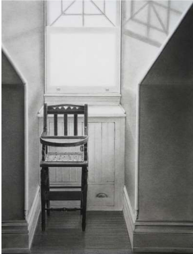
Conversations With Time - The Fulford Chairs (George T. Fulford III) charcoal on paper, 29 x 22 inches 2006