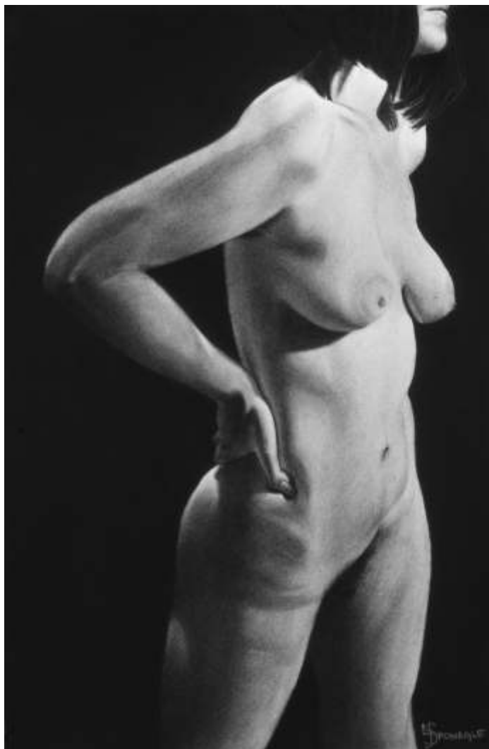
Untitled (Female Right #2) charcoal on paper, 22 x 14 in 2000