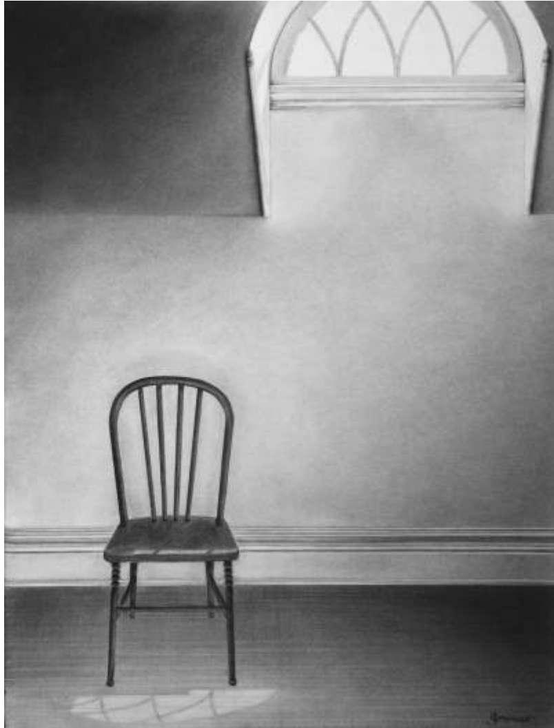
Conversations With Time - The Fulford Chairs (Mrs. A Bryvois) charcoal on paper, 29 x 22 inches 2006