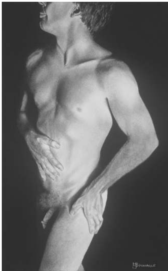
Untitled (Male #10) charcoal on paper, 22 x 14 in 2004