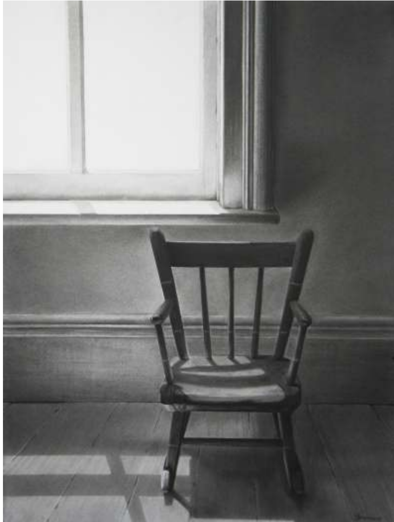
Conversations With Time (After The Fable) charcoal on paper, 29 x 22 inches 2006