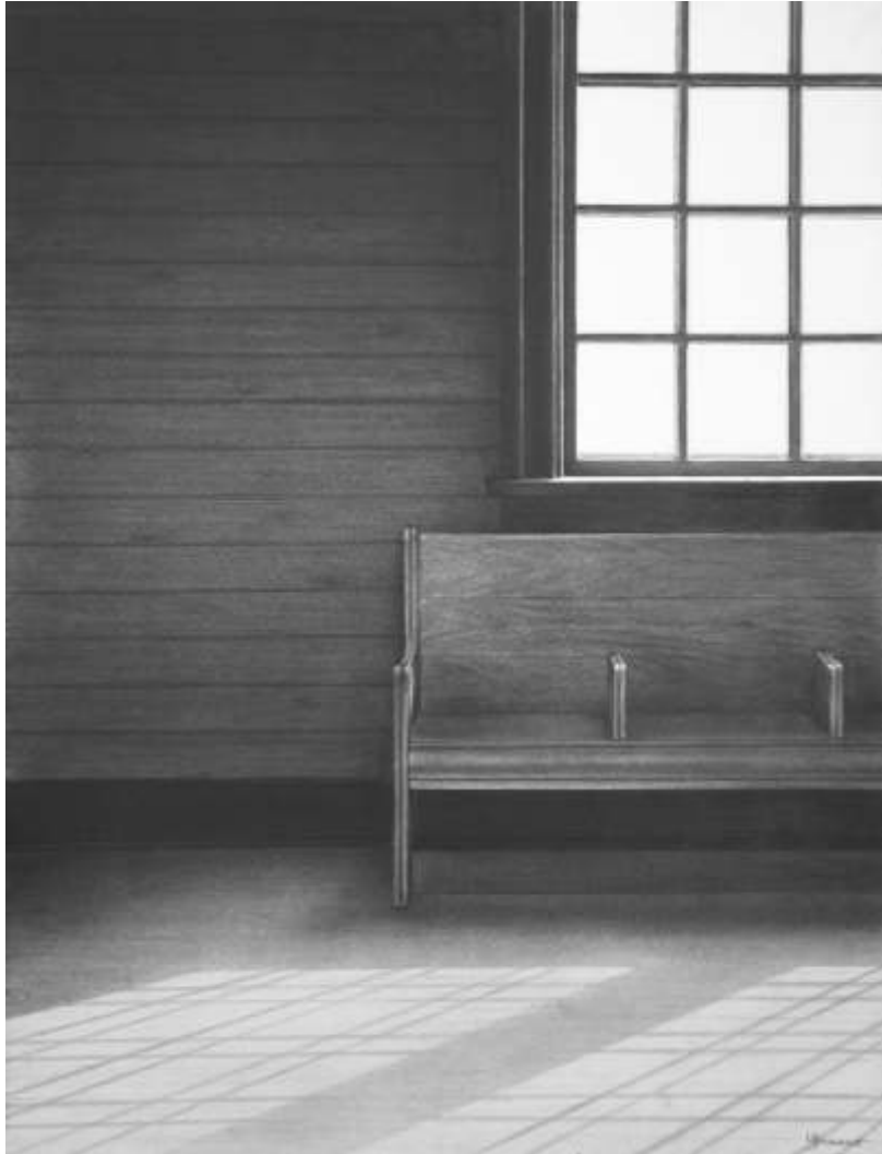
Conversations With Time (After The Journey) charcoal on paper, 29 x 22 inches 2006