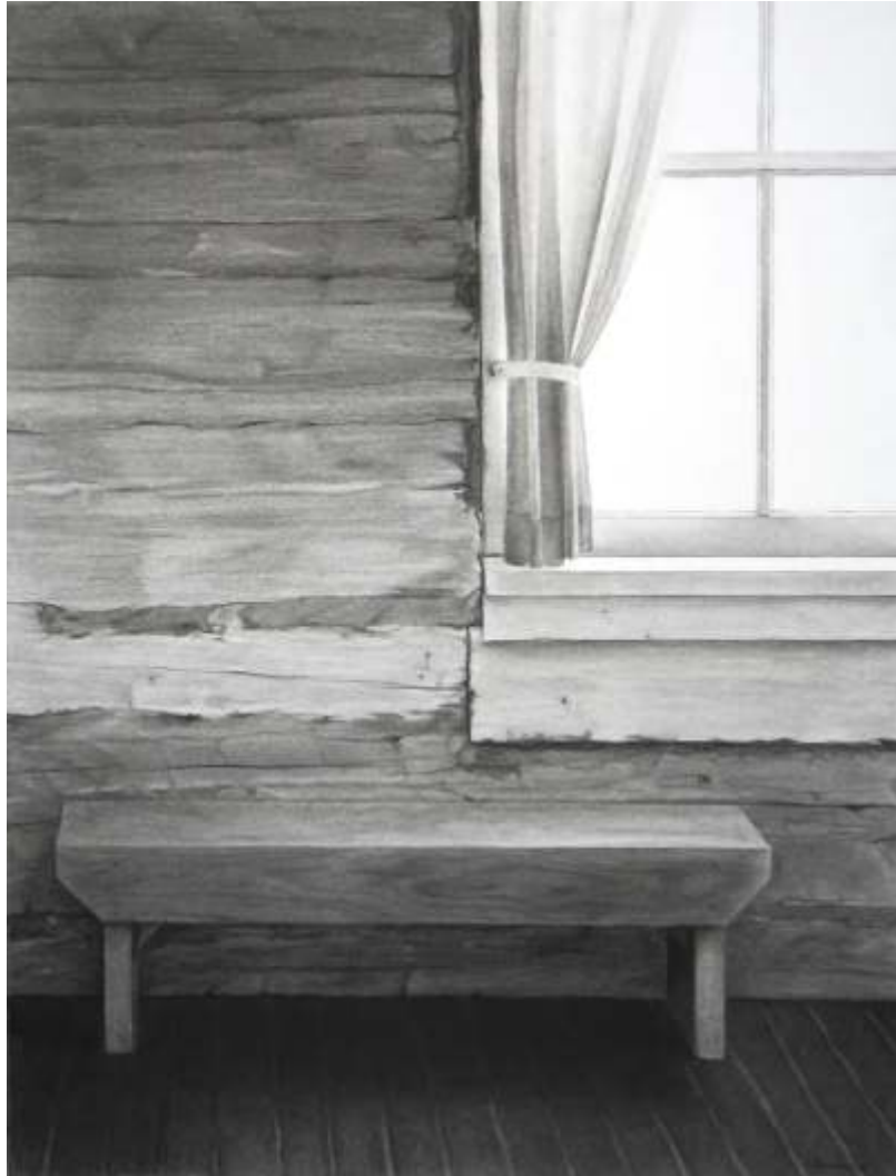
Conversations With Time (After The Recess) charcoal on paper, 29 x 22 inches 2006