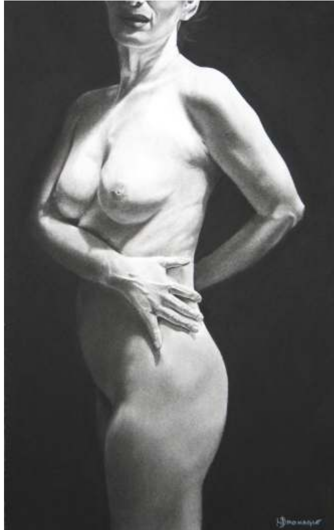
Untitled (Female #13) charcoal on paper, 22 x 14 in 2006