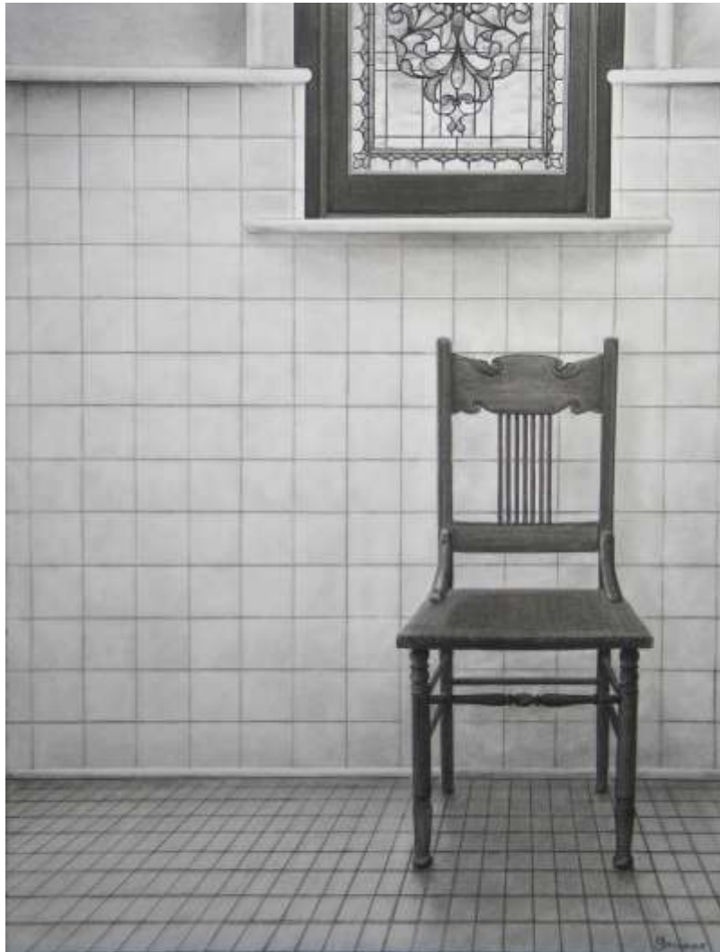
Conversations With Time - The Fulford Chairs (Mabel Ellis) charcoal on paper, 29 x 22 inches 2006