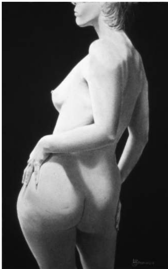
Untitled (Female #10) charcoal on paper, 22 x 14 in 2005