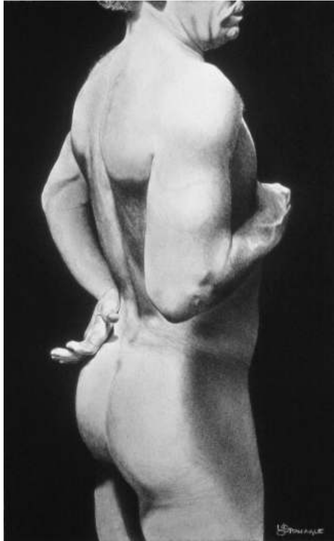
Untitled (Male #9) charcoal on paper, 22 x 14 in 2005