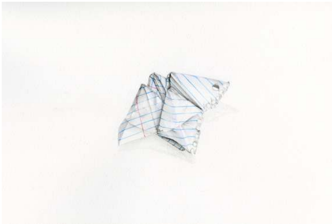
Fortune Teller mixed media on paper, 22 x 30 inches 2006