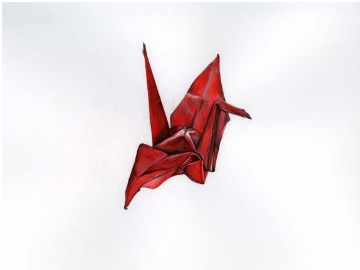
Crane mixed media on paper, 22 x 30 inches 2006