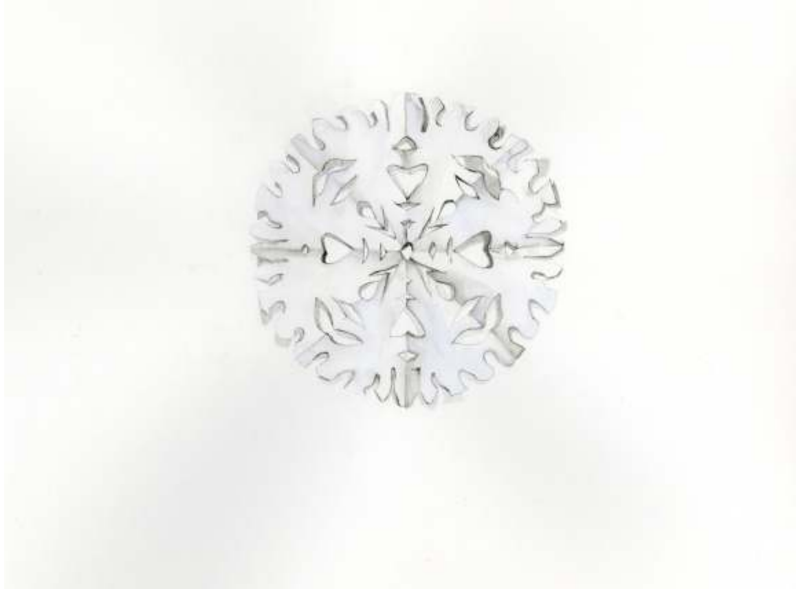
Snowflake mixed media on paper, 22 x 30 inches 2006