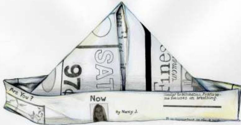
Hat mixed media on paper, 22 x 30 inches 2006