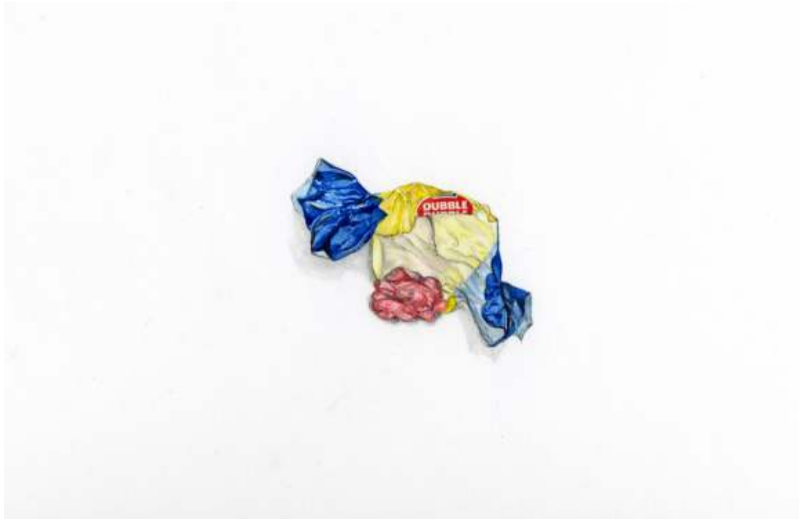
Double Bubble mixed media on paper, 22 x 30 inches 2006