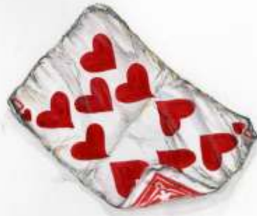
Card mixed media on paper, 22 x 30 inches 2006