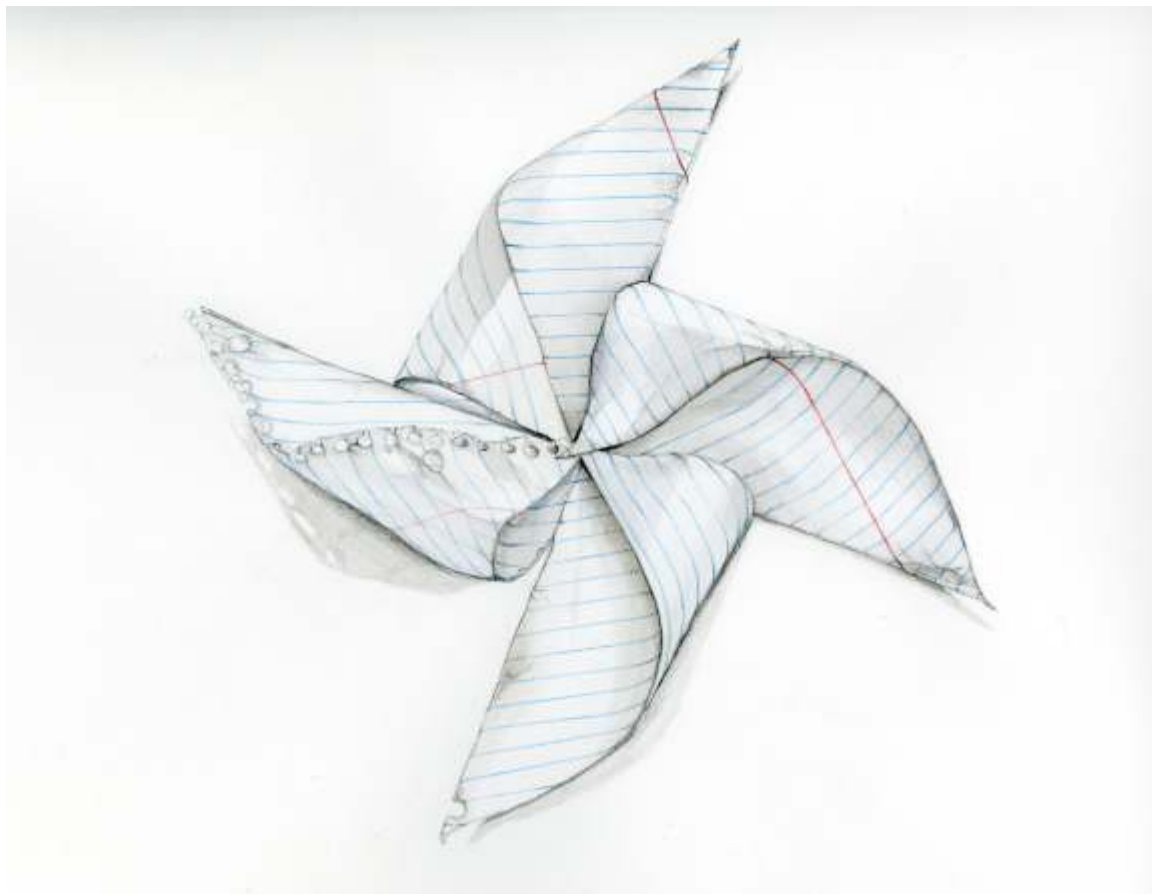
Pinwheel mixed media on paper, 22 x 30 inches 2006