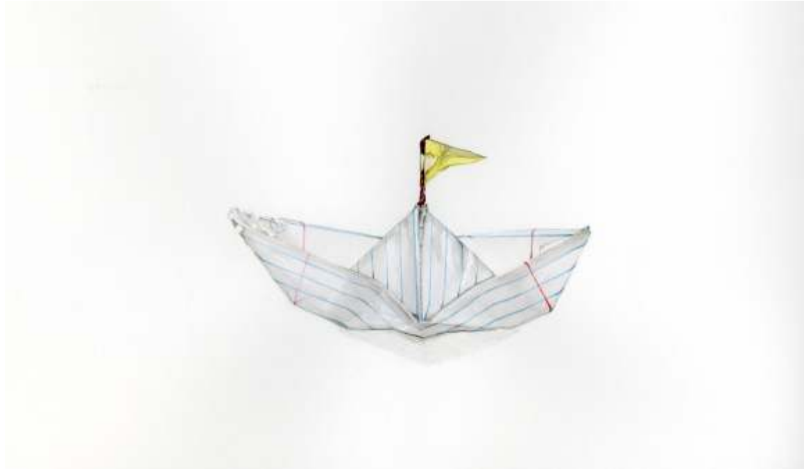
Boat mixed media on paper, 22 x 30 inches 2006