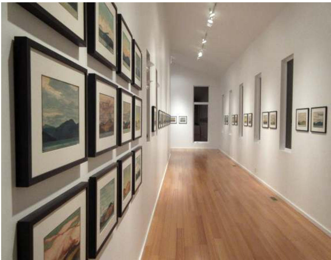
Herald Nix - The Long View Headbones Gallery - Vernon, British Columbia - 2016