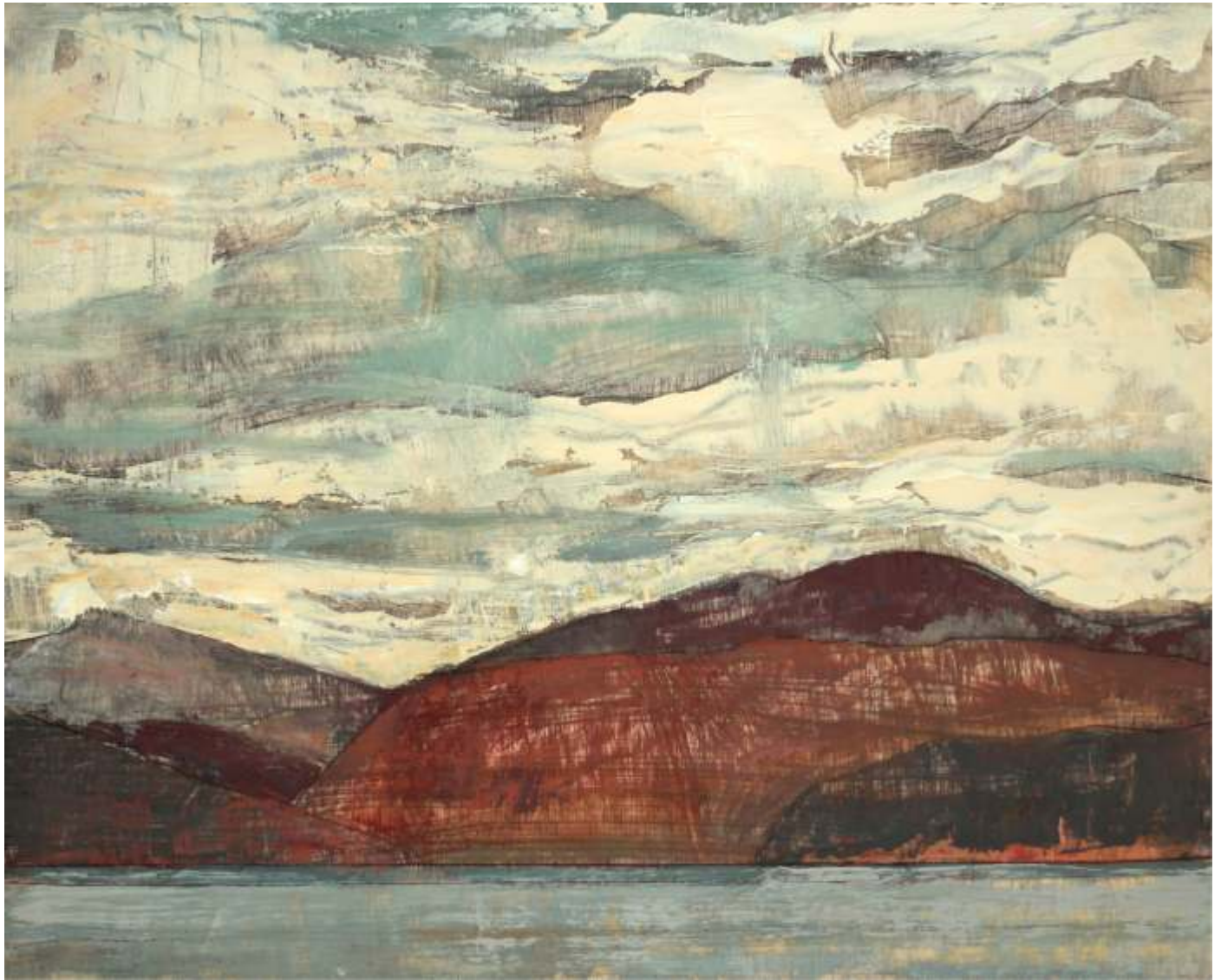
The Long View # 90 - 2016, Oil on panel, 8.5 x 10.5 inches