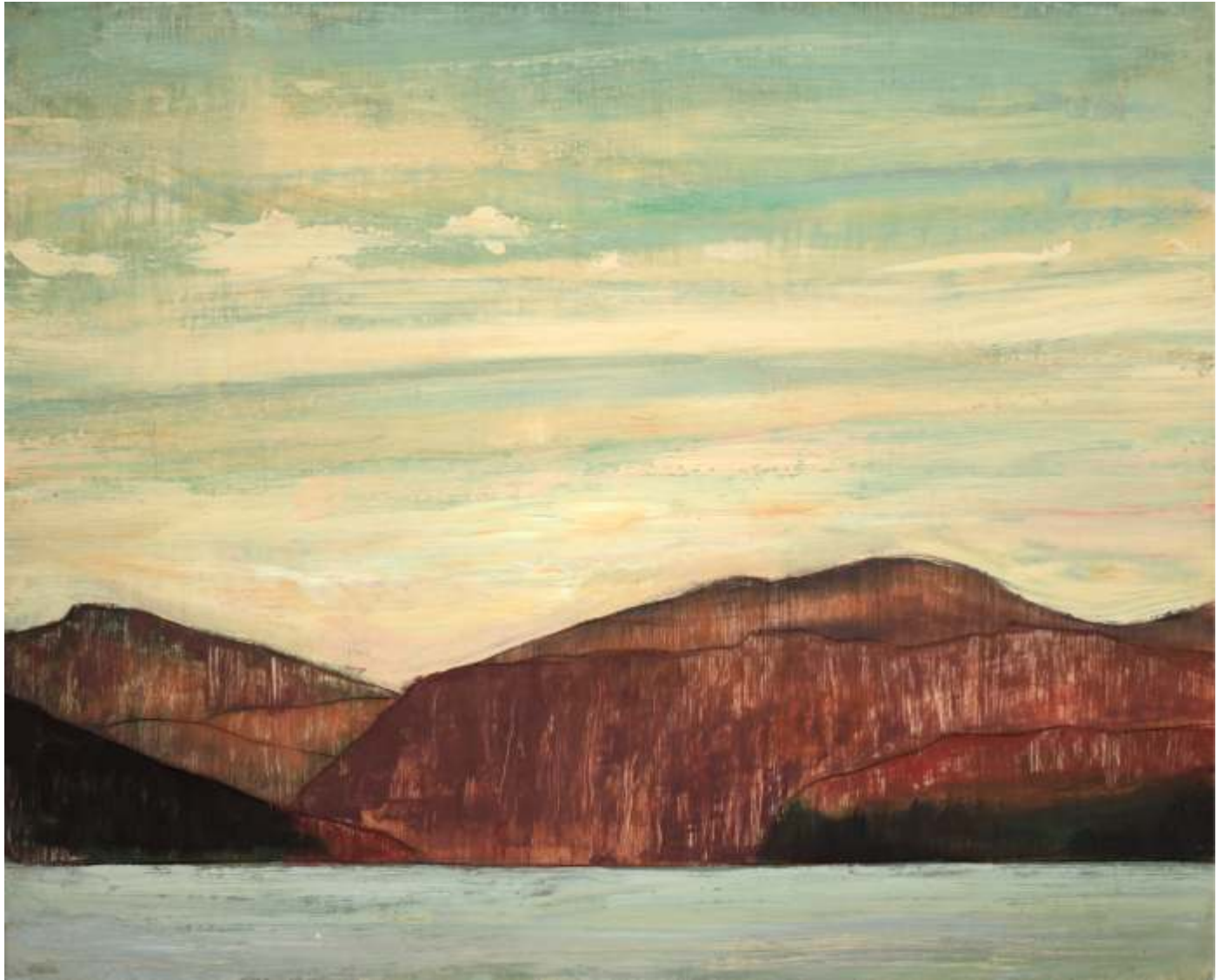
The Long View # 87 - 2016, Oil on panel, 8.5 x 10.5 inches