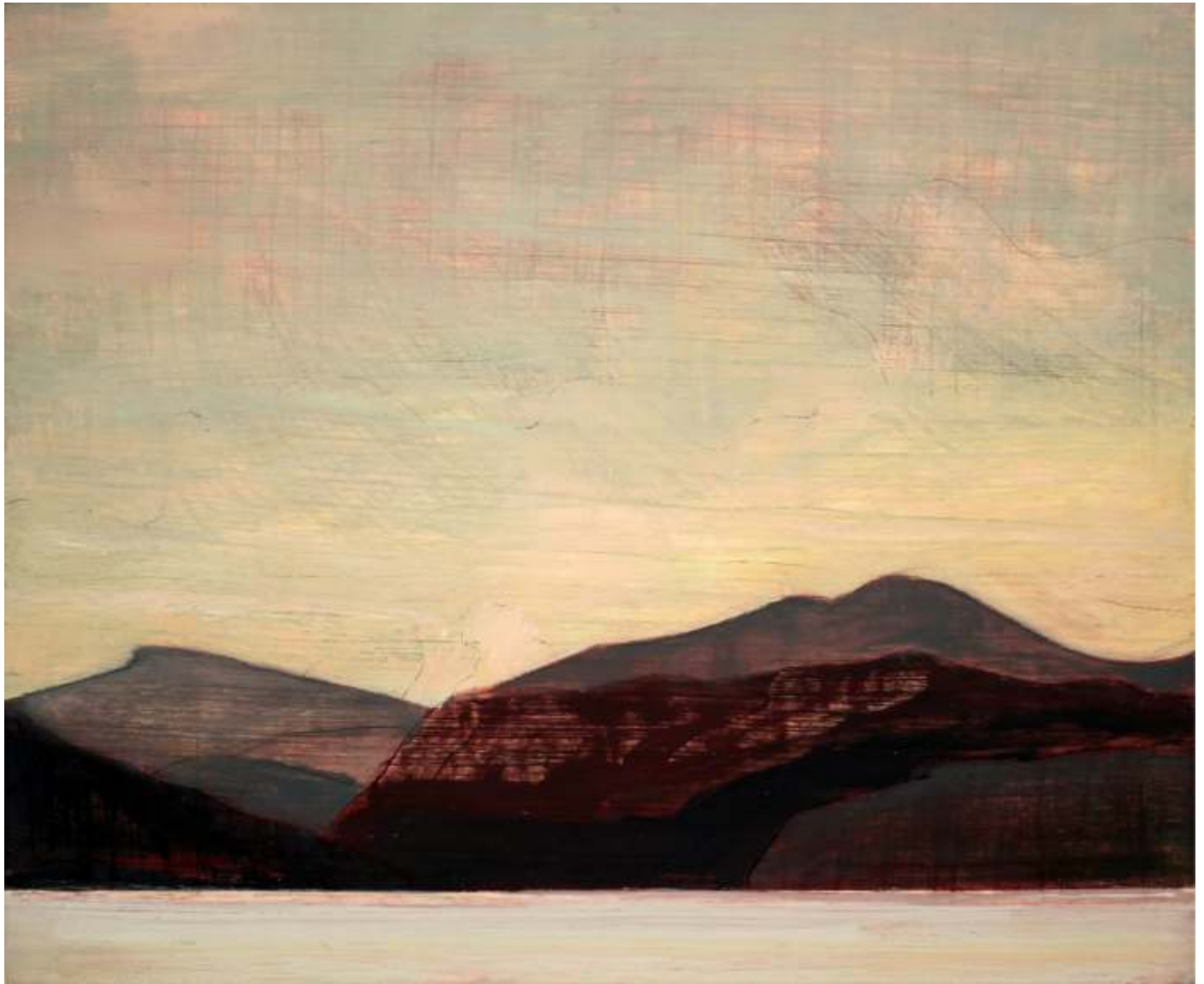
The Long View # 77 - 2016, Oil on panel, 8.5 x 10.5 inches