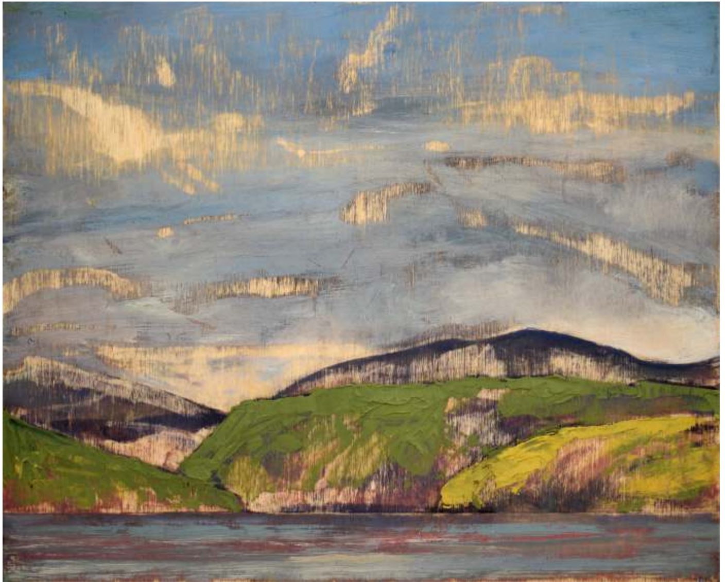
The Long View # 46 - 2015/2016, Oil on panel, 8.5 x 10.5 inches