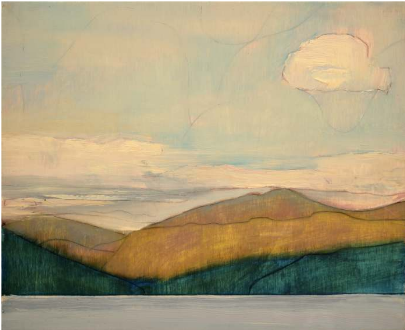
The Long View # 42 - 2015/2016, Oil on panel, 8.5 x 10.5 inches