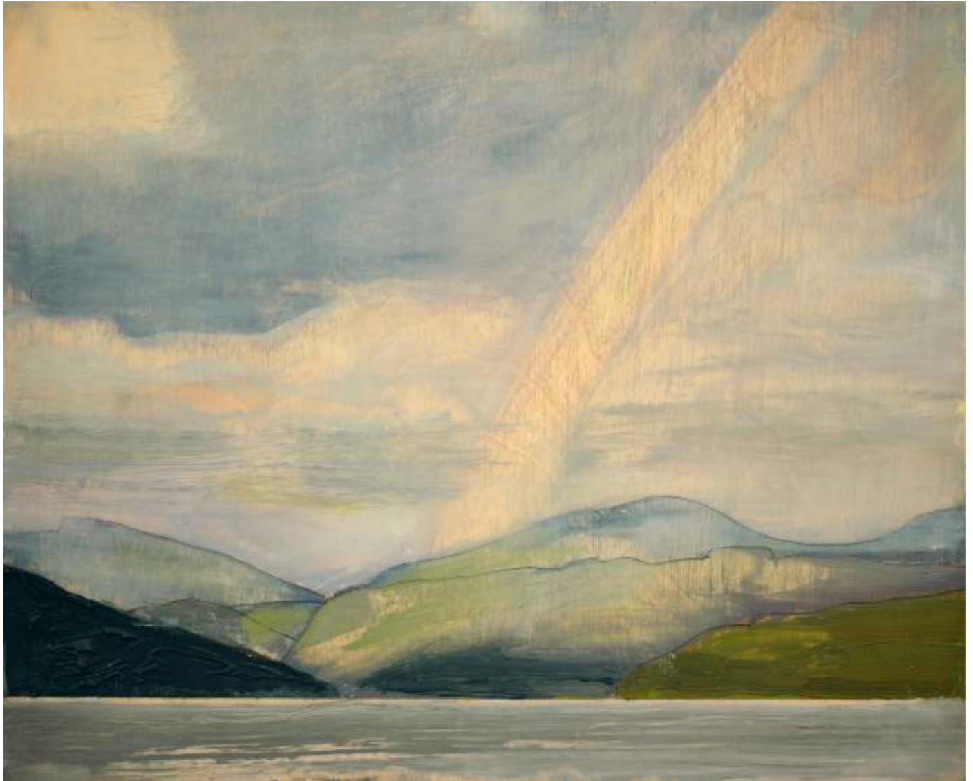
The Long View # 54 - 2015/2016, Oil on panel, 8.5 x 10.5 inches