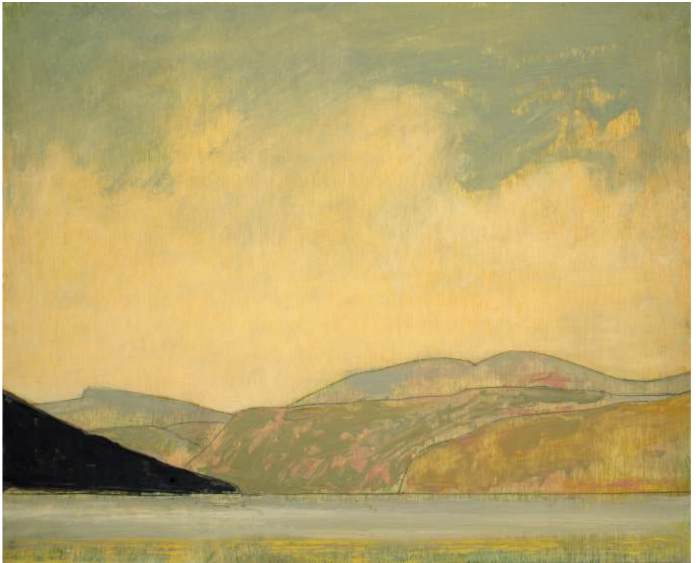
The Long View # 3 - 2015/2016, Oil on panel, 8.5 x 10.5 inches