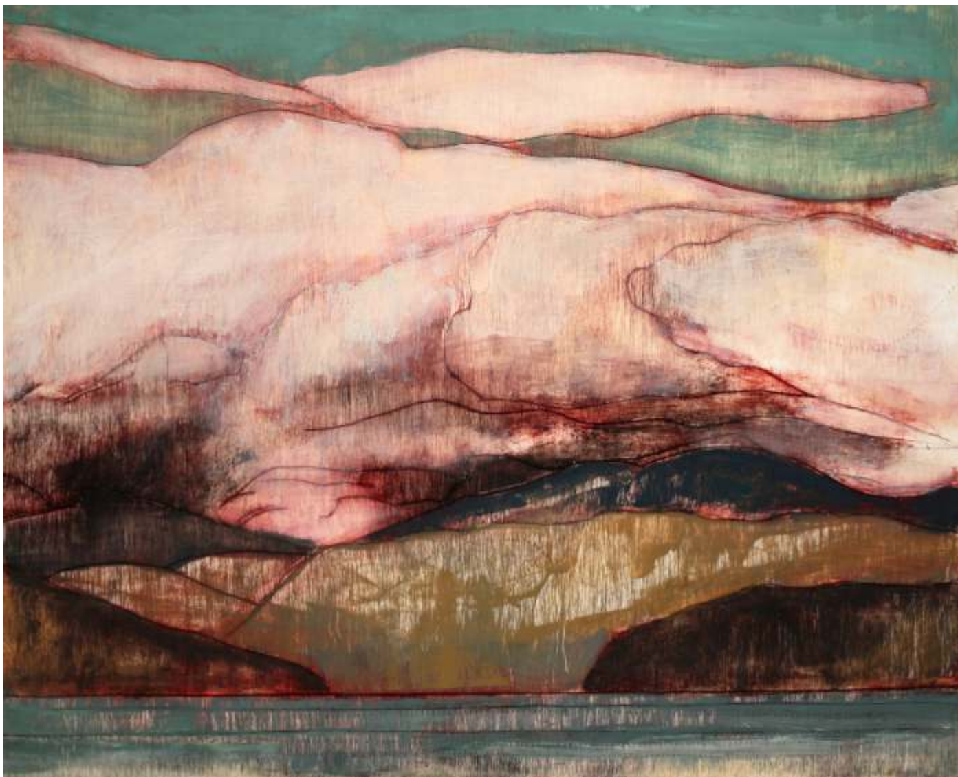
The Long View # 61 - 2016, Oil on panel, 8.5 x 10.5 inches