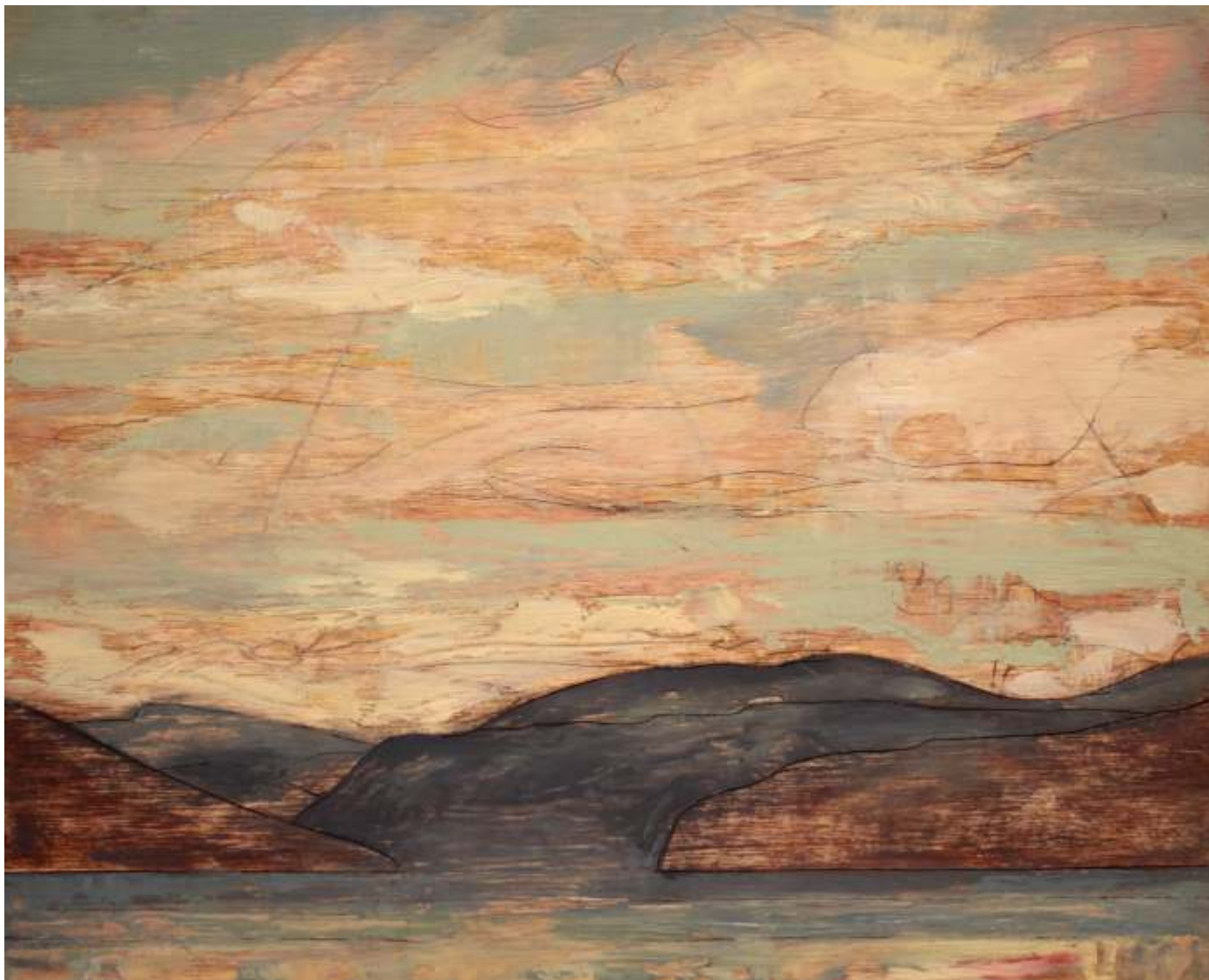
The Long View # 17 - 2015/2016, Oil on panel, 8.5 x 10.5 inches