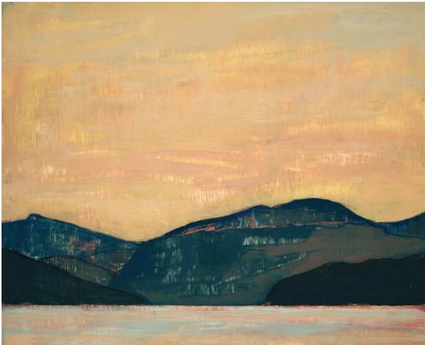
The Long View # 89 - 2016, Oil on panel, 8.5 x 10.5 inches