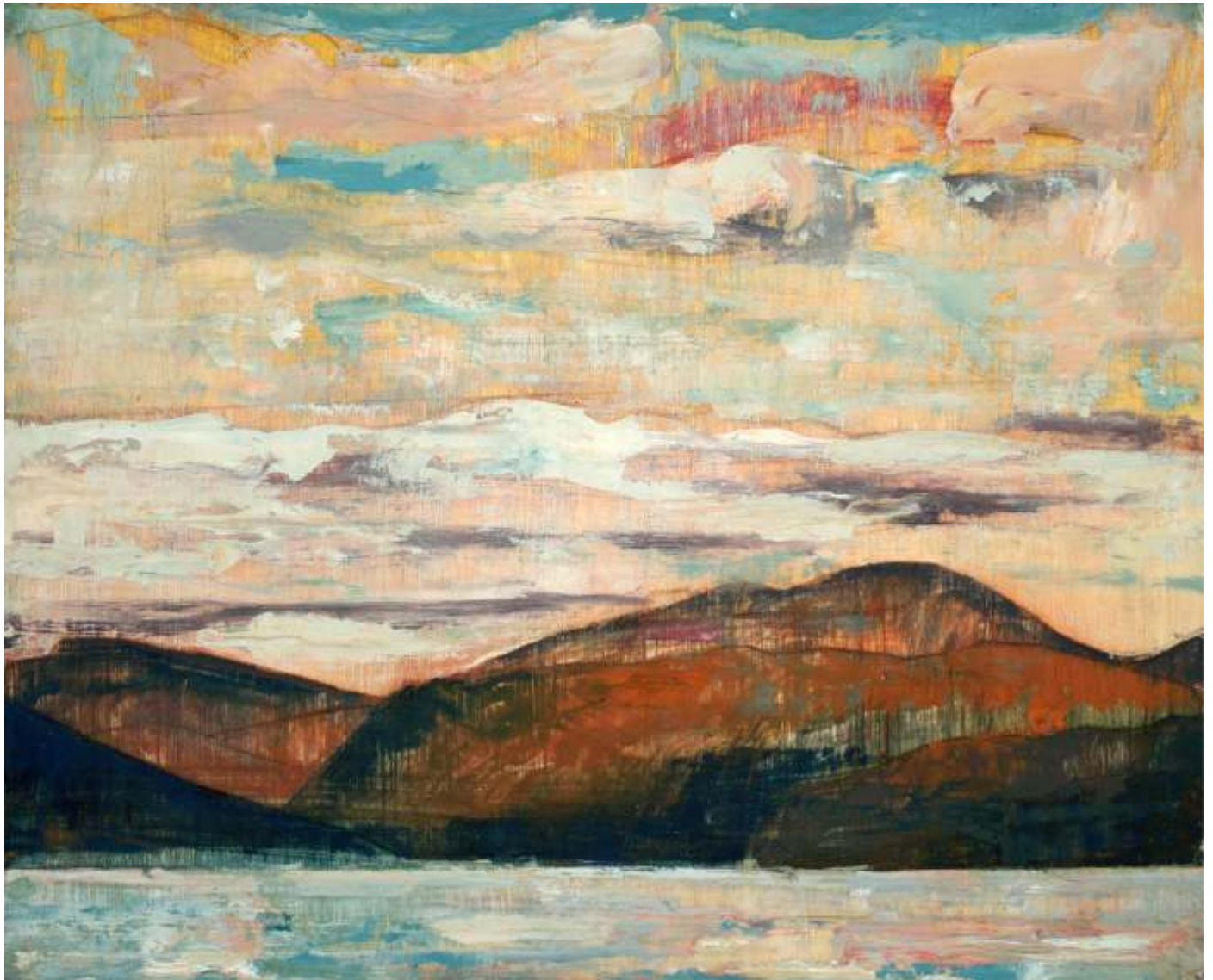
The Long View # 92 - 2016, Oil on panel, 8.5 x 10.5 inches