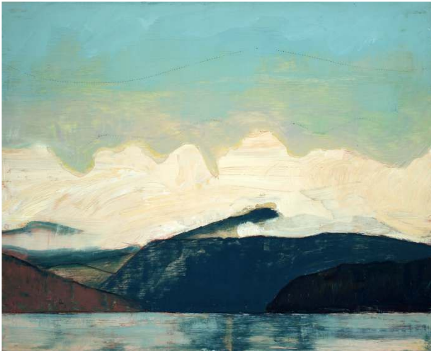
The Long View # 68 - 2016, Oil on panel, 8.5 x 10.5 inches