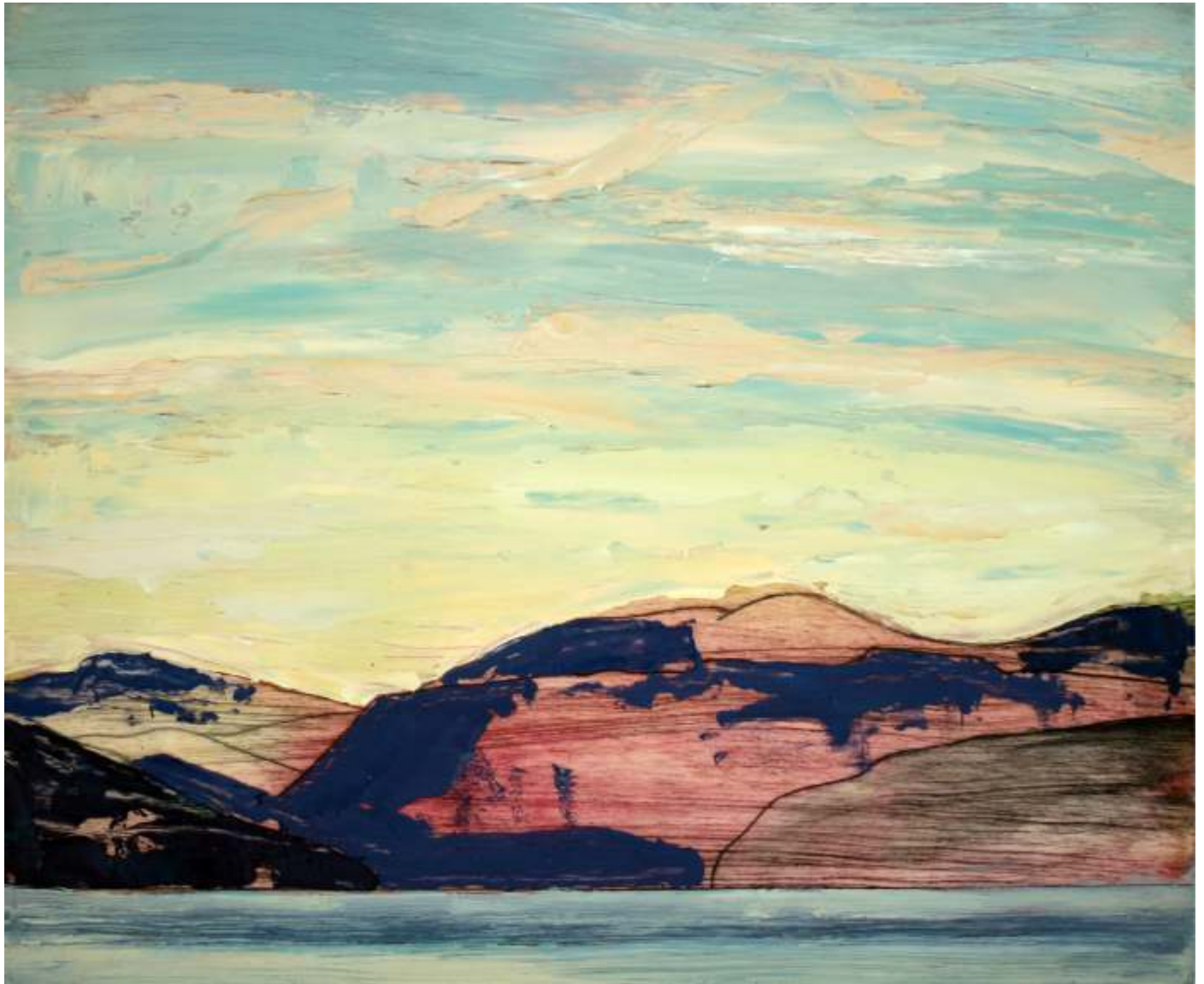
The Long View # 80 - 2016, Oil on panel, 9.5 x 11.5 inches