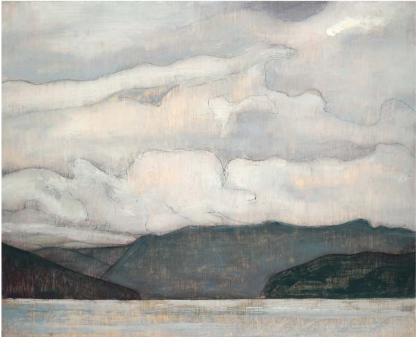
The Long View # 93 - 2016, Oil on panel, 8.5 x 10.5 inches