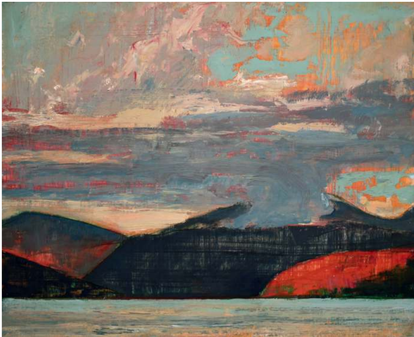
The Long View # 67 - 2016, Oil on panel, 8.5 x 10.5 inches