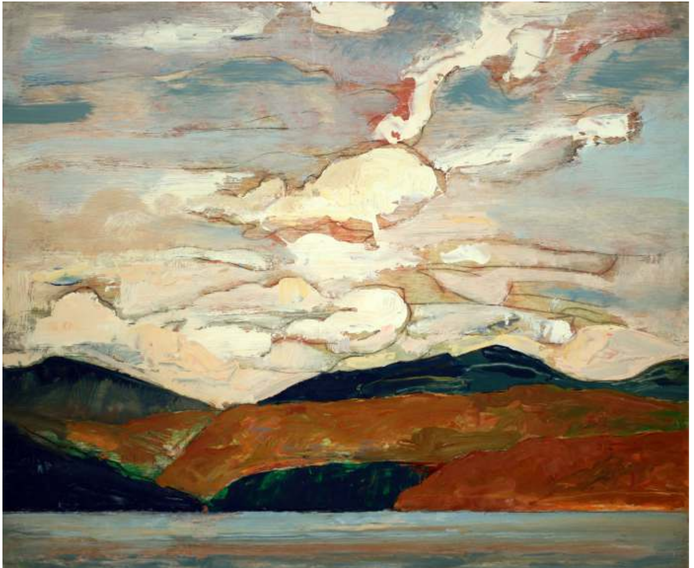
The Long View # 75 - 2016, Oil on panel, 9.5 x 11.5 inches