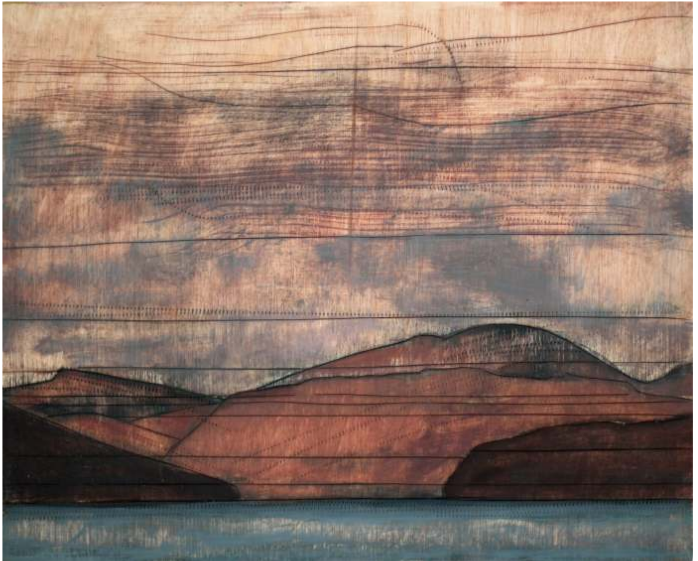
The Long View # 66 - 2016, Oil on panel, 8.5 x 10.5 inches