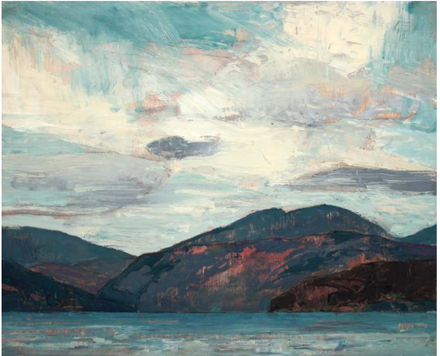
The Long View # 94 - 2016, Oil on panel, 8.5 x 10.5 inches