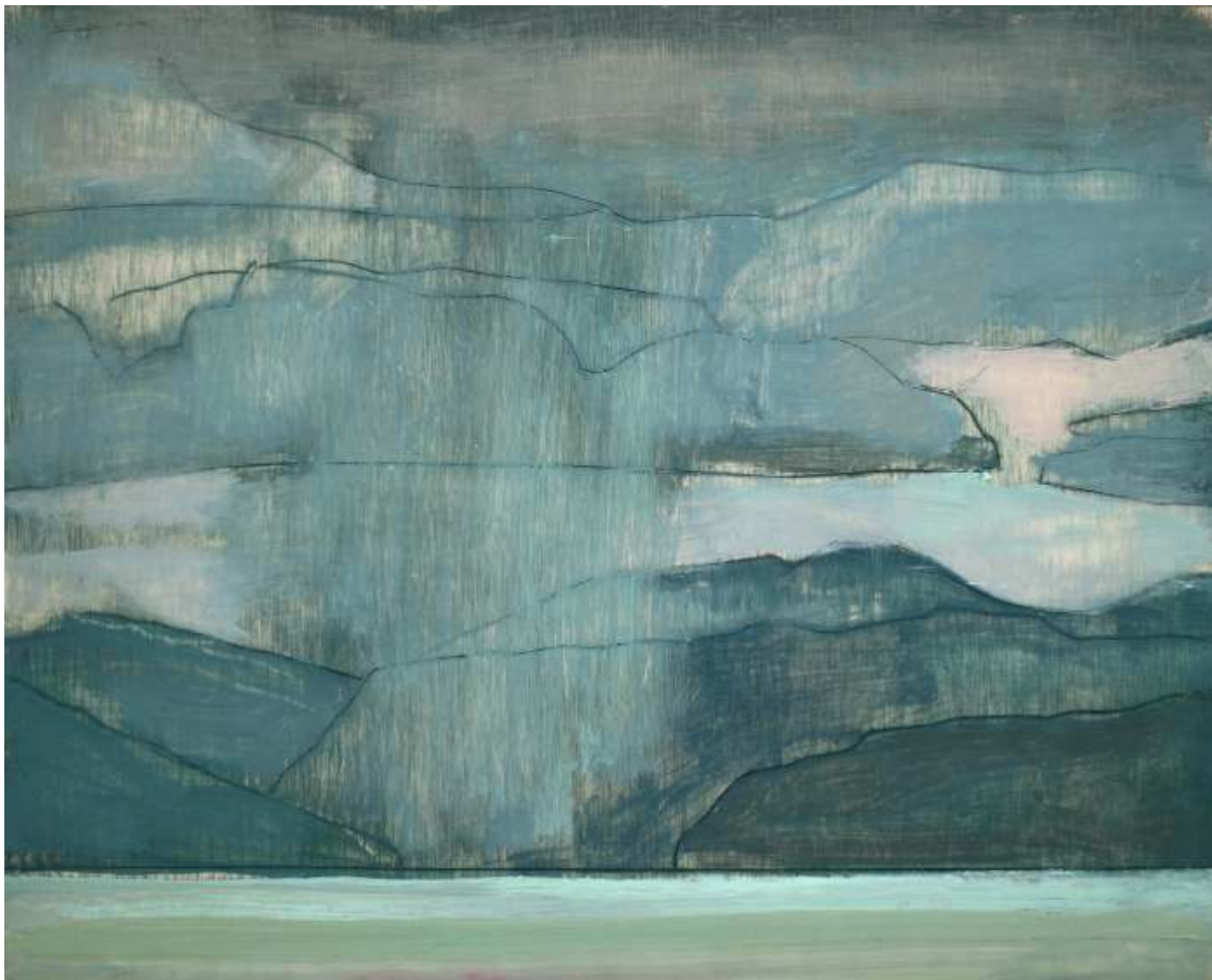
The Long View # 74 - 2016, Oil on panel, 8.5 x 10.5 inches