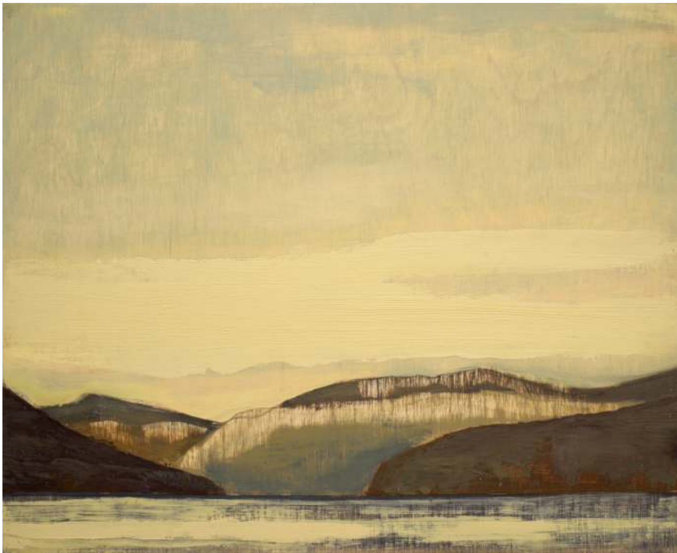
The Long View # 41 - 2015/2016, Oil on panel, 8.5 x 10.5 inches