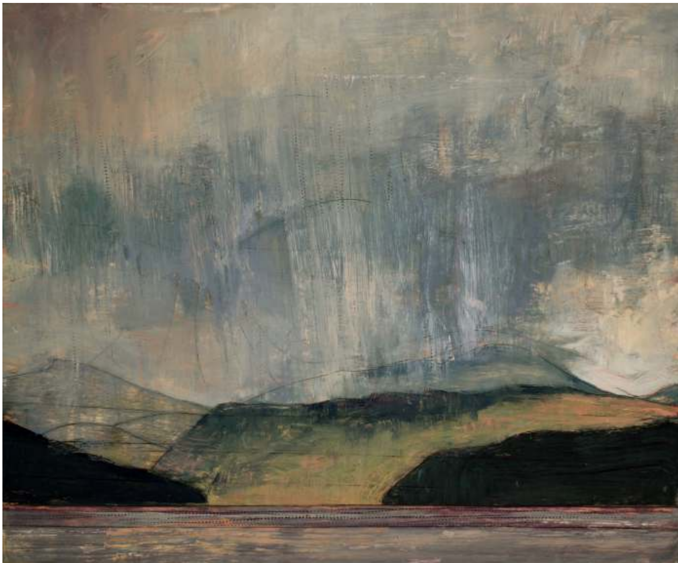
The Long View # 82 - 2016, Oil on panel, 9.5 x 11.5 inches