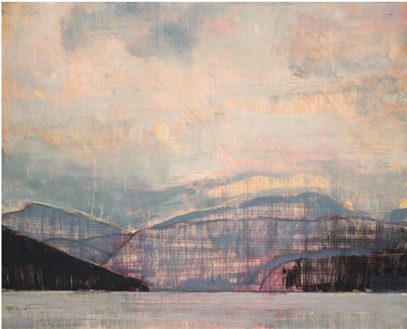
The Long View # 88 - 2016, Oil on panel, 8.5 x 10.5 inches