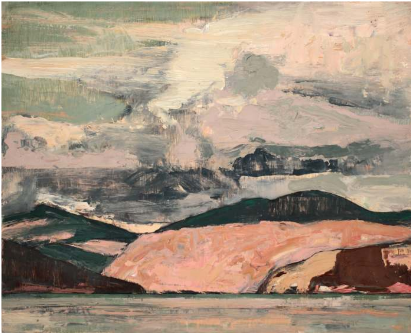
The Long View # 84 - 2016, Oil on panel, 8.5 x 10.5 inches