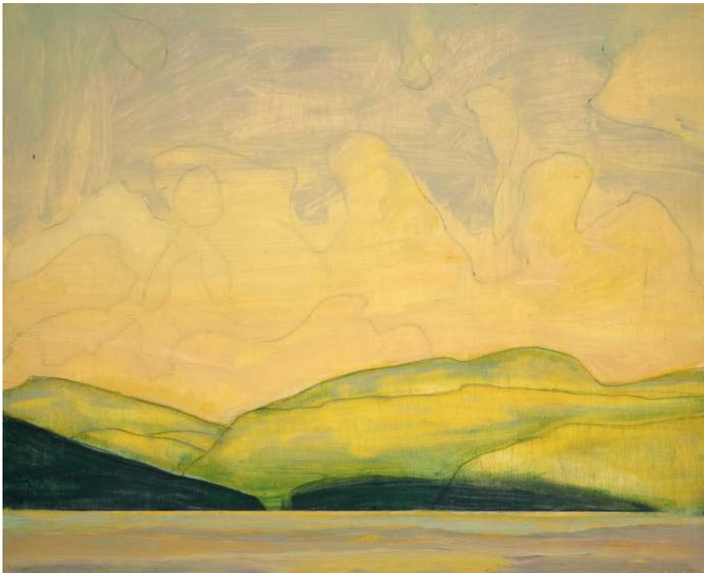
The Long View # 40 - 2015/2016, Oil on panel, 8.5 x 10.5 inches