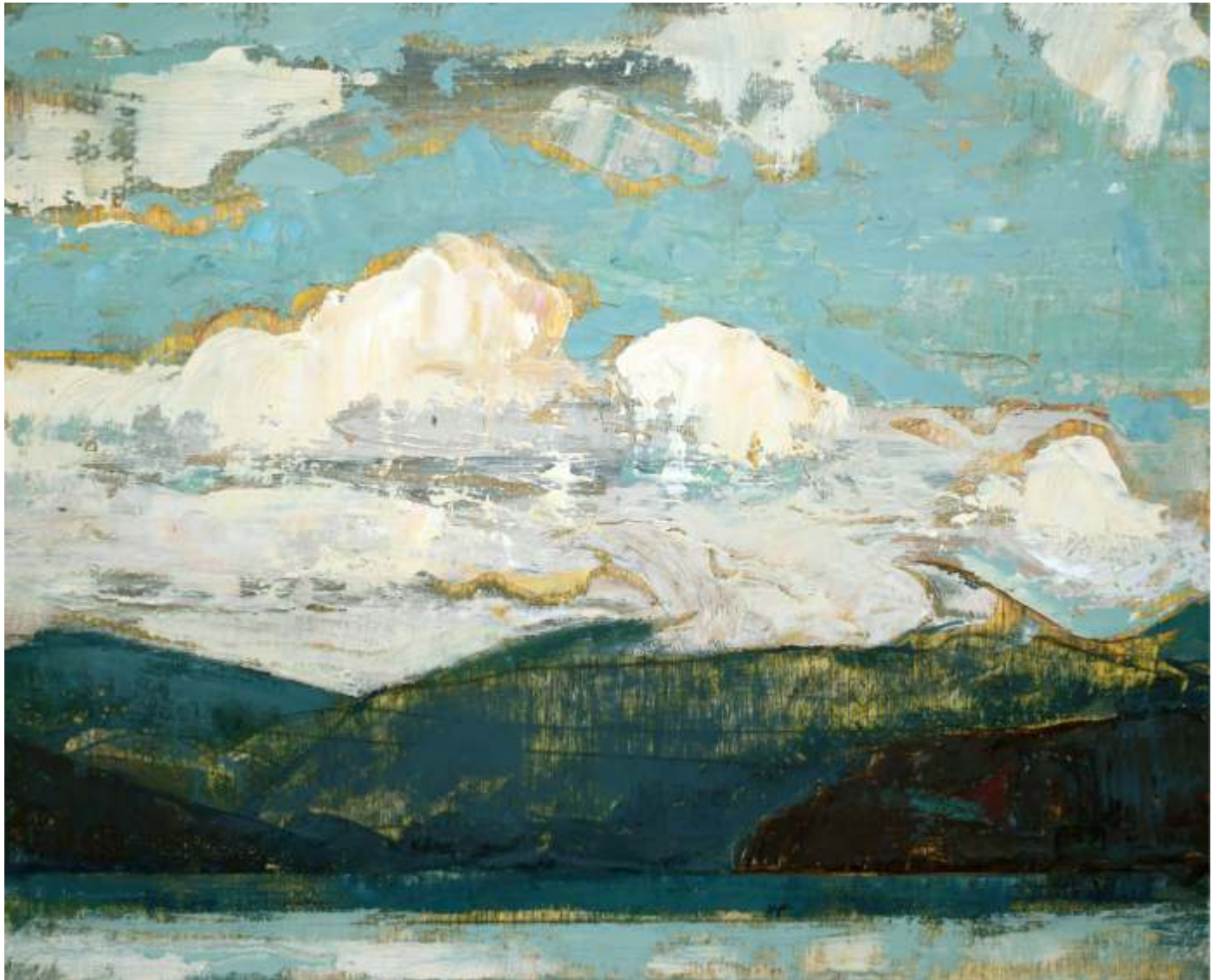
The Long View # 72 - 2016, Oil on panel, 8.5 x 10.5 inches