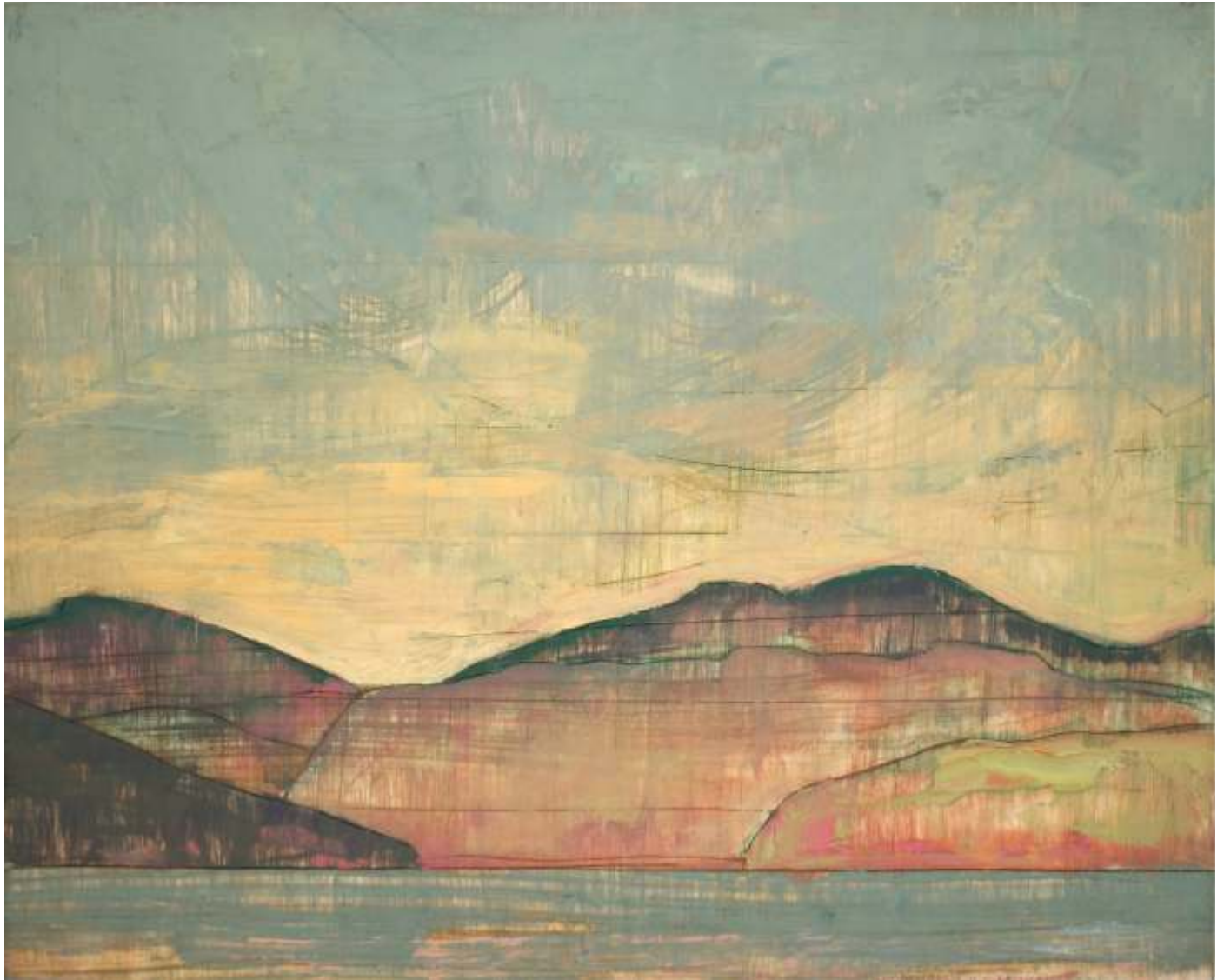
The Long View # 65 - 2016, Oil on panel, 8.5 x 10.5 inches