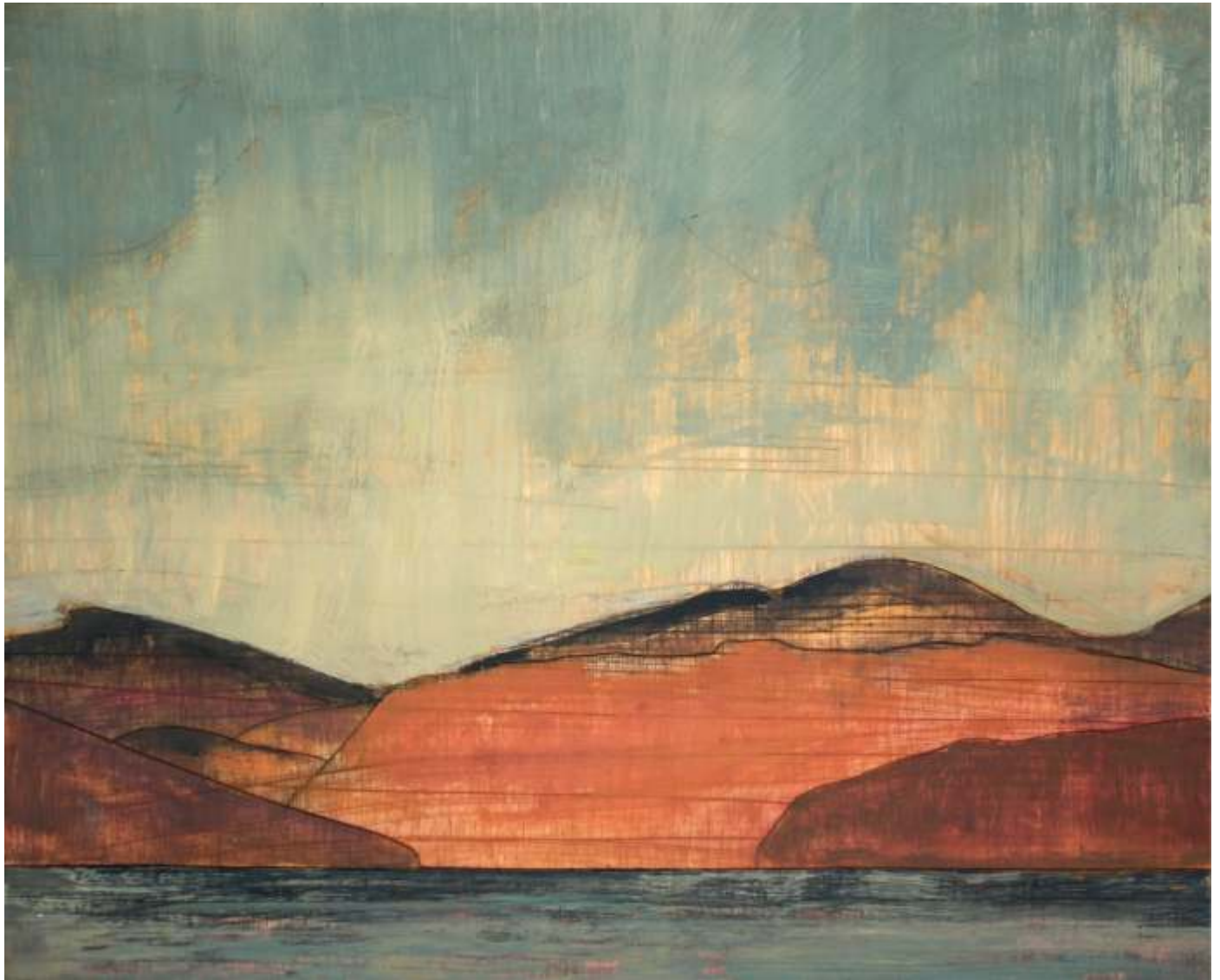
The Long View # 63 - 2016, Oil on panel, 8.5 x 10.5 inches