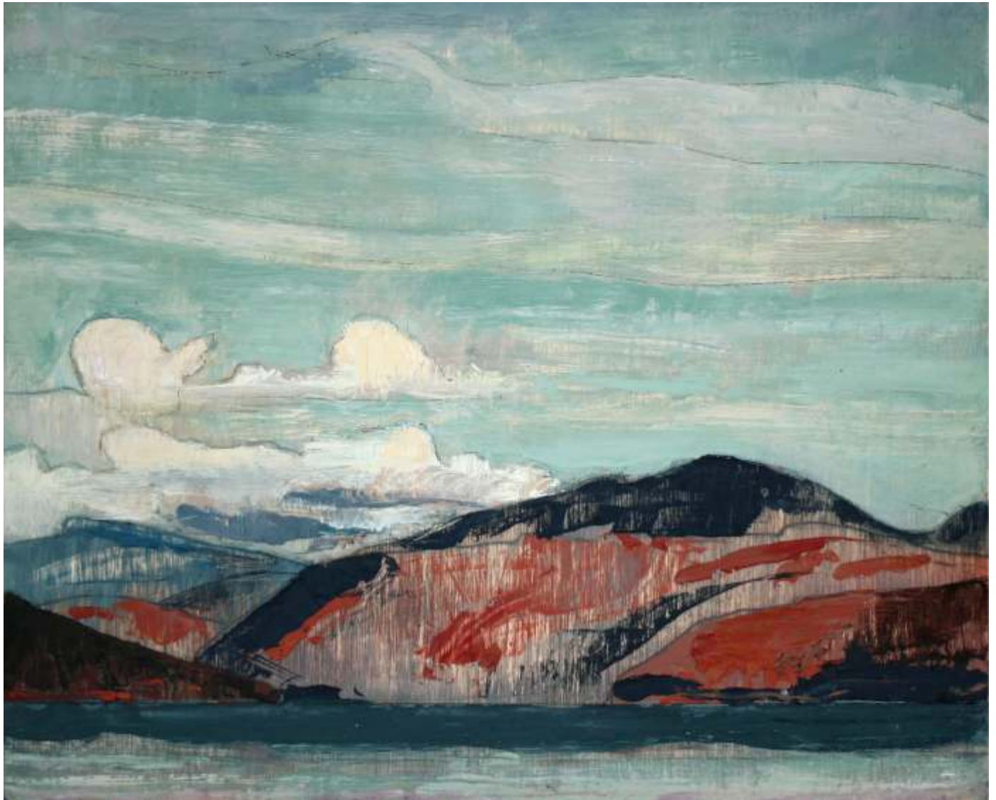
The Long View # 71 - 2016, Oil on panel, 8.5 x 10.5 inches