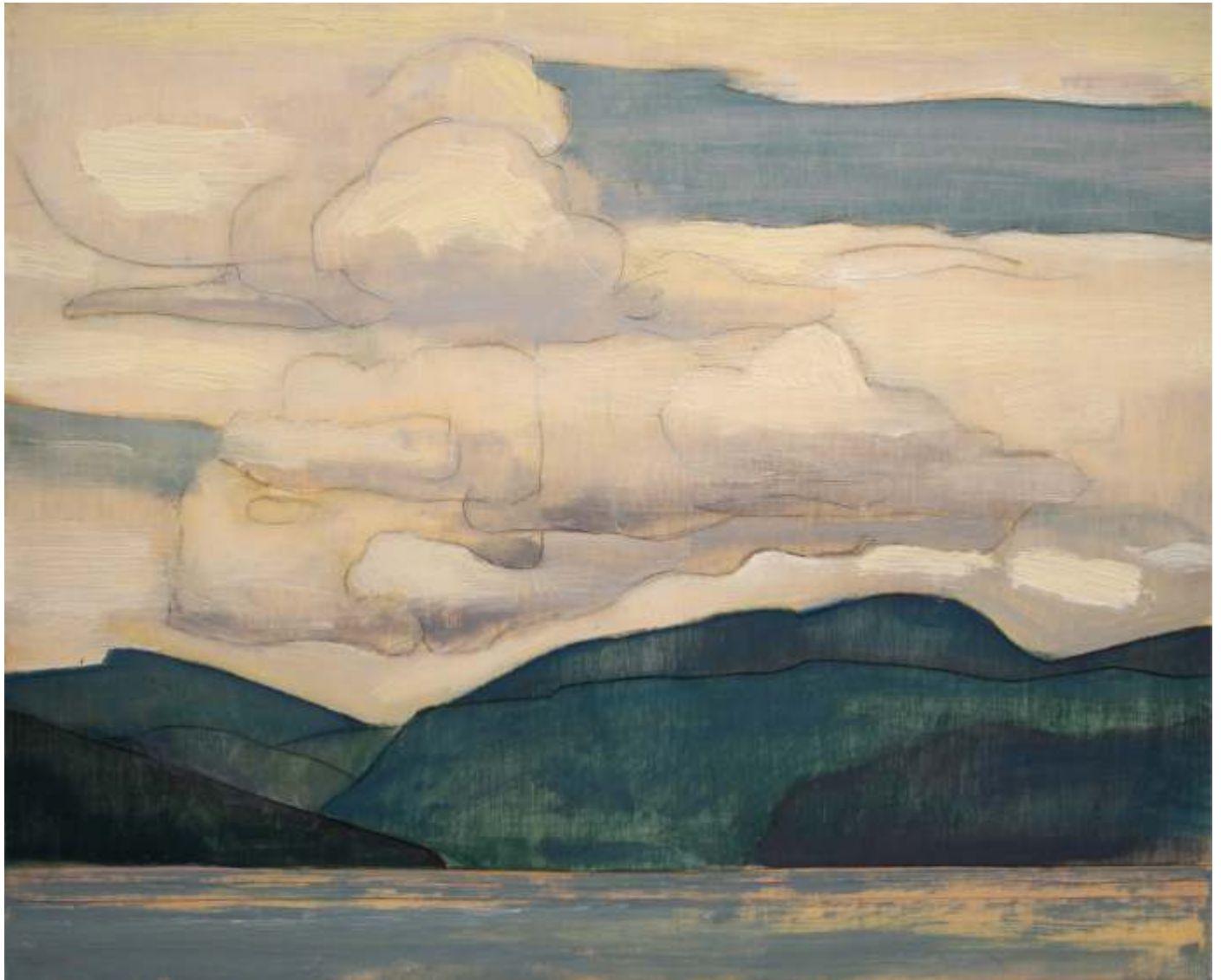
The Long View # 4 - 2015/2016, Oil on panel, 8.5 x 10.5 inches