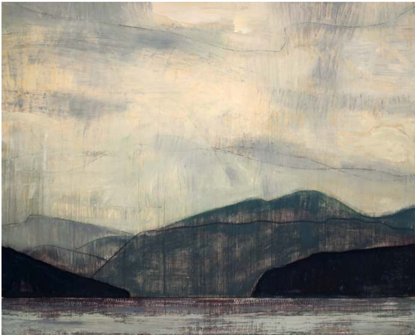
The Long View # 86 - 2016, Oil on panel, 8.5 x 10.5 inches