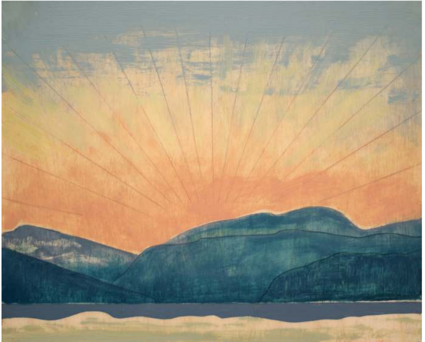
The Long View # 11 - 2015/2016, Oil on panel, 8.5 x 10.5 inches