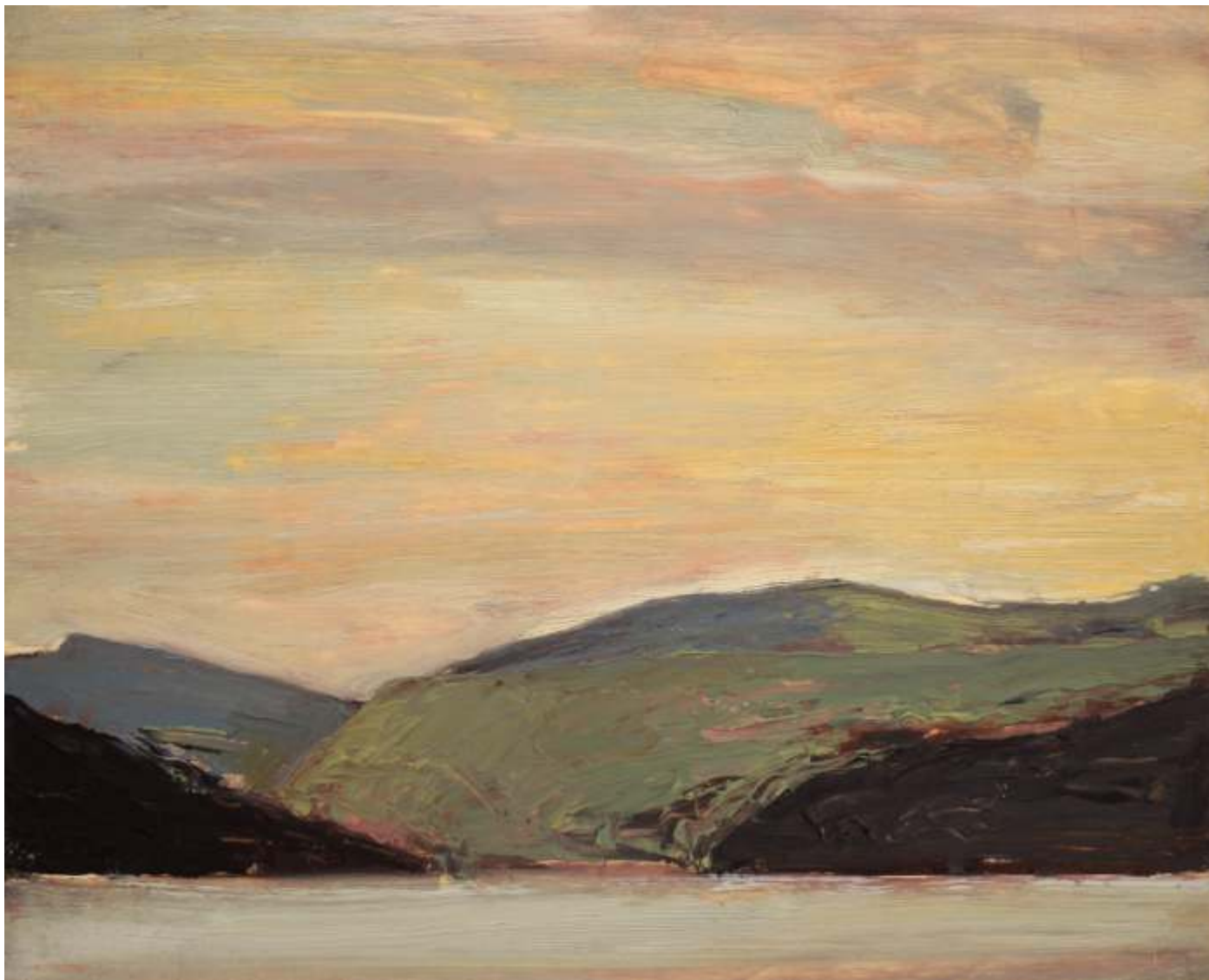
The Long View # 36 - 2015/2016, Oil on panel, 8.5 x 10.5 inches