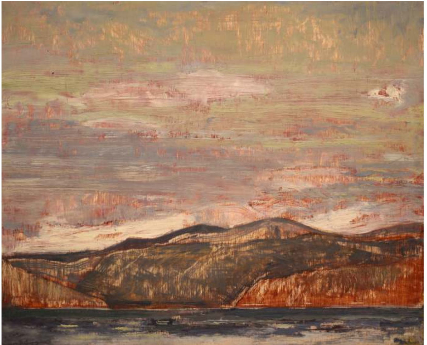
The Long View # 21 - 2015/2016, Oil on panel, 8.5 x 10.5 inches