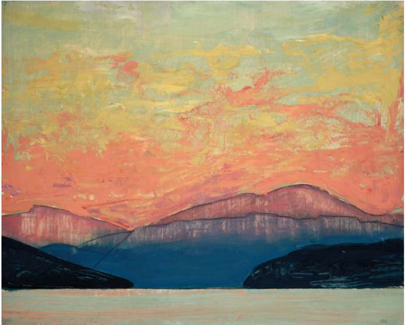
The Long View # 73 - 2016, Oil on panel, 8.5 x 10.5 inches