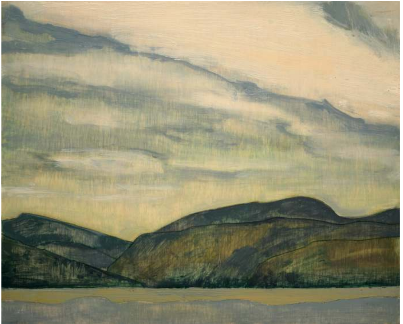
The Long View # 6 - 2015/2016, Oil on panel, 8.5 x 10.5 inches