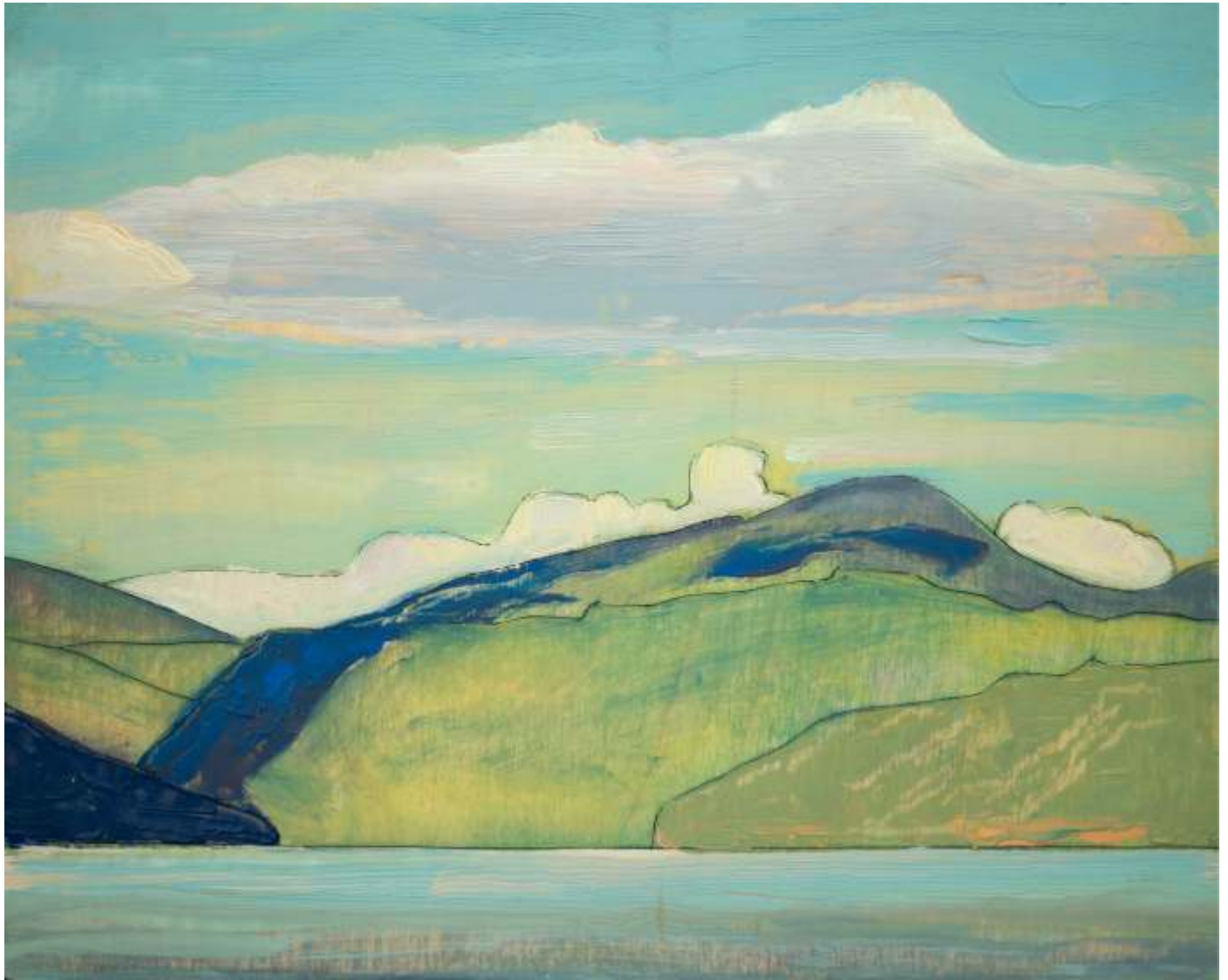
The Long View # 58 - 2015/2016, Oil on panel, 8.5 x 10.5 inches