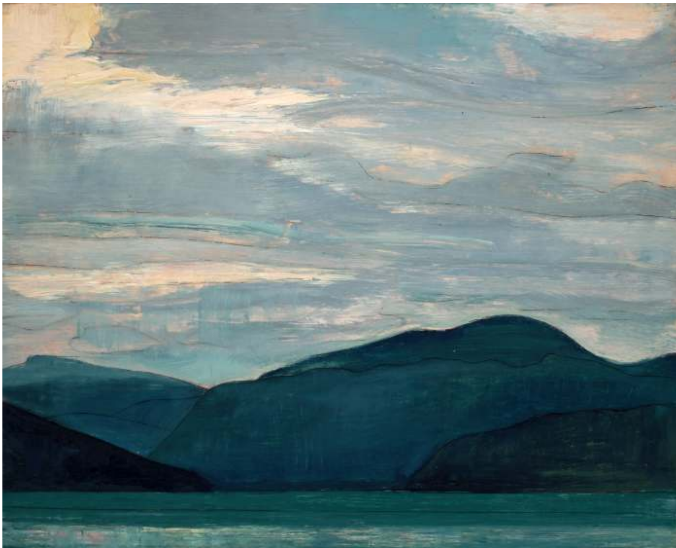
The Long View # 69 - 2016, Oil on panel, 8.5 x 10.5 inches