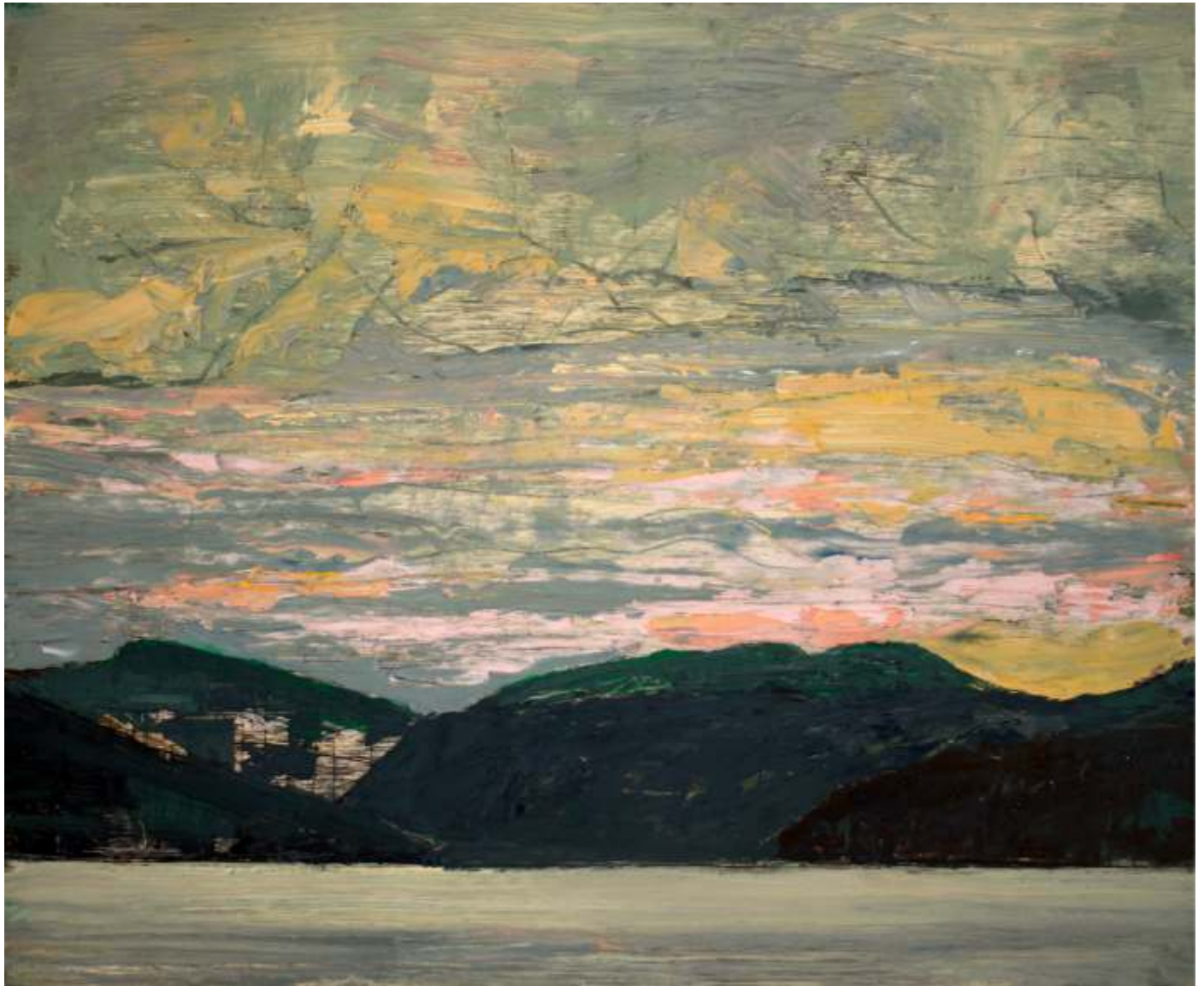
The Long View # 78 - 2016, Oil on panel, 9.5 x 11.5 inches