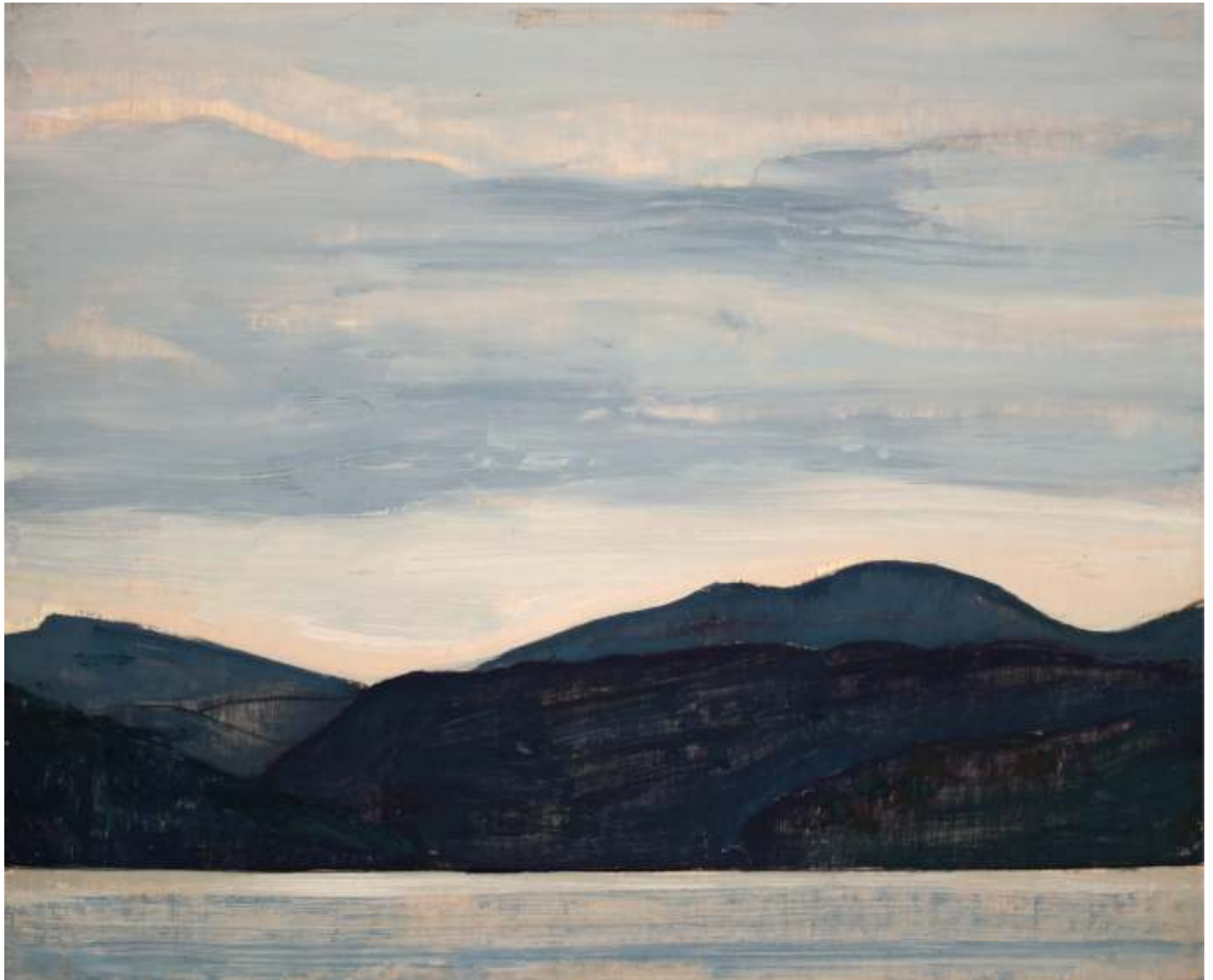
The Long View # 91 - 2016, Oil on panel, 8.5 x 10.5 inches