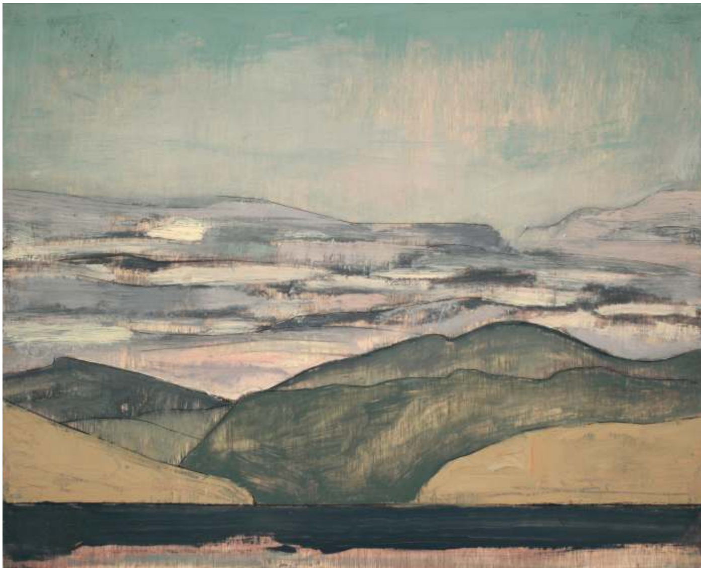
The Long View # 85 - 2016, Oil on panel, 8.5 x 10.5 inches