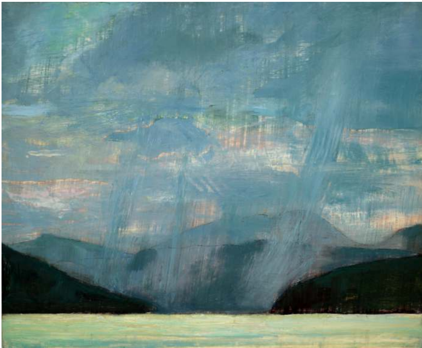
The Long View # 62 - 2016, Oil on panel, 9.5 x 11.5 inches