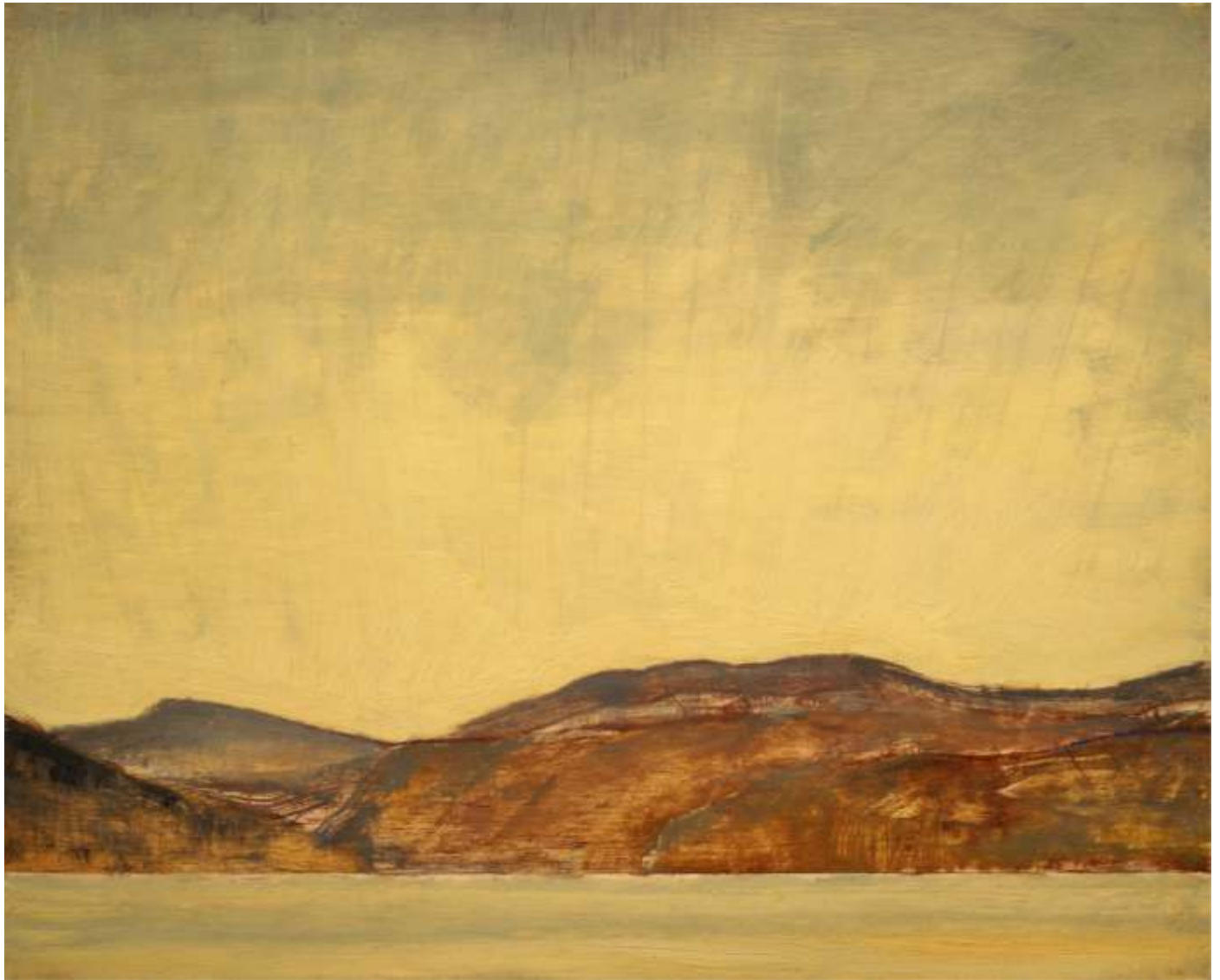
The Long View # 33 - 2015/2016, Oil on panel, 8.5 x 10.5 inches