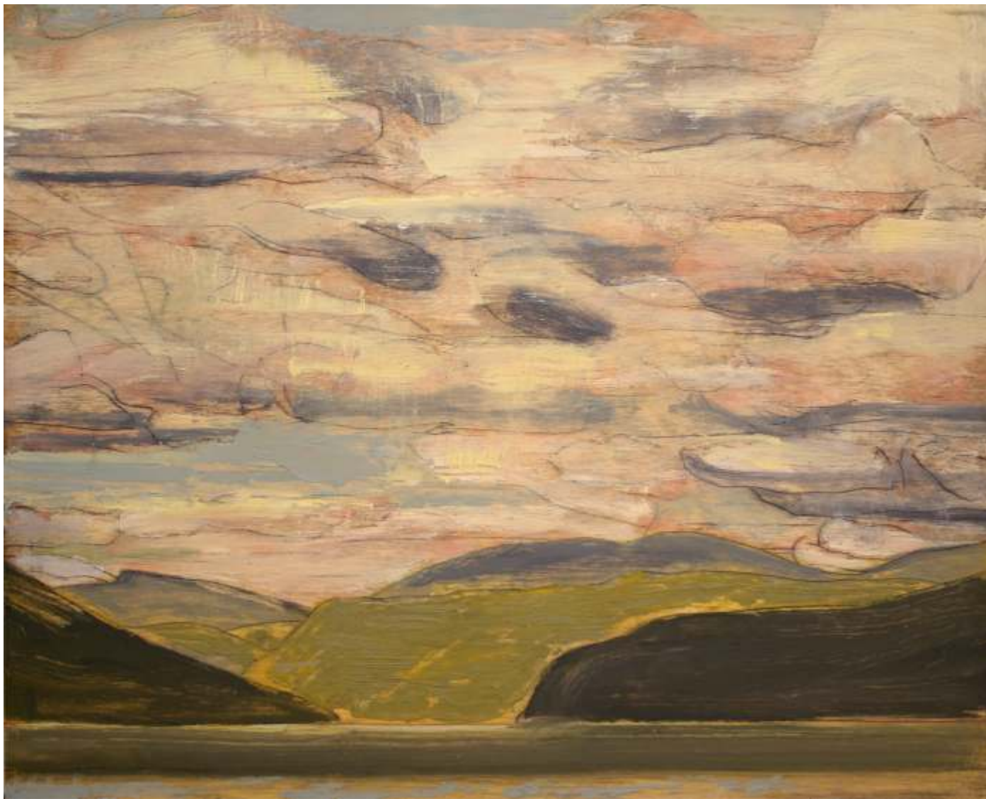
The Long View # 18 - 2015/2016, Oil on panel, 8.5 x 10.5 inches