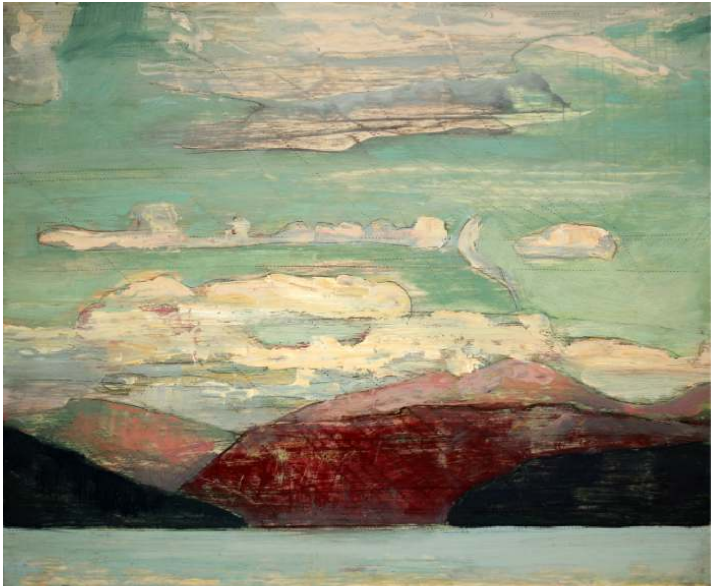
The Long View # 81 - 2016, Oil on panel, 9.5 x 11.5 inches