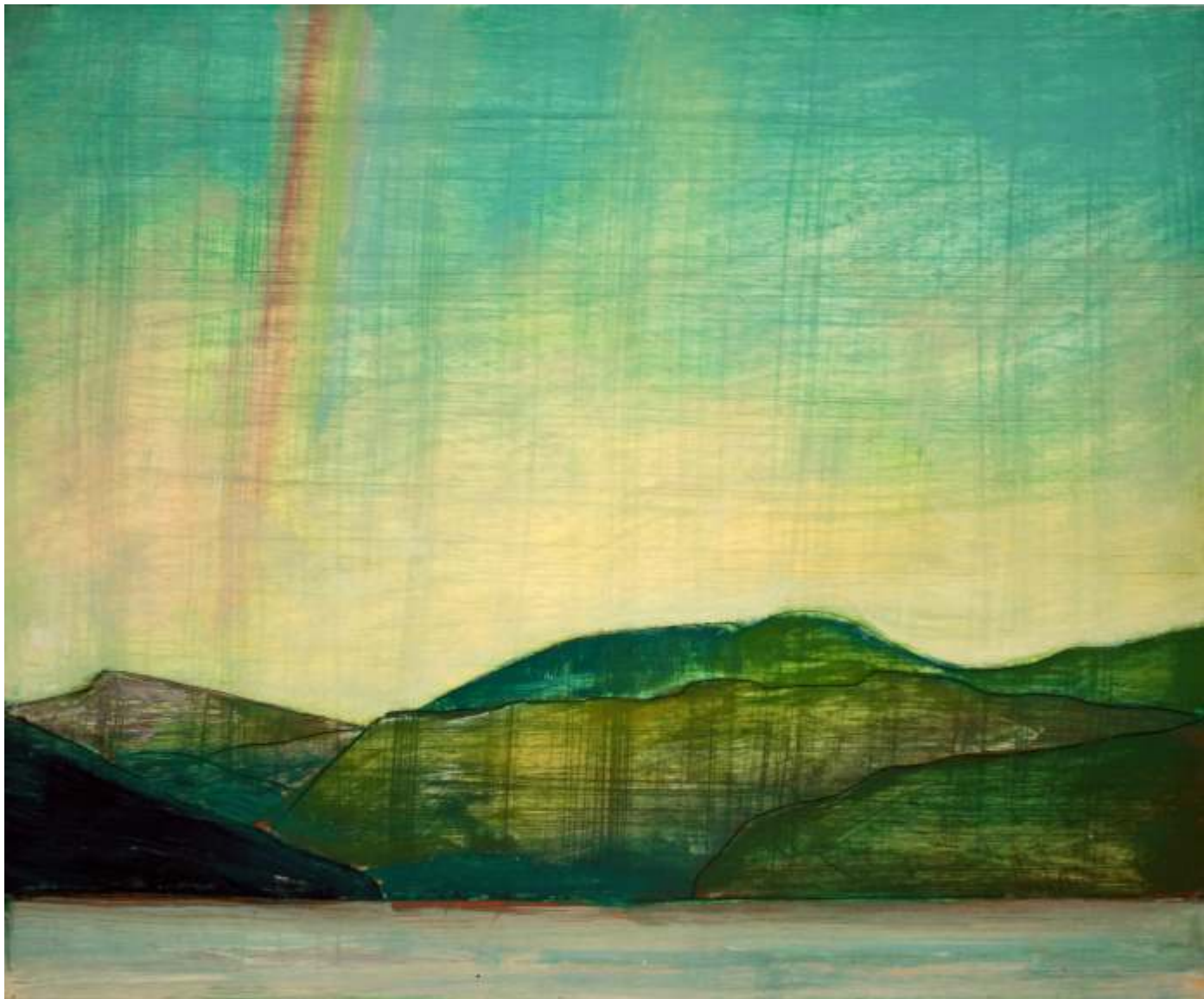
The Long View # 76 - 2016, Oil on panel, 9.5 x 11.5 inches