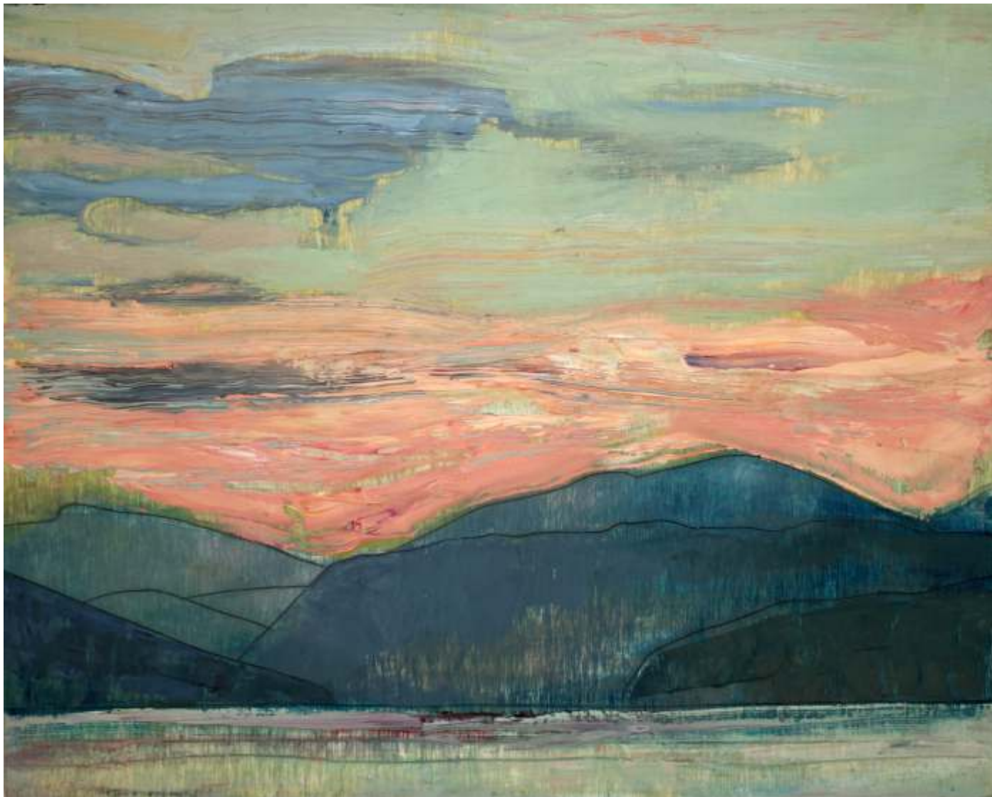
The Long View # 64 - 2016, Oil on panel, 8.5 x 10.5 inches