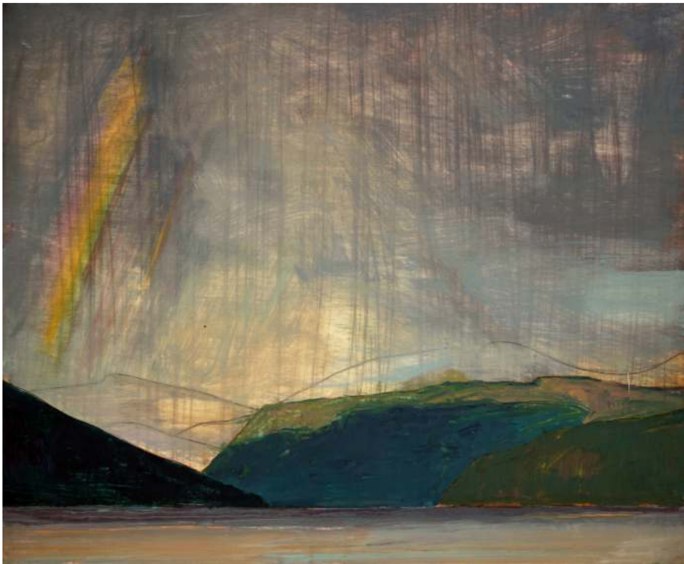
The Long View # 79 - 2016, Oil on panel, 9.5 x 11.5 inches