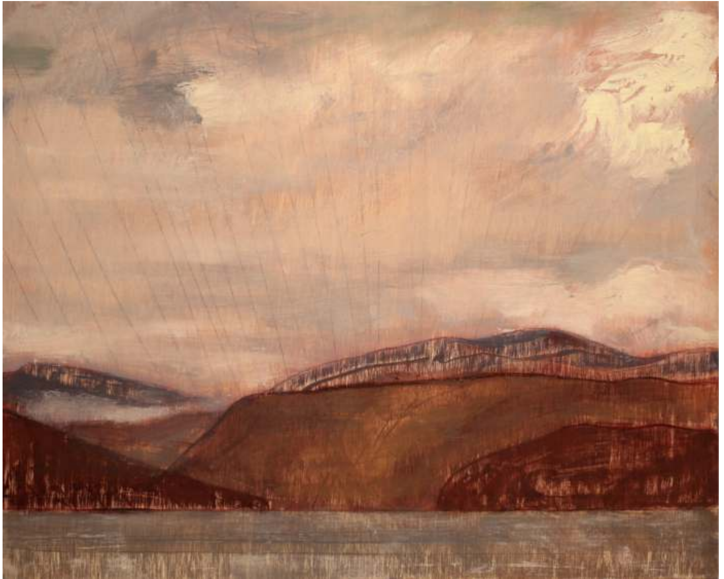
The Long View # 22 - 2015/2016, Oil on panel, 8.5 x 10.5 inches