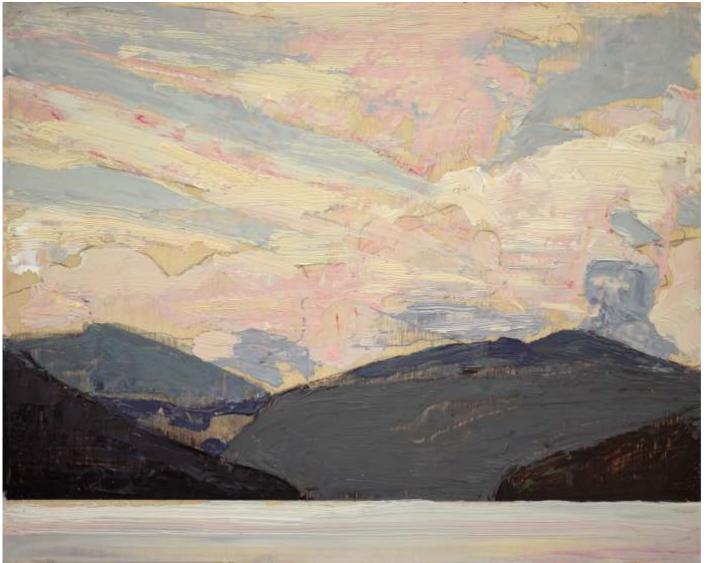
The Long View # 56 - 2015/2016, Oil on panel, 8.5 x 10.5 inches