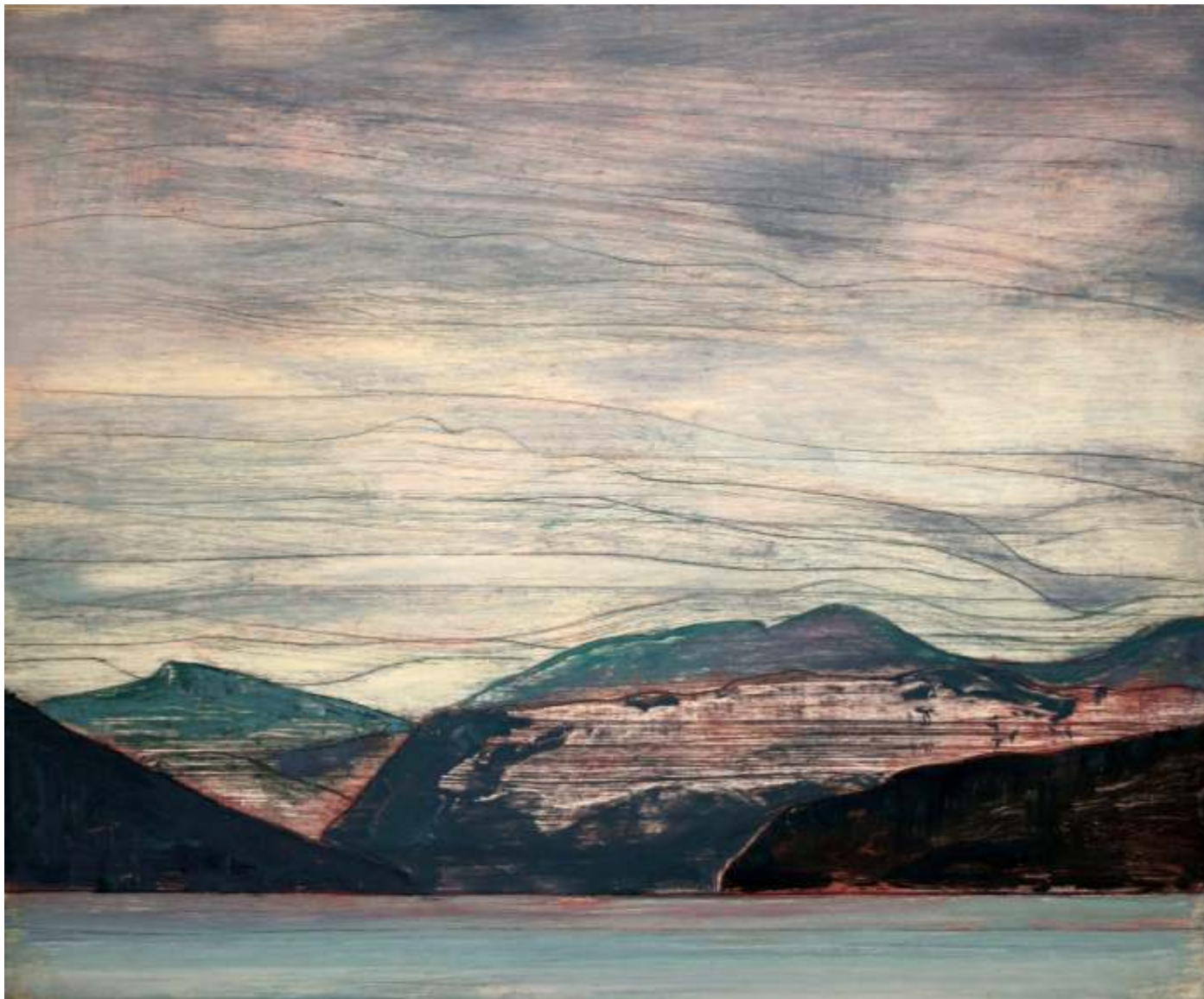
The Long View # 70 - 2016, Oil on panel, 9.5 x 11.5 inches