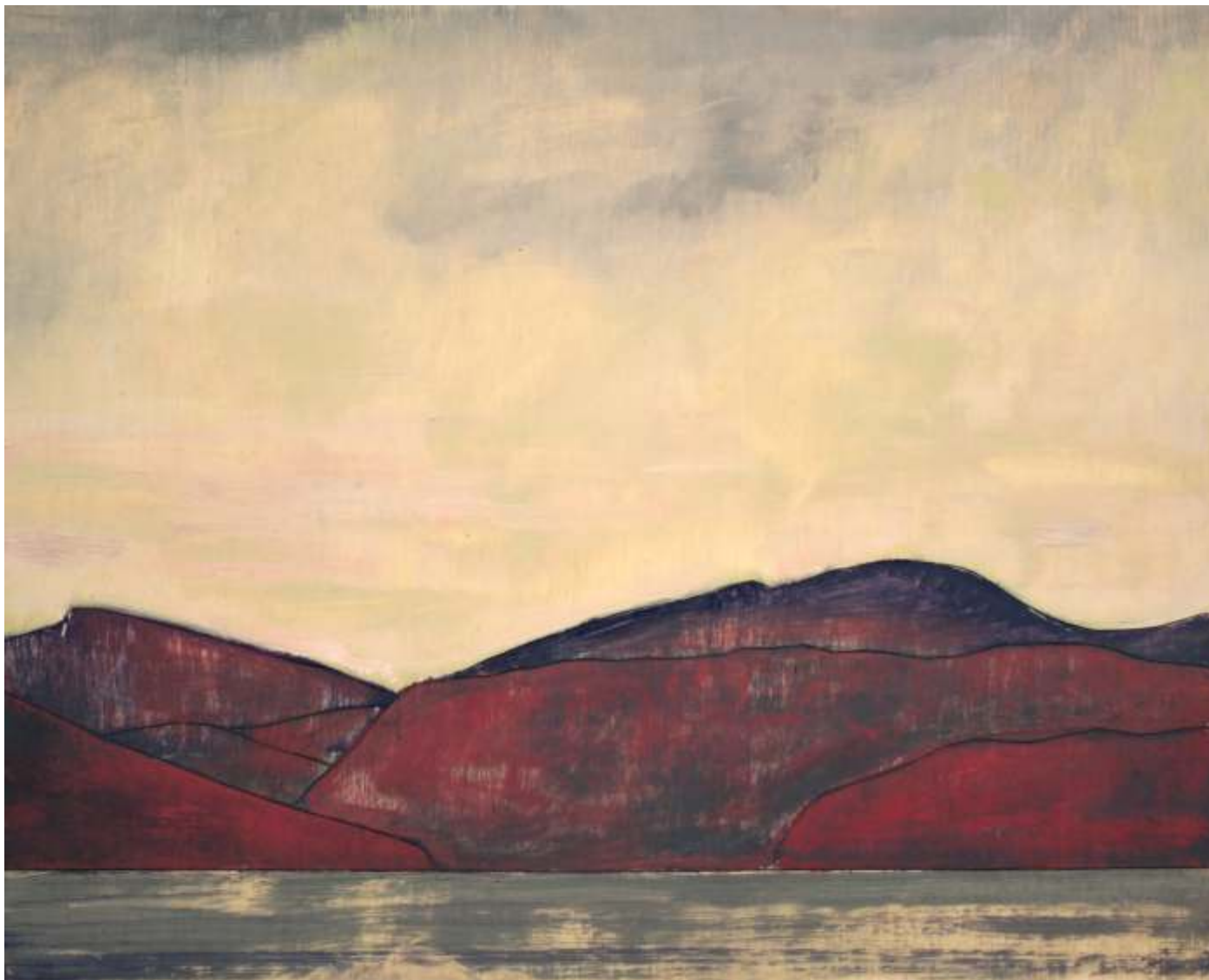
The Long View # 83 - 2016, Oil on panel, 8.5 x 10.5 inches