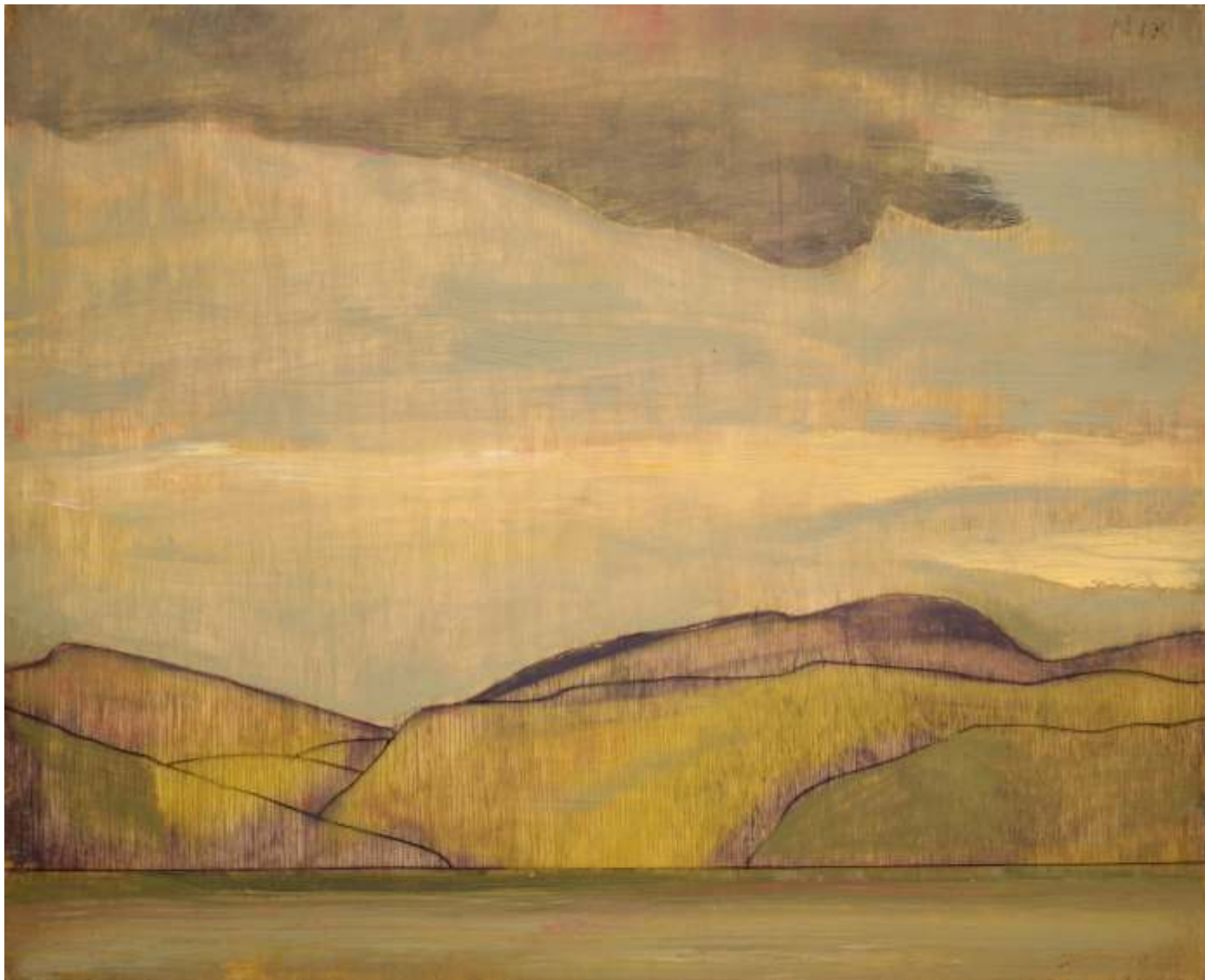
The Long View # 15 - 2015/2016, Oil on panel, 8.5 x 10.5 inches