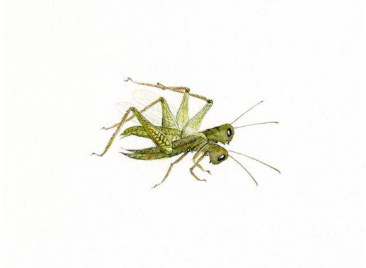
For Play #10 watercolor & acrylic on arches, 7.5 x 5.5 inches 2006