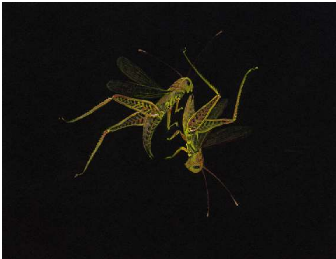
For Play #5 acrylic on black alphamat, 7.5 x 5.5 inches 2006