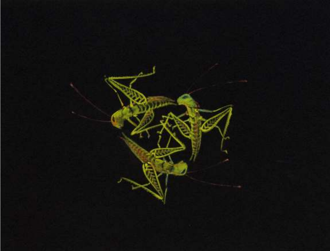
For Play #6 acrylic on black alphamat, 7.5 x 5.5 inches 2006