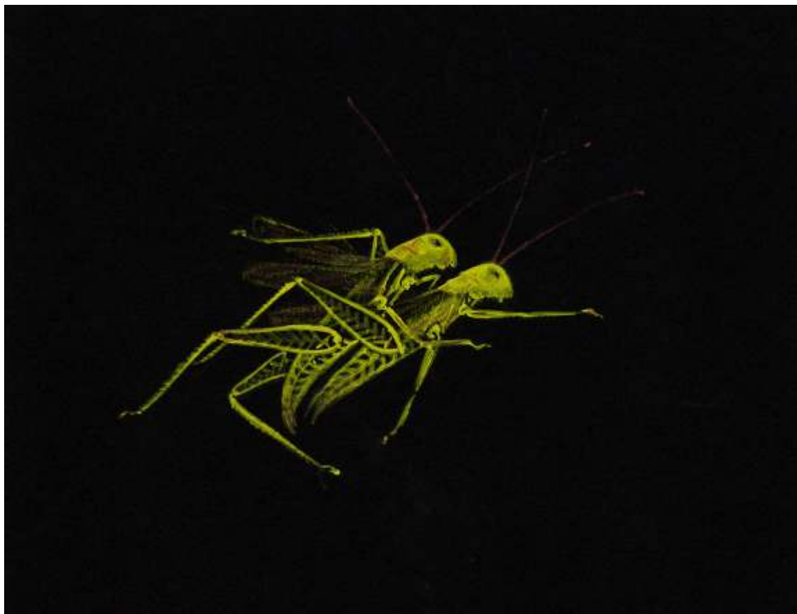
For Play #4 acrylic on black alphamat, 7.5 x 5.5 inches 2006