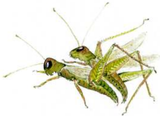
For Play #12 watercolor & acrylic on arches, 7.5 x 5.5 inches 2006