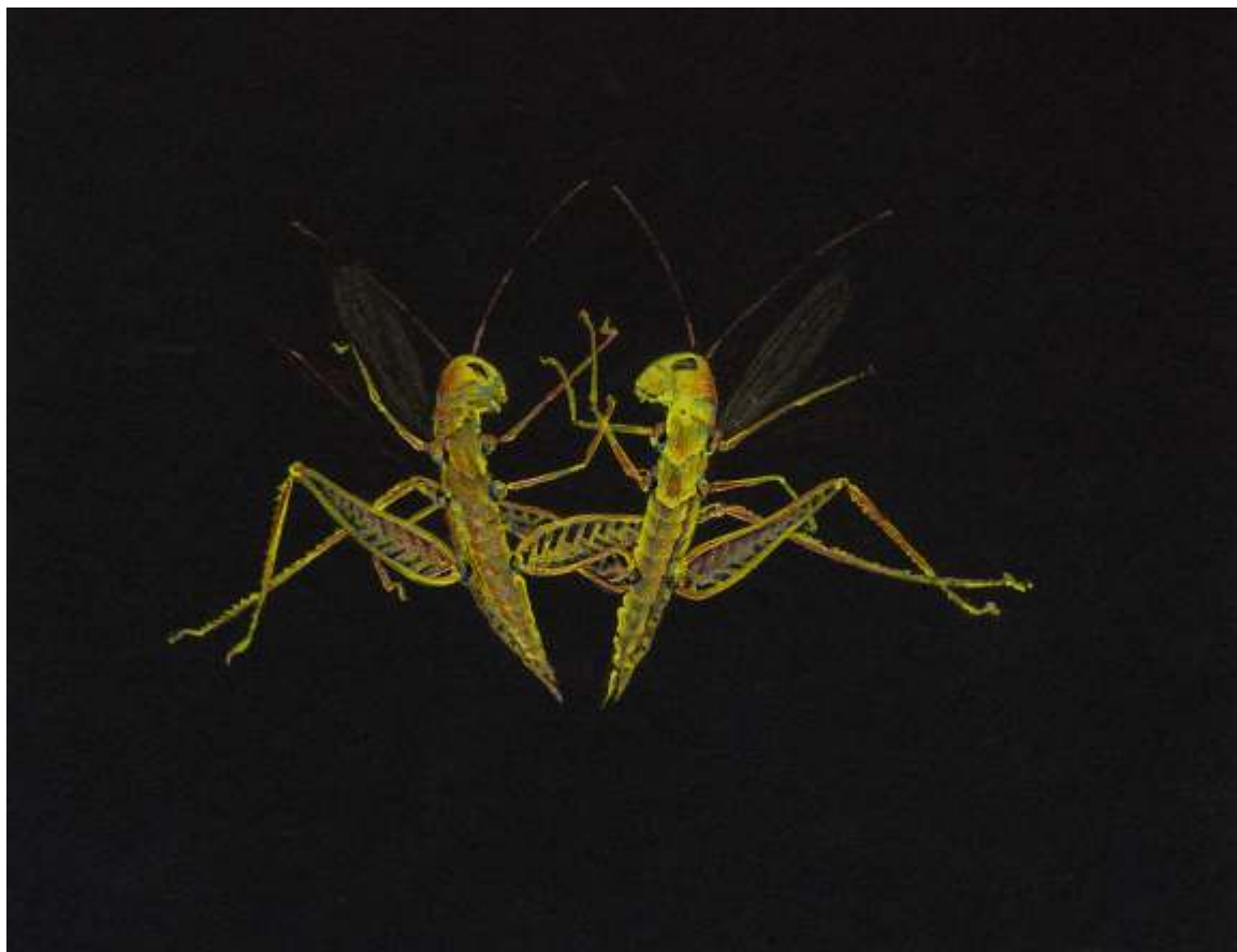
For Play #3 acrylic on black alphamat, 7.5 x 5.5 inches 2006