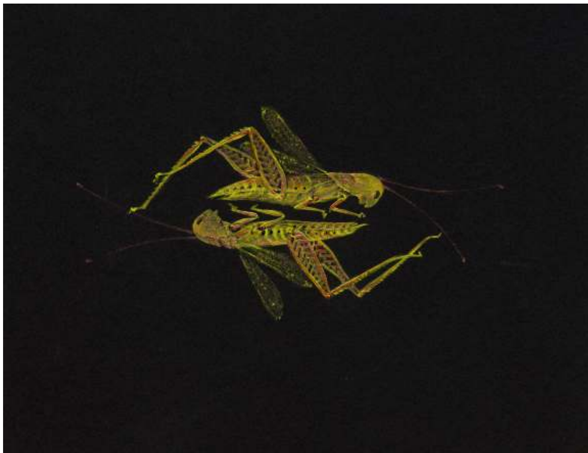
For Play #1 acrylic on black alphamat, 7.5 x 5.5 inches 2006