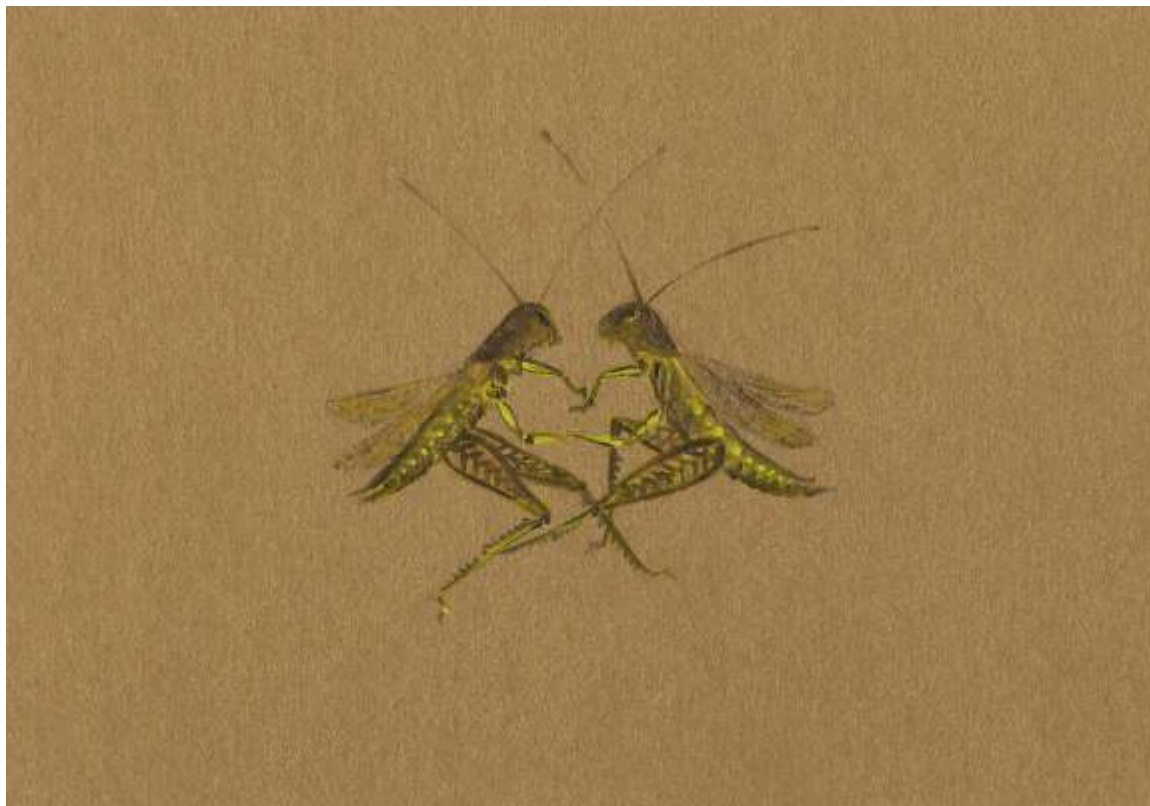
For Play #9 acrylic on metallic aluminum, 7 x 5 inches 2006