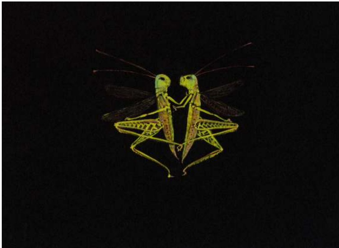
For Play #2 acrylic on black alphamat, 7.5 x 5.5 inches 2006