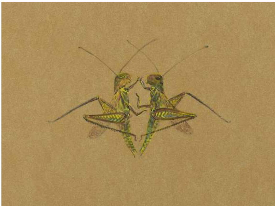
For Play #7 acrylic on metallic aluminum, 7 x 5 inches 2006