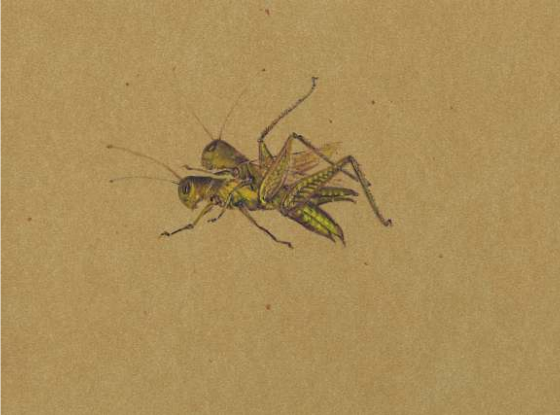
For Play #8 acrylic on metallic alphamat, 7 x 5 inches 2006