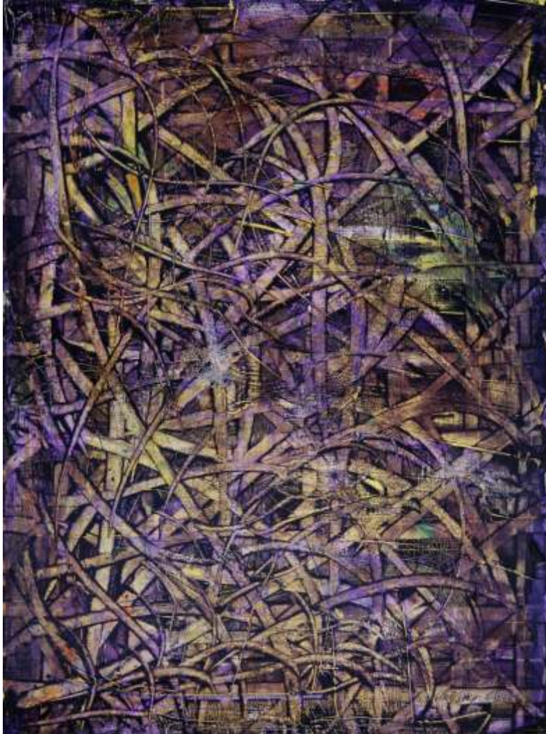
No Title acrylic on paper, 22 x 30 inches 2006