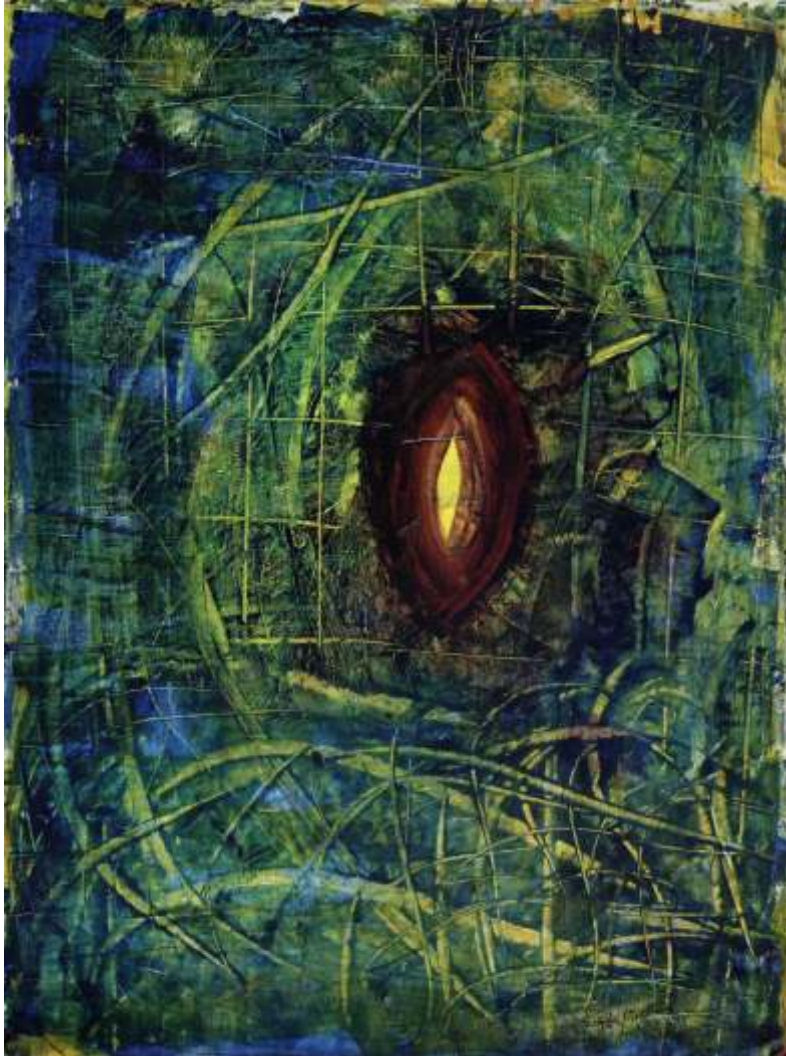
Listening acrylic on paper, 22 x 30 inches 2006