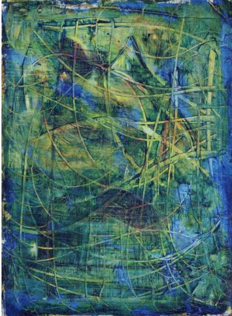
Mental Landscape In Blue acrylic on paper, 22 x 30 inches 2006