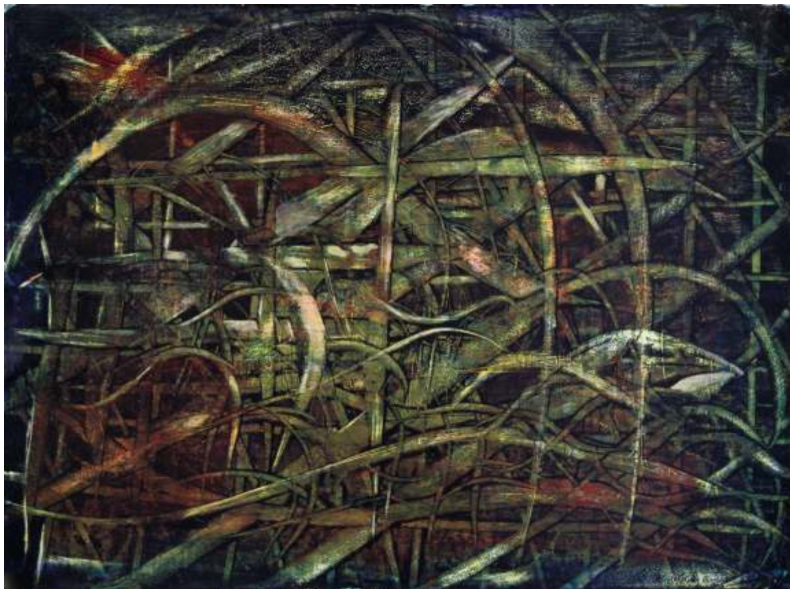
Abstract acrylic on paper, 22 x 30 inches 2006