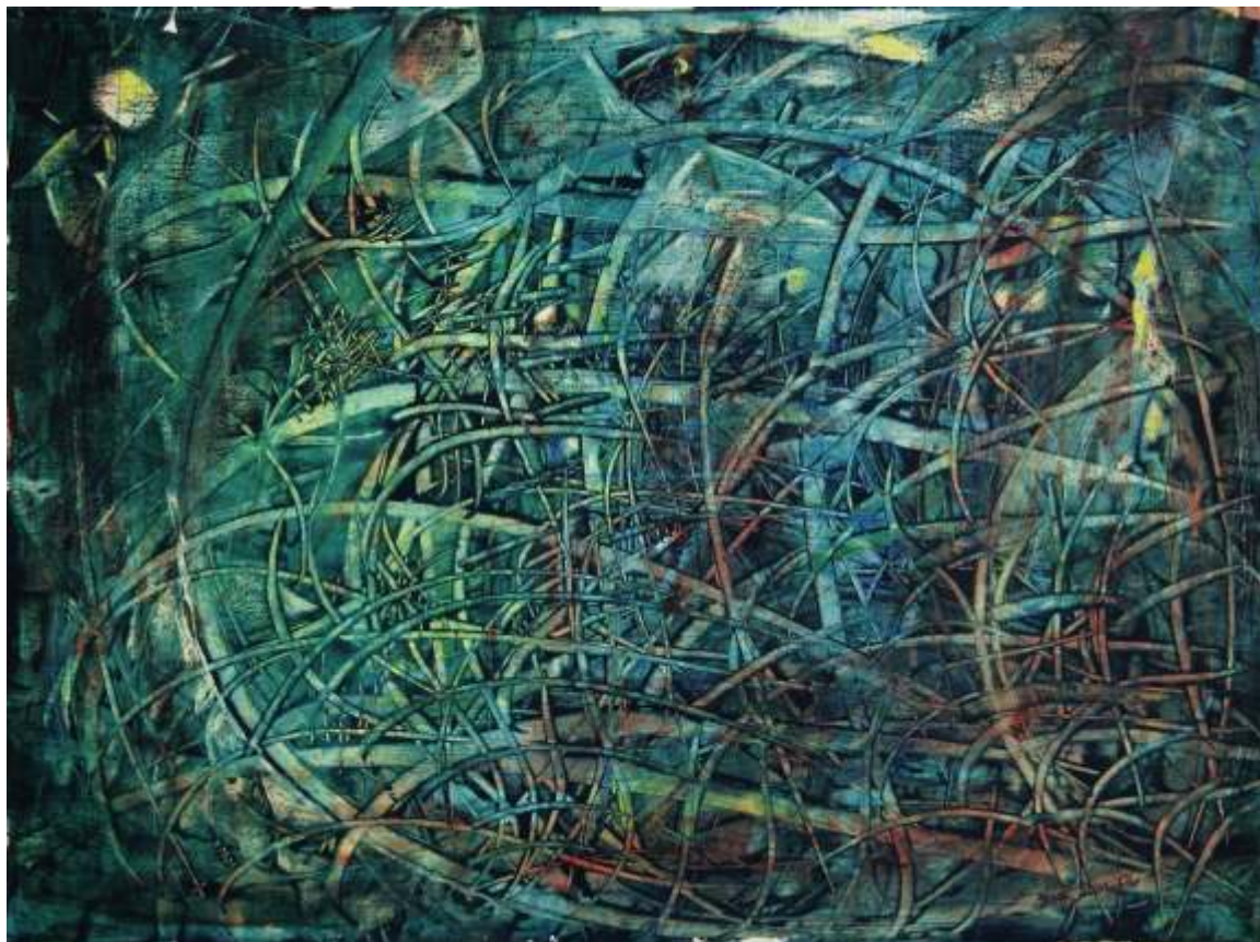
Trying To See Clearly acrylic on paper, 22 x 30 inches 2006