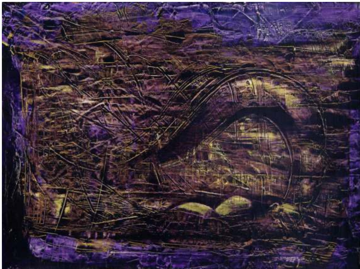
Entering acrylic on paper, 22 x 30 inches 2006