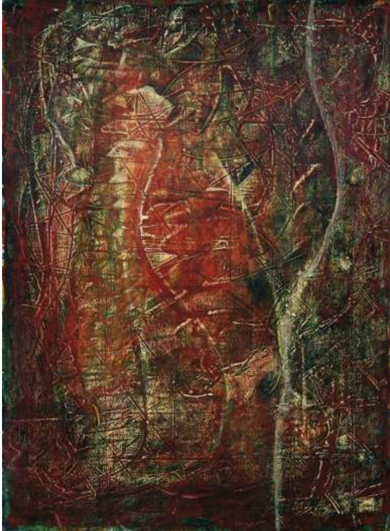
No Title acrylic on paper, 22 x 30 inches 2006