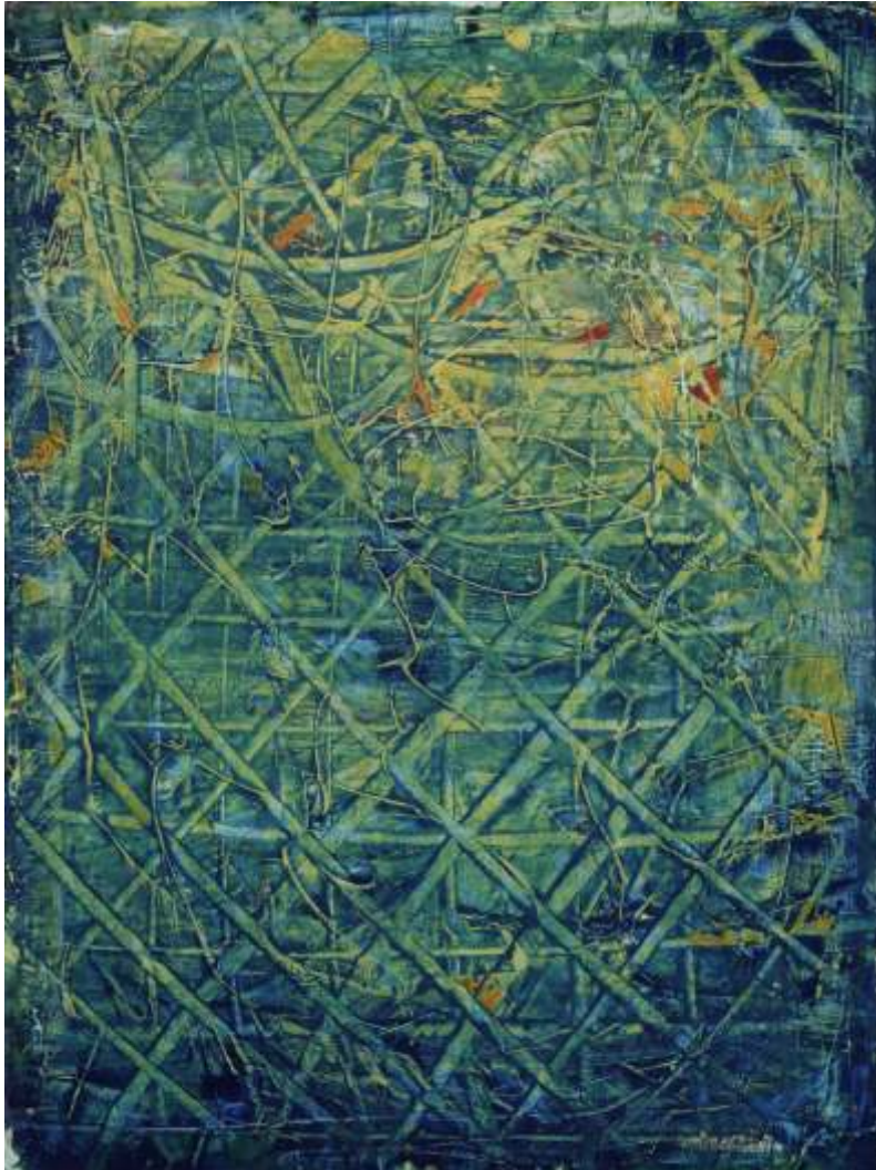
What Water Sings acrylic on paper, 22 x 30 inches 2006