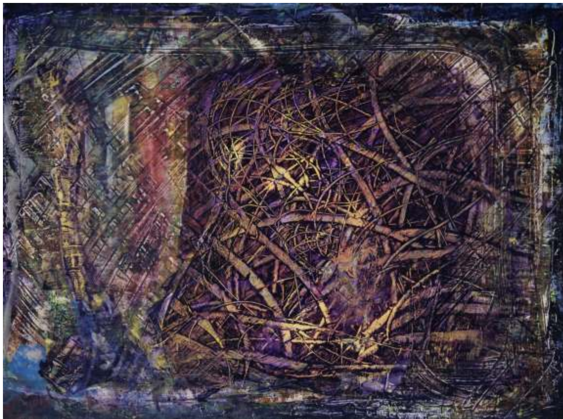
Working The Colour acrylic on paper, 22 x 30 inches 2006