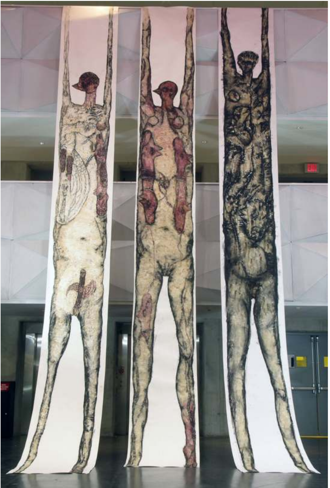
Installation Ontario College of Art and Design, Toronto ON 2006