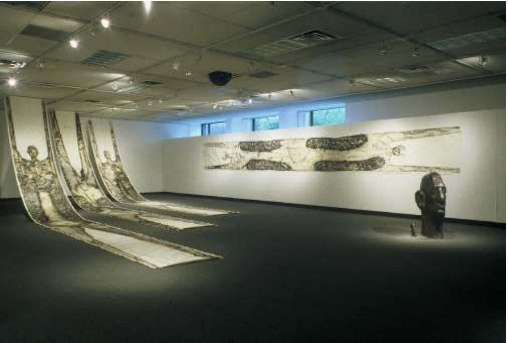
Solo Exhibition, John B. Aird Gallery 2005