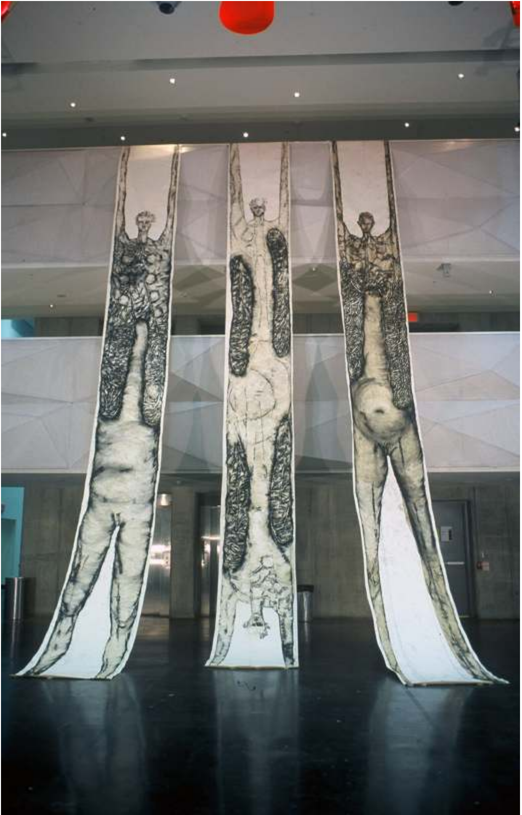
Installation Ontario College of Art and Design, Toronto ON 2005