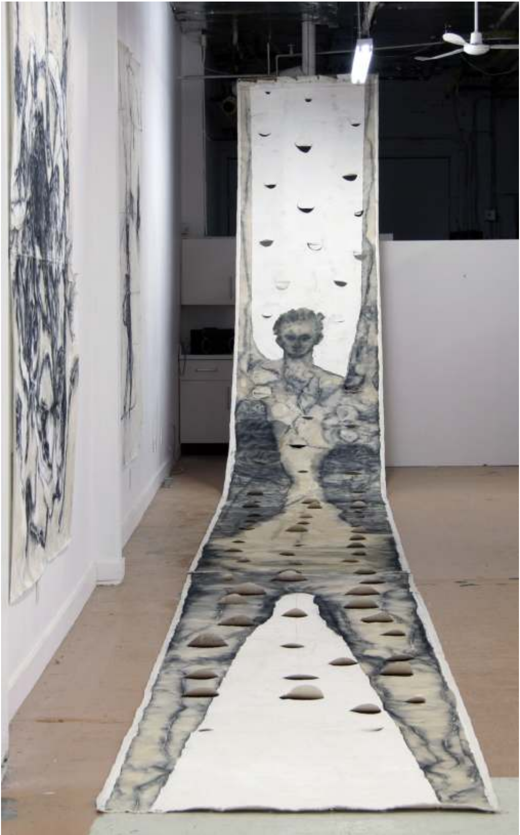
Headbones Gallery and Gykan Project Room 2007