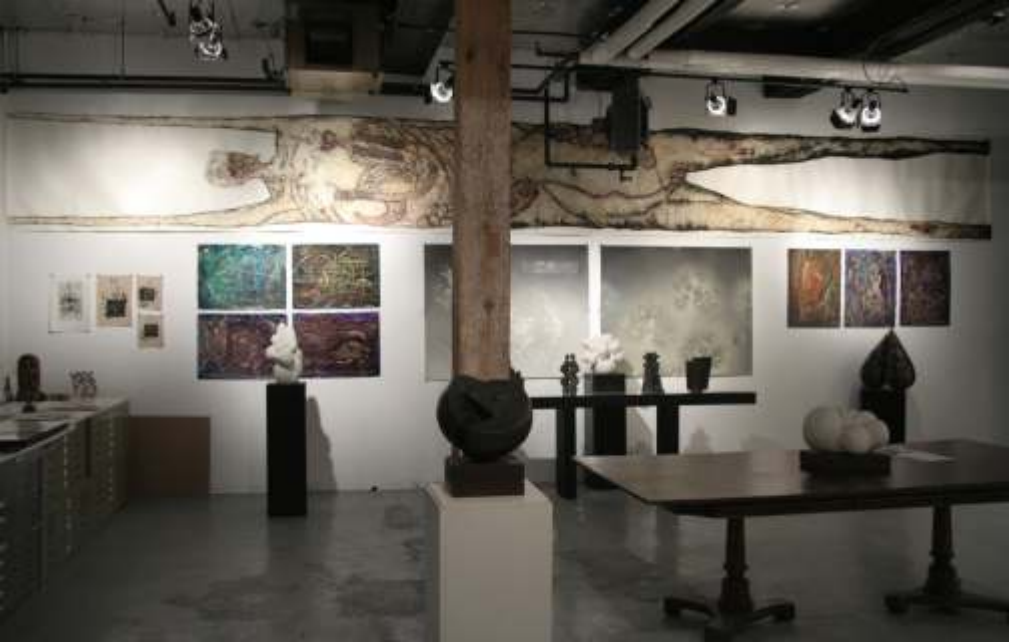
Headbones Gallery 2007