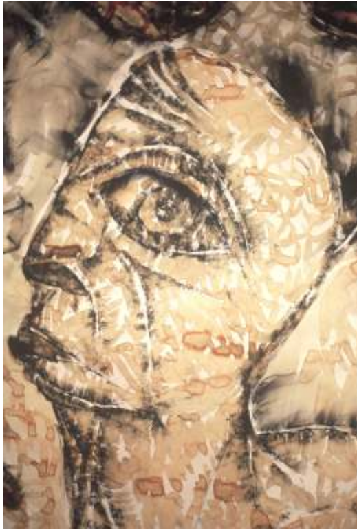
detail charcoal, coffee and dye on paper