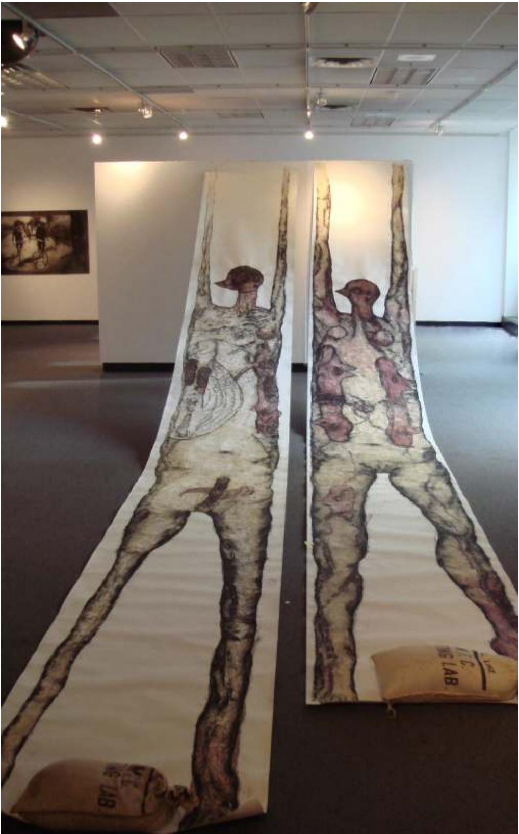
First Prize, Drawing: 8th Annual Juried Exhibition, John B. Aird Gallery 2007