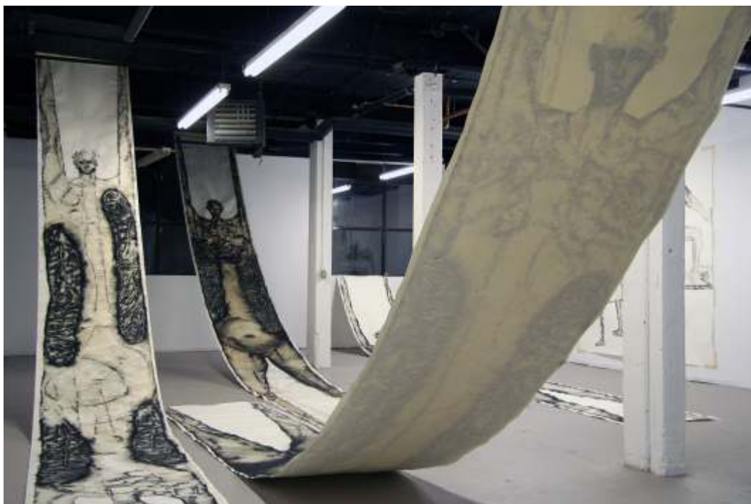
Headbones Gallery and Gykan Project Room 2006