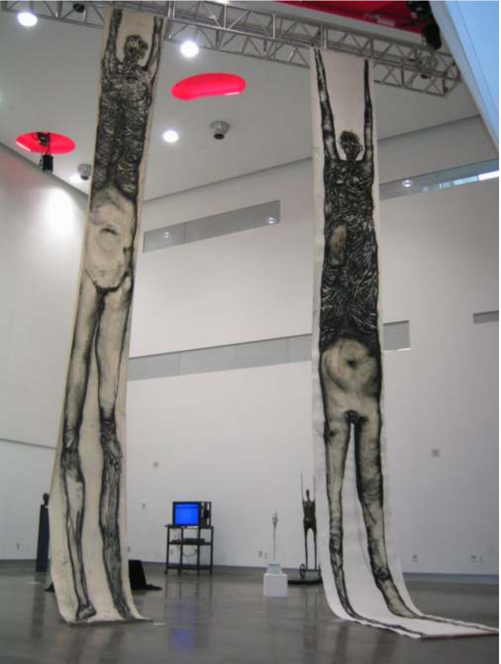
Installation Ontario College of Art and Design, Toronto ON 2004