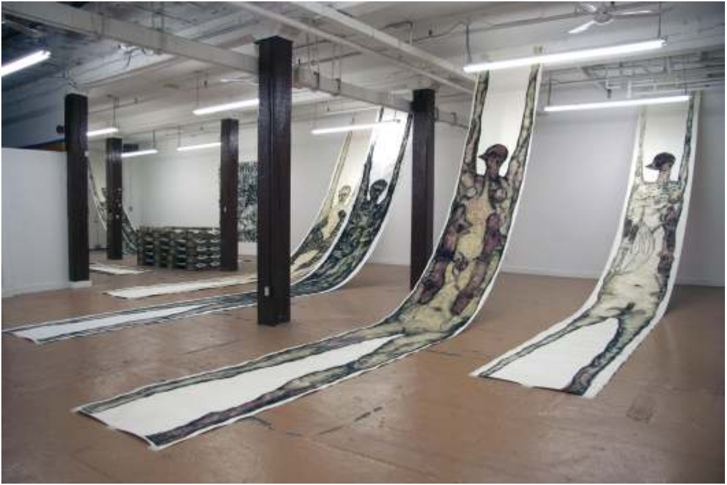
Headbones Gallery and Gykan Project Room 2007