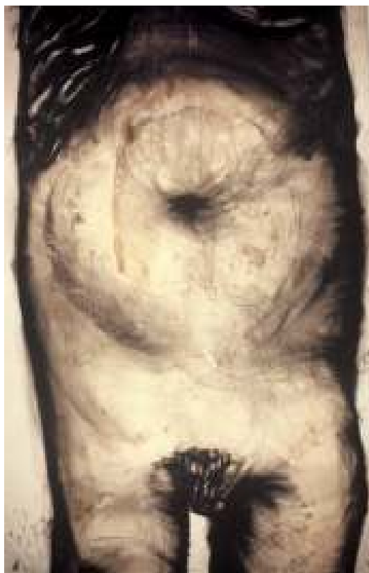
detail charcoal, coffee on paper