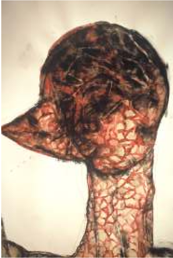
detail charcoal, coffee and dye on paper