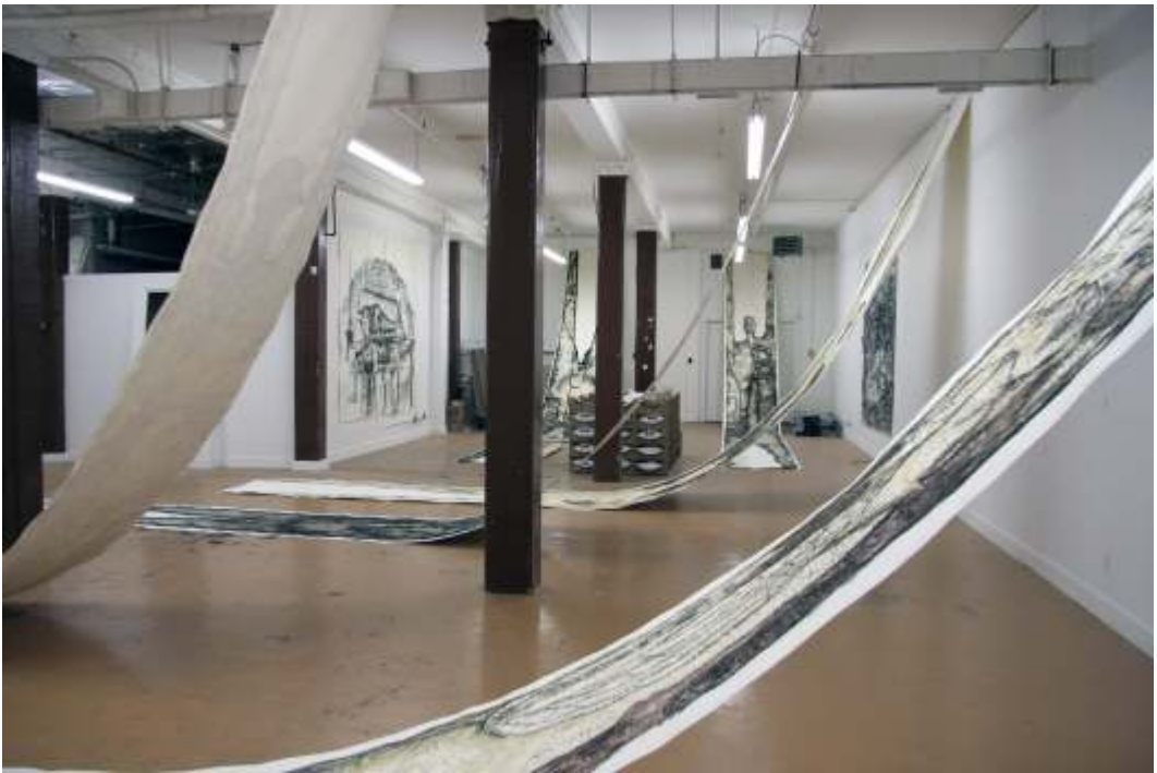
Headbones Gallery and Gykan Project Room 2007