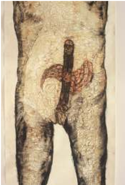
detail charcoal, coffee and dye on paper