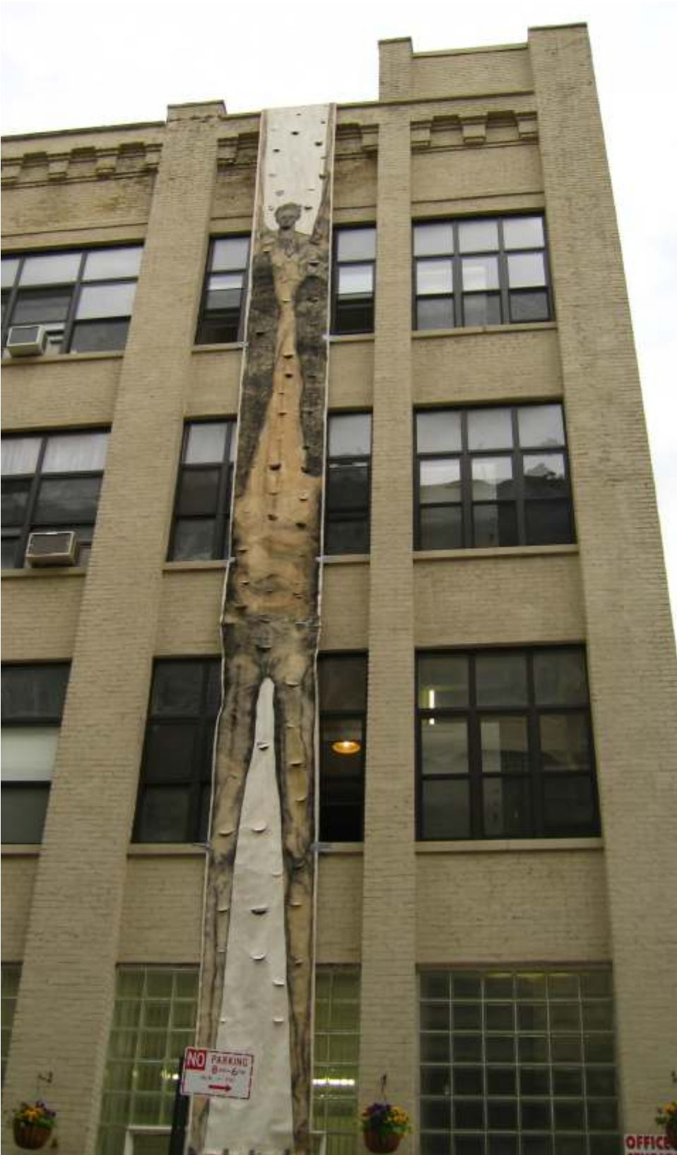
Outdoor drawing installation at Diego Salazar Studios ,Queens ,NY 2006