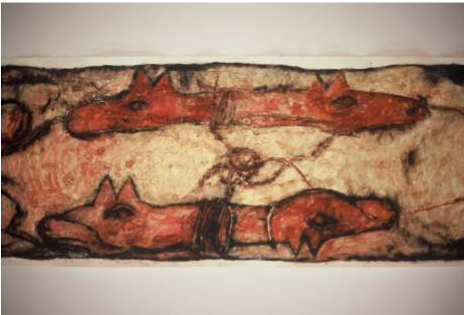
detail charcoal, coffee and dye on paper