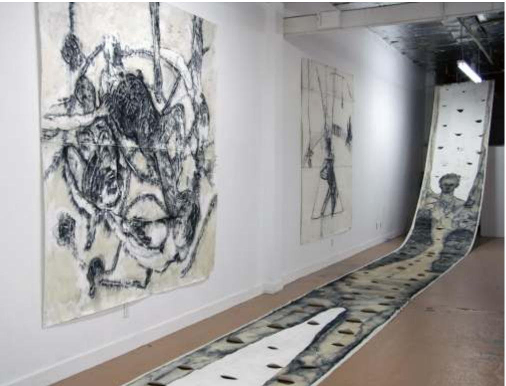
Headbones Gallery and Gykan Project Room 2007