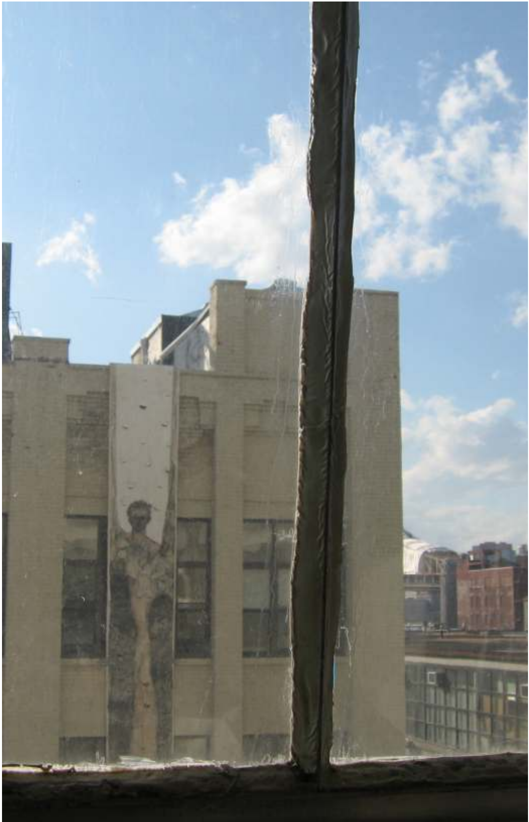
Outdoor drawing installation at Diego Salazar Studios ,Queens ,NY 2006