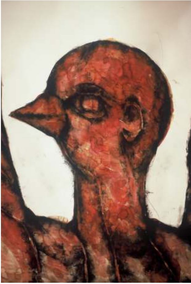
detail charcoal, coffee and dye on paper