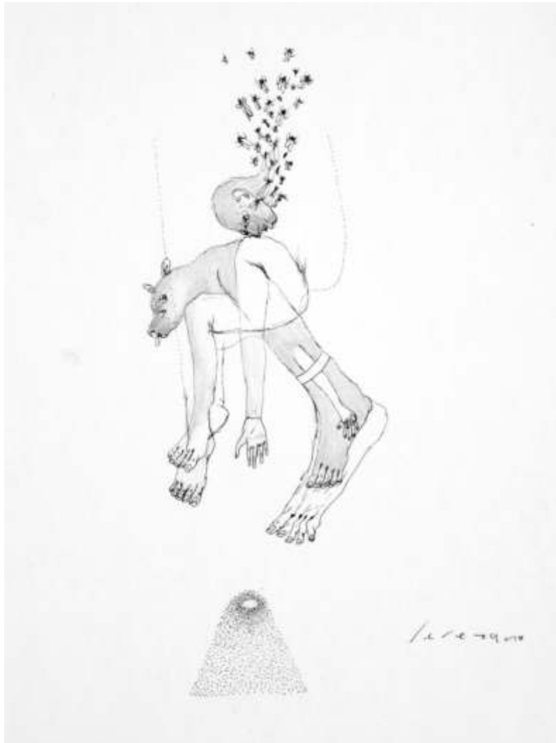
Untitled from "Animals That Collect Animals" ink & pencil on paper, 13 x 10 inches 2006