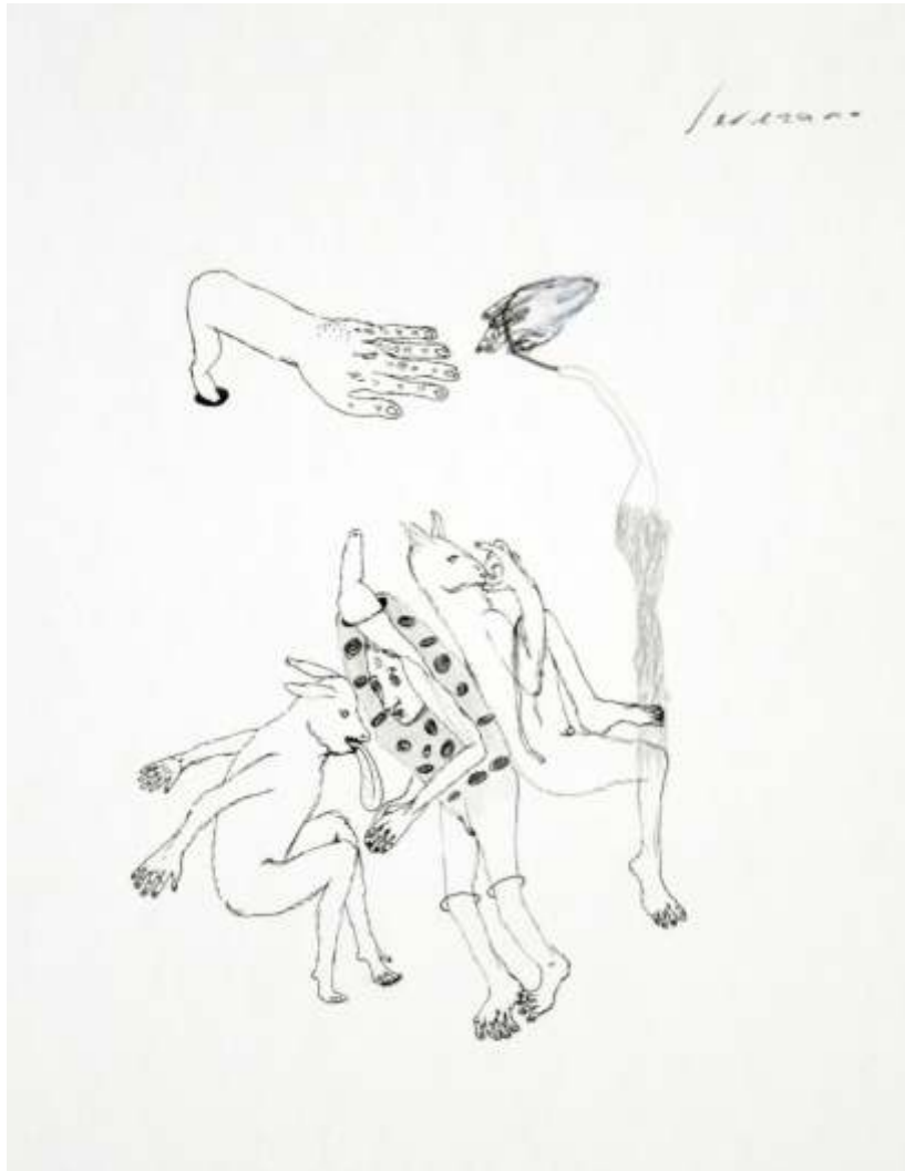
Untitled from "Animals That Collect Animals" ink & pencil on paper, 13 x 10 inches 2006