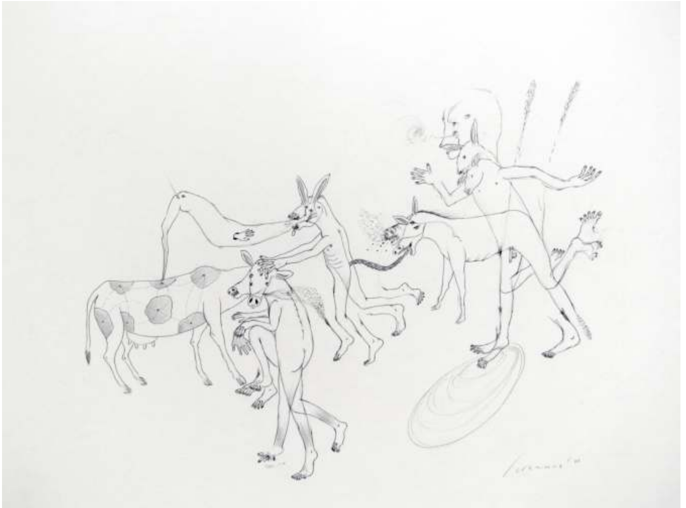
Untitled from "Animals That Collect Animals" ink & pencil on paper, 20 x 26 inches 2006