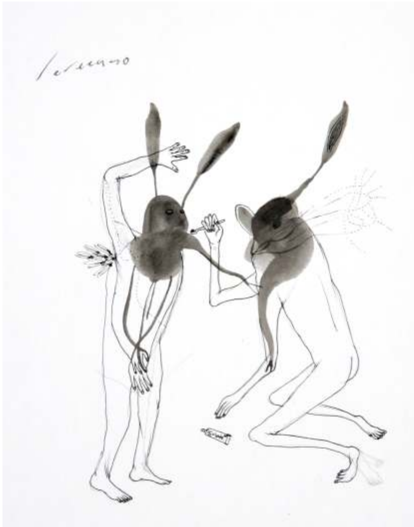
Untitled from "Animals That Collect Animals" ink & pencil on paper, 13 x 10 inches 2006