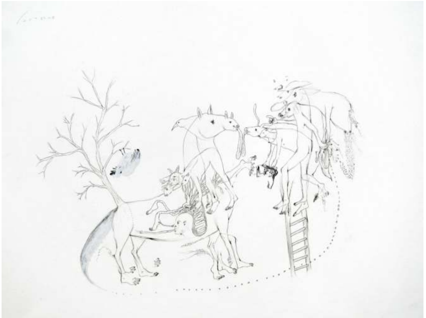
Untitled from "Animals That Collect Animals" ink & pencil on paper, 20 x 26 inches 2006