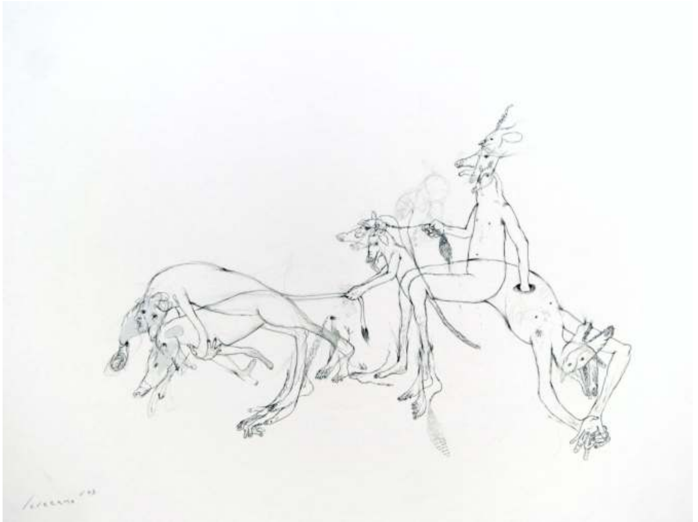
Untitled from "Animals That Collect Animals" ink & pencil on paper, 20 x 26 inches 2006