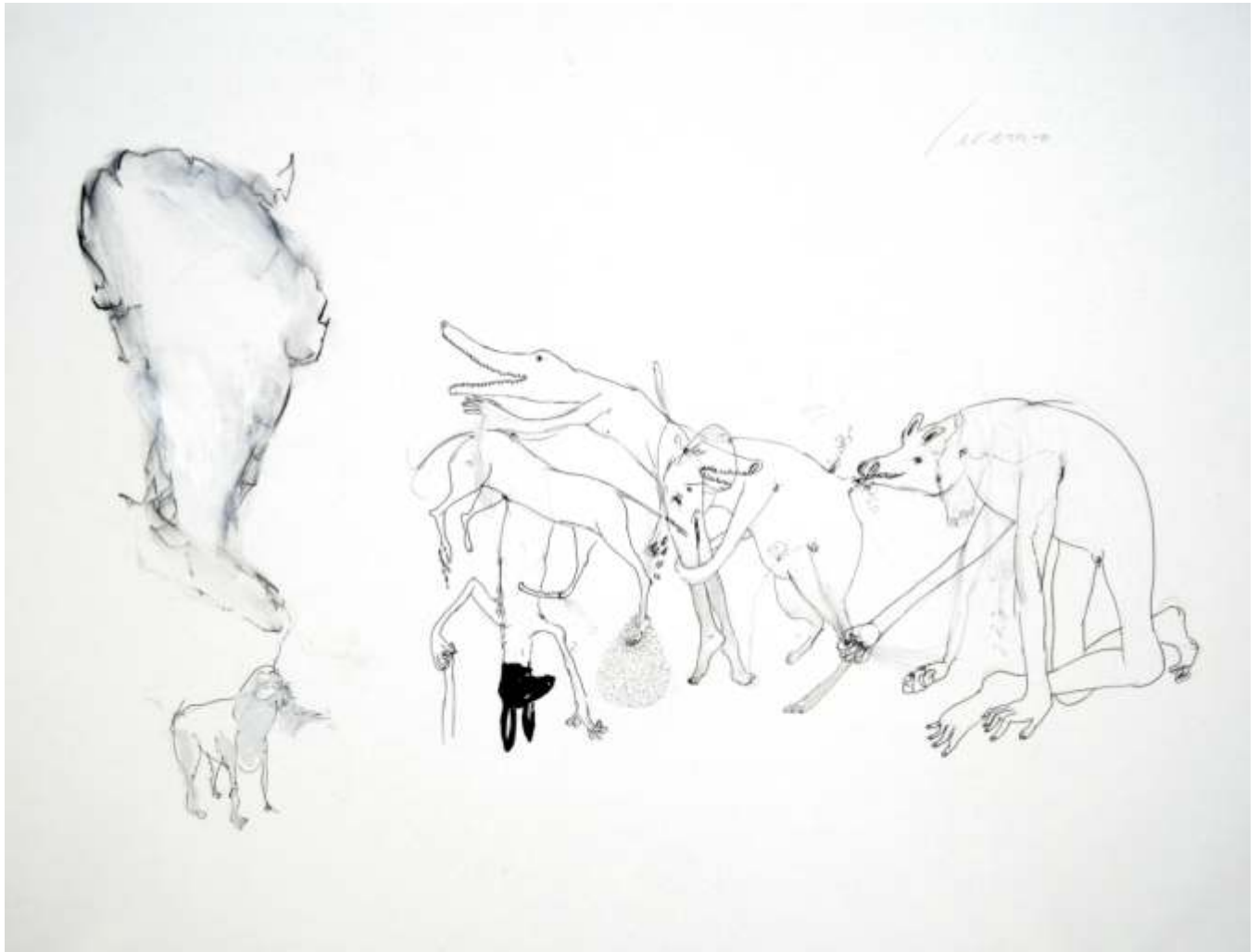
Untitled from "Animals That Collect Animals" ink & pencil on paper, 20 x 26 inches 2006