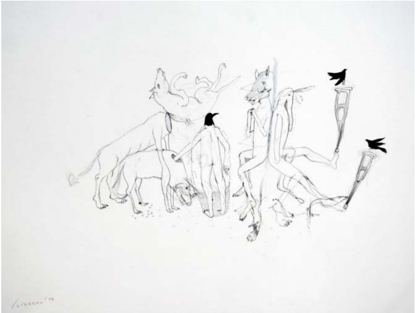
Untitled from "Animals That Collect Animals" ink & pencil on paper, 20 x 26 inches 2006