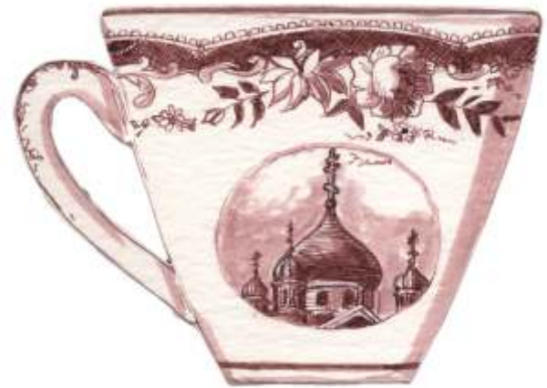
Brooklyn Spode (Williamsburg Brooklyn, Brown saucer 5" dia. & teacup 3"x4" ink on paper on archival foam board 2004