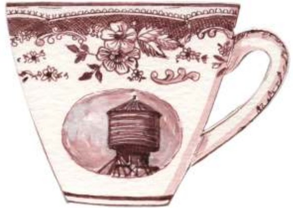
Brooklyn Spode (Williamsburg Brooklyn, Brown saucer 5" dia. & teacup 3"x4" ink on paper on archival foam board 2004