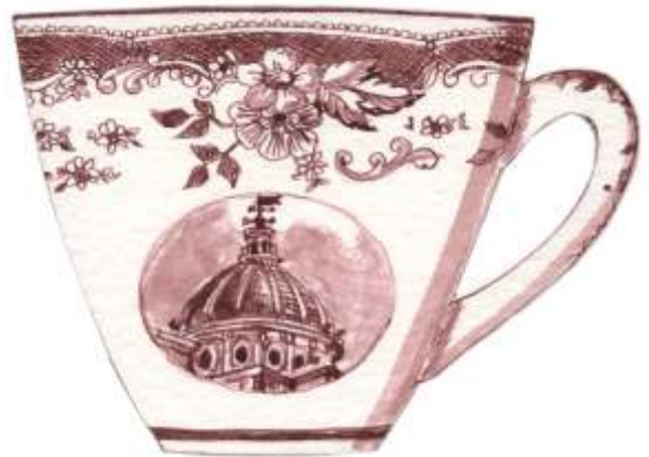
Brooklyn Spode (Williamsburg Brooklyn, Brown saucer 5" dia. & teacup 3"x4" ink on paper on archival foam board 2004