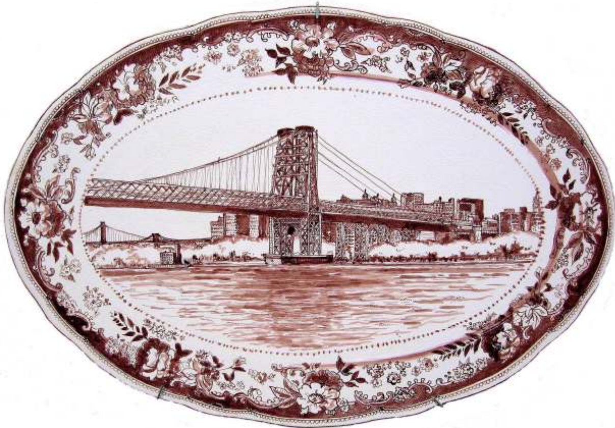
Brooklyn Spode (Williamsburg Brooklyn, Brown plate 11"x1 5.5" ink on paper on archival foam board 2004