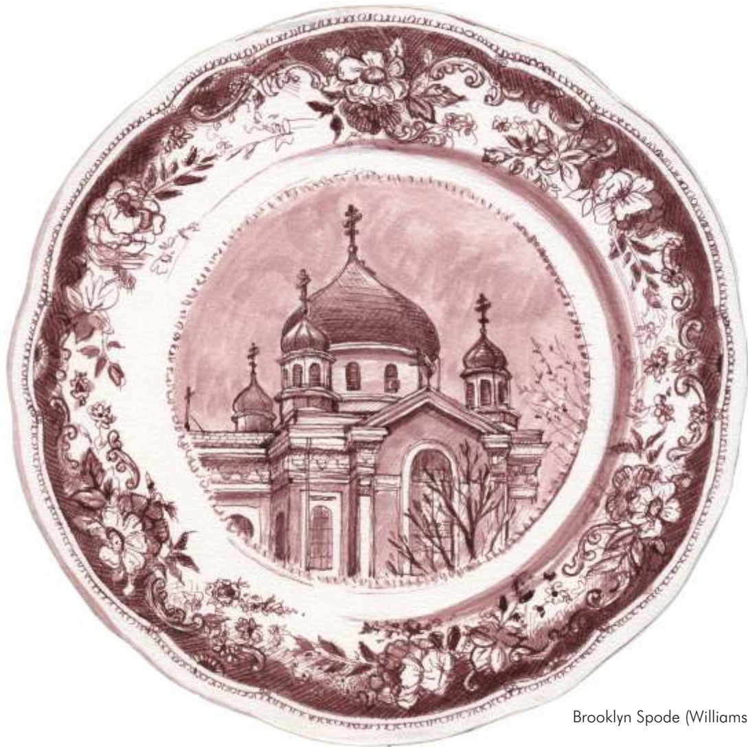
Brooklyn Spode (Williamsburg Brooklyn, Brown plate 8" diameter ink on paper on archival foam board 2004