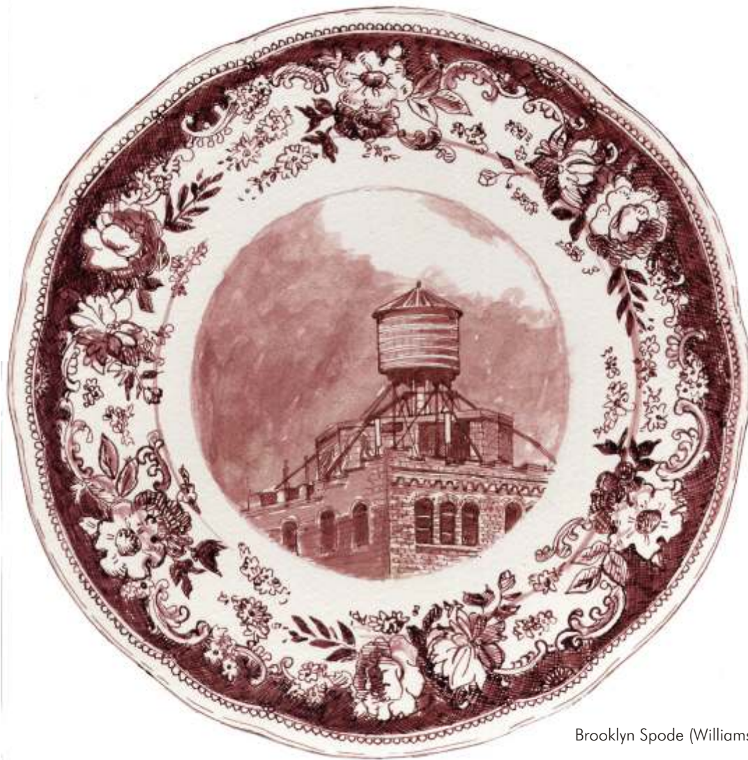
Brooklyn Spode (Williamsburg Brooklyn, Brown plate 8" diameter ink on paper on archival foam board 2004