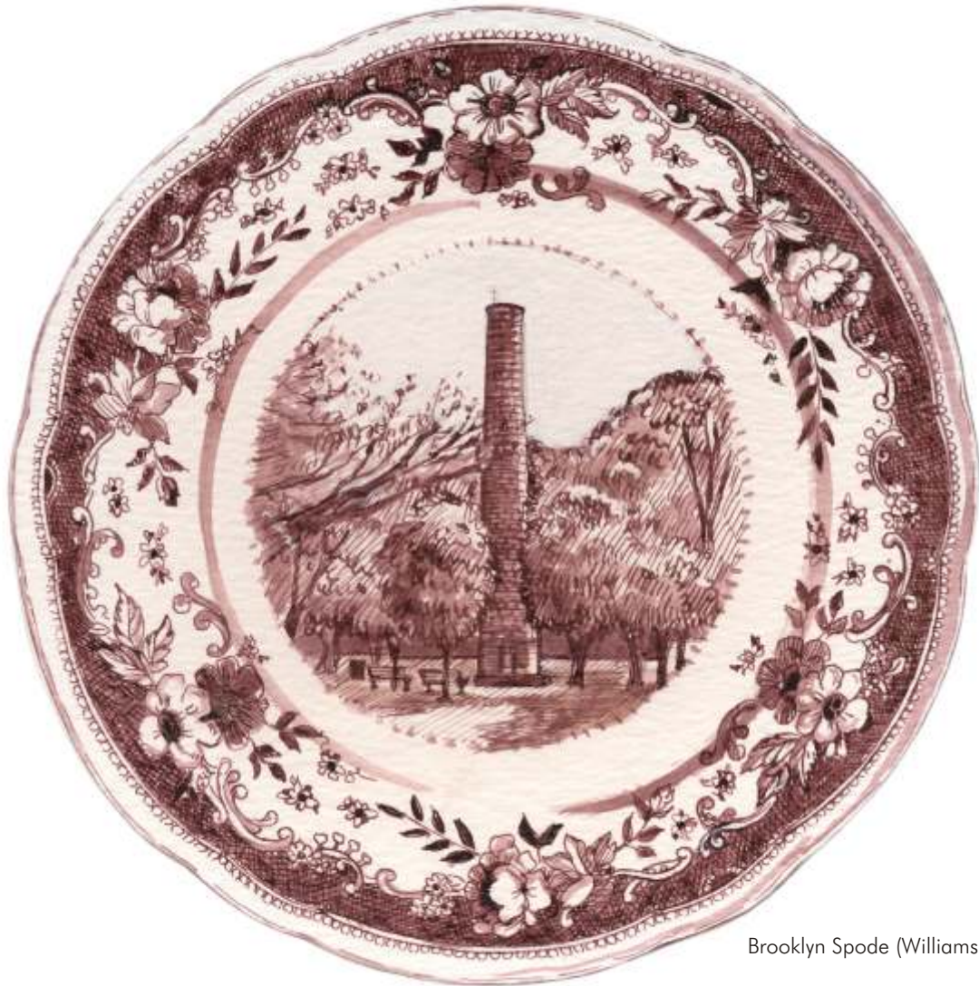
Brooklyn Spode (Williamsburg Brooklyn, Brown plate 8" diameter ink on paper on archival foam board 2004