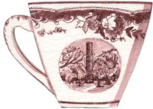
Brooklyn Spode (Williamsburg Brooklyn, Brown saucer 5" dia. & teacup 3"x4" ink on paper on archival foam board 2004