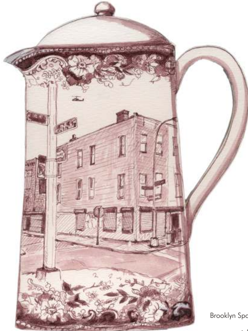
Brooklyn Spode (Williamsburg Brooklyn, Brown teapot, 7.25" x 5.25" ink on paper on archival foam board 2004