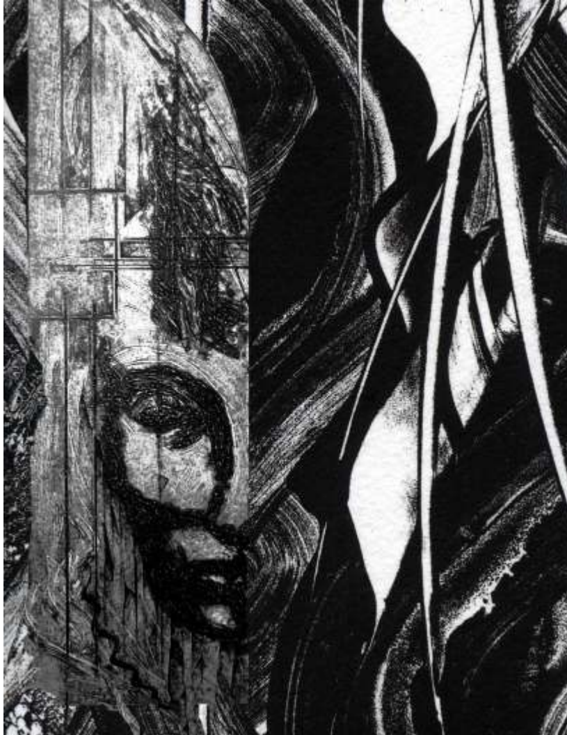
One tear Edition 1/5 - intaglio type / digital colour - 27.5 x 21.5 inches 2007