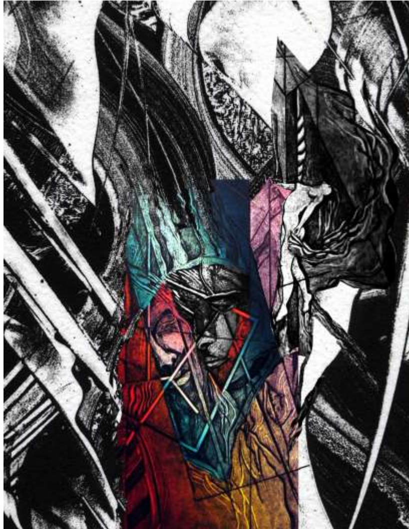
Shield Edition 1/5 - intaglio type / digital colour - 27.5 x 21.5 inches 2007