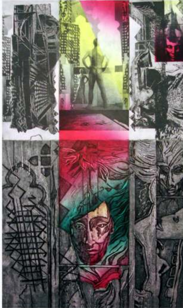
Crimson Edition 1/4 - paper cut / intaglio type - 46 3/4 x 29 1/4 inches 2007