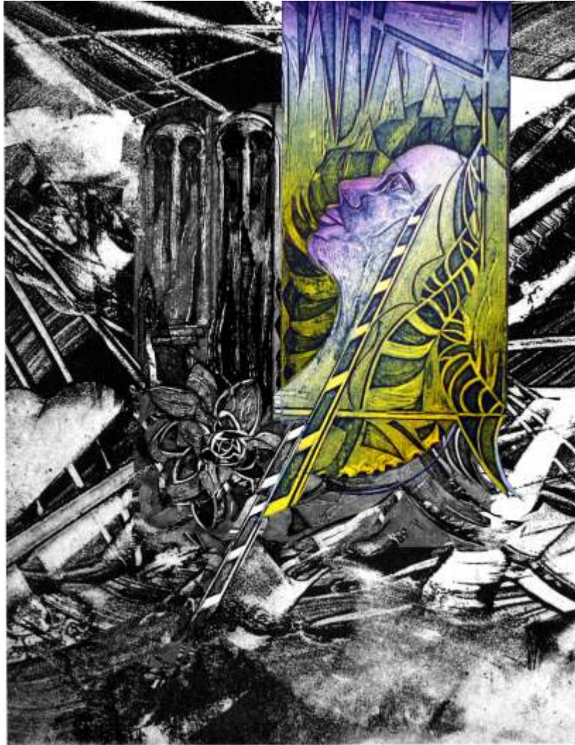
High Seas Edition 1/5 - intaglio type / digital colour - 27.5 x 21.5 inches 2007