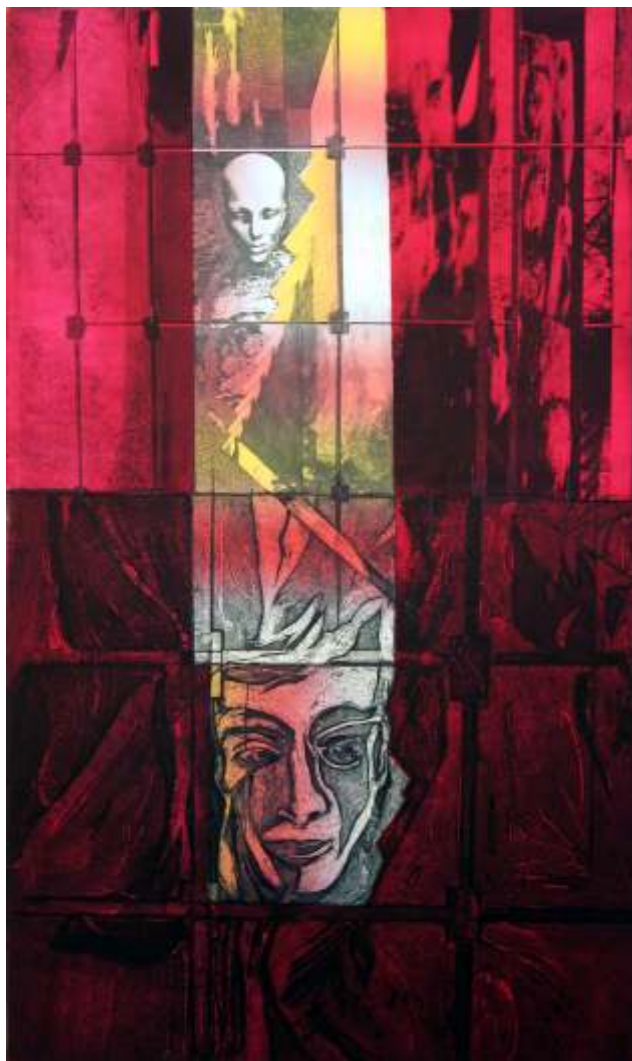
Face Forward Edition 1/4 - paper cut / intaglio type - 46 3/4 x 29.5 inches 2007