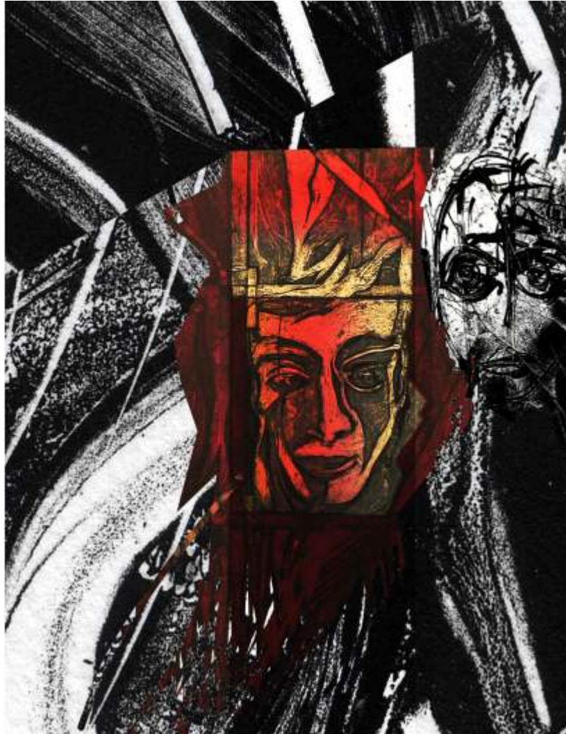
Kingly Edition 1/5 - intaglio type / digital colour - 19 x 15 inches 2007