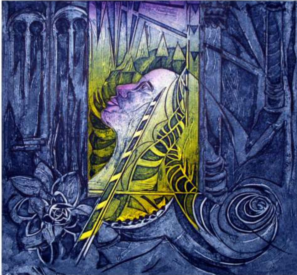
Looking For Lotus Edition 1/4 - paper cut / intaglio type - 31 3/4 x 29 3/4 inches 2007