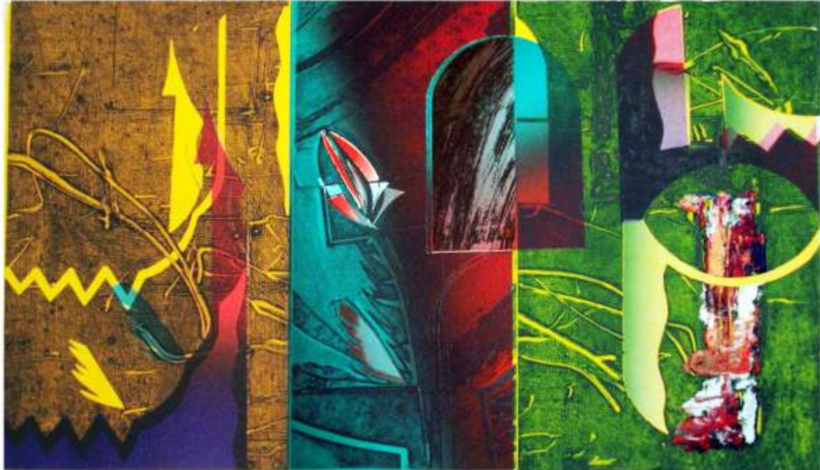
In Line Of Sight Edition 1/4 - paper cut / intaglio type - 29 x 43 1/4 inches 2007