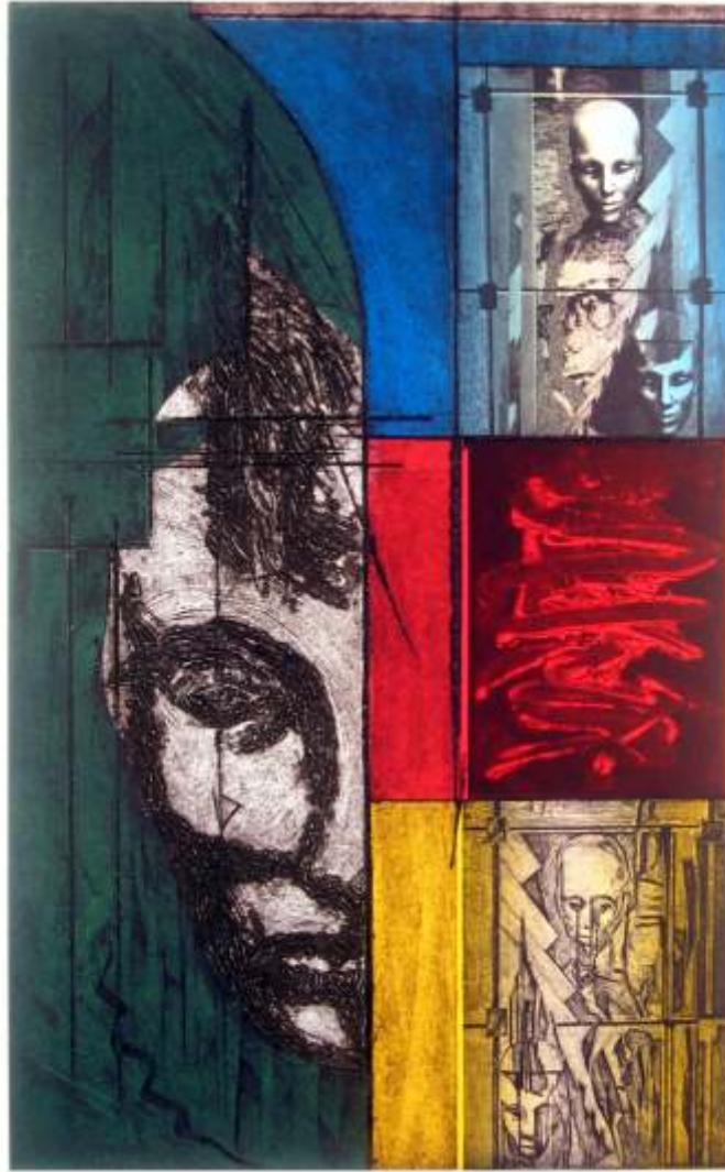
Heads Up Edition 1/4 - paper cut / intaglio type - 46 x 29 3/4 inches 2007