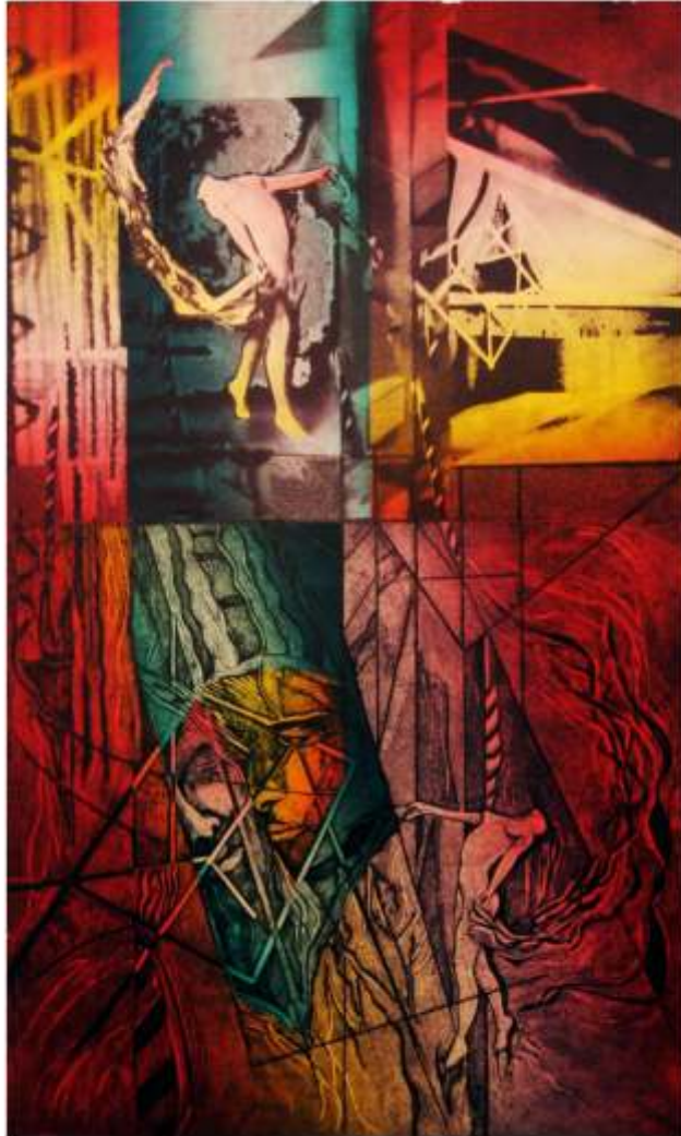
Space Frames Edition 1/4 - paper cut / intaglio type - 46 1/4 x 29 inches 2007