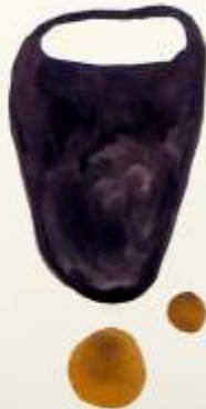
From The Erotic Notebook - Paris collage, gouache, pencil 25.5 x 20 in 1995