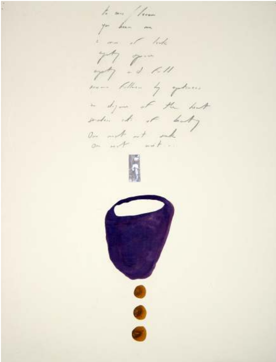
From The Erotic Notebook - Paris collage, gouache, pencil 25.5 x 20 in 1995