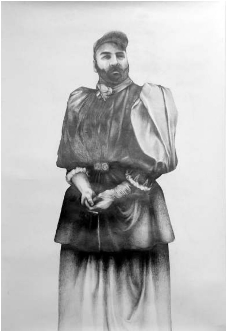
Walking Gown 1901 Graphite on paper 40.33 x 61 in