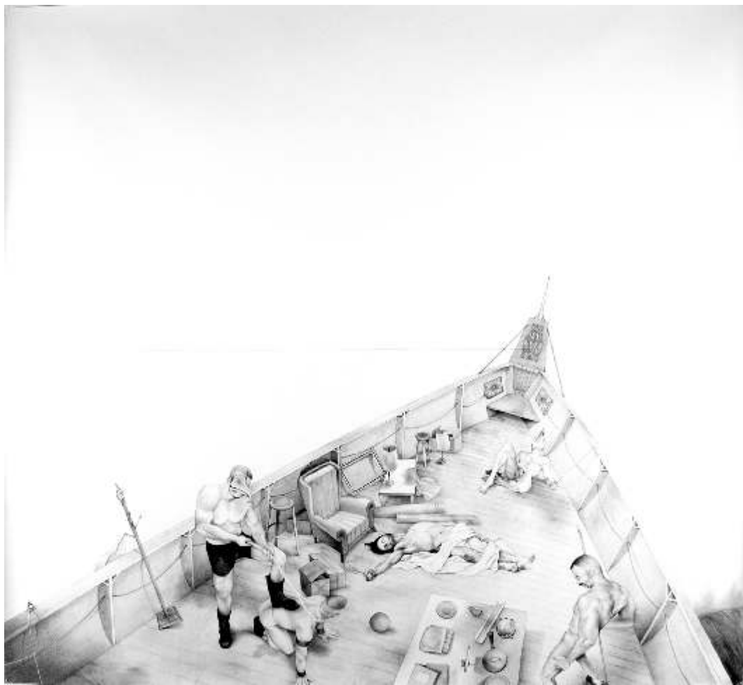
Market Graphite on paper 86 x 110 in, two panels