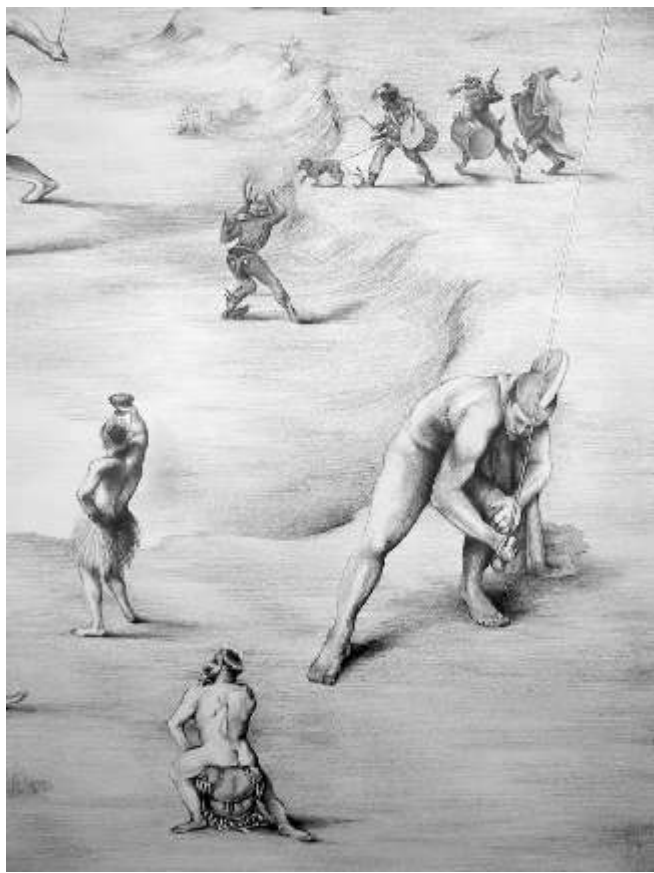
The World is Flat, detail