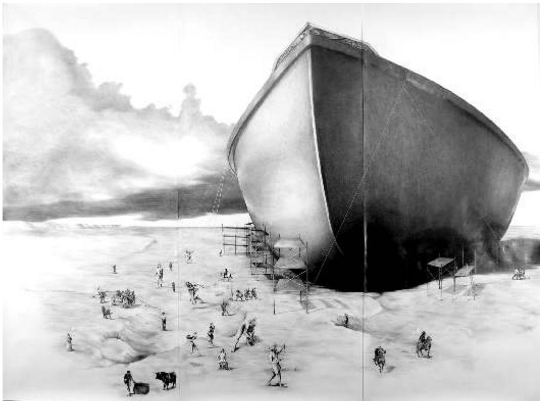
The World is Flat Graphite on paper 91 x 126 in, three panels