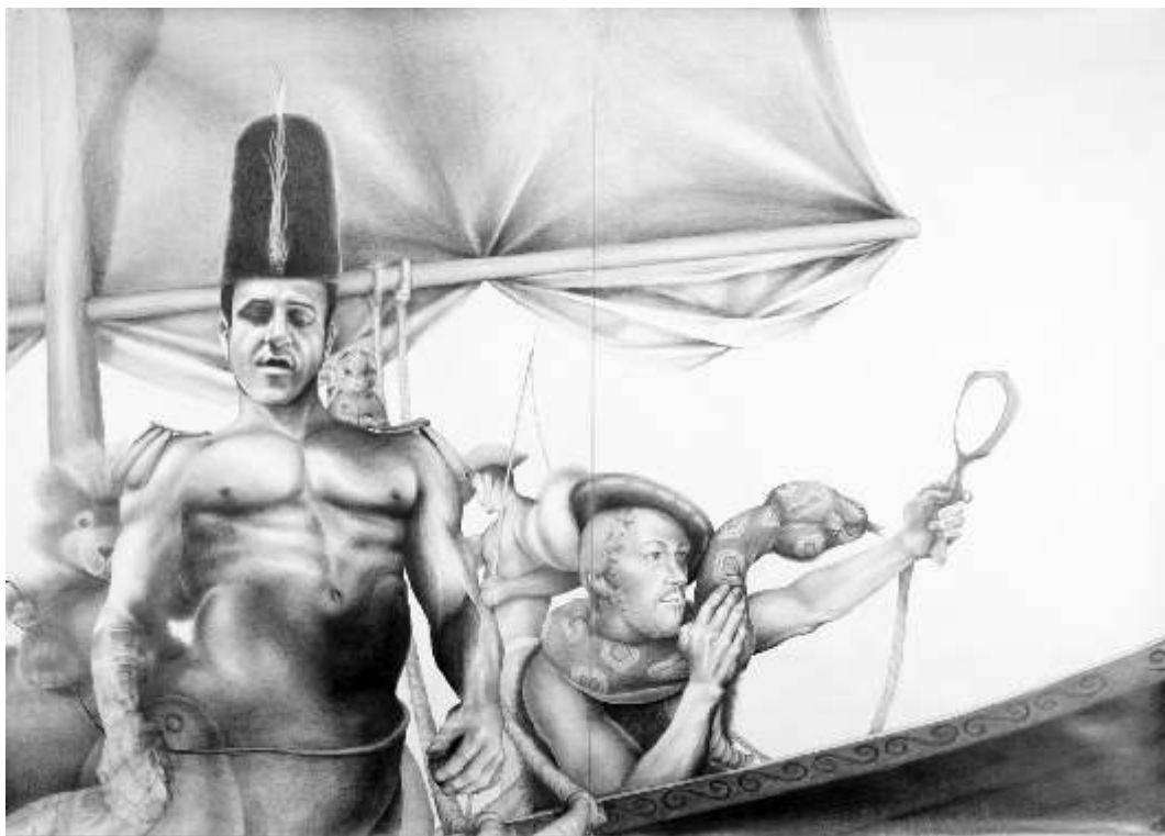
Voyage, 2005 graphite on paper 86 x 96 in, two panels