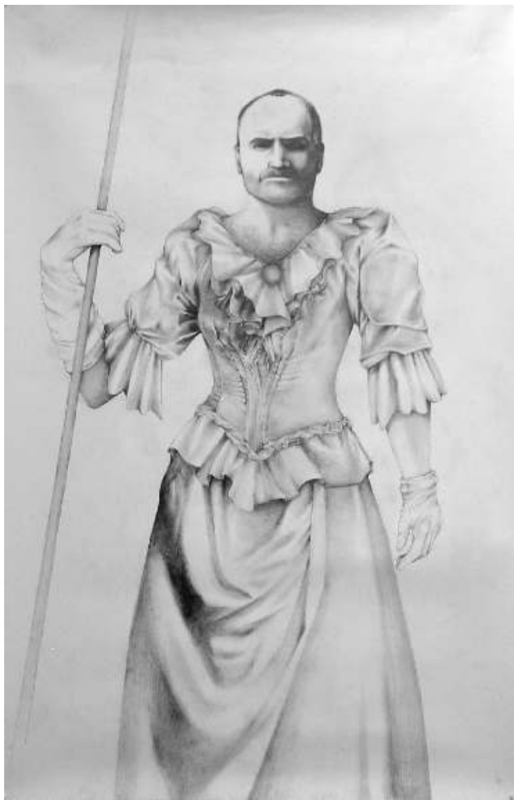
Ball Gown 1898 Graphite on paper 39.5 x 61 in