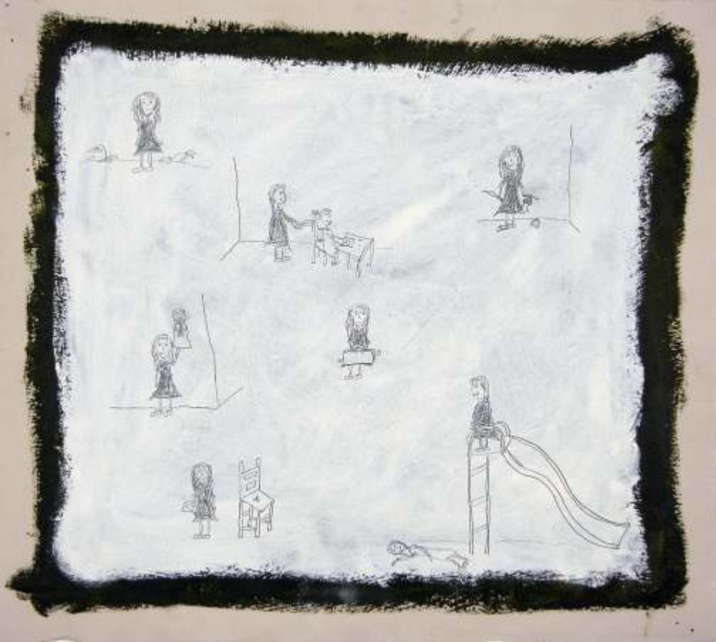
The Things That Bad Little Girls Do (part 2) oil stick on paper 11"x12.5" 2000