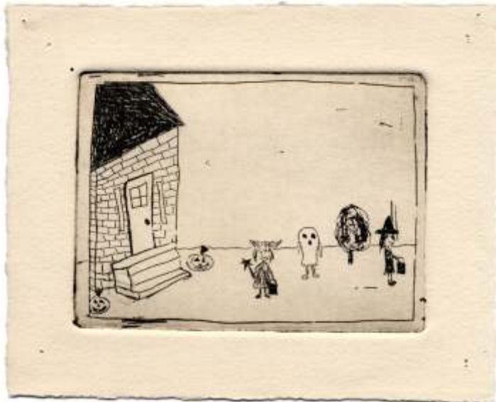
Trick or Treat (part 1,2) intaglio two panels, 5"x6.5" each 2000