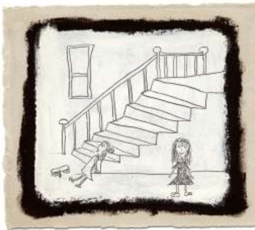
Rollerskate (part 1,2,3) oil stick on paper three panels, 5"x5.5" each 2000