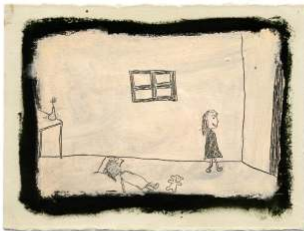
Teddy Bear (part 1,2,3) oil stick on paper three panels, 5.5"x7.5" each 2000