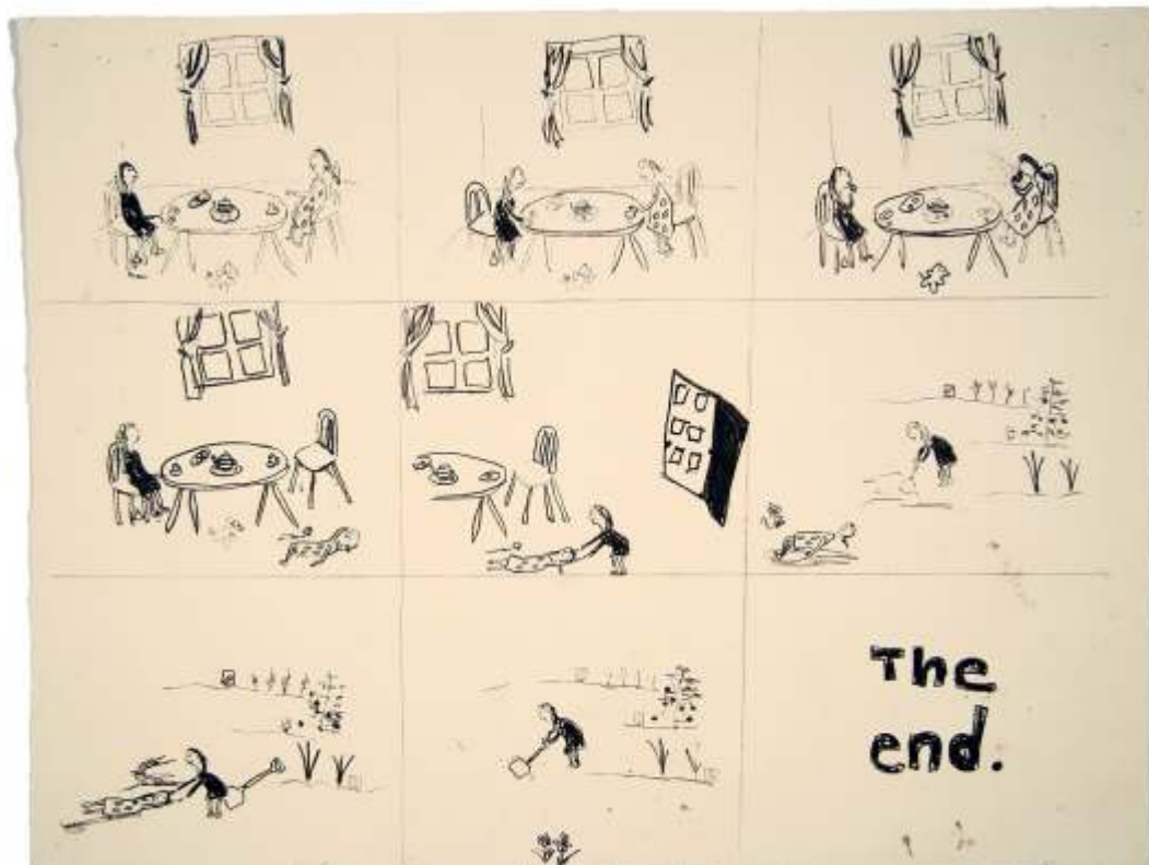
Tea Party lithograph 17"x22.5" 1998