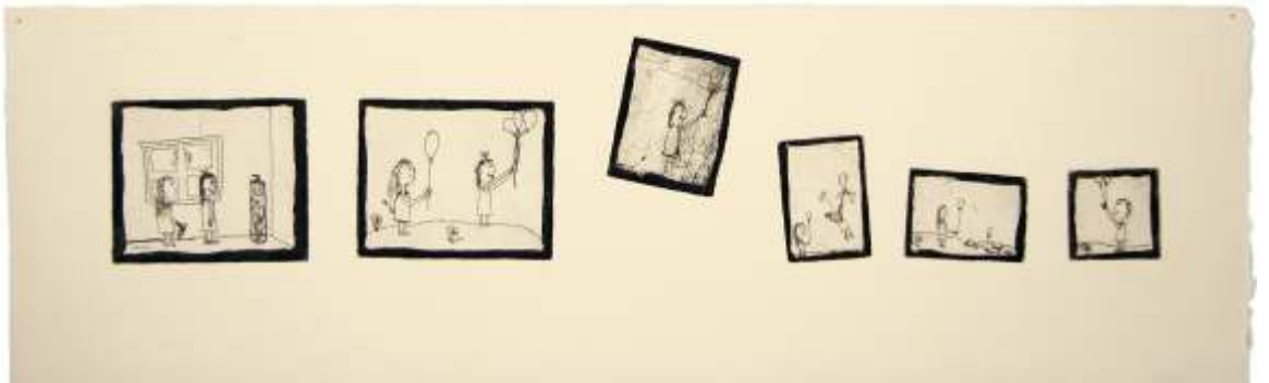
Balloon intaglio 5.75"x19" 1998