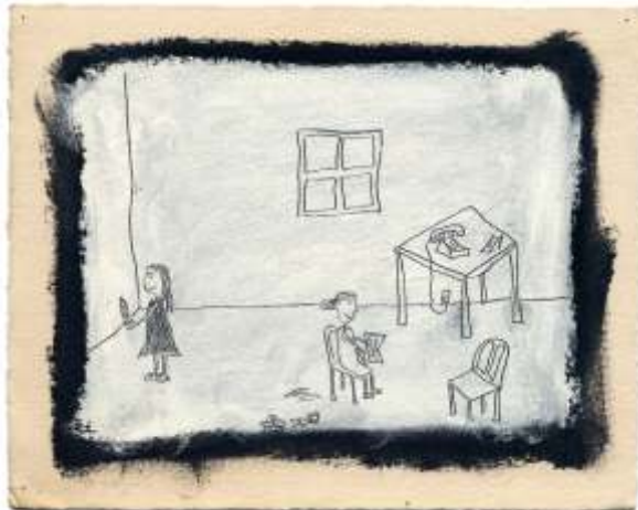
Pigtails (part 1,2,3) oil stick on paper three panels, 5.5"x7" each 2000