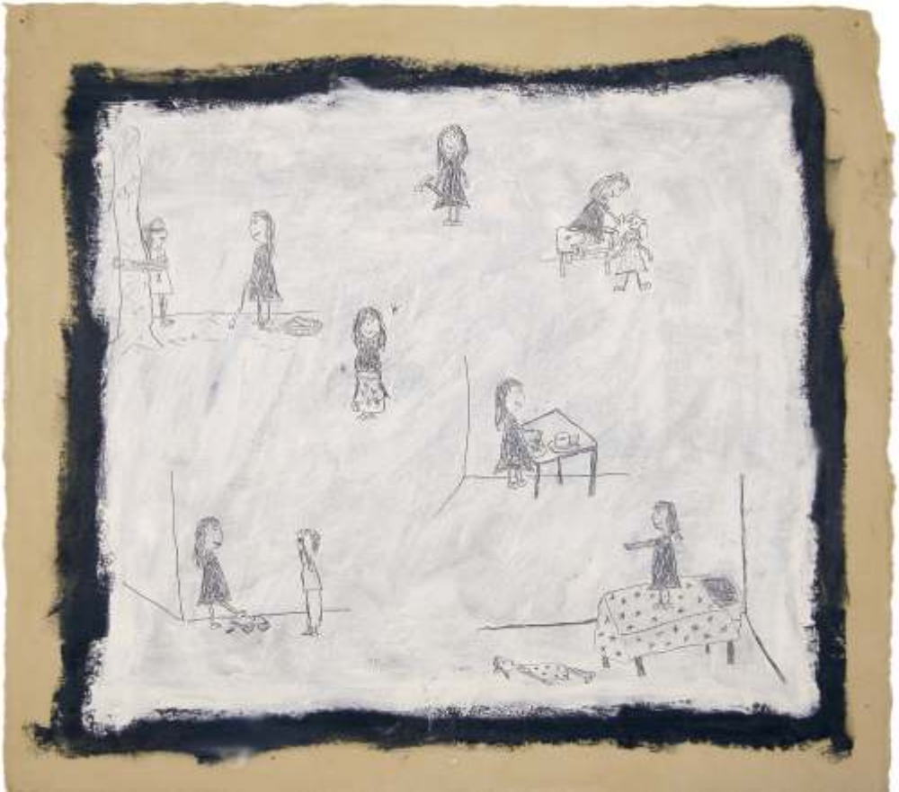
The Things That Bad Little Girls Do (part 1) oil stick on paper 11"x12.5" 2000