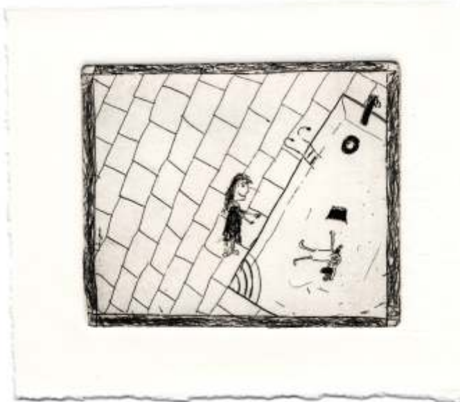
Swimming Pool (part 1,2) intaglio two panels, 4.25"x5.75" each 2000