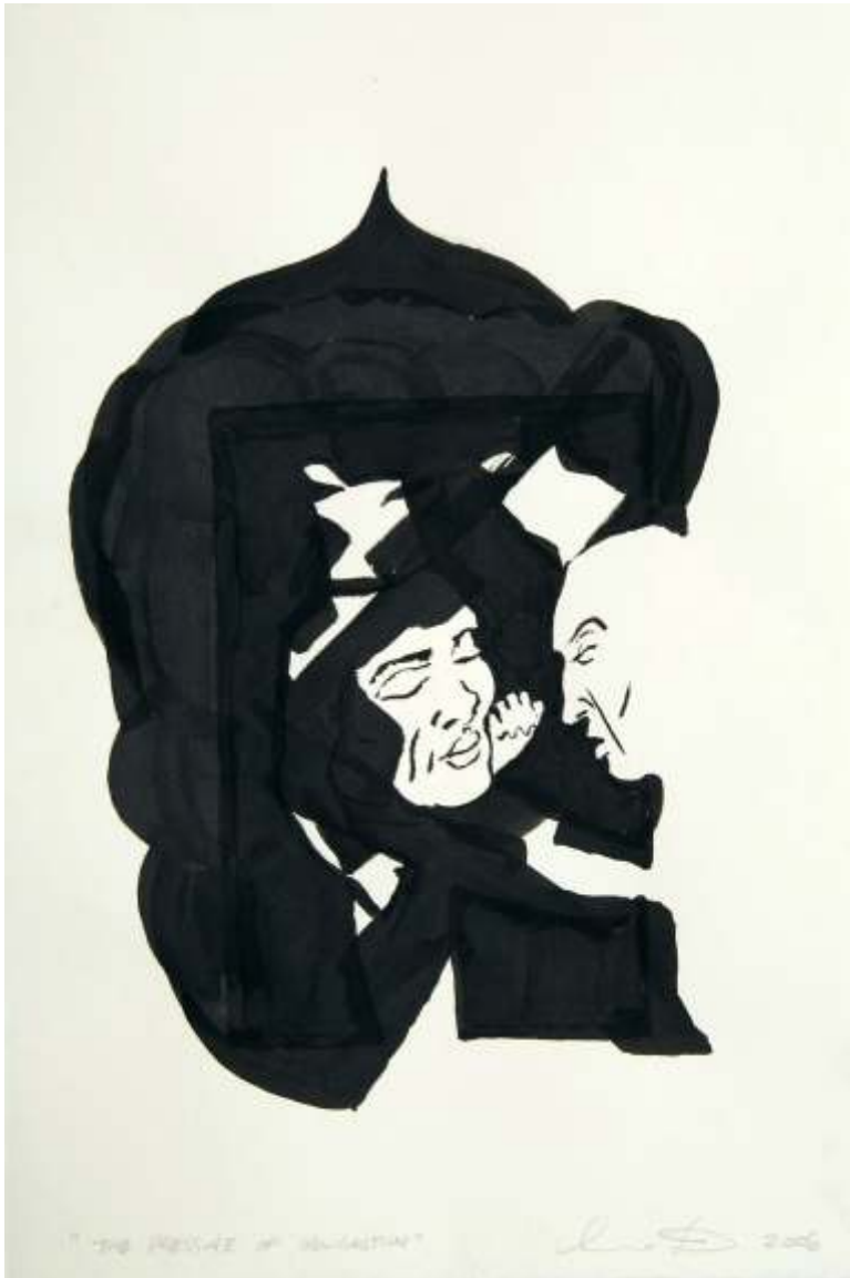
"The Pressure of Obligation" ink on paper 22 x 15 in 2006