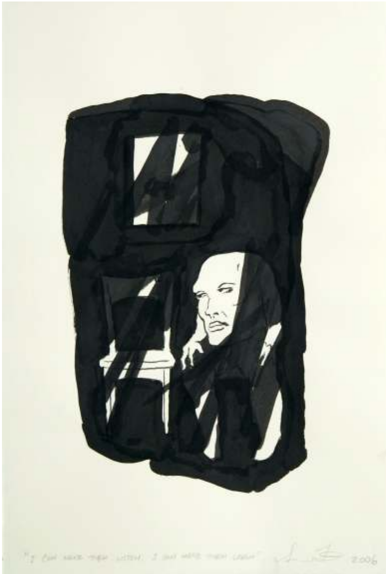
"I Can Make Them Listen, I Can Make Them Learn" ink on paper 22 x 15 in 2006