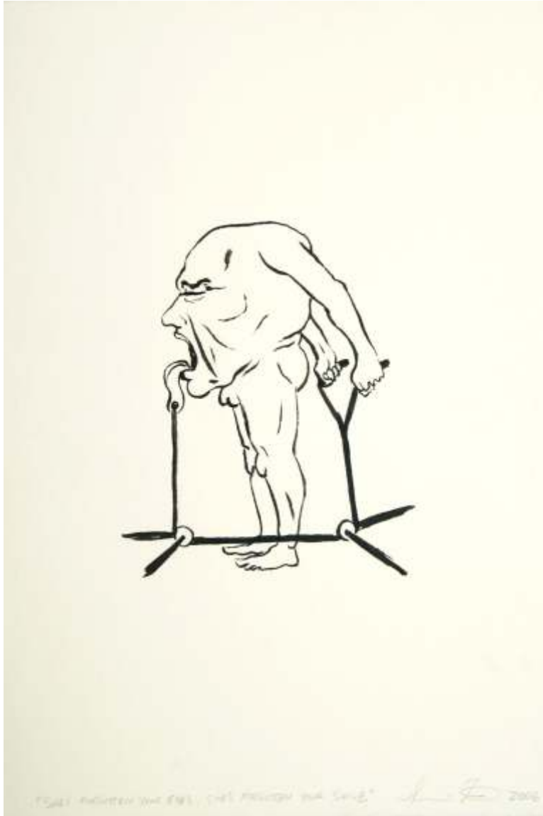
"She's Forgotten Your Smile, She's Forgotten Your Smile" ink on paper 22 x 15 in 2006