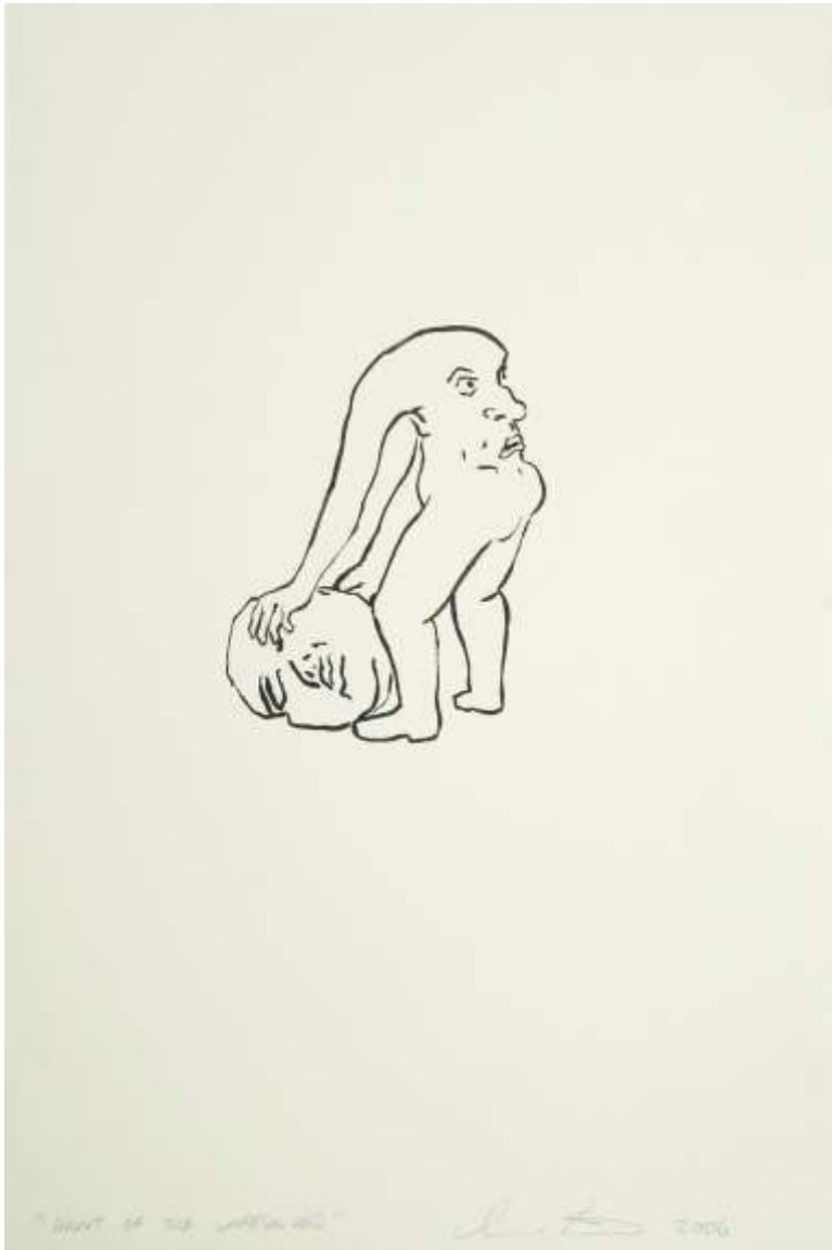
"Haunt of the Unresolved" ink on paper 22 x 15 in 2006