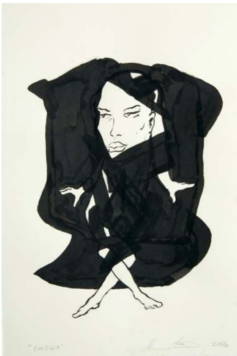
"CorDula" ink on paper 22 x 15 in 2006