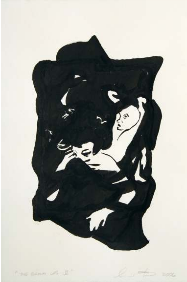
"The Grown Ups II" ink on paper 22 x 15 in 2006