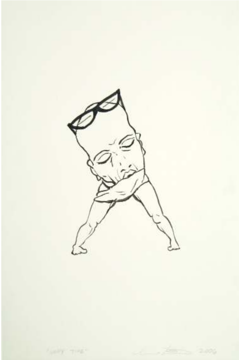
"Happy Time" ink on paper 22 x 15 in 2006