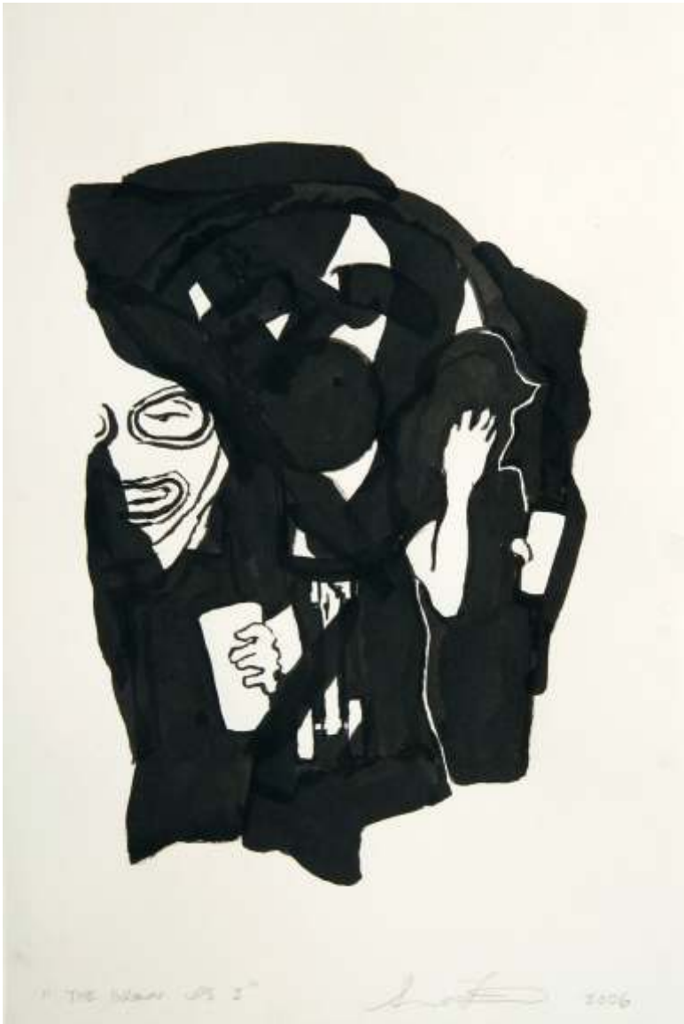
"The Grown Ups I" ink on paper 22 x 15 in 2006