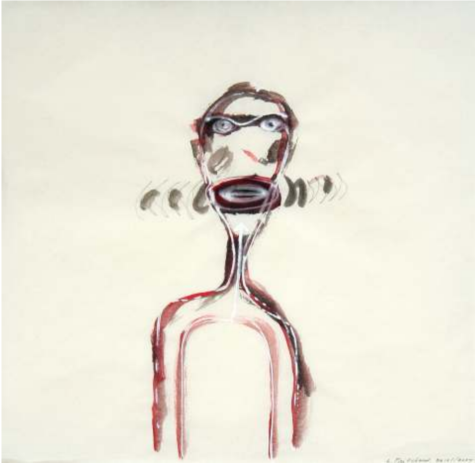
Untitled ink, gouache, charcoal, acrylic, pencil on washi 12.5 x 12.25 in 2004