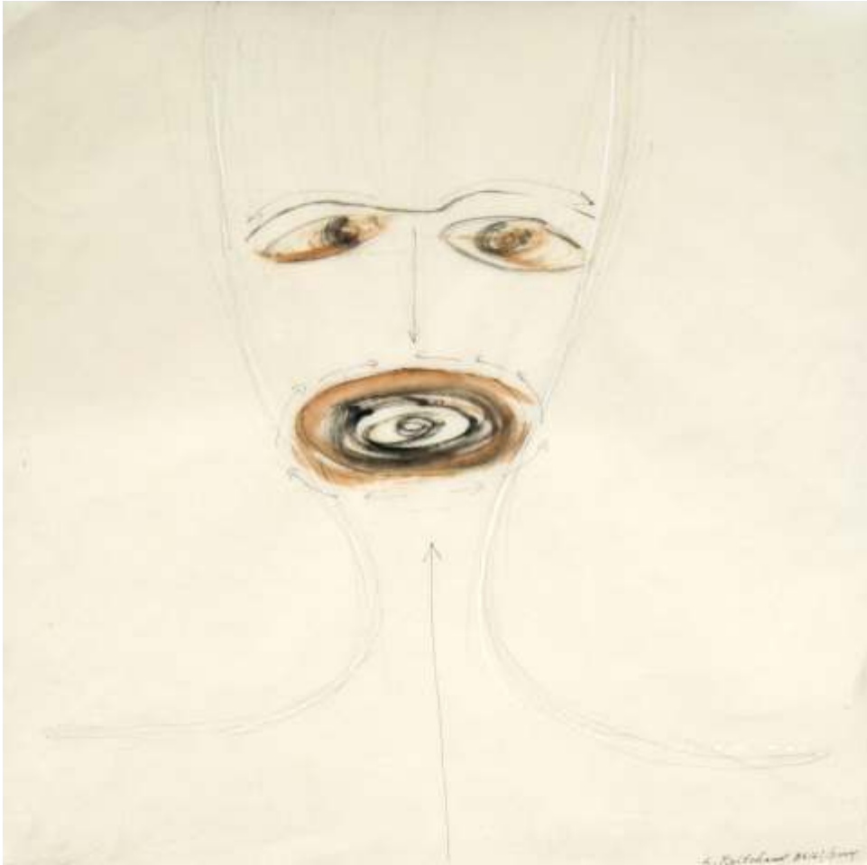
Untitled ink, gouache, charcoal, acrylic, pencil on washi 12.5 x 12.25 in 2004