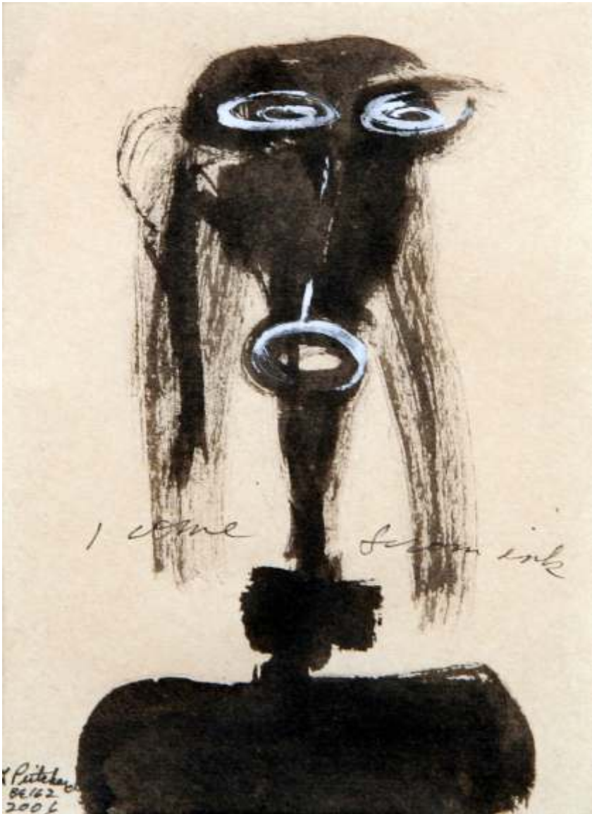
I Come From Ink ink, gouache, charcoal, acrylic, pencil on washi 6 x 4.5 in 2006