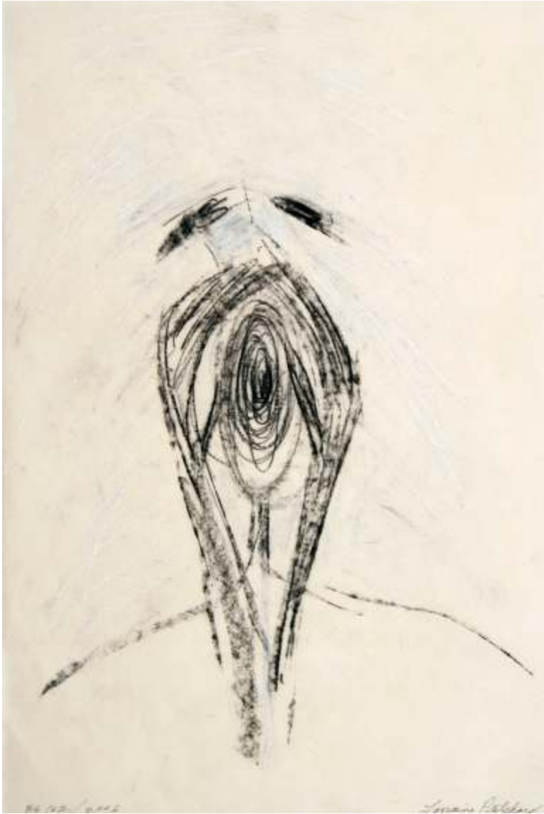
Untitled ink, gouache, charcoal, acrylic, pencil on washi 18 x 12.25 in 2006