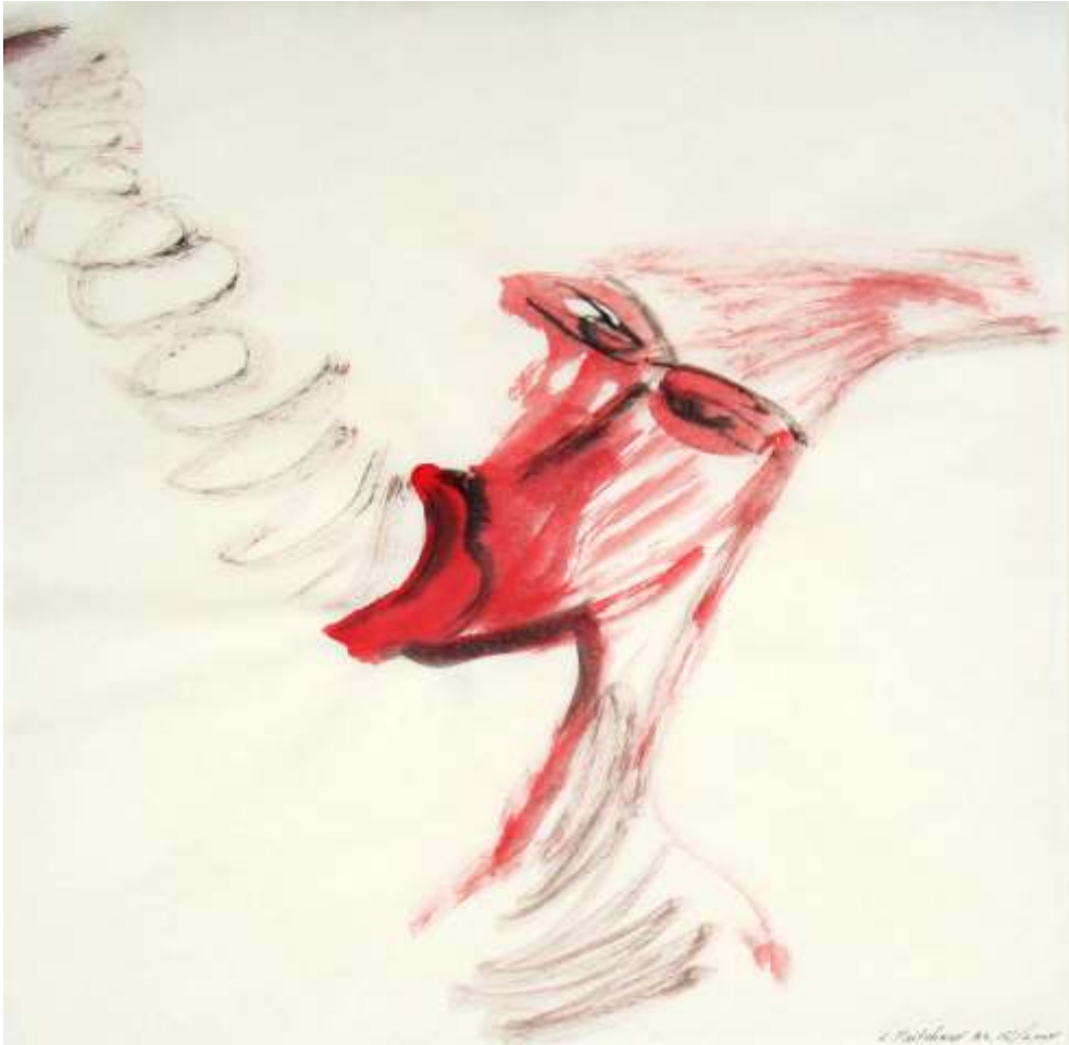
Untitled ink, gouache, charcoal, acrylic, pencil on washi 12.5 x 12.25 in 2004