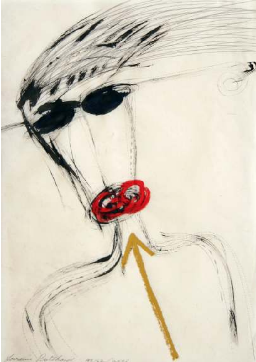
Untitled ink, gouache, charcoal, acrylic, pencil on washi 18.5 x 13.25 in 2006