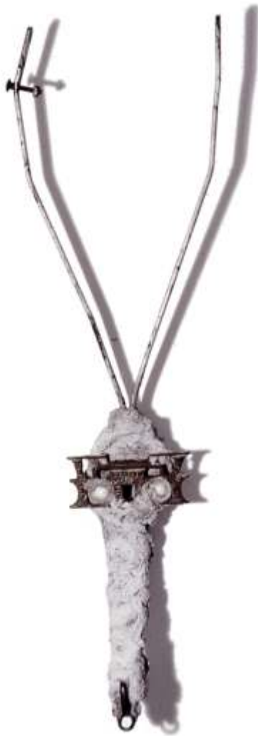
Antelope mixed media 29 x 8.25 x 6 in 1990