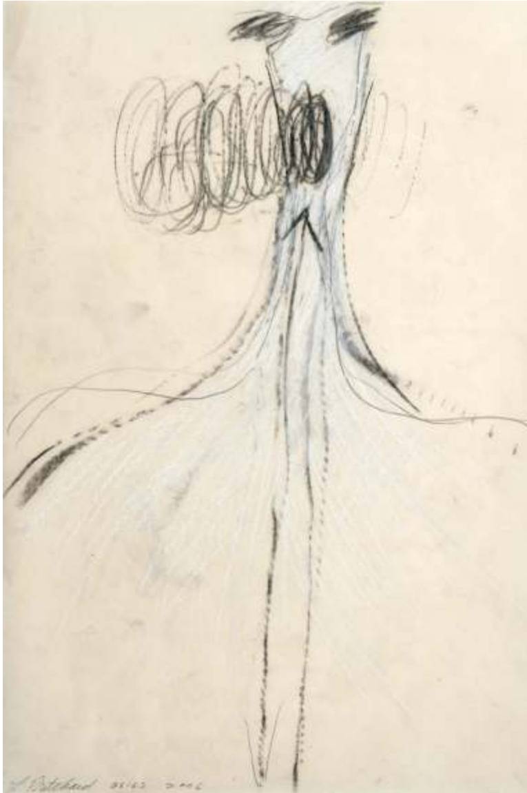
Untitled ink, gouache, charcoal, acrylic, pencil on washi 18 x 12.25 in 2006