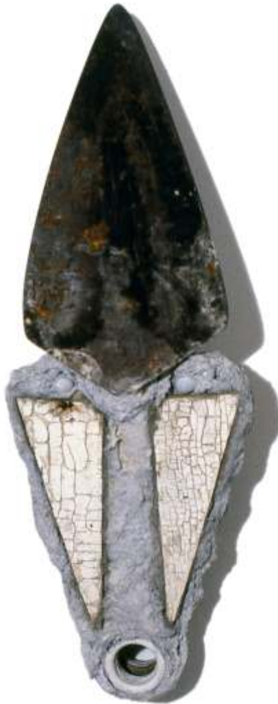
Guard mixed media 19 x 6.5 x 4 in 1990