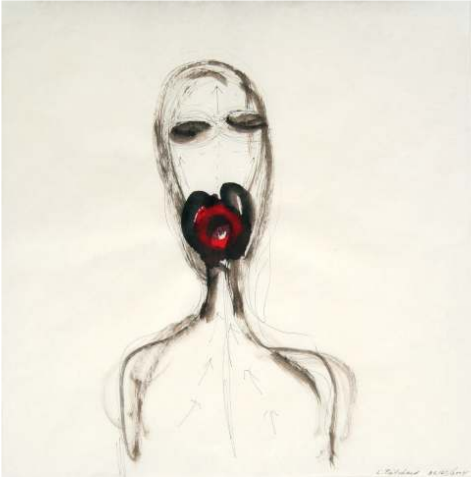
Untitled ink, gouache, charcoal, acrylic, pencil on washi 12.5 x 12.25 in 2004