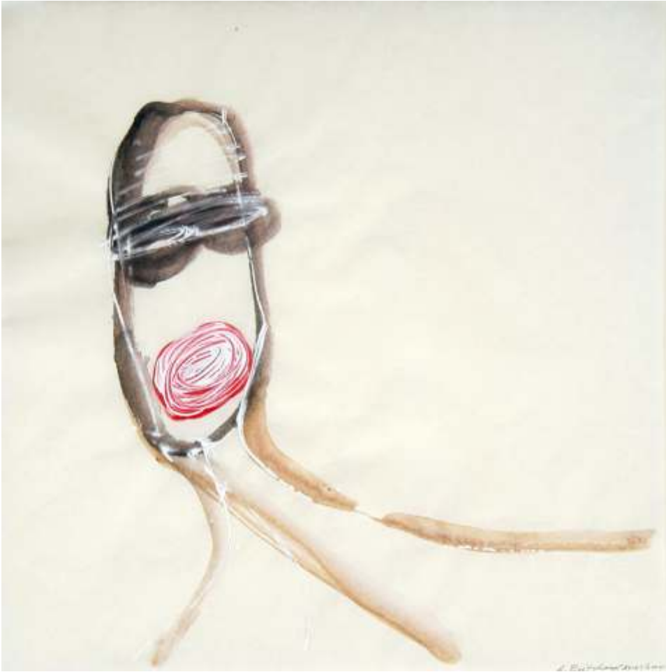
Untitled ink, gouache, charcoal, acrylic, pencil on washi 12.5 x 12.25 in 2004