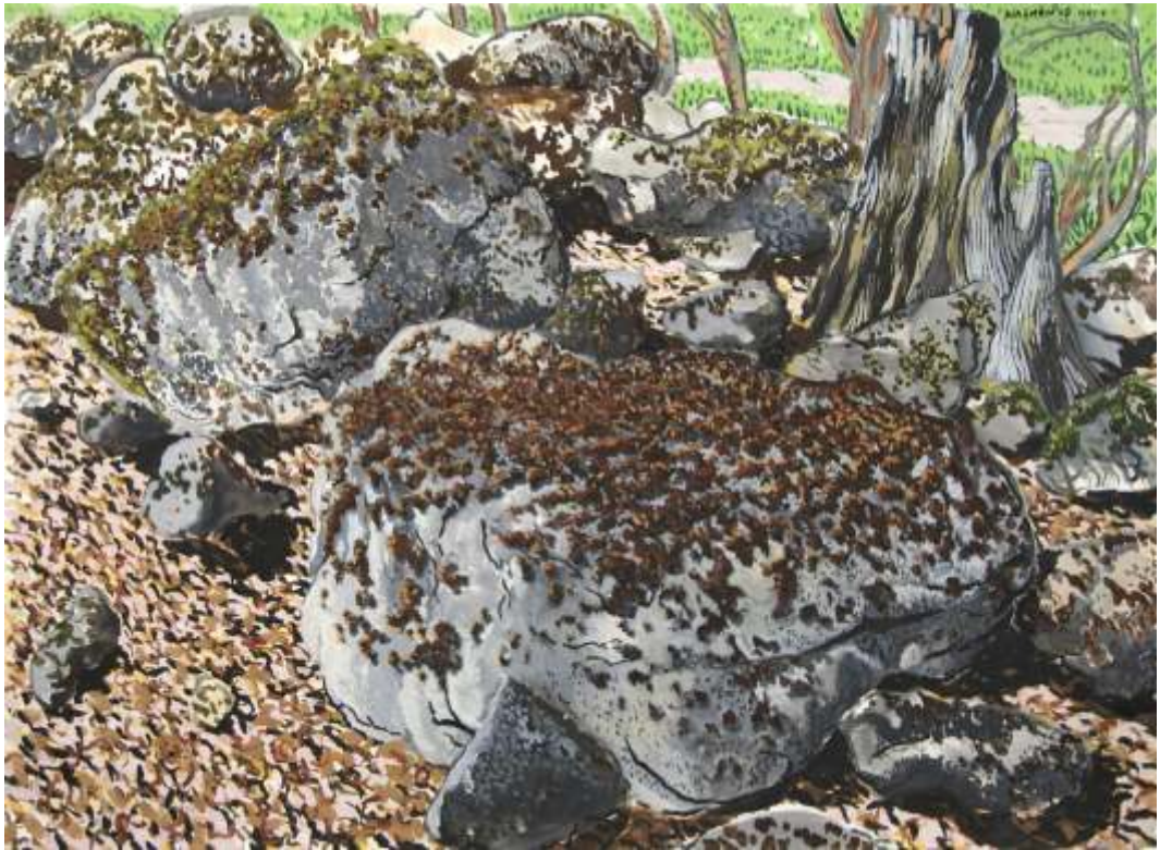
Rock & Moss Watercolour on paper 22 x 30 in 2005