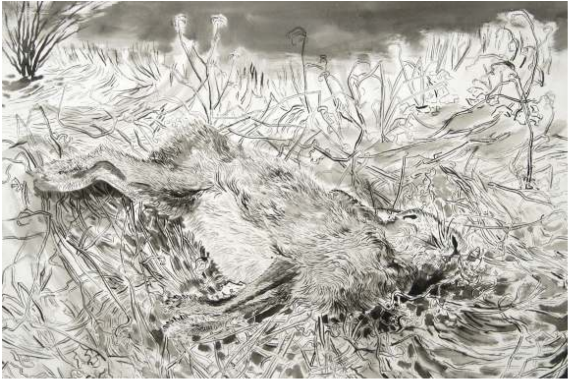
Dead Rabbit Ink on paper 22 x 30 in 2005