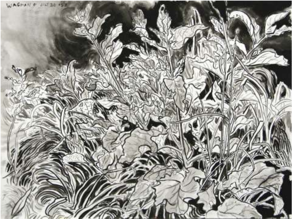
Burdock Ink on paper 18 x 24 in 2001