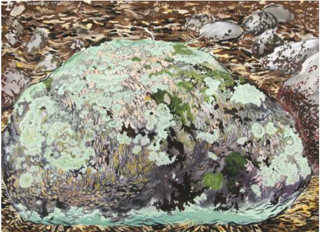
Rock With Lichens Watercolour on paper 18 x 24 in 2004