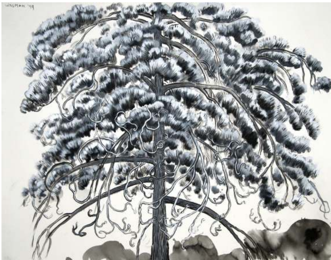
Pine Tree Ink and watercolour on paper 35 x 45 in 1999