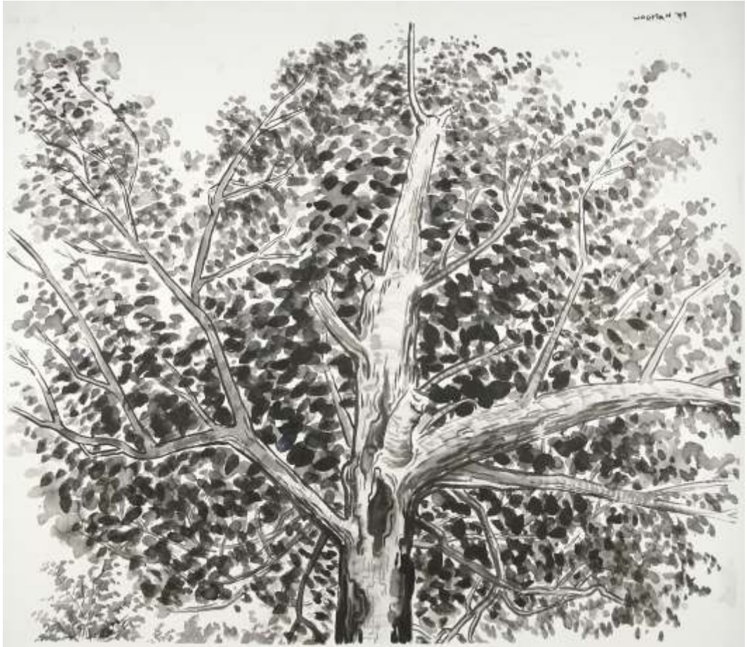
Maple Tree Ink on paper 29 x 34 in 1999