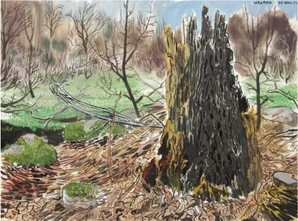
Stump Watercolour on paper 18 x 24 in 2003