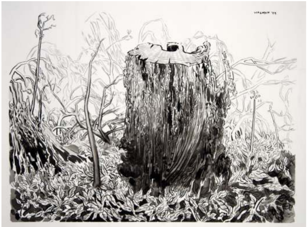
Old Stump Ink on paper 32 x 43 in 1999