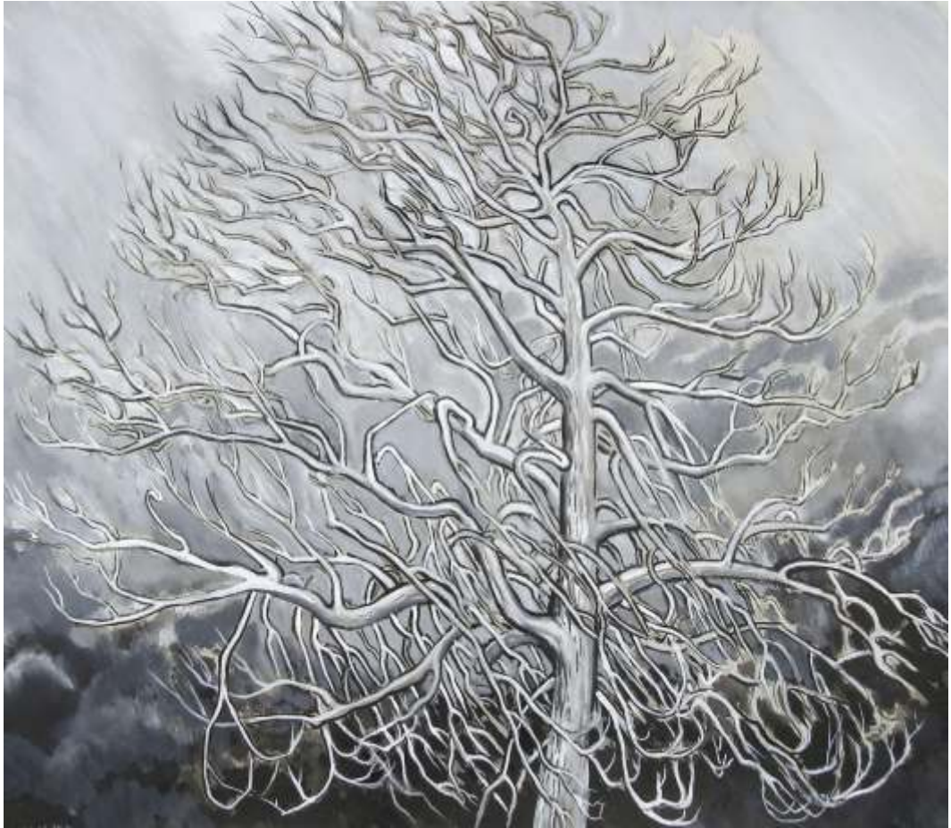
Bare Tree Ink and watercolour on paper 31 x 35 in 1998