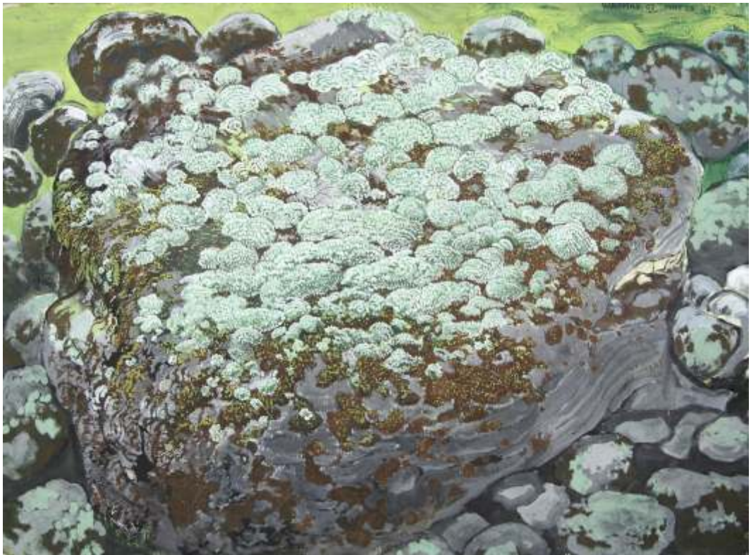
Rock & Lichen Watercolour on paper 22 x 30 in 2002