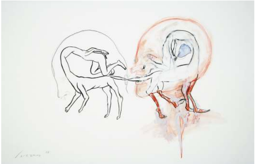
Untitled 10: Fables Without Morals pastel, ink, pencil 13"x20" 2005