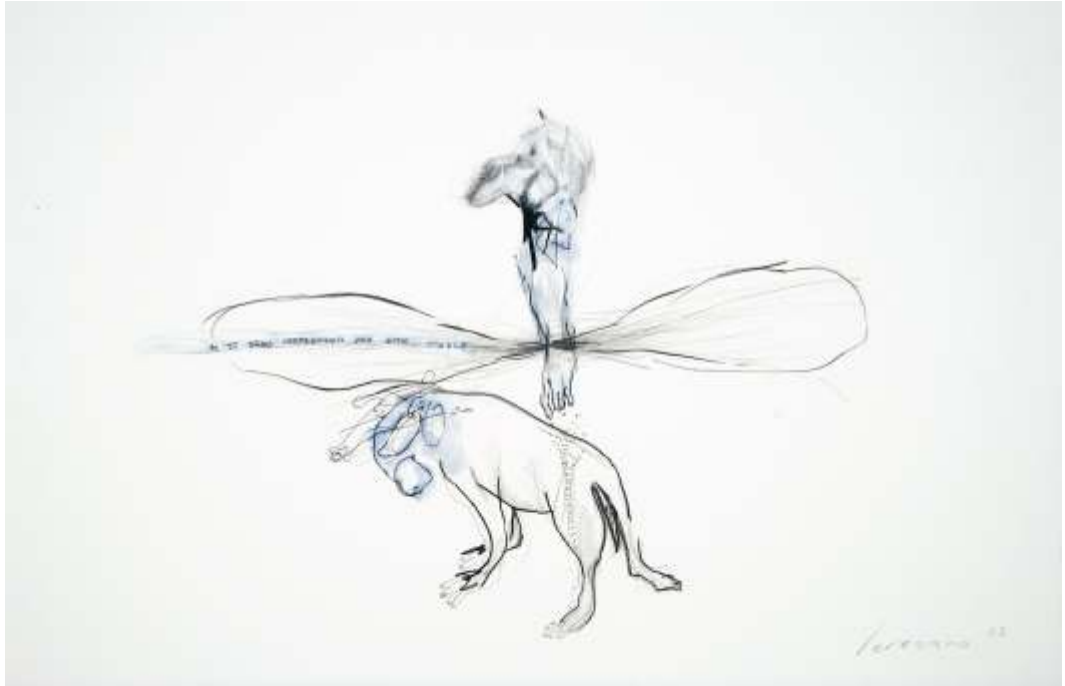
Untitled 3: Fables Without Morals pastel, ink, pencil 13"x20" 2005