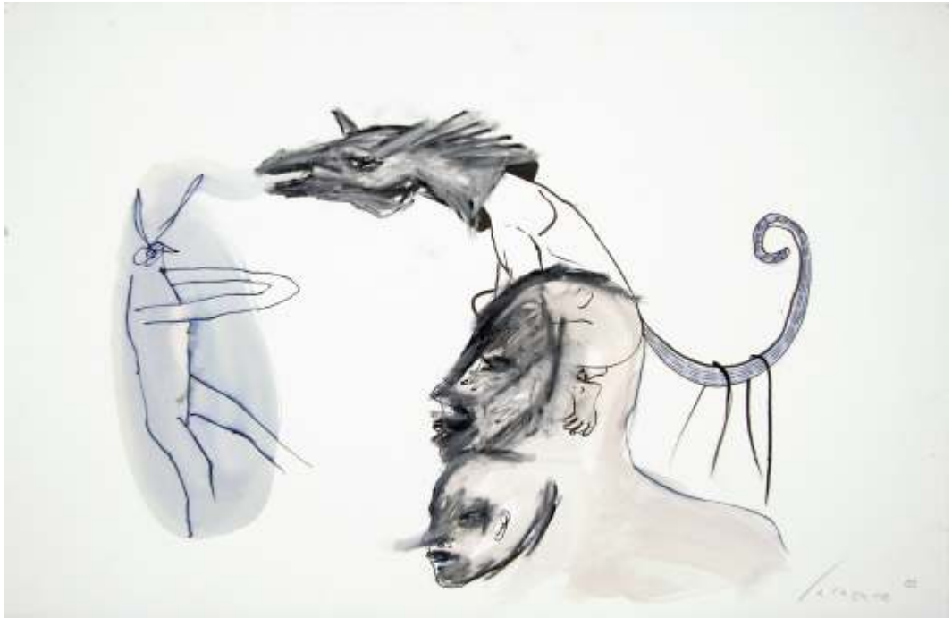
Untitled 4: Fables Without Morals pastel, ink, pencil 13"x20" 2005