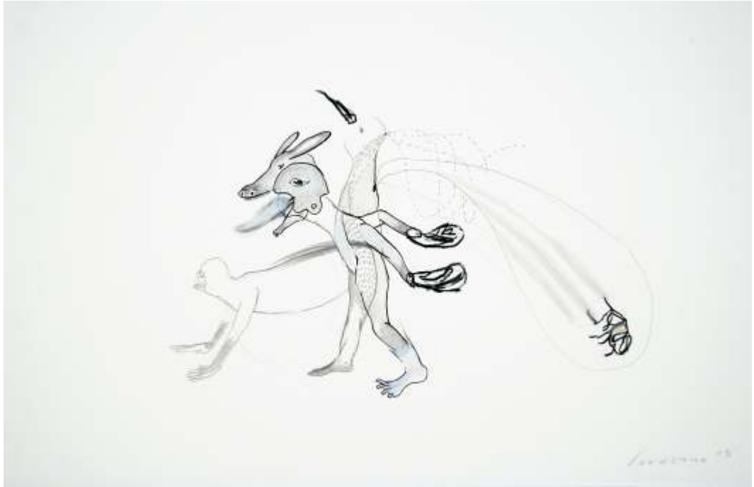
Untitled 1: Fables Without Morals pastel, ink, pencil 13"x20" 2005