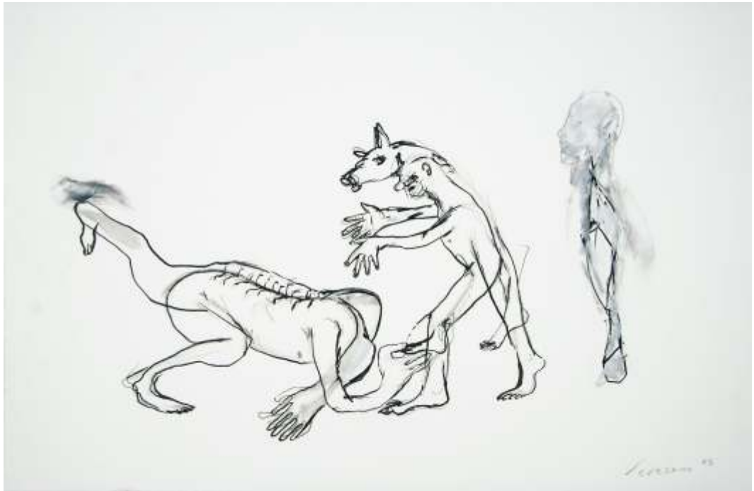
Untitled 6: Fables Without Morals pastel, ink, pencil 13"x20" 2005