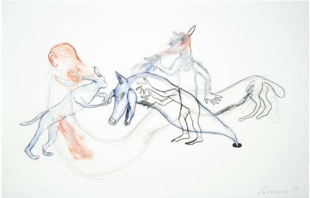
Untitled 8: Fables Without Morals pastel, ink, pencil 13"x20" 2005