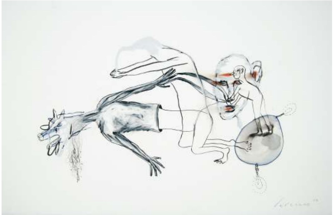
Untitled 5: Fables Without Morals pastel, ink, pencil 13"x20" 2005