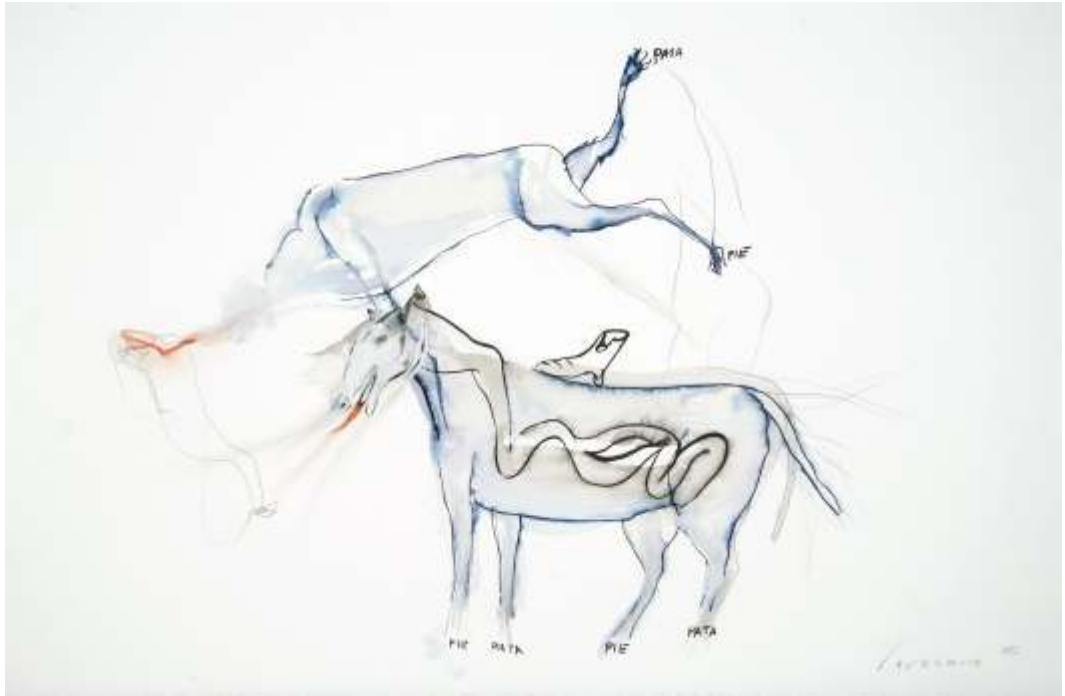
Untitled 7: Fables Without Morals pastel, ink, pencil 13"x20" 2005