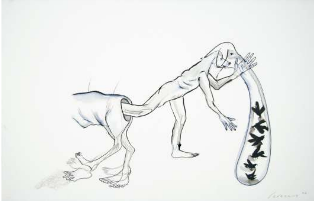
Untitled 2: Fables Without Morals pastel, ink, pencil 13"x20" 2005