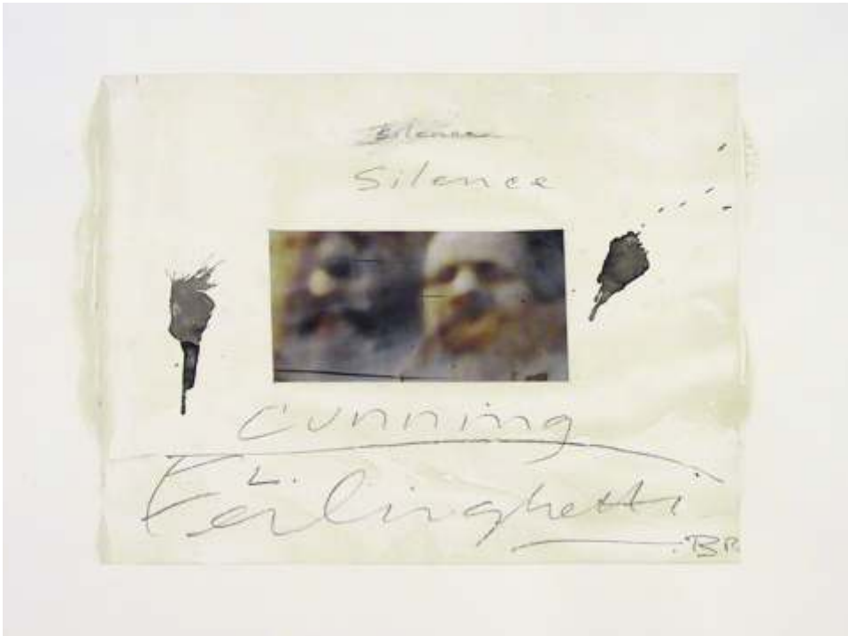
Silence Silence Cuning Ferlinghetti digital print, mixed media, pencil paper 22x 30in, image 11.5x15in 2003