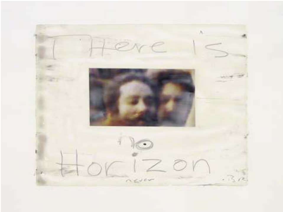
There is No Horizon Never digital print, mixed media, pencil paper 22x 30in, image 11.5x15in 2003