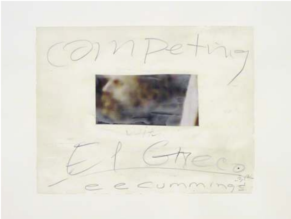
Competing With El Greco, e.e. cummings digital print, mixed media, pencil paper 22x 30in, image 11.5x15in 2003