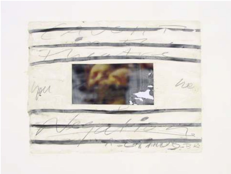
You We digital print, mixed media, pencil paper 22x 30in, image 11.5x15in 2003