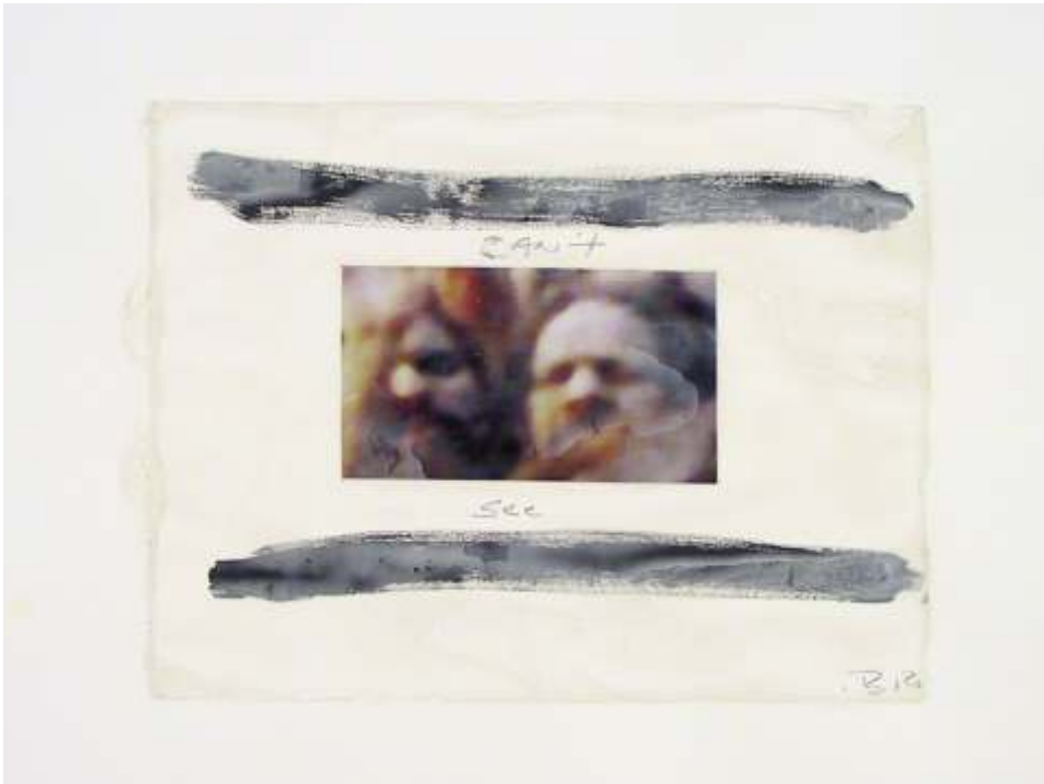
Can't See digital print, mixed media, pencil paper 22x 30in, image 11.5x15in 2003