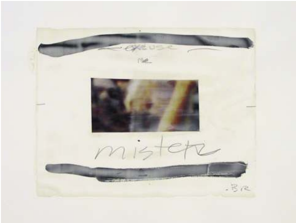
Excuse Me Mister digital print, mixed media, pencil paper 22x 30in, image 11.5x15in 2003