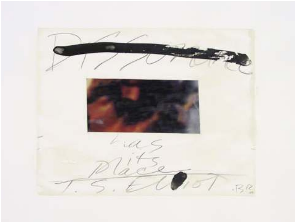
Dissonance Has Its Place, T.S. Eliot digital print, mixed media, pencil paper 22x 30in, image 11.5x15in 2003