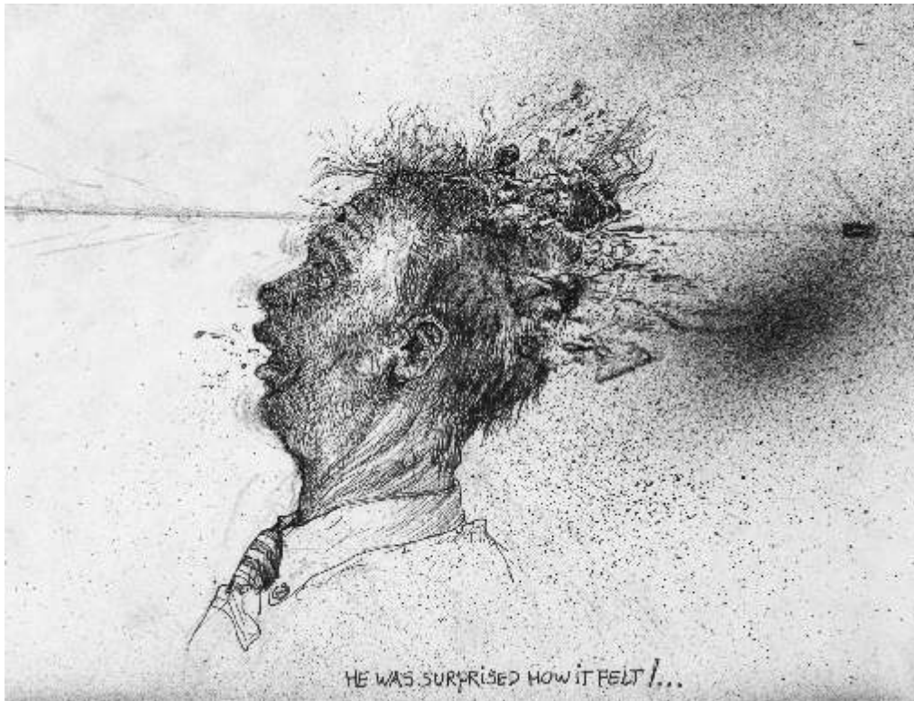
He Was Surprised How It Felt black ink, pen, pencil, spray paint 8.25 x 10.5 in, 2005