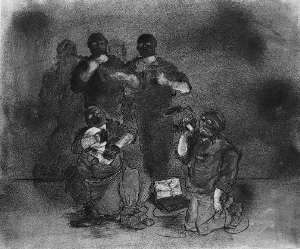
Baghdad Video Clip I charcoal powder, conte pencil, white crayon 14 x 17 in, 2005