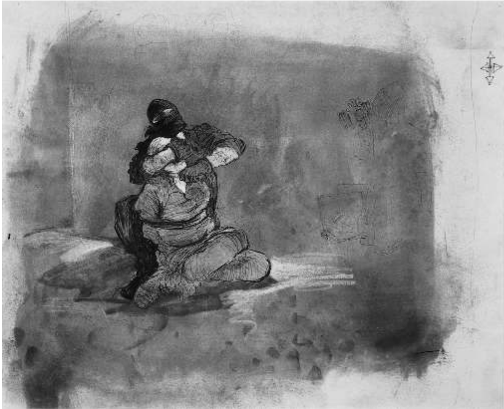
Baghdad Video Clip II charcoal powder, conte pencil, white crayon 14 x 17 in, 2005