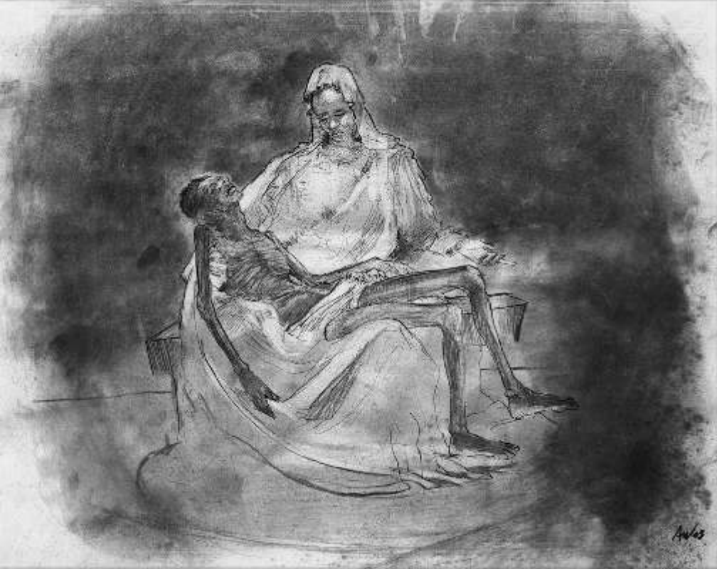
Aids Pieta charcoal powder, conte pencil 14 x 17 in, 2005