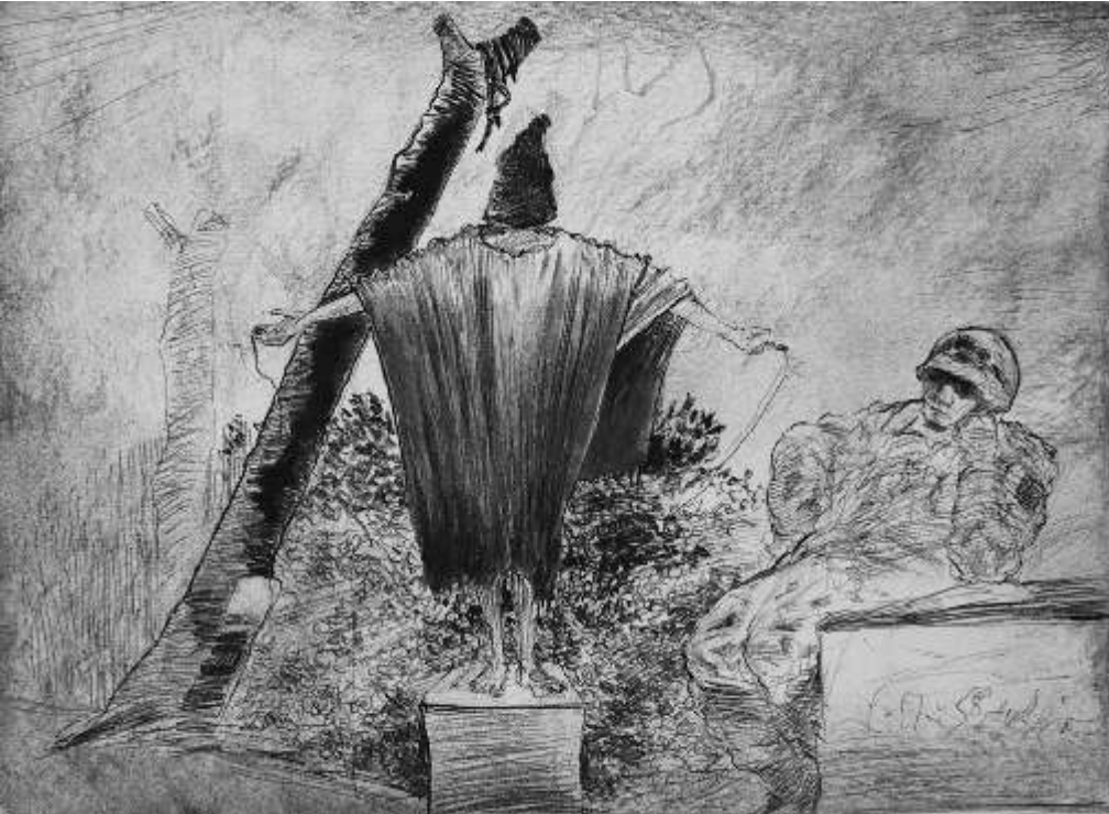
Abu Ghraib Prison Scandal 2005 charcoal powder, conte pencil 14 x 17 in, 2005