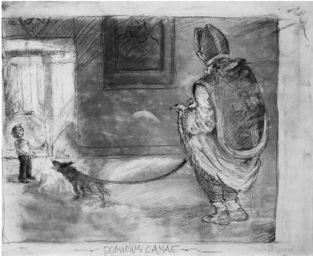
Dominus Canae charcoal powder, conte pencil 14 x 17 in, 2005