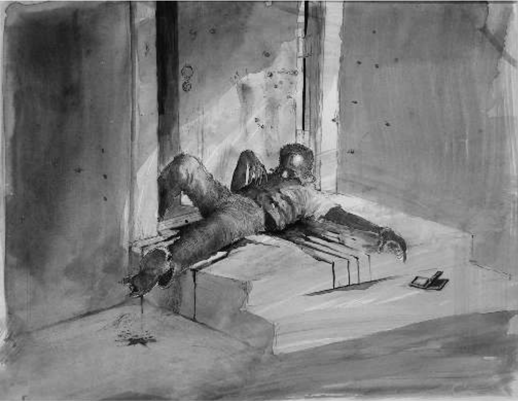
Amadoe Diallo Shooting 1999 pen, ink wash 14 x 17 in, 2005