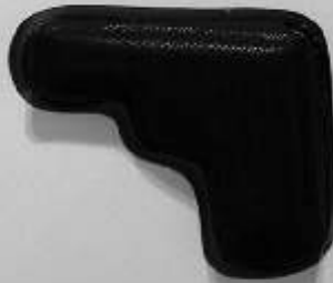
Amadoe Diallo Shooting Drawing and Gun Shaped Wallet Sculpture, Edition 1 matted in steel frame, leather, zipper, pen, ink wash