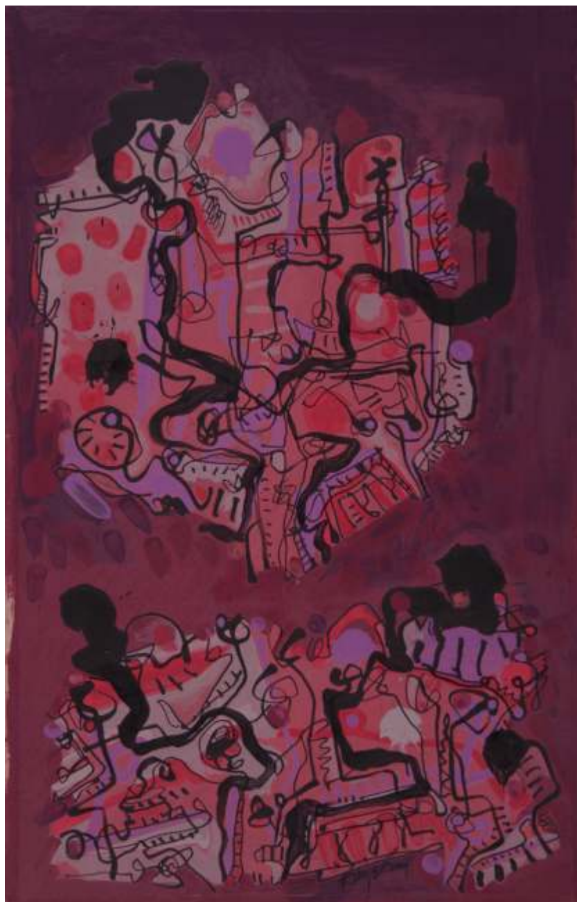
Untitled - 20 x13 inches - acrylic on paper - 2007