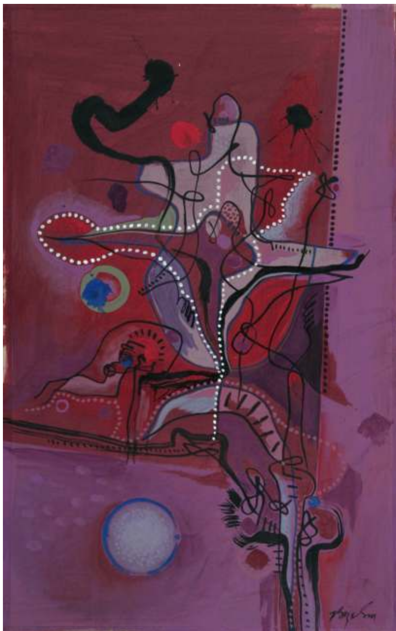
Untitled - 20 x13 inches - acrylic on paper - 2007