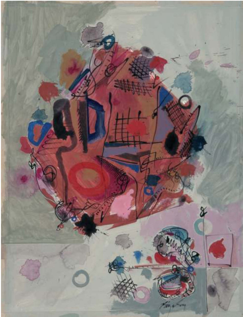
Untitled - 20 x 15 inches - acrylic on paper - 2007