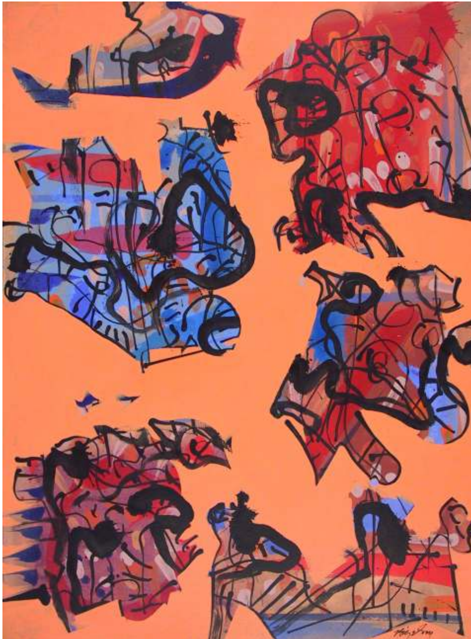
Right To Left - 30 x 22 inches - acrylic on paper - 2005