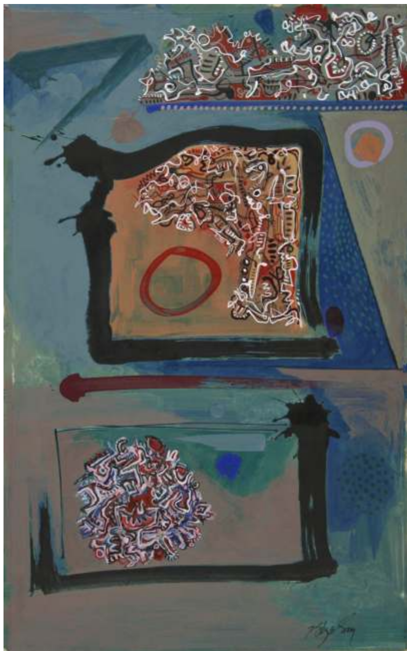
Untitled - 20 x13 inches - acrylic on paper - 2007