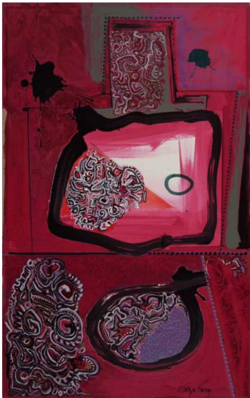
Untitled - 20 x13 inches - acrylic on paper - 2007