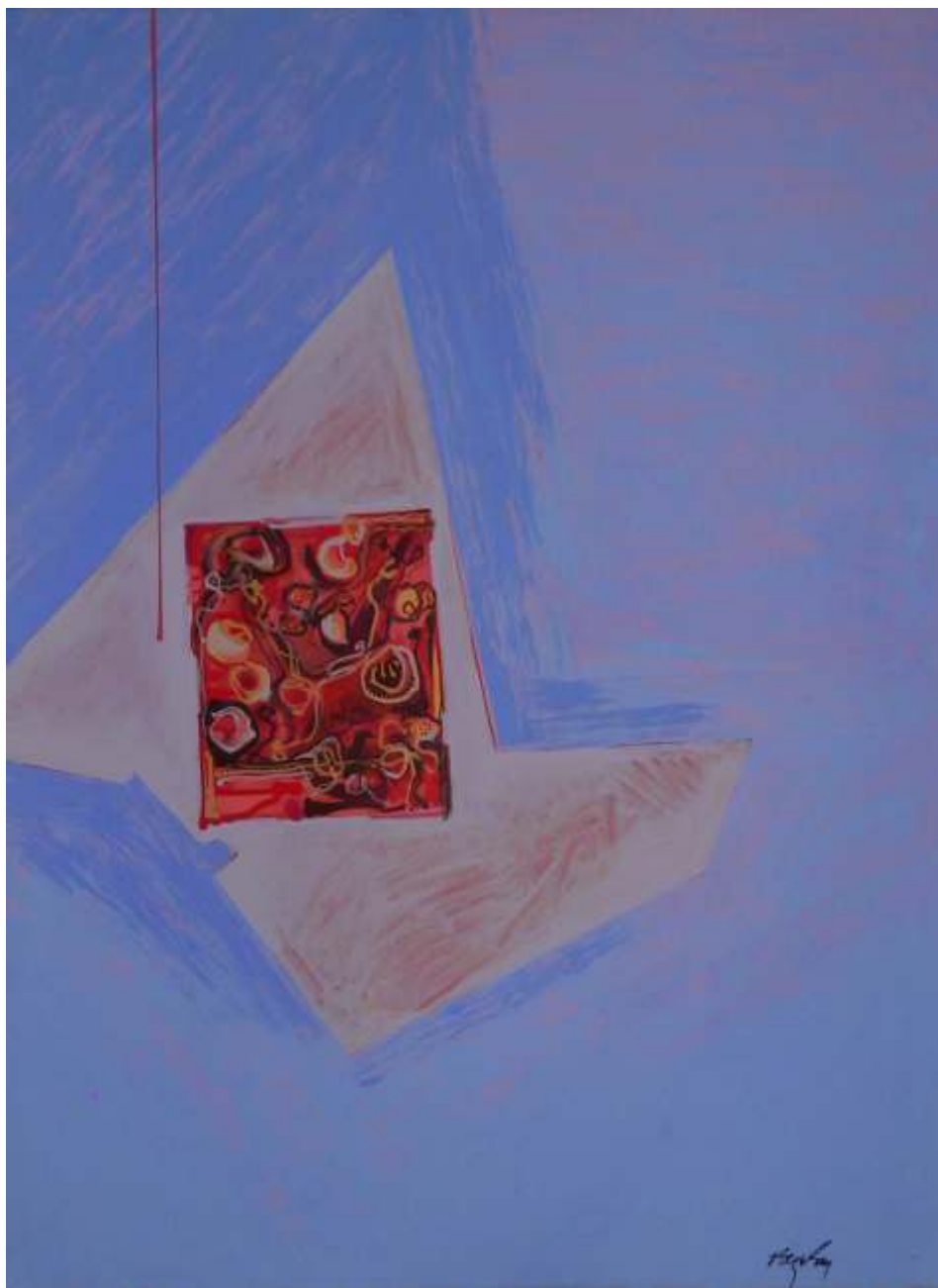
Smooth Sailing - 30 x 22 inches - acrylic on paper - 2005