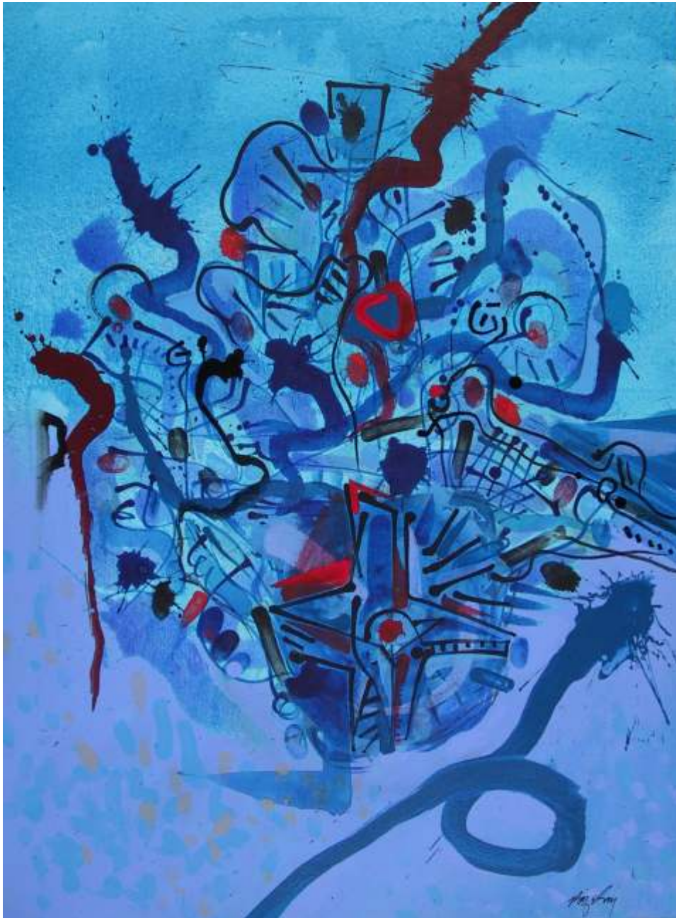
Ice Hot - 30 x 22 inches - acrylic on paper - 2005