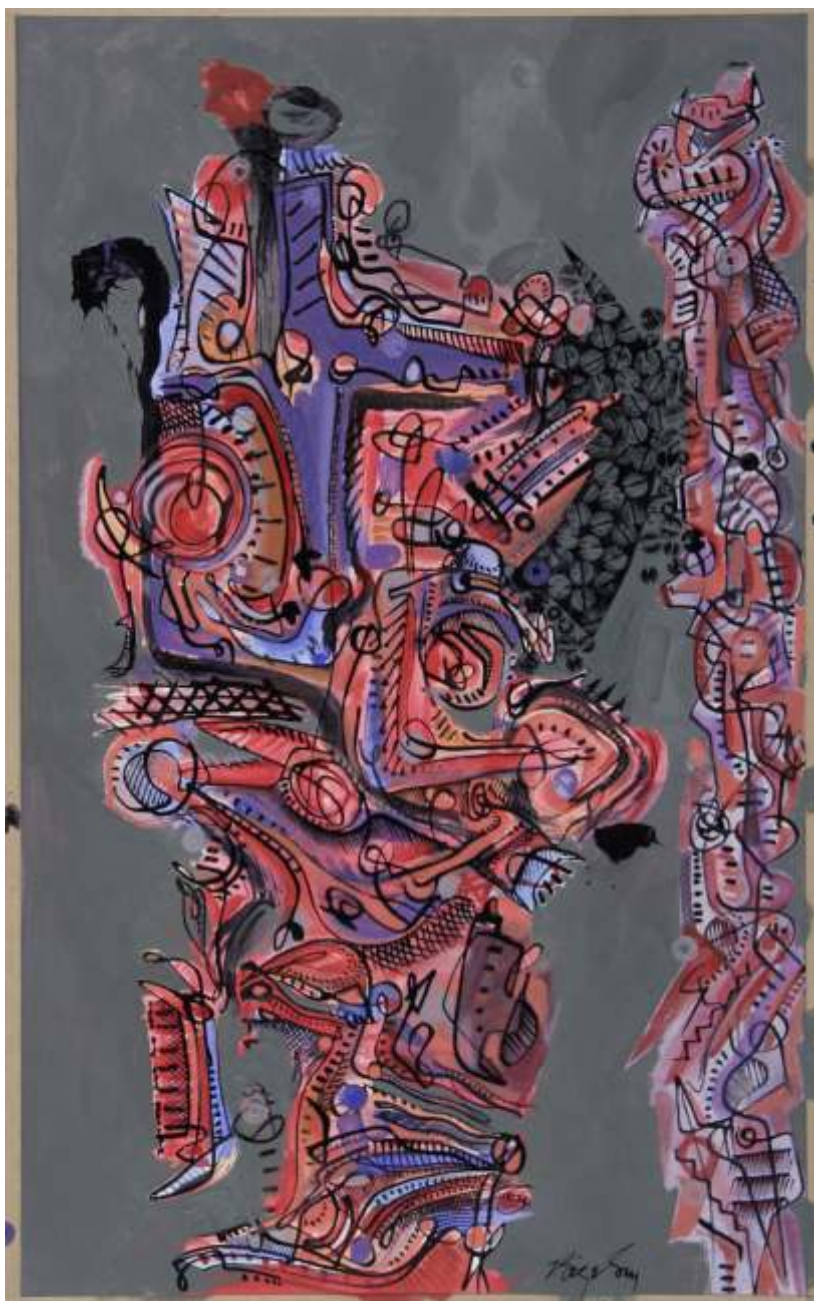
Untitled - 20 x 13 inches - acrylic on paper - 2007