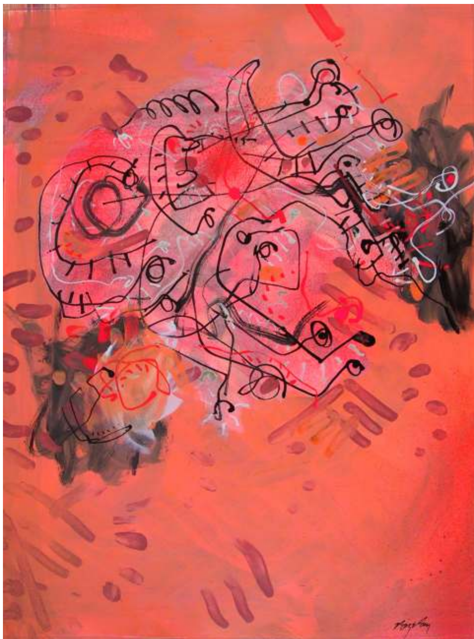
How Deep is Deep? - 30 x 22 inches - acrylic on paper - 2005