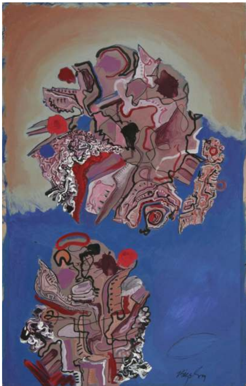
Untitled - 20 x13 inches - acrylic on paper - 2007