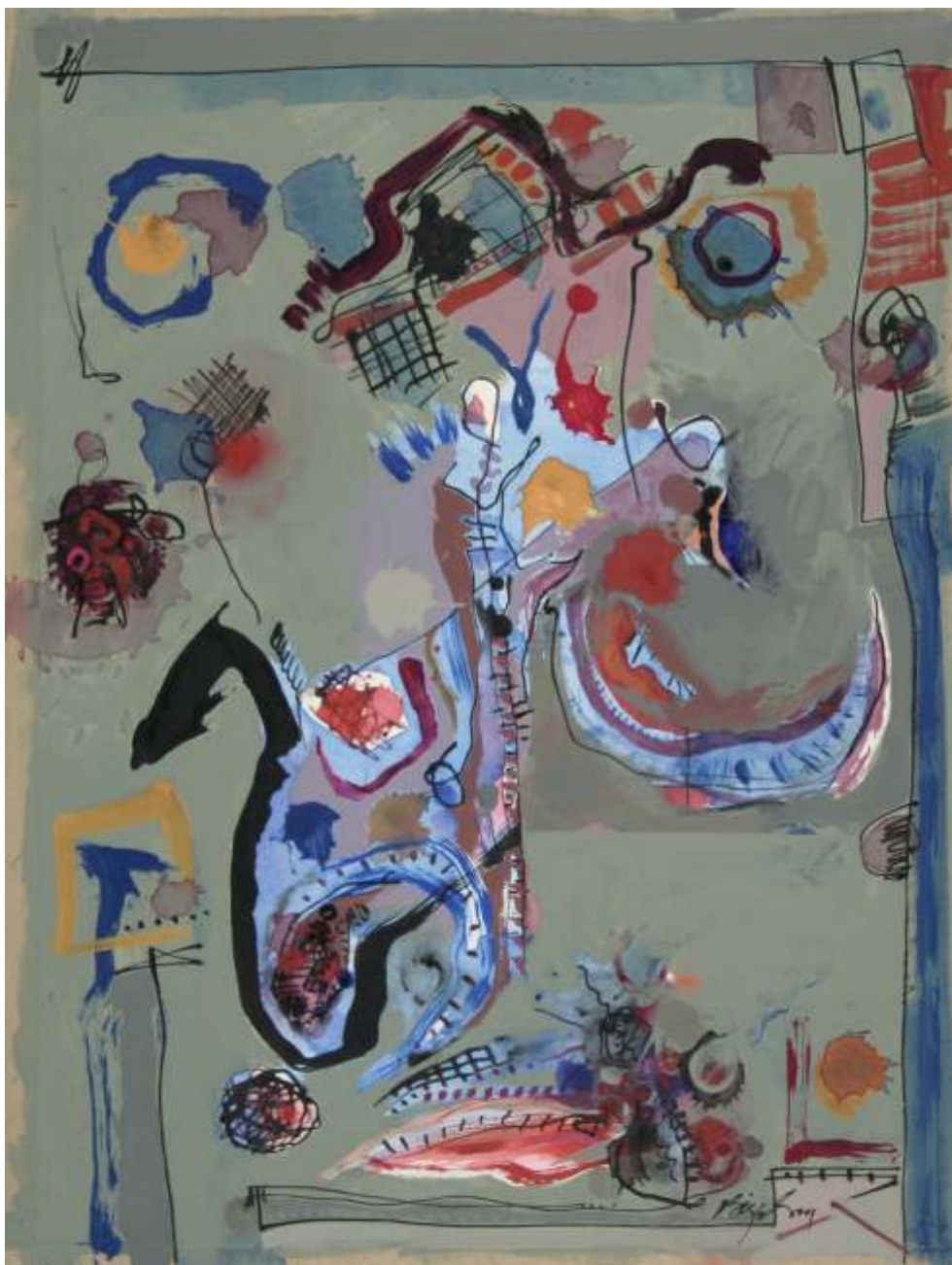
Untitled - 20 x 15 inches - acrylic on paper - 2007