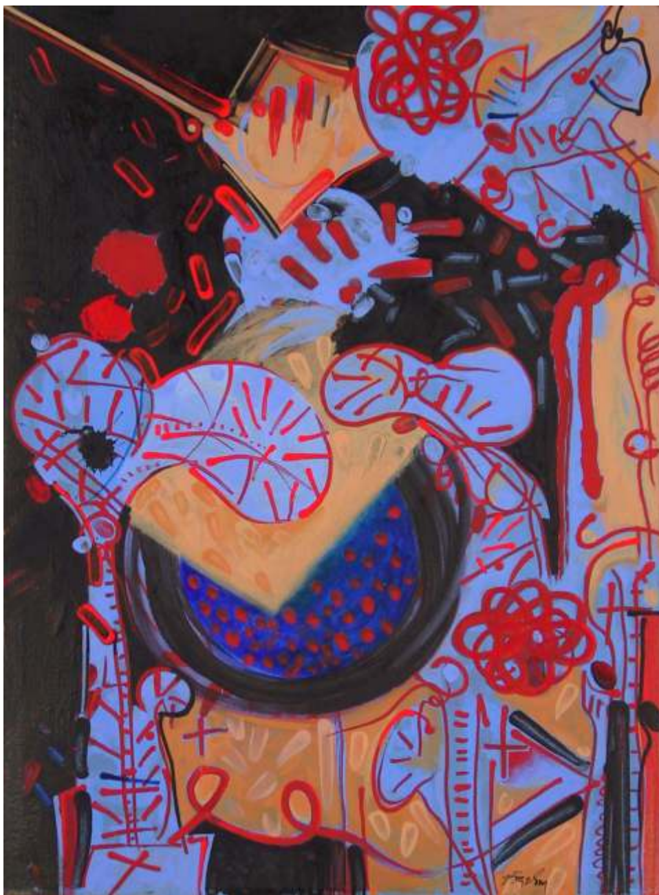
Comic Strip Science - 30 x 22 inches - acrylic on paper - 2005