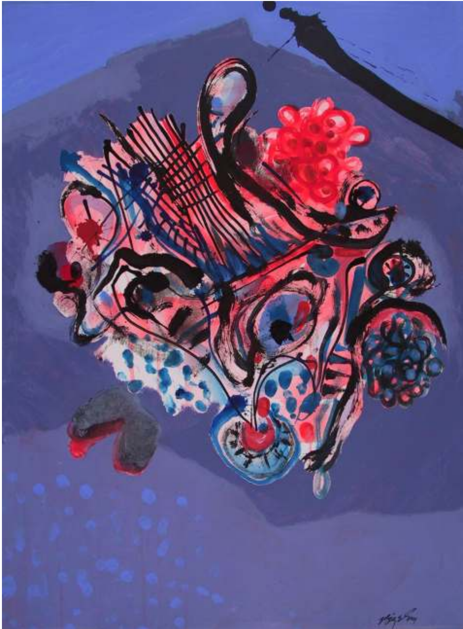
Mating Dance - 30 x 22 inches - acrylic on paper - 2005