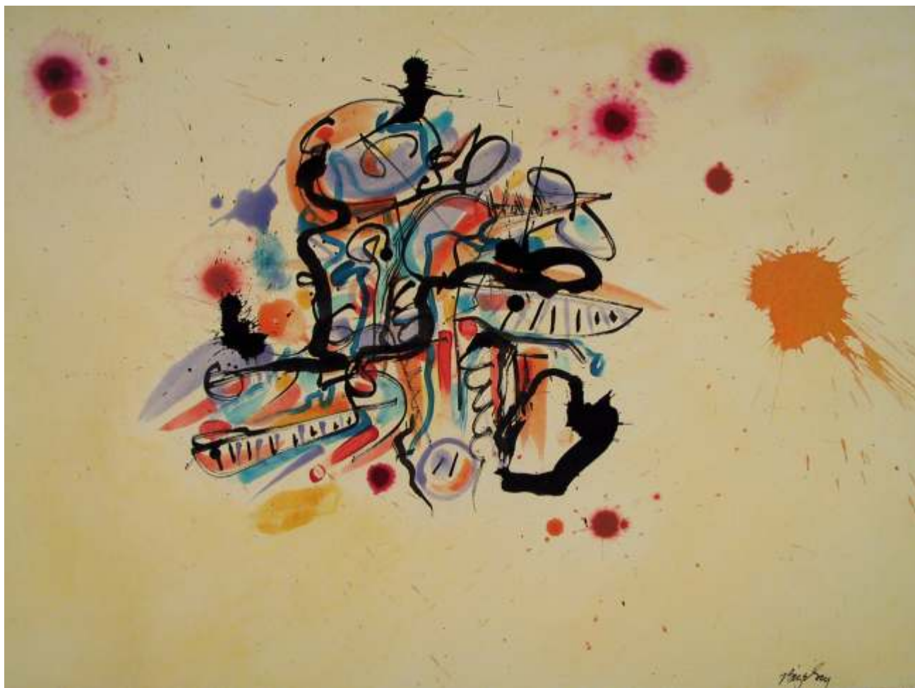
Drifting Apart - 22 x 30 inches - acrylic on paper - 2005