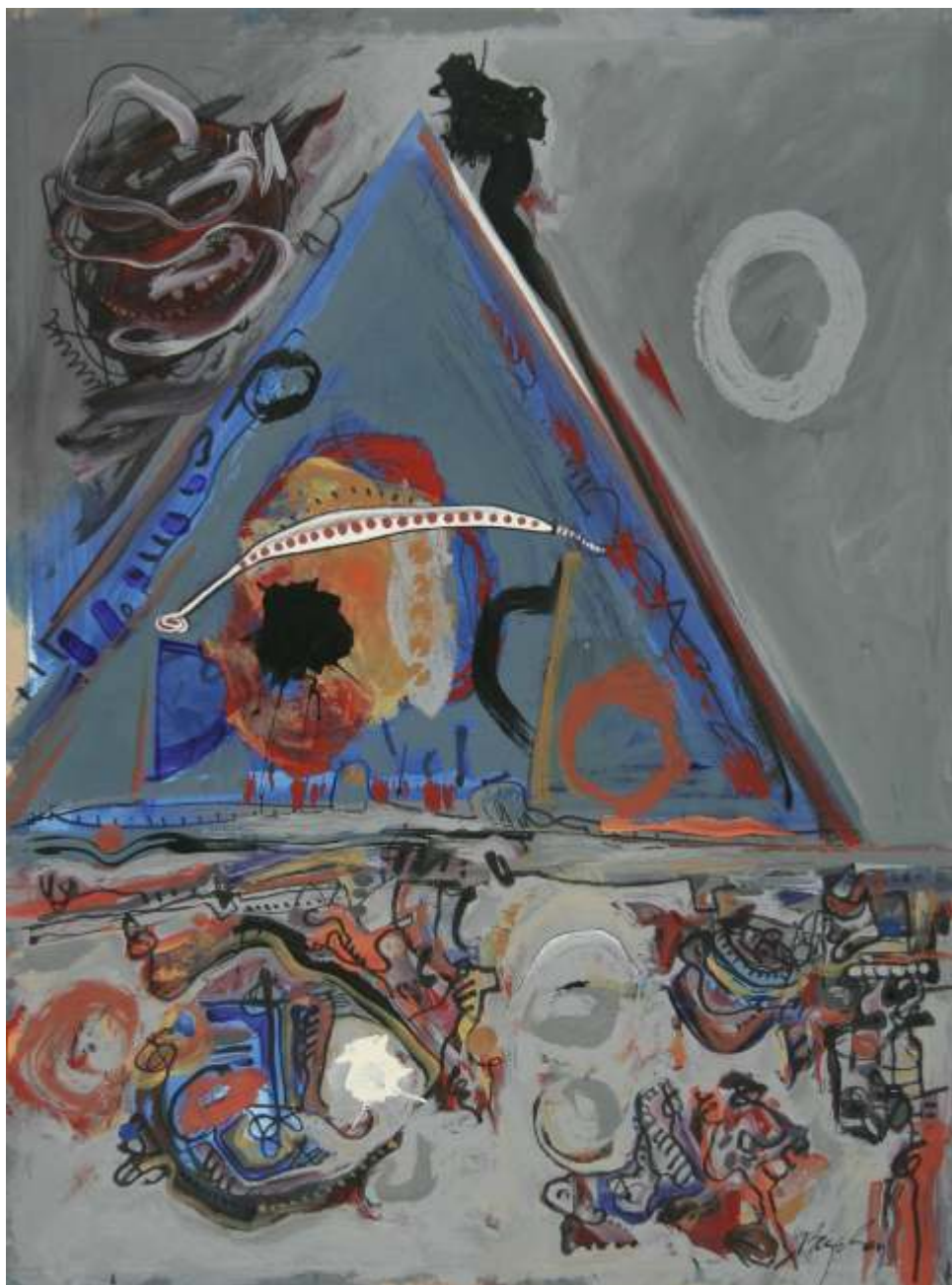
Untitled - 20 x 15 inches - acrylic on paper - 2007