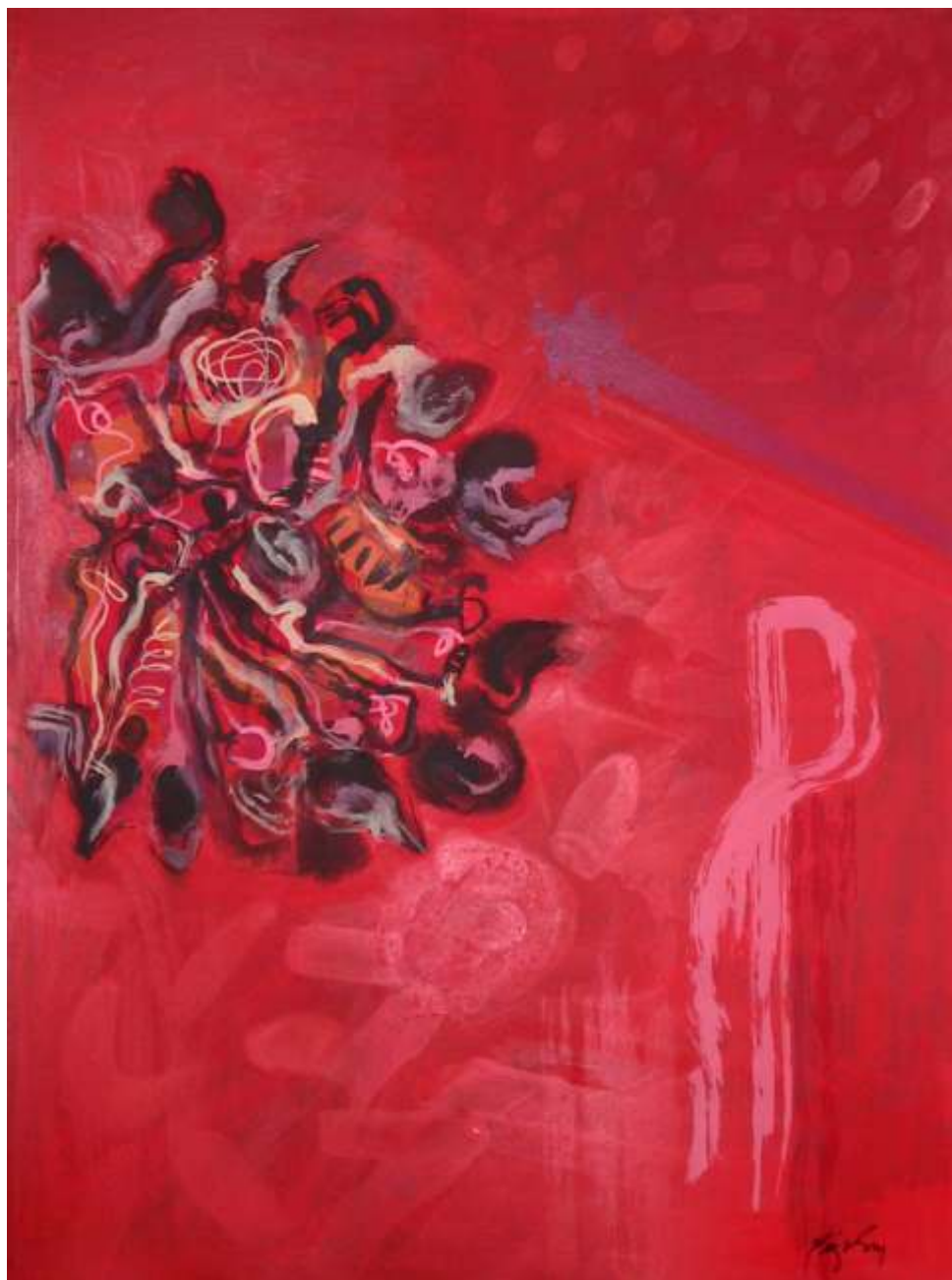
Feel The Heat - 30 x 22 inches - acrylic on paper - 2005