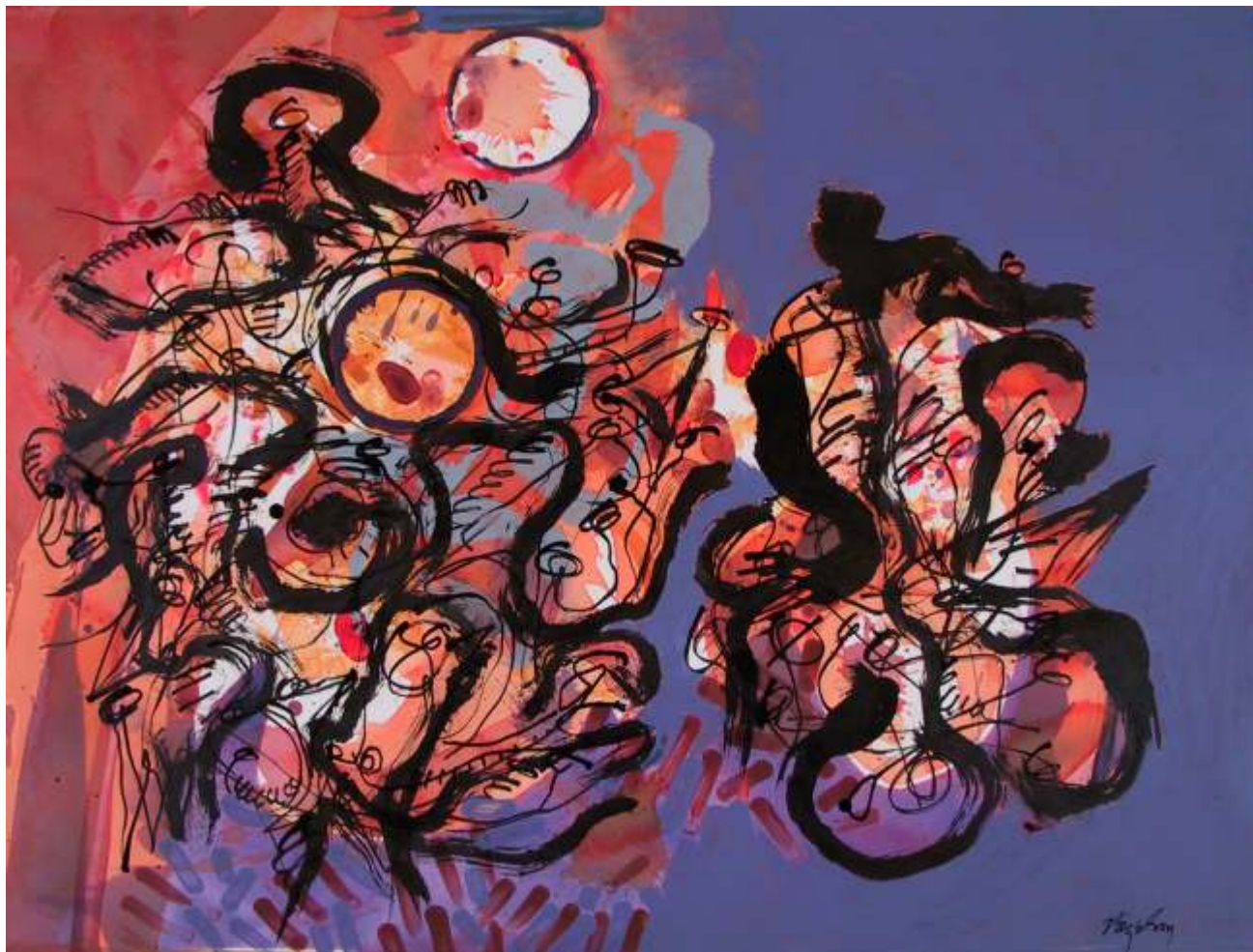
Affectionately Attached - 22 x 30 inches - acrylic on paper - 2005