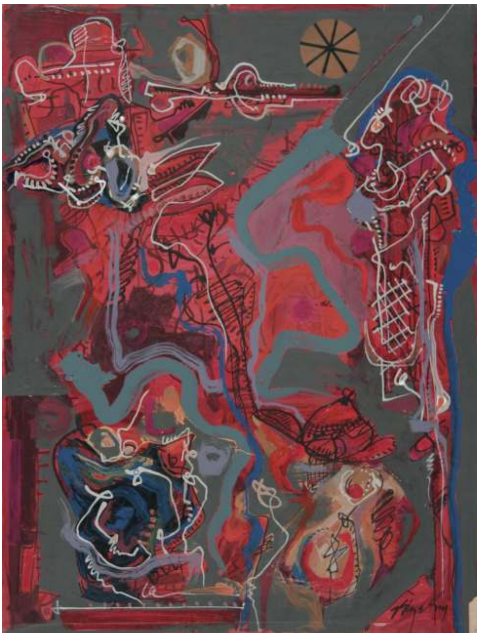
Untitled - 20 x 15 inches - acrylic on paper - 2007