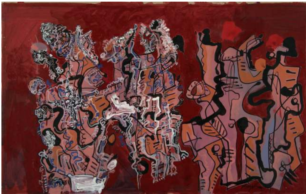
Untitled - 13 x 20 inches - acrylic on paper - 2007