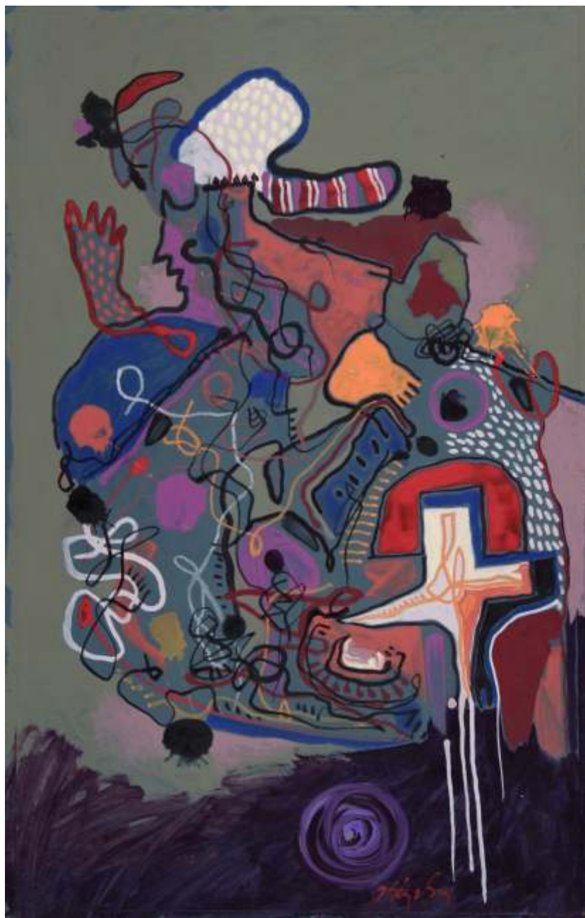
Untitled - 20 x13 inches - acrylic on paper - 2007