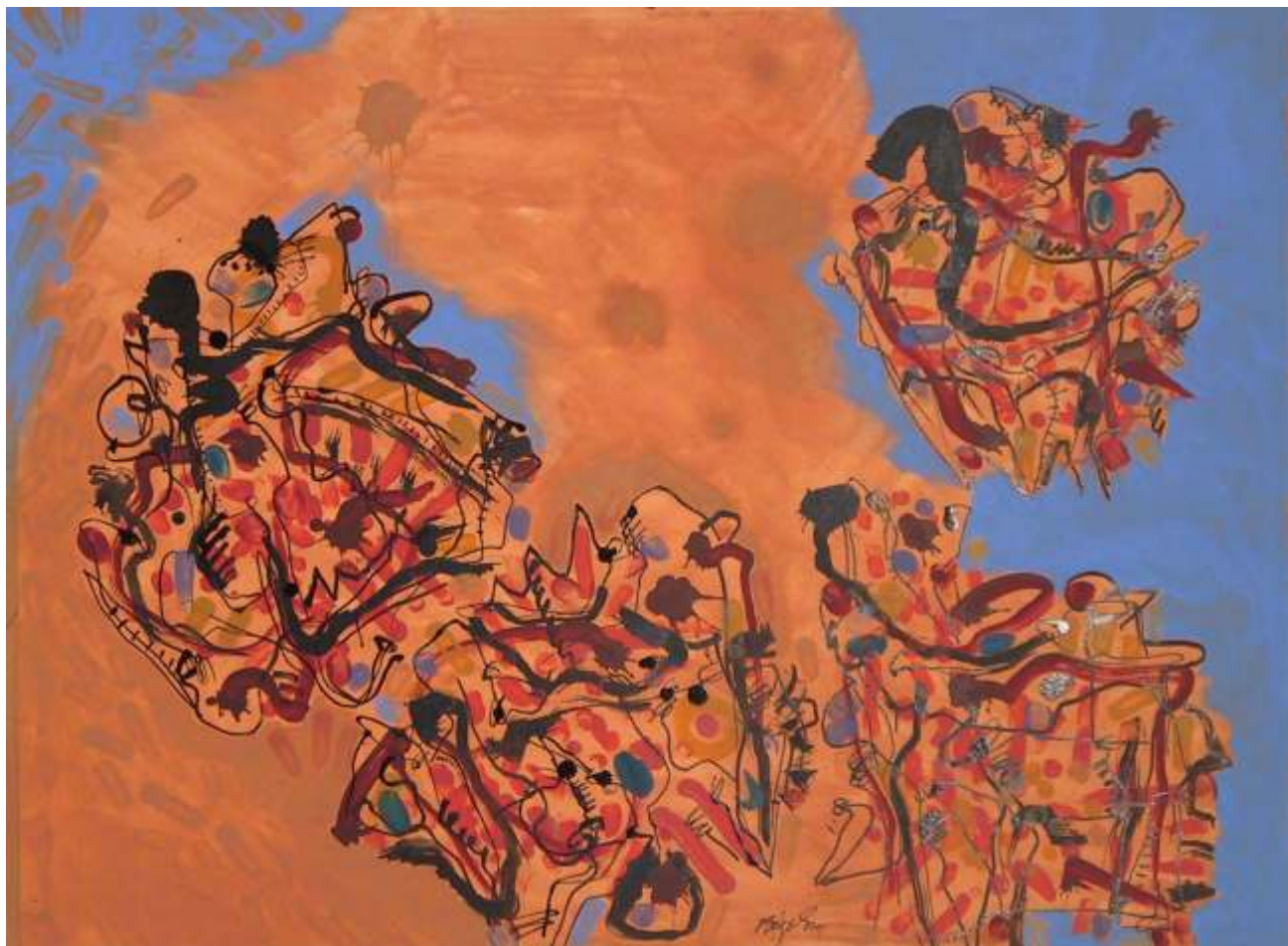
Turning Point - 22 x 30 inches - acrylic on paper - 2005