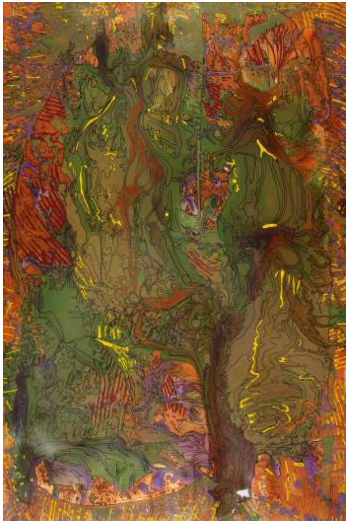
Entrails of the Jungle acrylic, wc, ink, coffee, house paint, matt board, 39 x 28 inches 1998