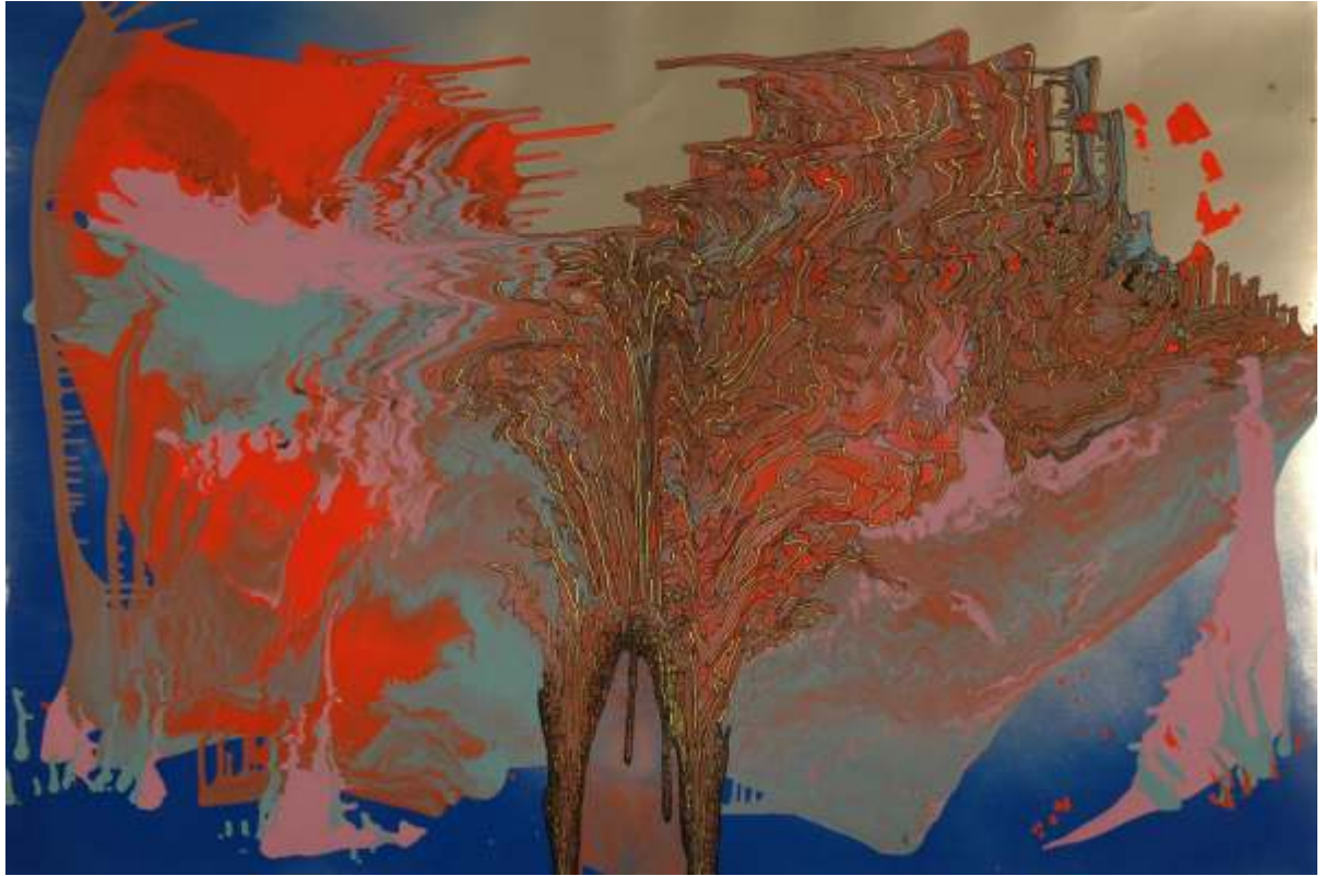
Cave oil, ink on matt board, 28 x 39 inches 1998