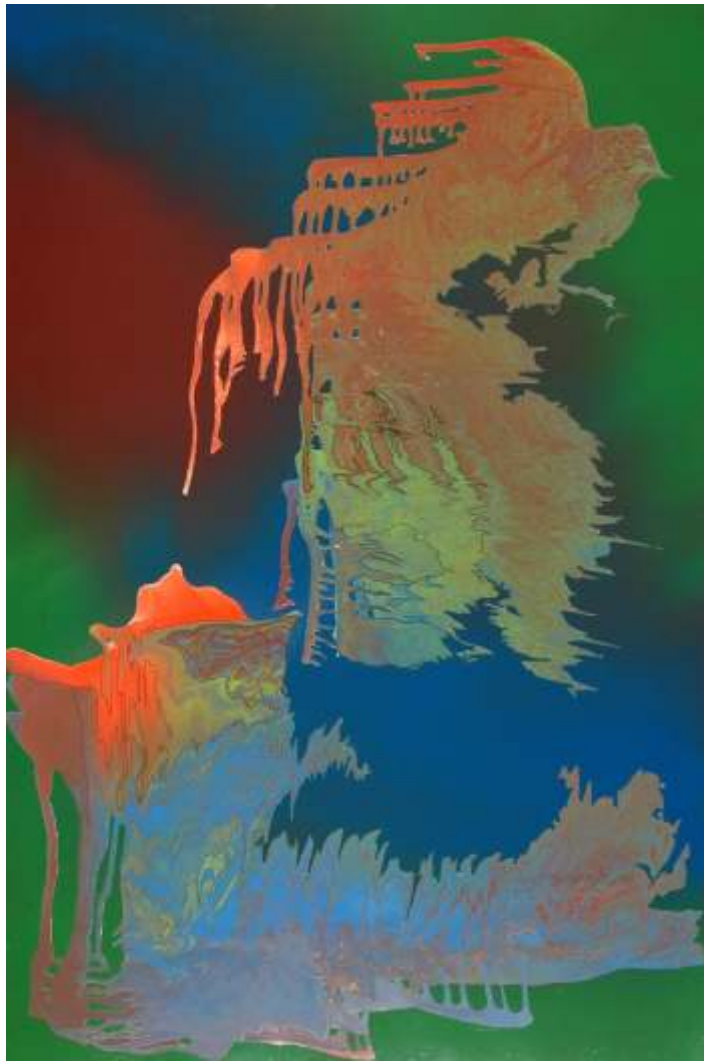
Landing oil, spray paint, collage, ink on matt board, 44 x 28 inches 1999