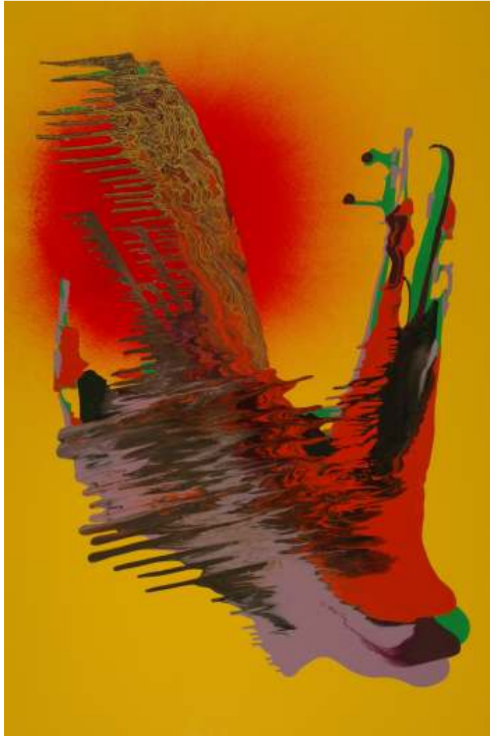
Flying oil, spray paint, collage, ink on matt board, 32 x 28 inches 1999