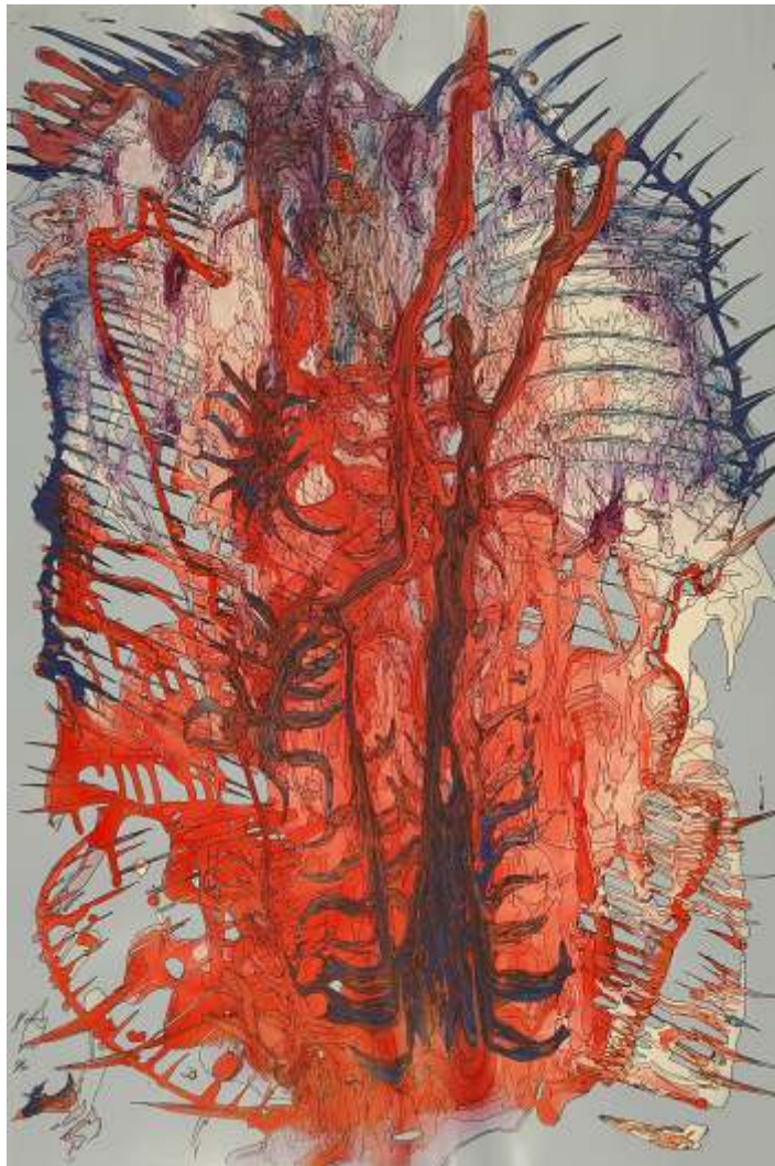
System acrylic, wc, house paint, ink on matt board, 39 x 28 inches 1998