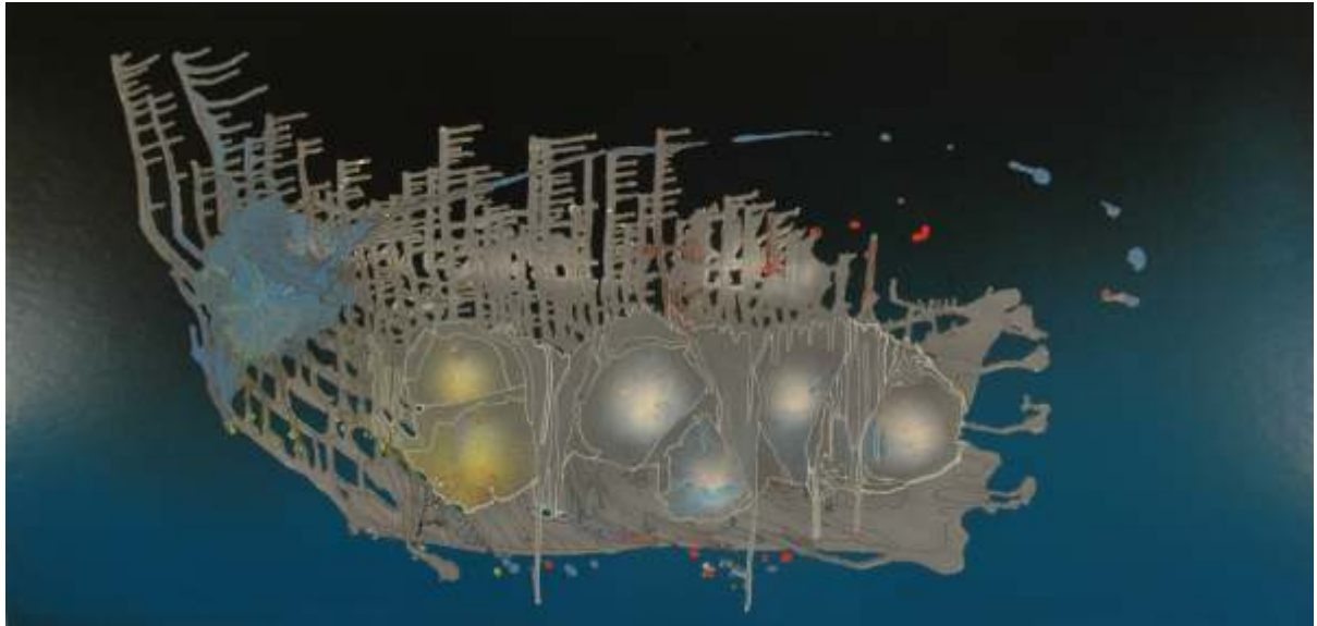
Landing oil, spray paint, collage, ink on matt board, 23 x 44 inches 1999