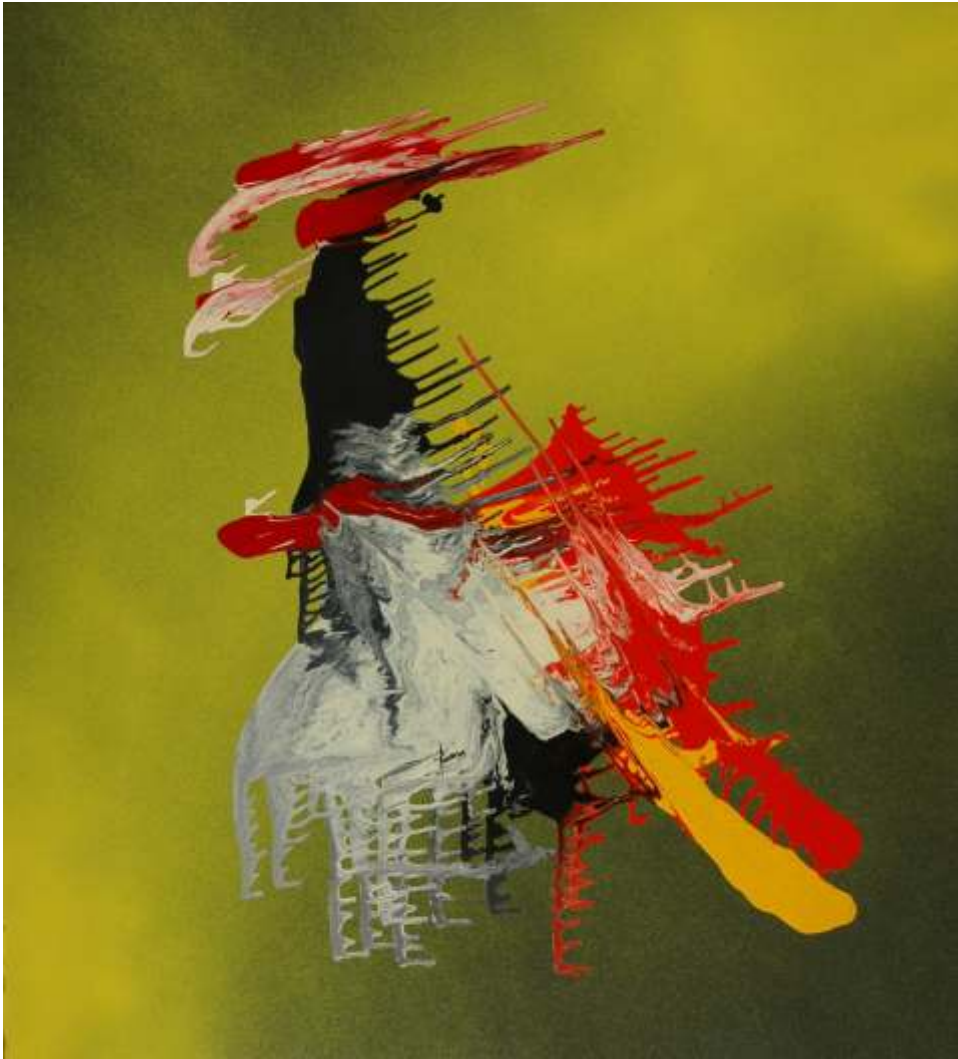
Forsaking oil, spray paint, collage, ink on matted board, 32 x 28 inches 1999