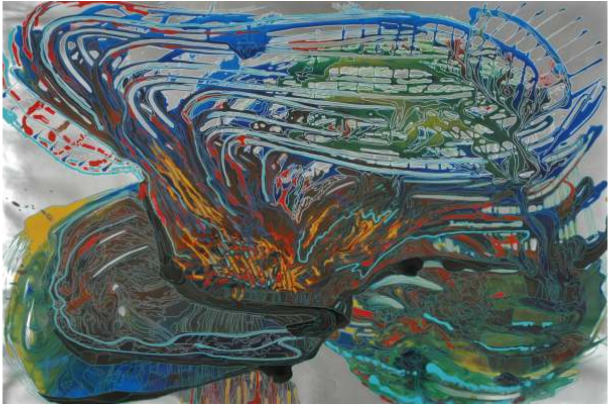
Movement acrylic, wc, ink, house paint on matt board, 28 x 39 inches 1998