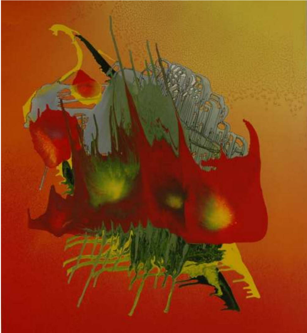
Walking oil, spray paint, collage, ink on matt board, 32 x 28 inches 1999