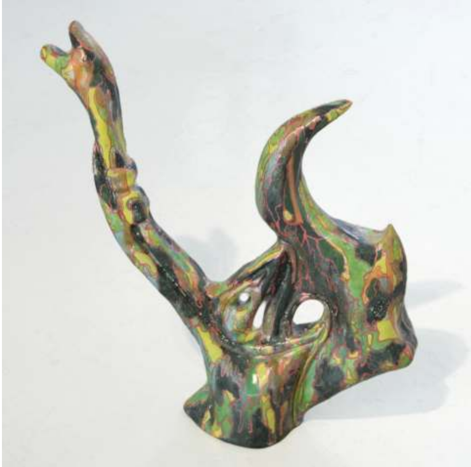
Embracing high fired ceramic, high fired glaze, low fired glaze, ink 16 x 6 x 18 inches 2000