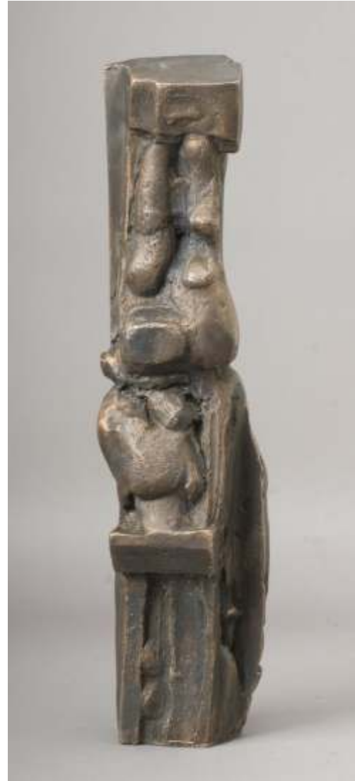
Modell Papyrussaule bronze, 12 inches tall edition 12