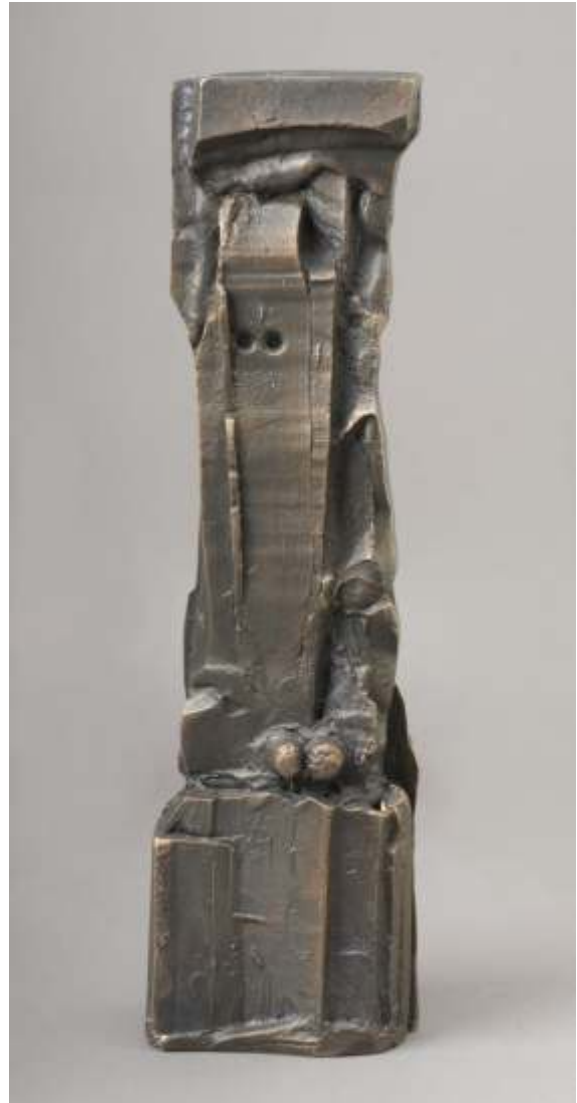
Modell Contrapposto bronze, 10 inches tall edition 12