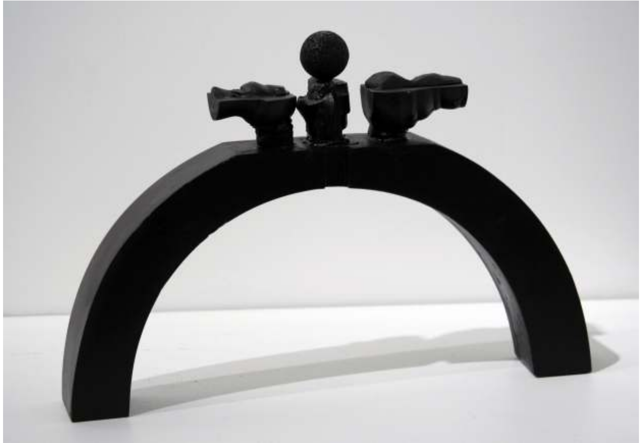
Regenbogen, Kunststoffmodell resin maquette, 14"L x 2.25"W x 10"H 2007