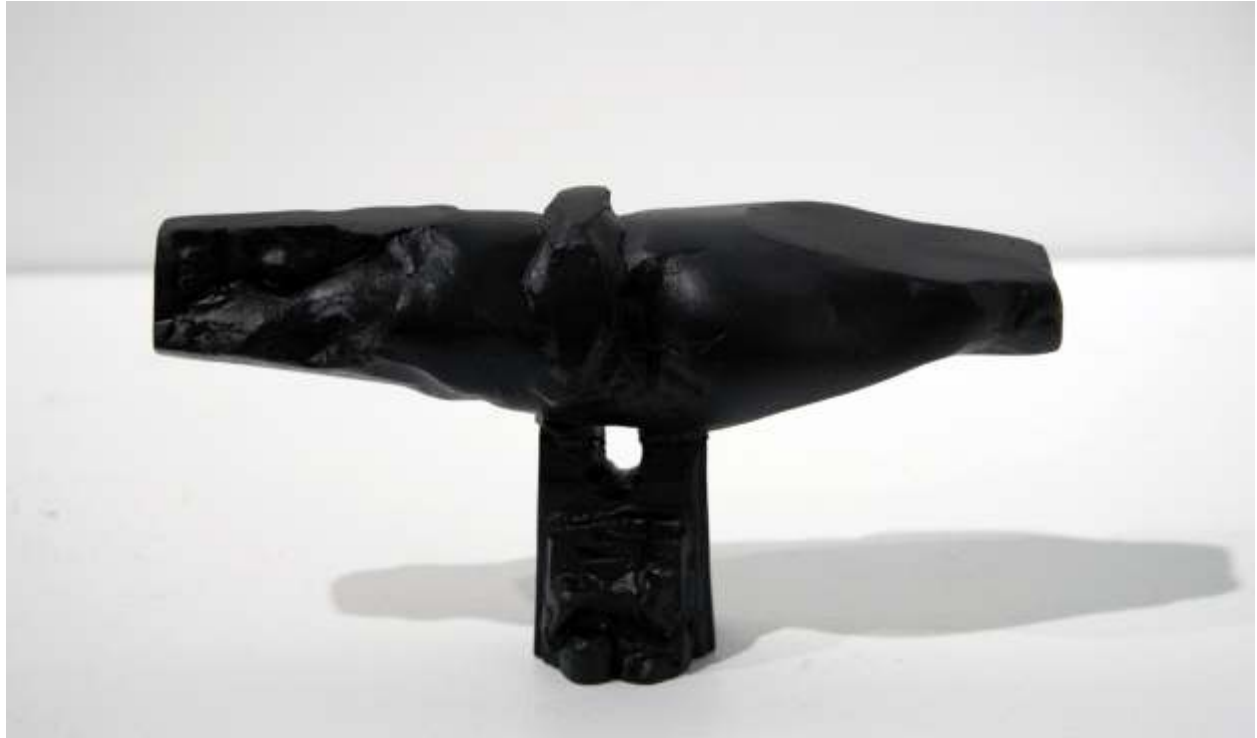
Blauwal, Kunststoffmodell resin maquette, 8"L x 3"W x 4"H 2007