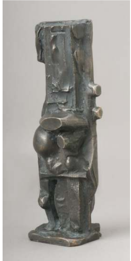
Modell Fur Barlach-Memorial bronze, 9 inches tall edition 12