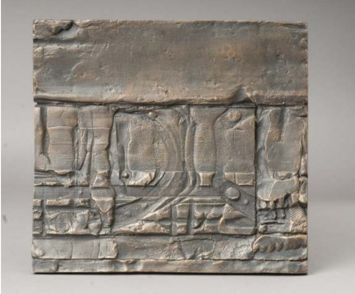
Fries in Pompeii bronze, 7.5 x 8.25 inches edition 12