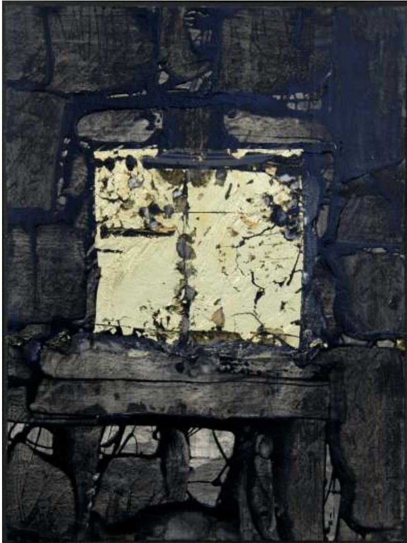
Im Tal der Konige acrylic on paper, 16 x 12 inches 2007