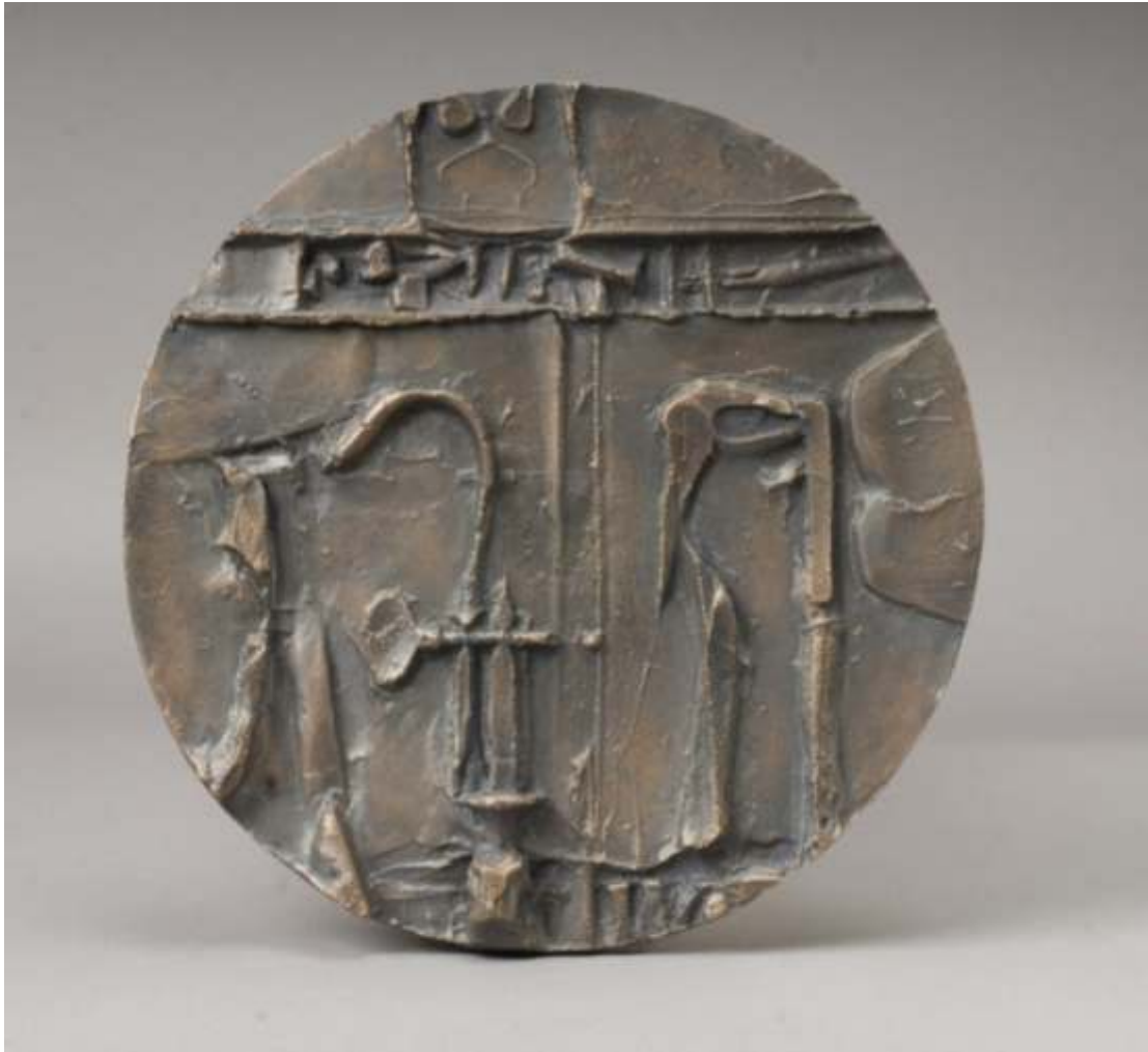
Keines Medallion II bronze, 7.25 inches in diameter edition 12