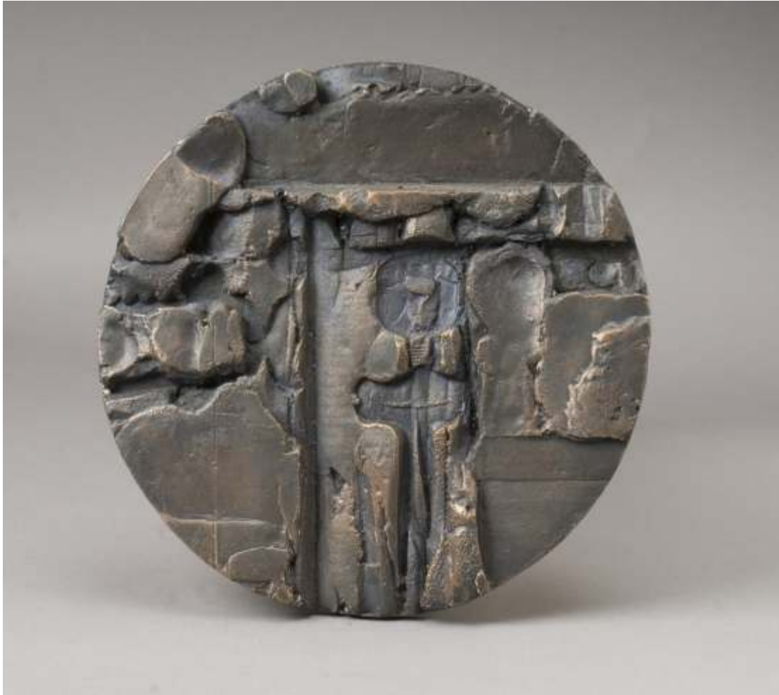
Keines Medallion I bronze, 7.25 inches in diameter edition 12