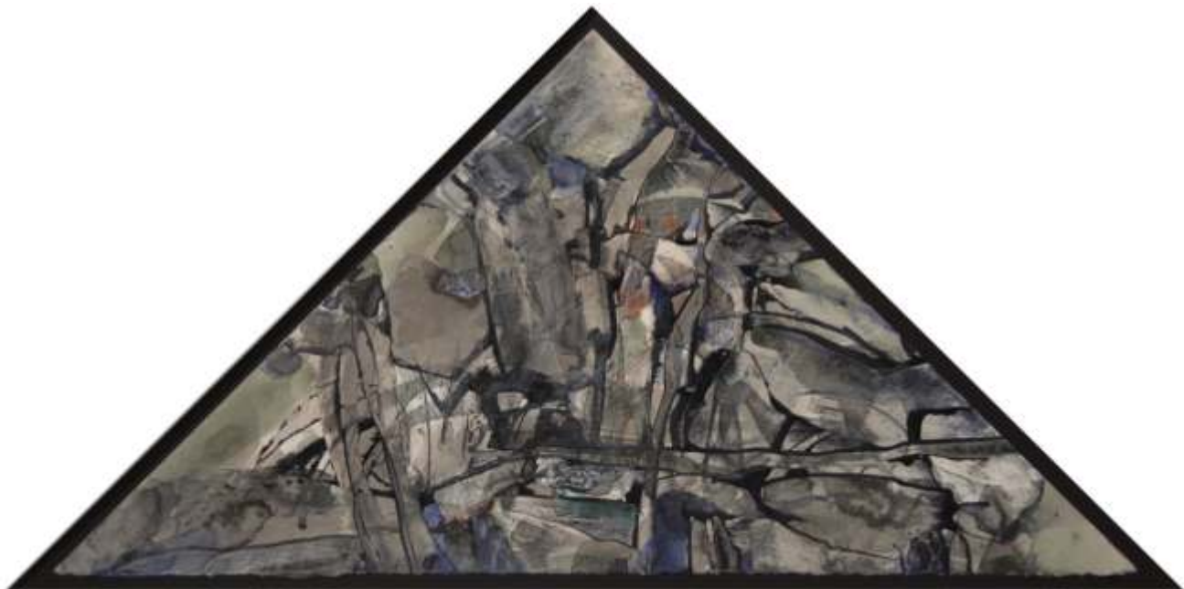
Pyramidal acrylic on paper, 14 x 28 inches 2007