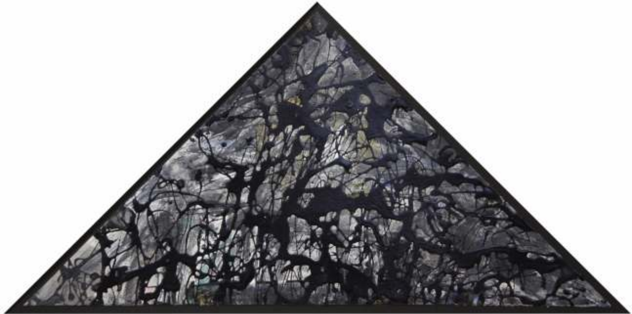
Jackson Pollock Meets Siddhartha acrylic on paper, 14 x 28 inches 2007