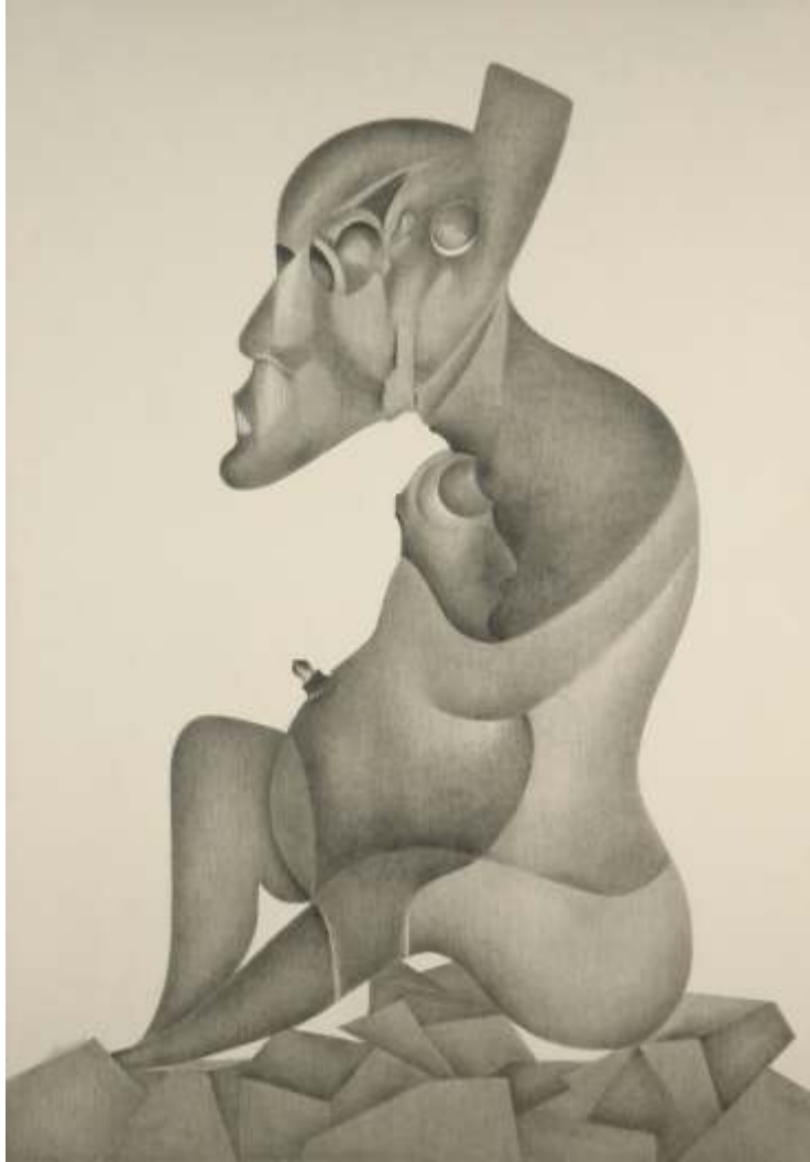
Death Rattle pencil on paper, 100 x 70 cm.